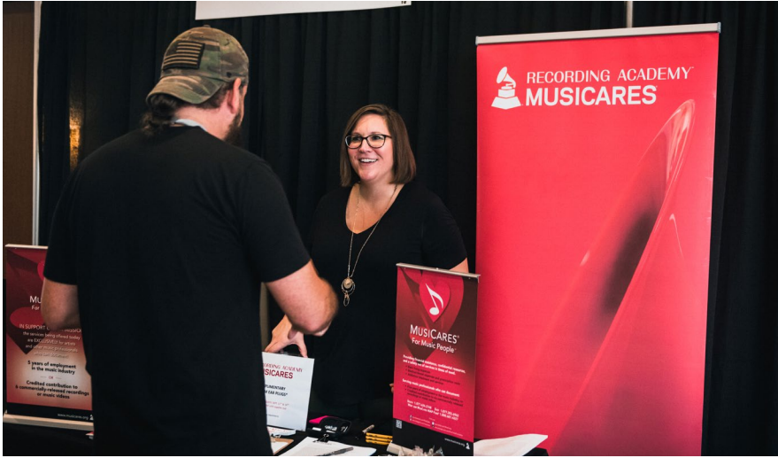
EXHIBIT HALL BOOTH

The Exhibit Hall is located in the Conference Hotel and is the best way to meet Americana industry professionals face-to-face. Purchase of a booth includes 1 conference registration and 2 additional booth worker passes. Music industry related exhibitors only.