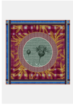
Scarf Square Centaurea