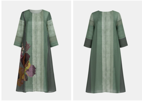
Coat Audrey Poppies Bouquet Multicolour