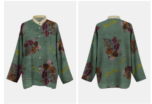
Shirt Aiko Poppies Bouquet Multicolour