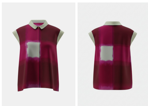
Shirt Anna Short Sleeves Watercolour Checks Beet R...