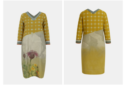
Dress Fiji Centaurea Multicolour