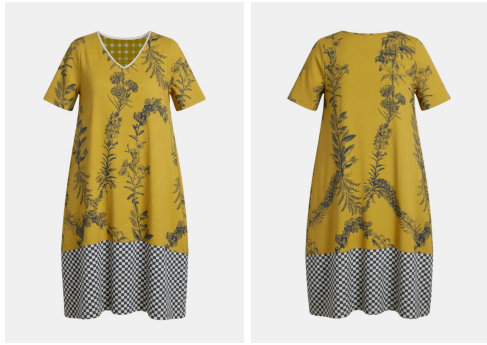
Dress Durga Flowers Crown Amber