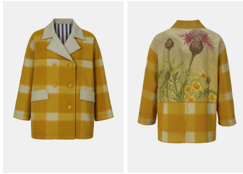
Coat Zed Centaurea Multicolour