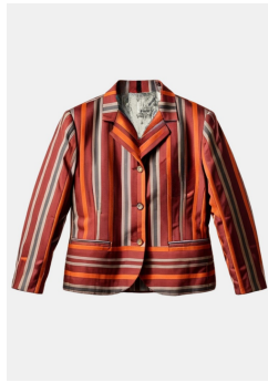
Coat Garconette Pyjama Stripes Burnt Ochre

Composition 100% Silk | 100% Viscose (lining)