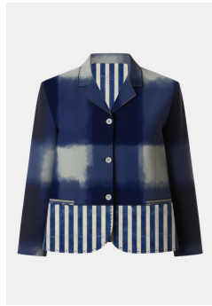
Coat Garconette Watercolour Checks Indigo