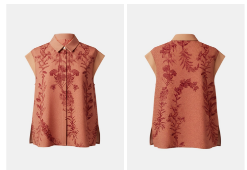
Shirt Anna Short Sleeves Flowers Crown Burnt Ochre