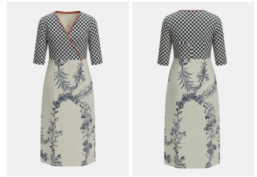
Dress Abyss Mini Checks Indigo