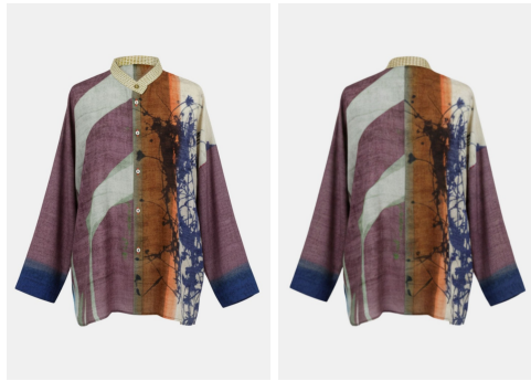
Shirt Aiko Haka Multicolour