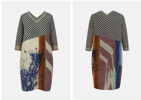
Dress Fiji Haka Multicolour