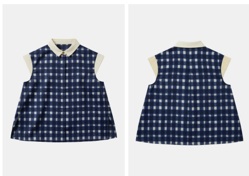
Shirt Anna Short Sleeves Watercolour Checks Indigo