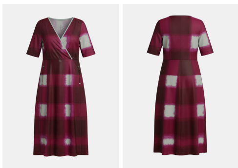
Dress Abyss Watercolour Checks Beet Red