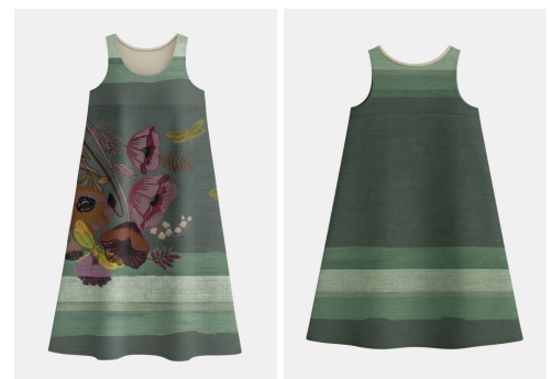
Dress Bailarina Poppies Bouquet Multicolour