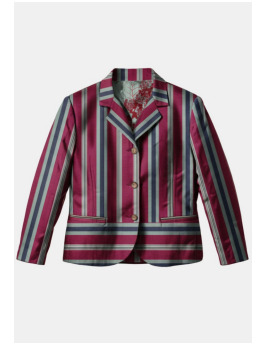
Coat Garconette Pyjama Stripes Beet Red

Composition 100% Silk | 100% Viscose (lining)