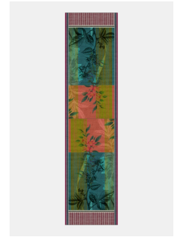
Stole rectangular Blackberry