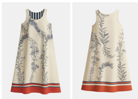
Dress Bailarina Flowers Crown Multicolour