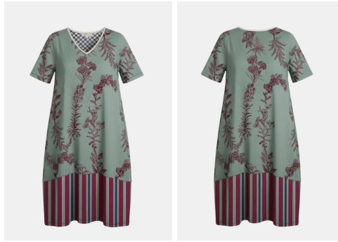
Dress Durga Flowers Crown Jadeite