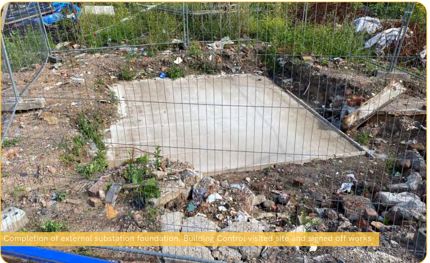
Completion of external substation foundation. Building Control visited site and signed off works