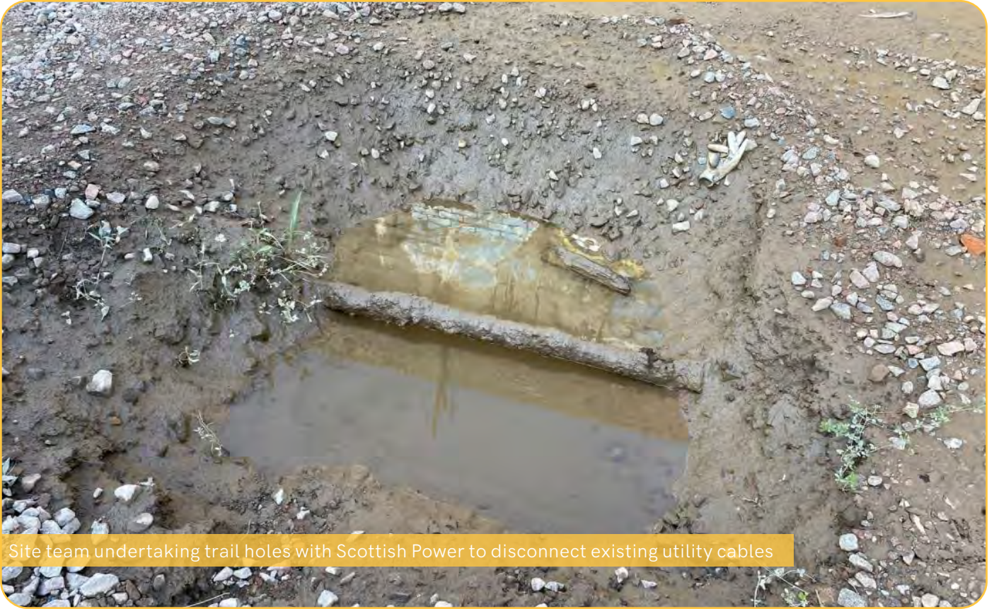
Site team undertaking trial holes with Scottish Power to disconnect existing utility cables