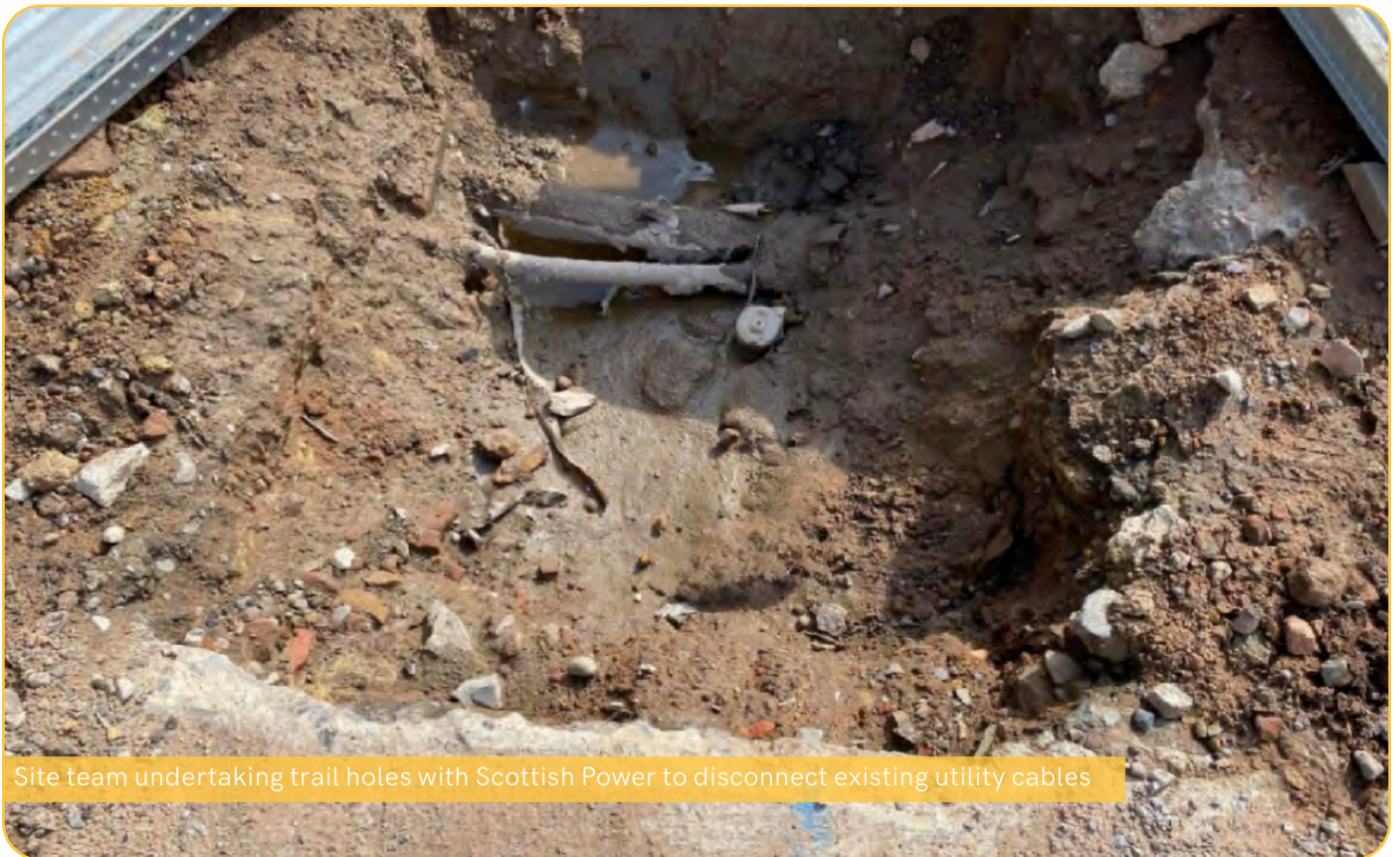
Site team undertaking trail holes with Scottish Power to disconnect existing utility cables