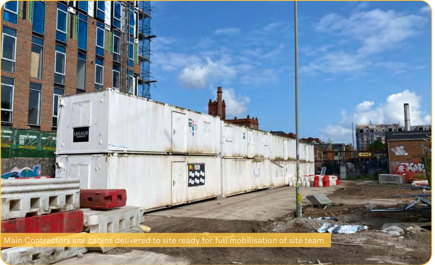
Main Contractors site cabins delivered to site ready for full mobilisation of site team