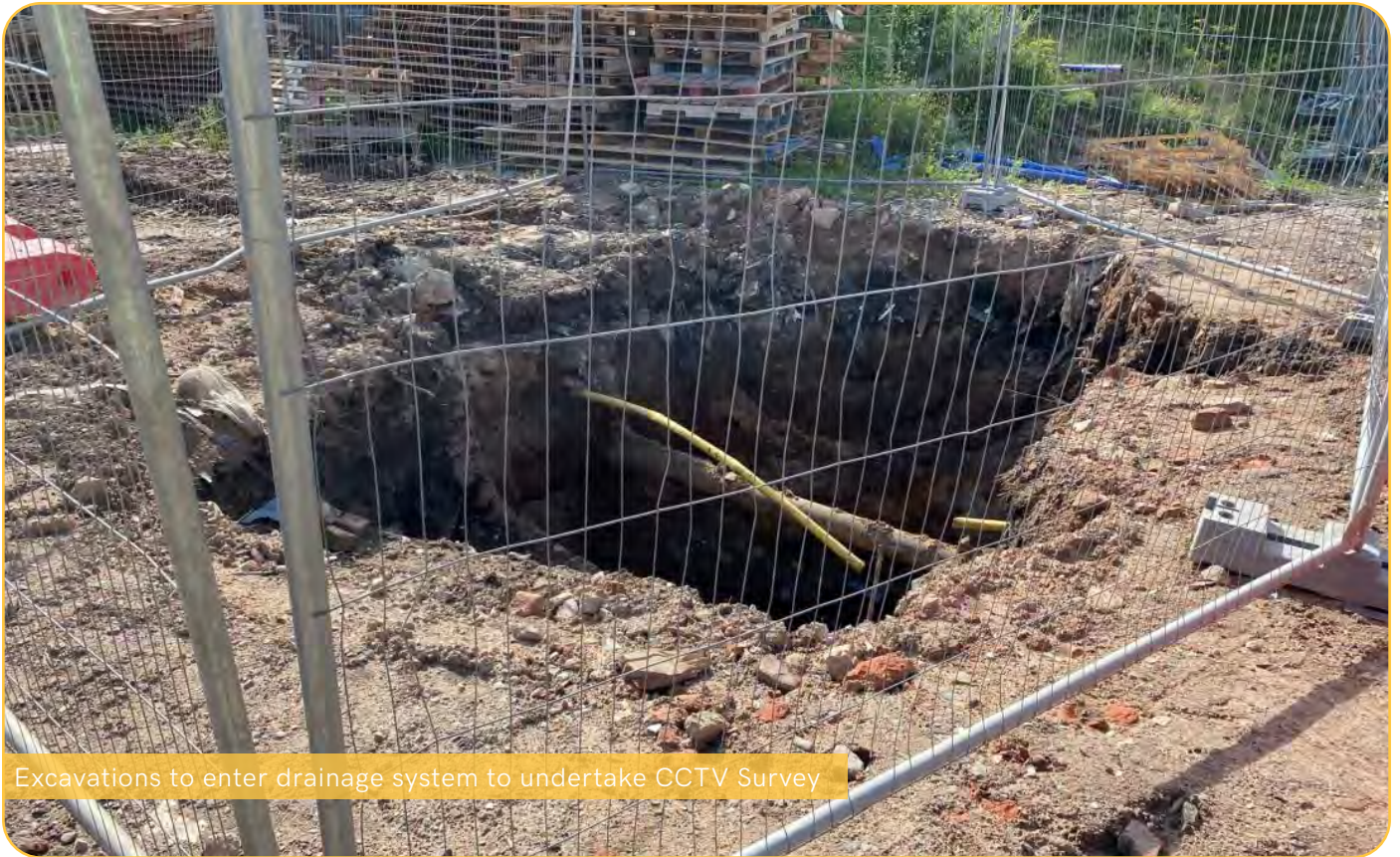
Excavations to enter drainage system to undertake CCTV Survey