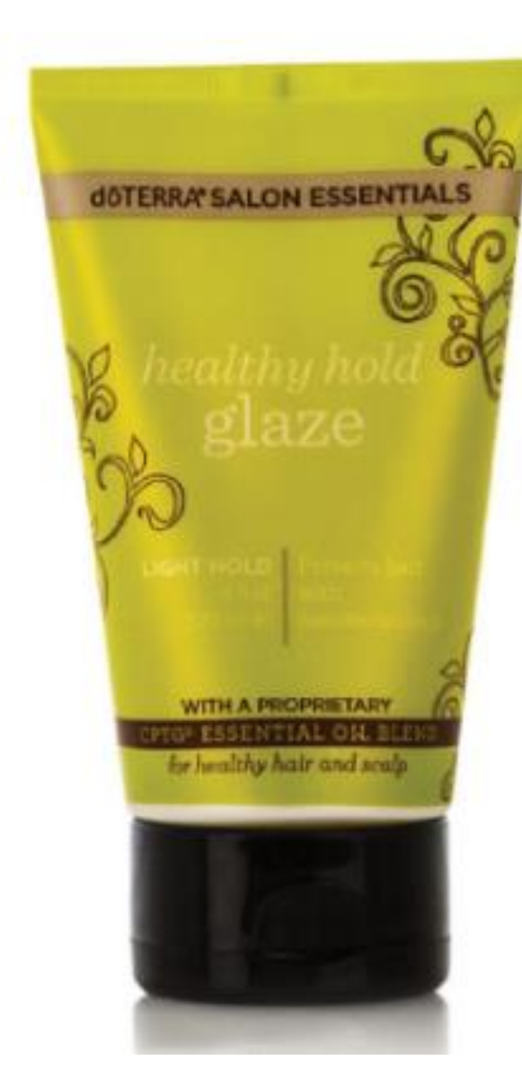
Your Price £18.00