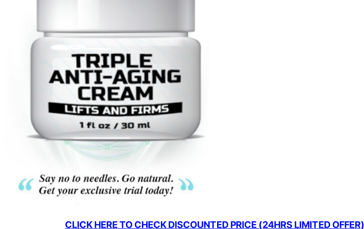
Triple Anti-Aging Cream Ingredients

wrinkles from the skin. Here we can say that this is the ultimate formula for providing collagen molecules to the skin. With the help of applying The peptide-rich wrinkle serum skin can be rebuilt and made attractive. Triple Anti-Aging Cream formula is based on a natural skin healing system. Triple Anti-Aging Cream is created by Triple Naturals.