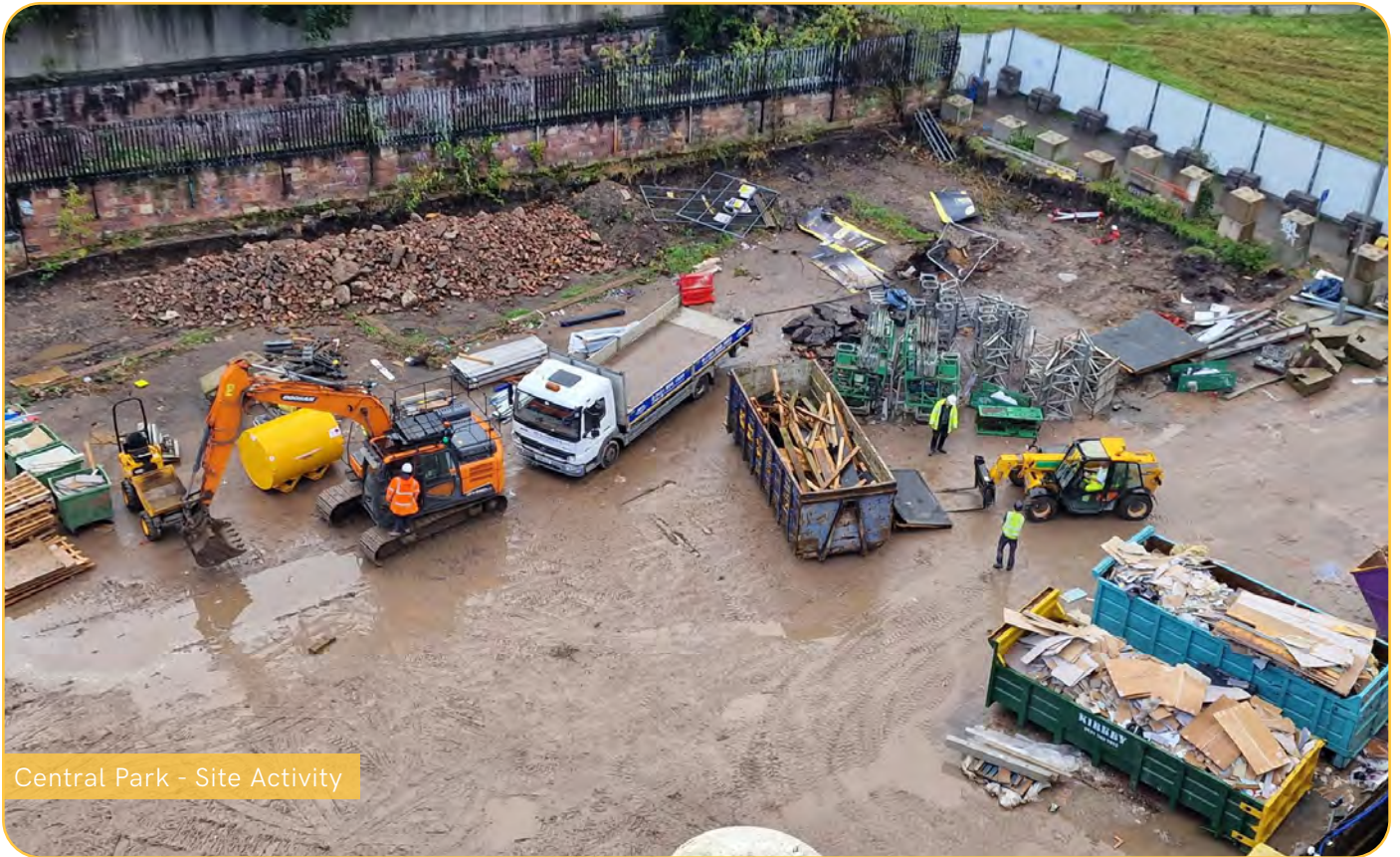
Central Park - Site Activity