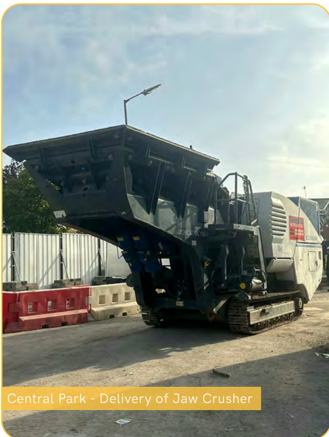
Central Park - Delivery of Jaw Crusher