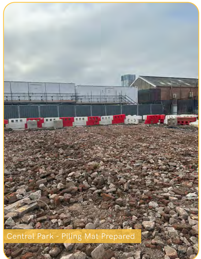
Central Park - Piling Mat Prepared