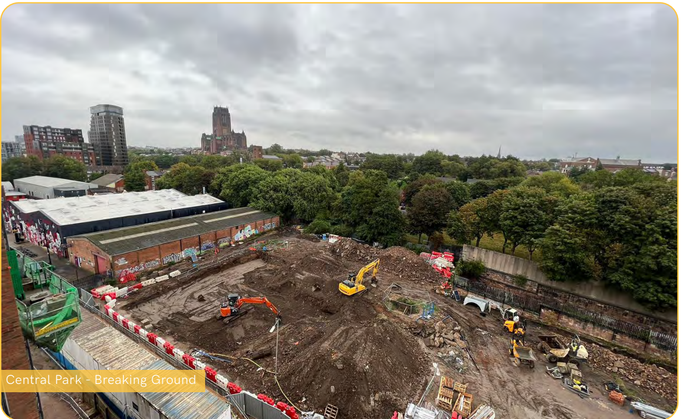
Central Park - Breaking Ground