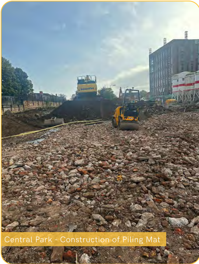
Central Park - Construction of Piling Mat