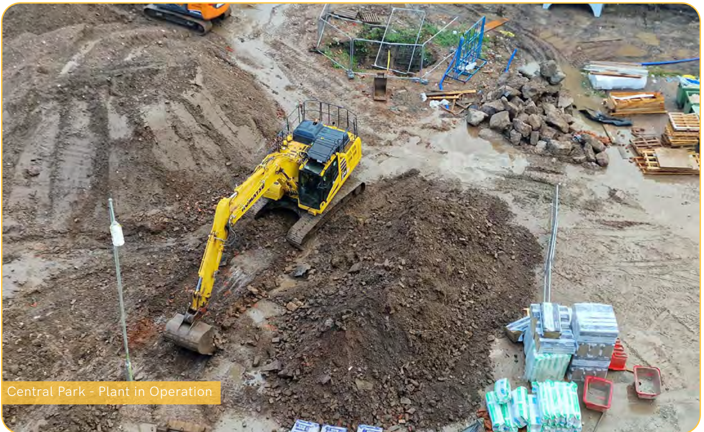
Central Park - Plant in Operation