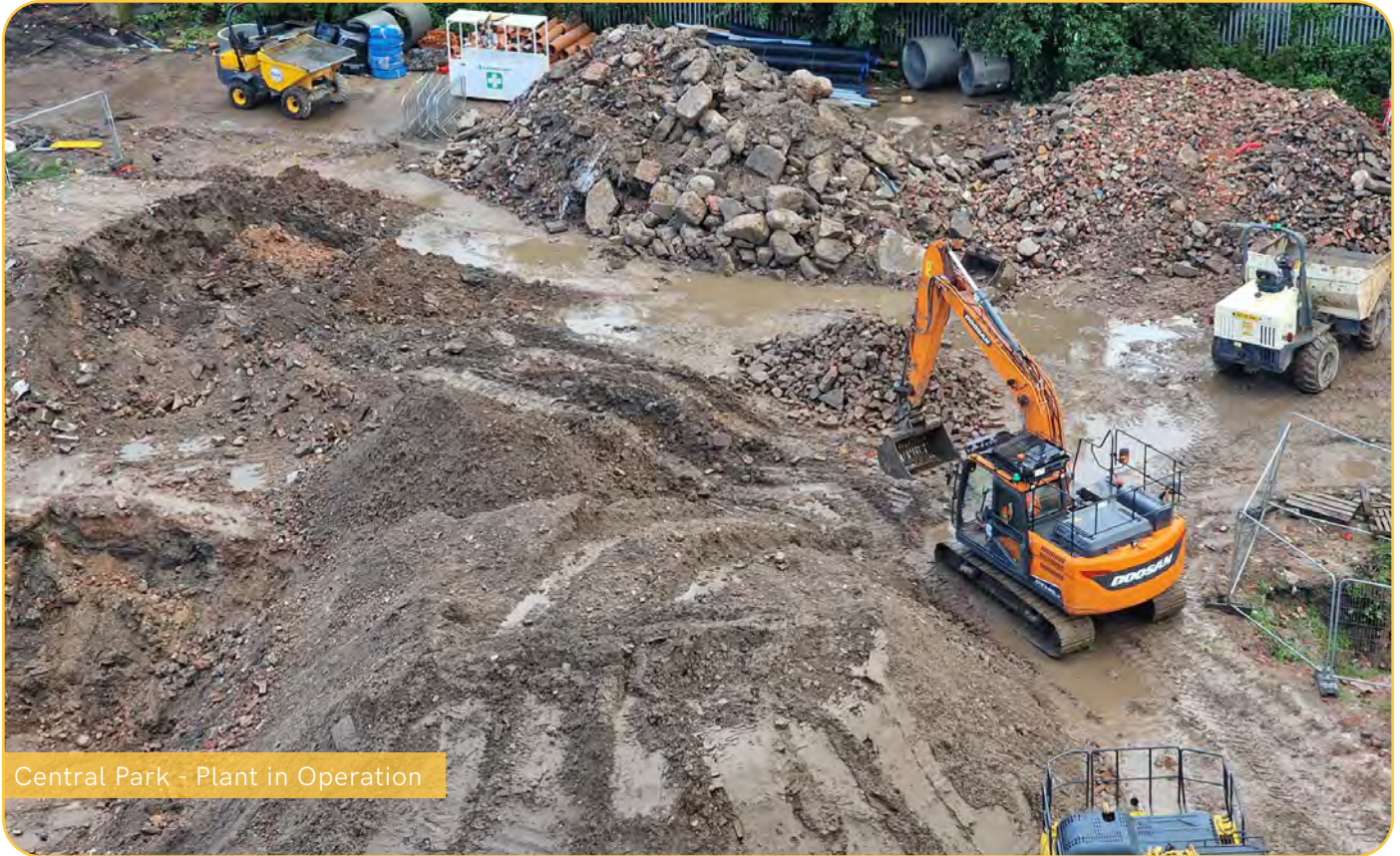
Central Park - Plant in Operation