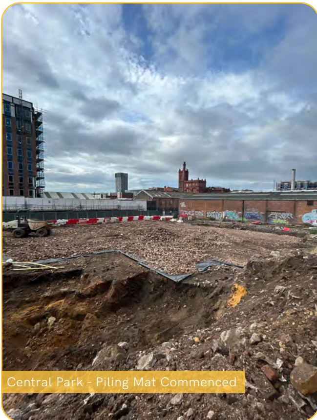
Central Park - Piling Mat Commenced