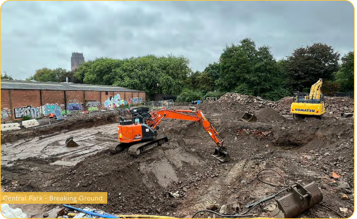
Central Park - Breaking Ground