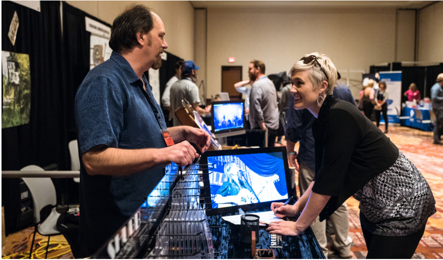
EXHIBIT HALL BOOTH

The Exhibit Hall is located in the Conference Hotel and is the best way to meet Americana industry professionals face-to-face. Purchase of a booth includes 1 conference registration and 2 additional booth worker passes. Music industry related exhibitors only.