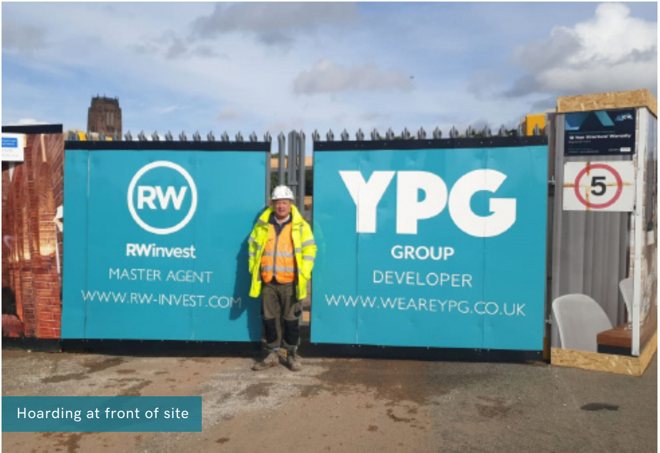
Hoarding at front of site