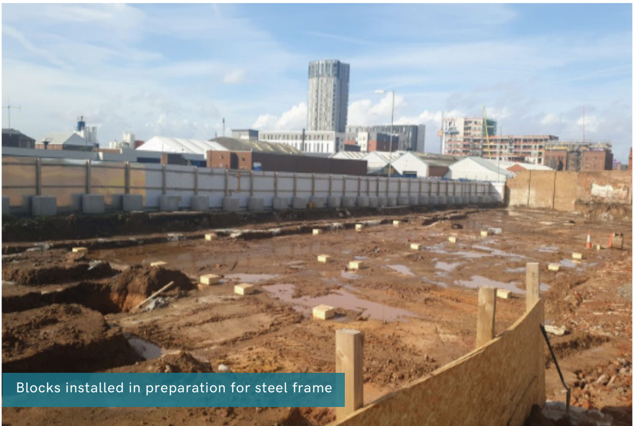
Blocks installed in preparation for steel frame