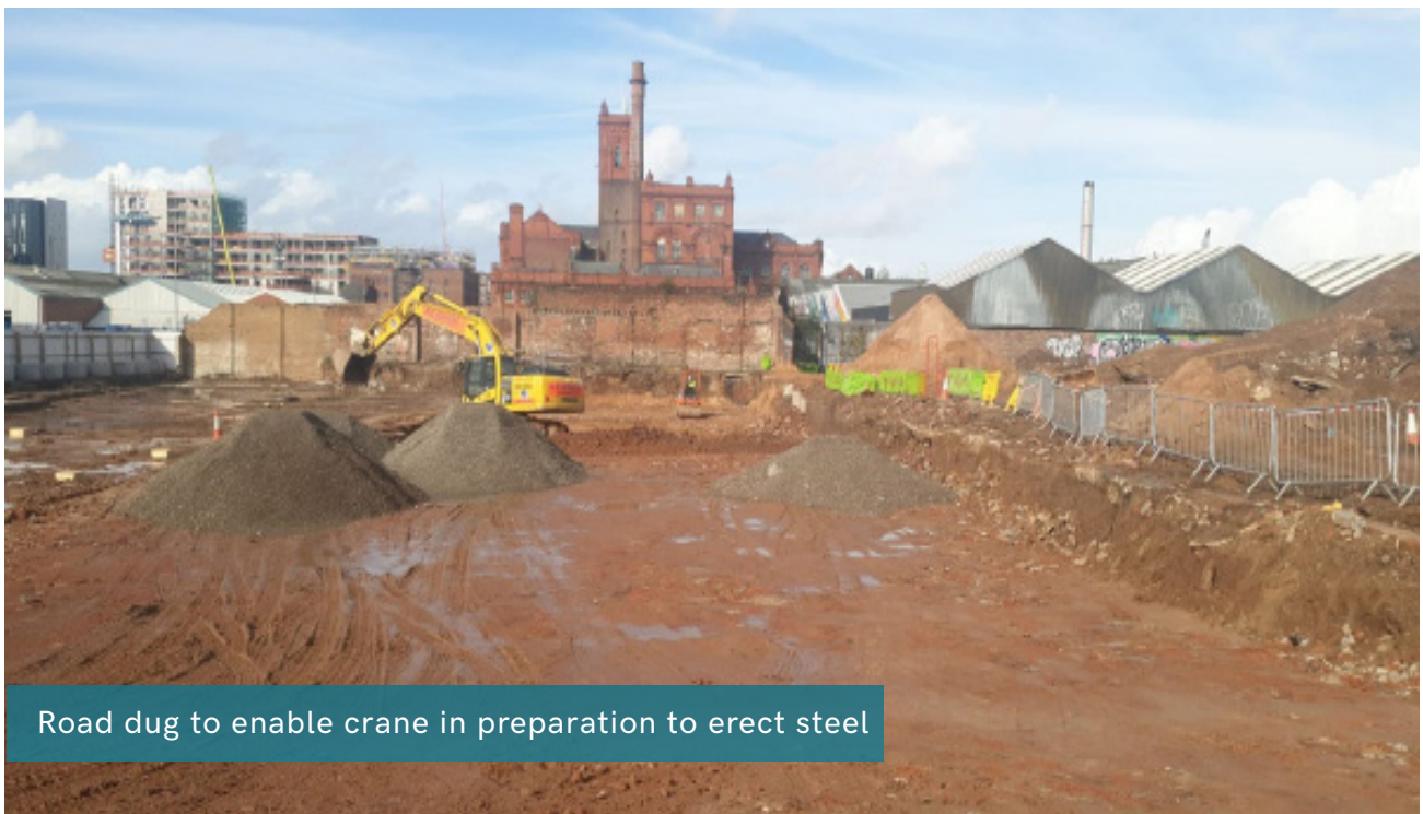
Road dug to enable crane in preparation to erect steel

Steel is on site and ready for construction on Block D.