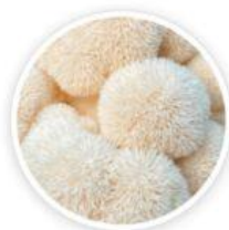
Organic Lion's Mane