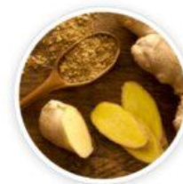
Organic Ceylon Ginger