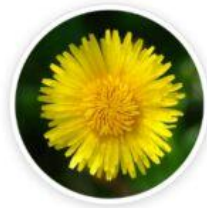
Inulin & Dandelion