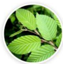
Slippery Elm Bark