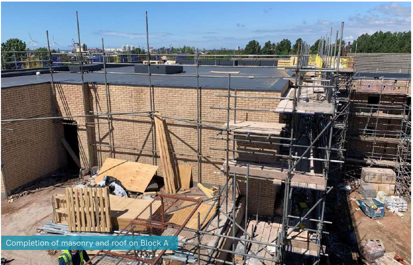
Completion of masonry and roof on Block A