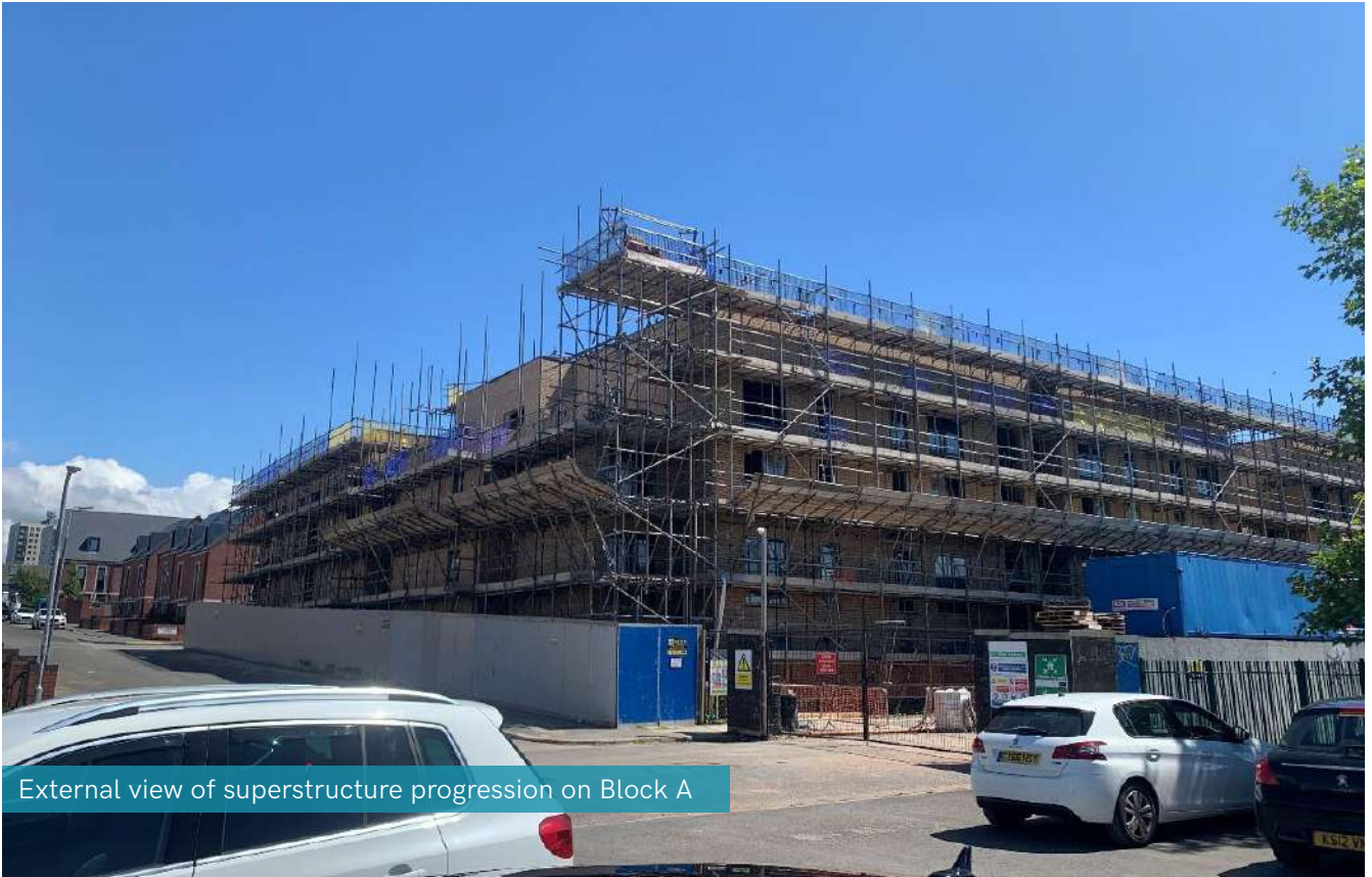
External view of superstructure progression on Block A