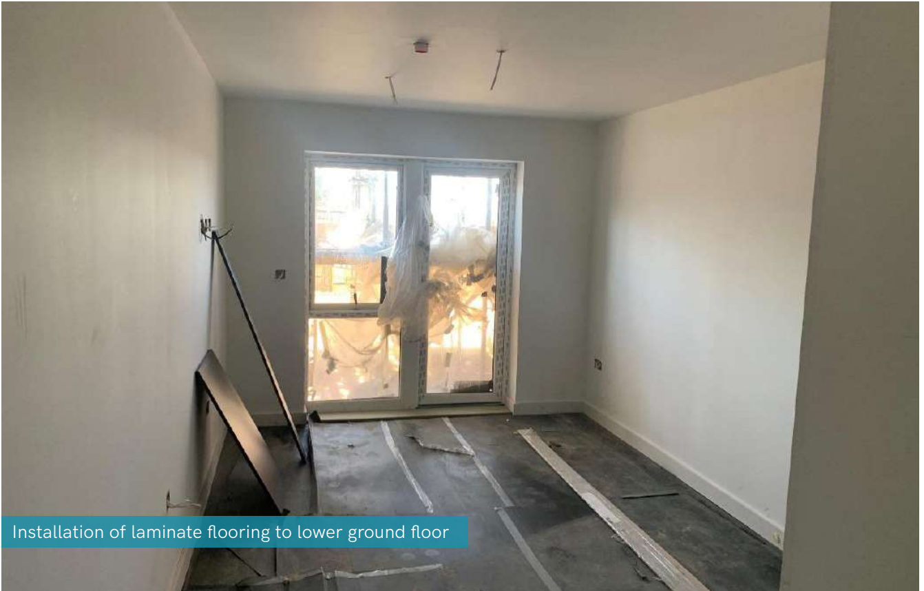
Installation of laminate flooring to lower ground floor