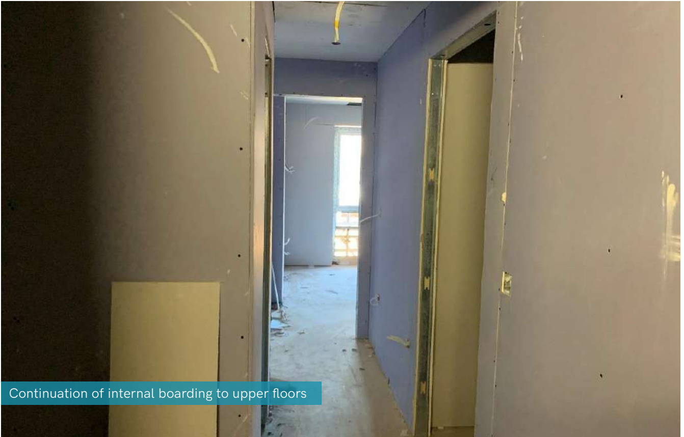
Continuation of internal boarding to upper floors