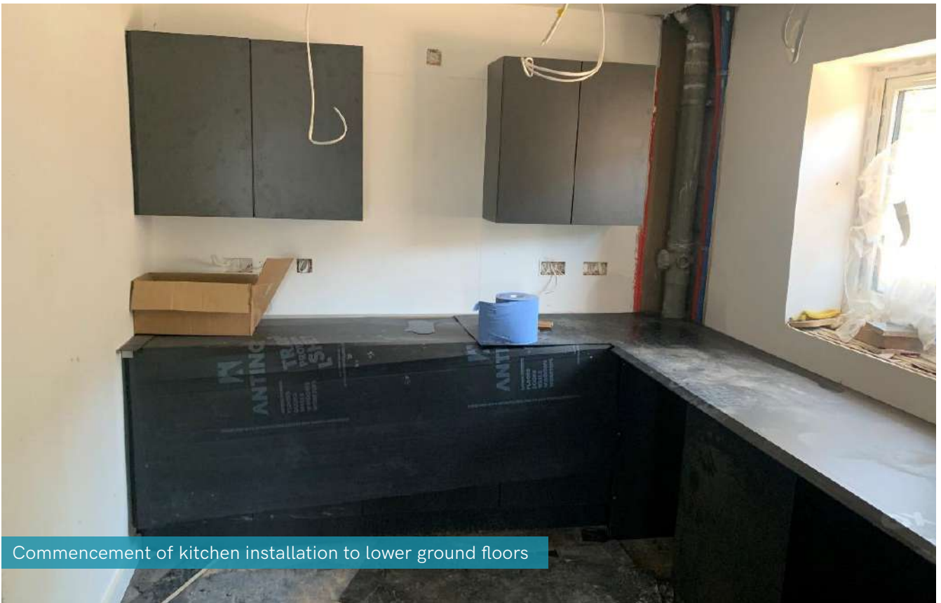
Commencement of kitchen installation to lower ground floors