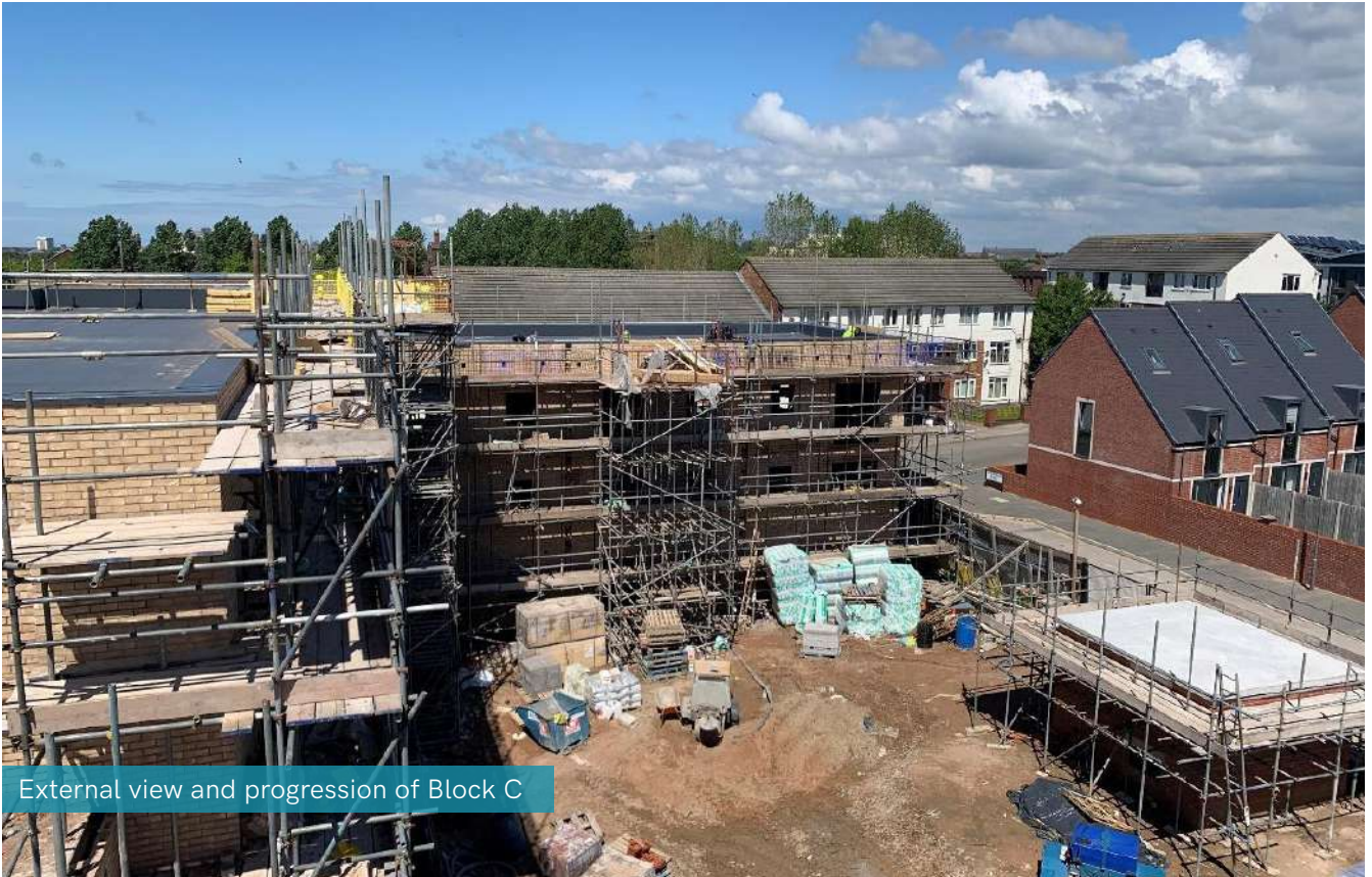
External view and progression of Block C