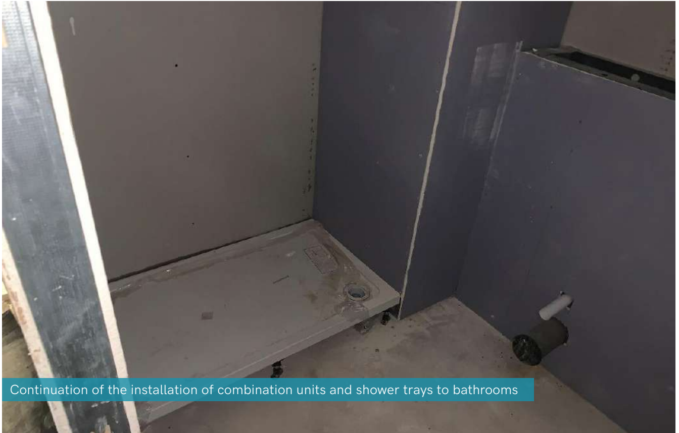
Continuation of the installation of combination units and shower trays to bathrooms