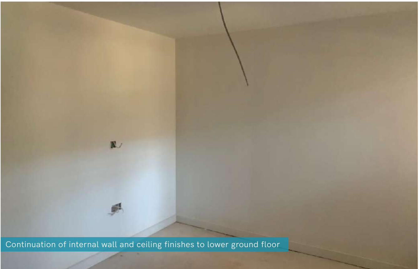
Continuation of internal wall and ceiling finishes to lower ground floor