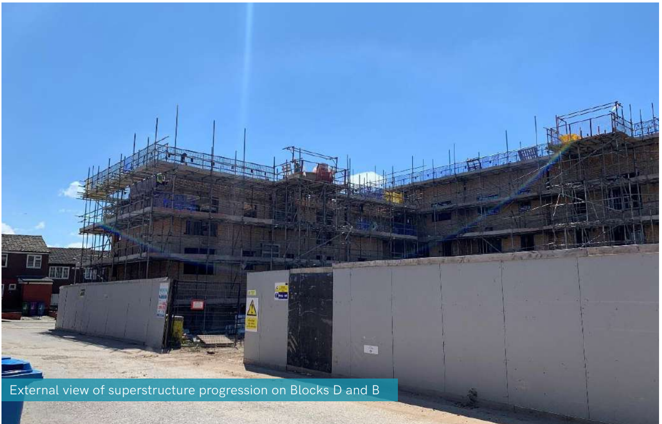
External view of superstructure progression on Blocks D and B