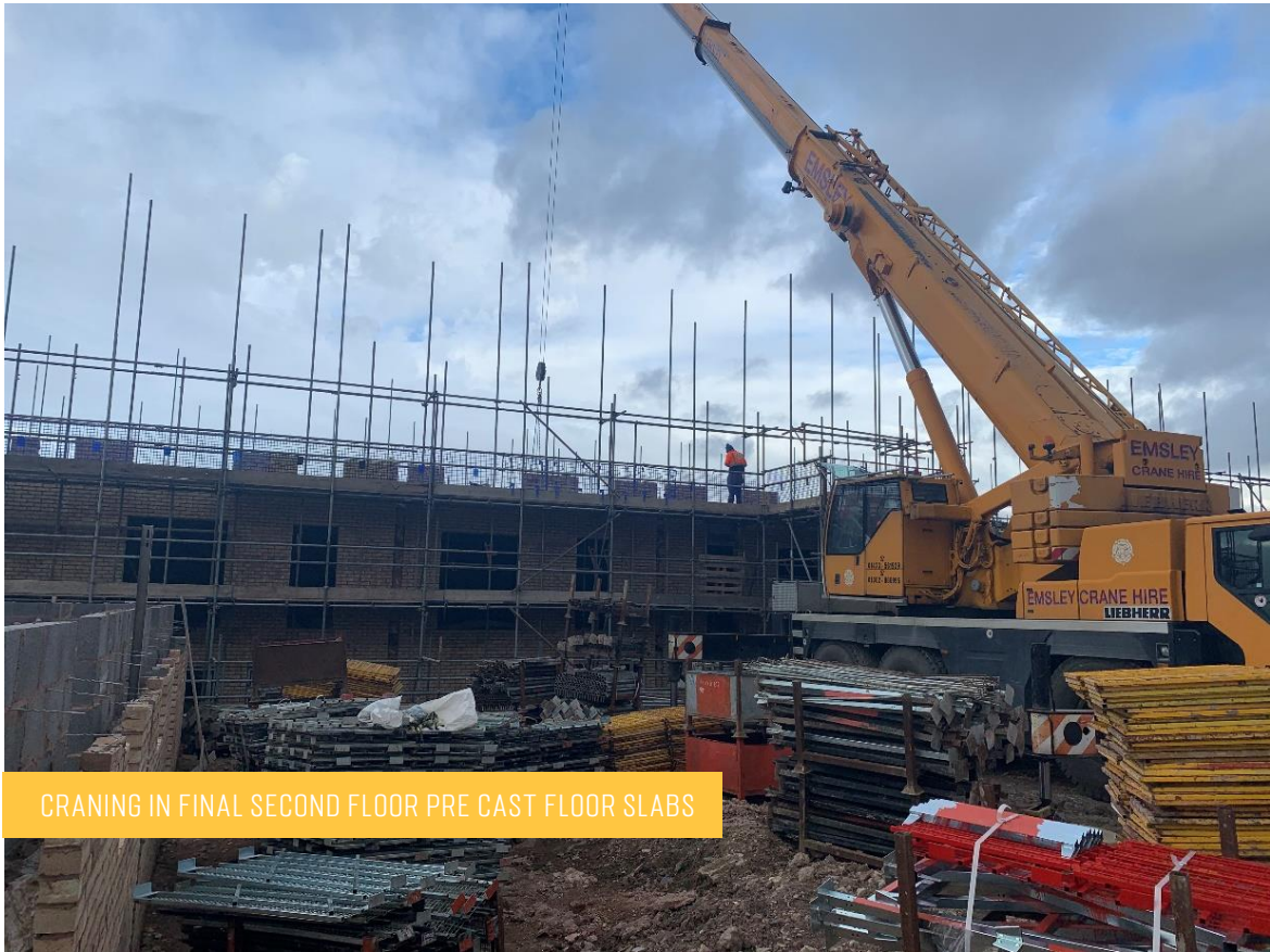
CRANING IN FINAL SECOND FLOOR PRE CAST FLOOR SLABS