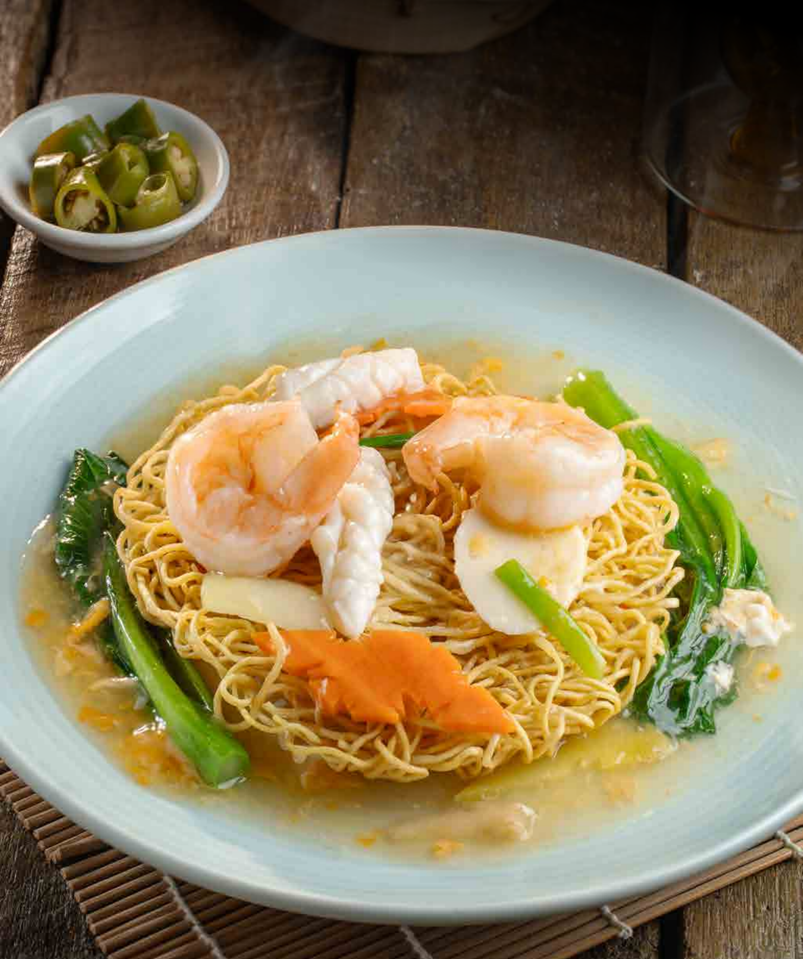
HK Crispy Noodle 港式海鮮脆面