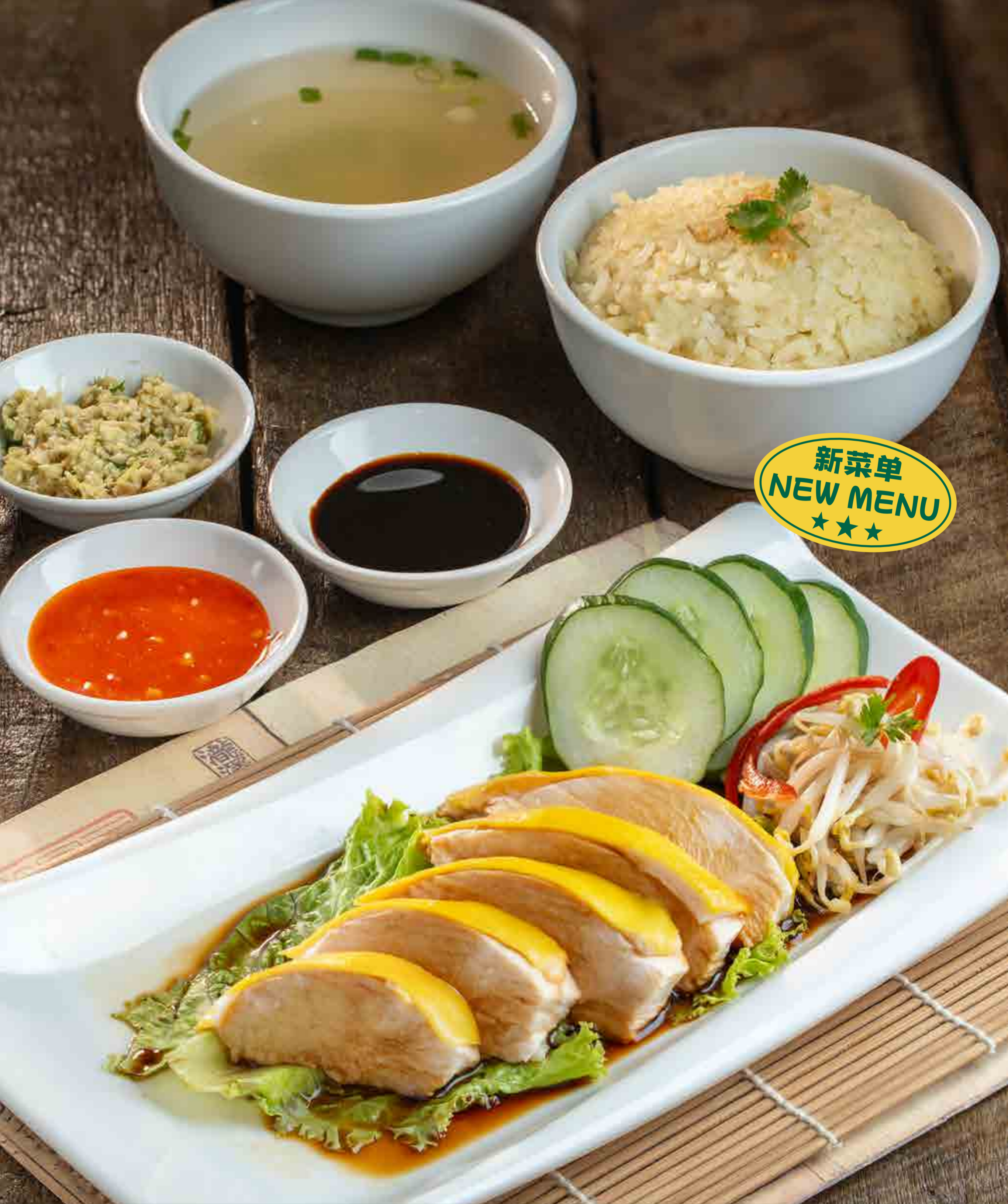
Silky Steamed Chicken Set (Choice of White or Hainan Rice) 马式滑鸡饭