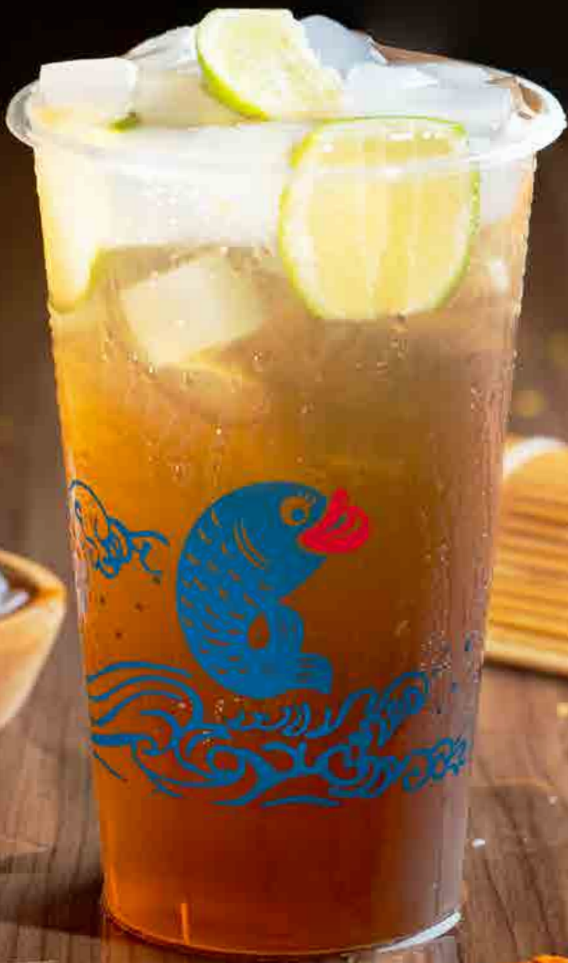
椰子橙汁 Teh Wintermelon Kelapa Wintermelon Coconut Tea