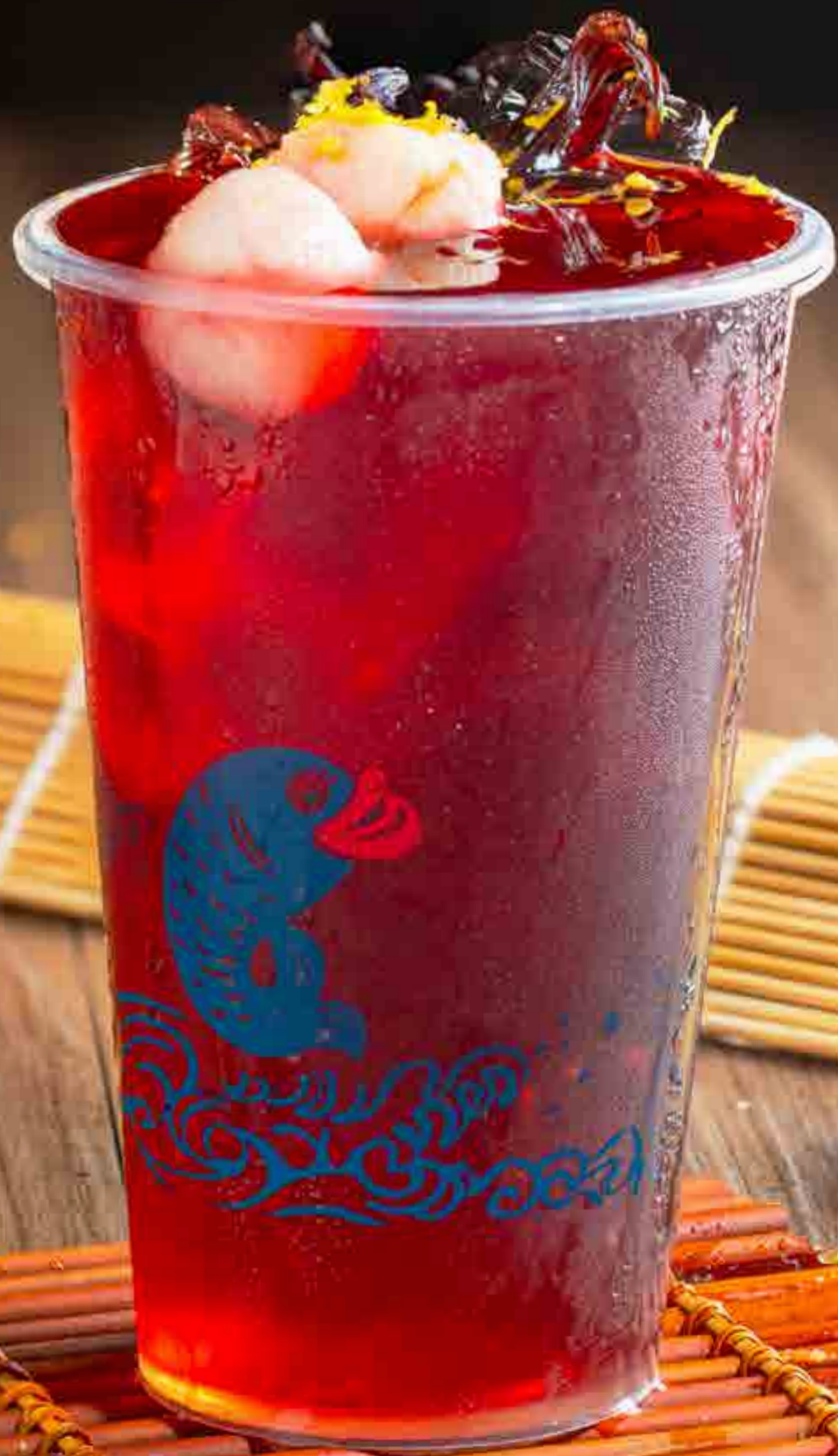
荔枝洛神花茶 Teh Rosella dengan Lychee Rosella Lychee Tea