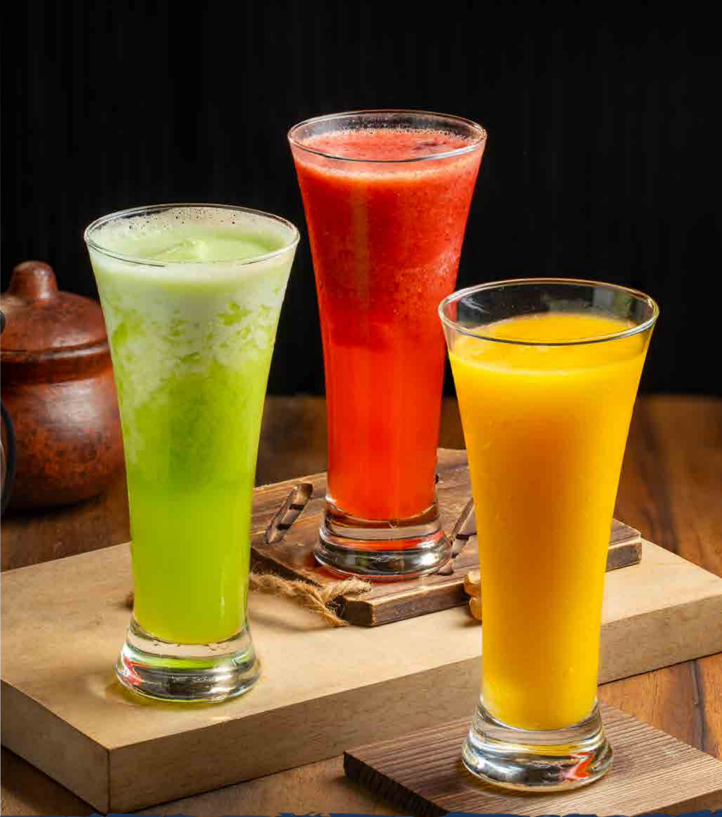
芒果汁 Jus Mangga Manggo Juice