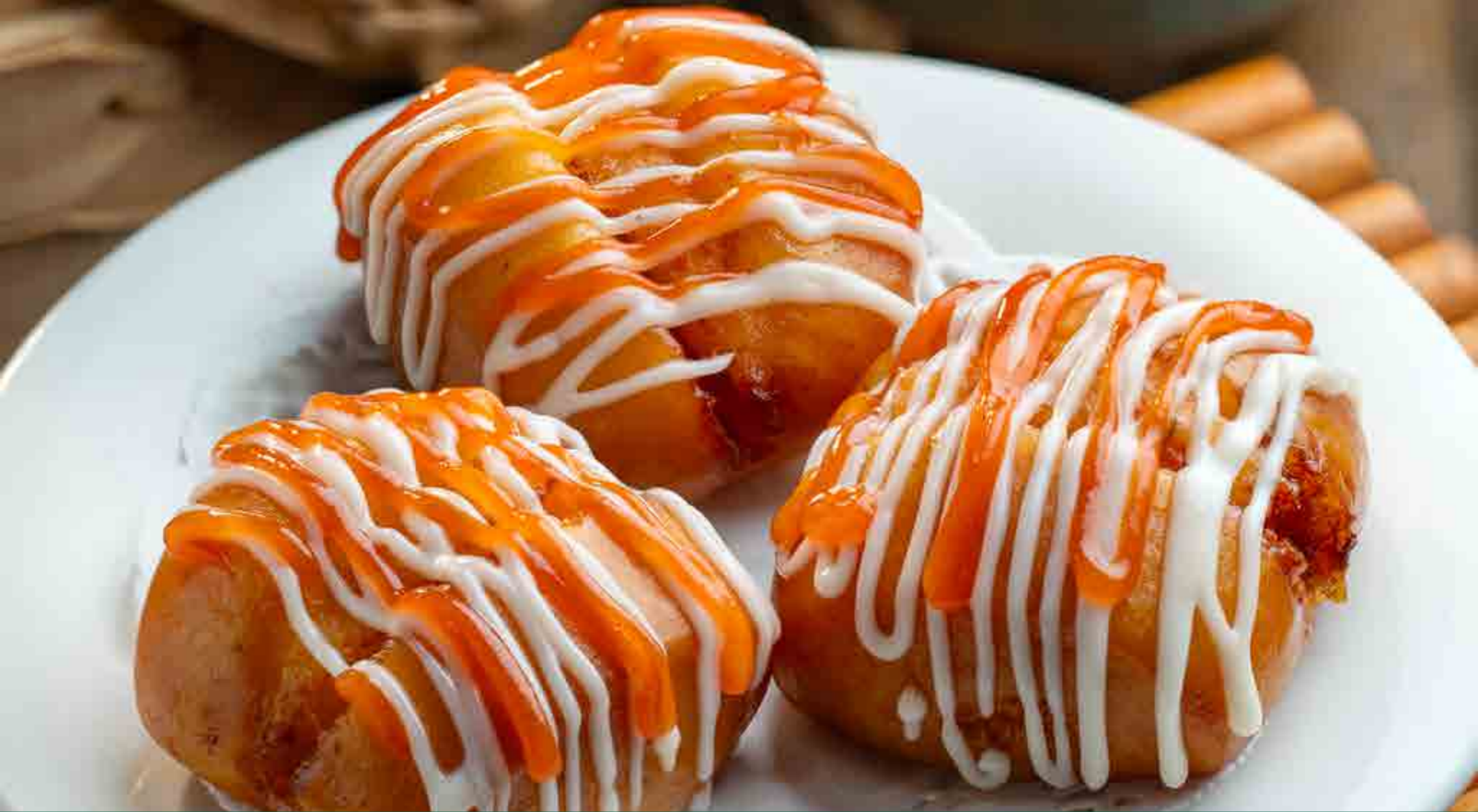
Fried Shrimp Mantou 香炸虾馒头