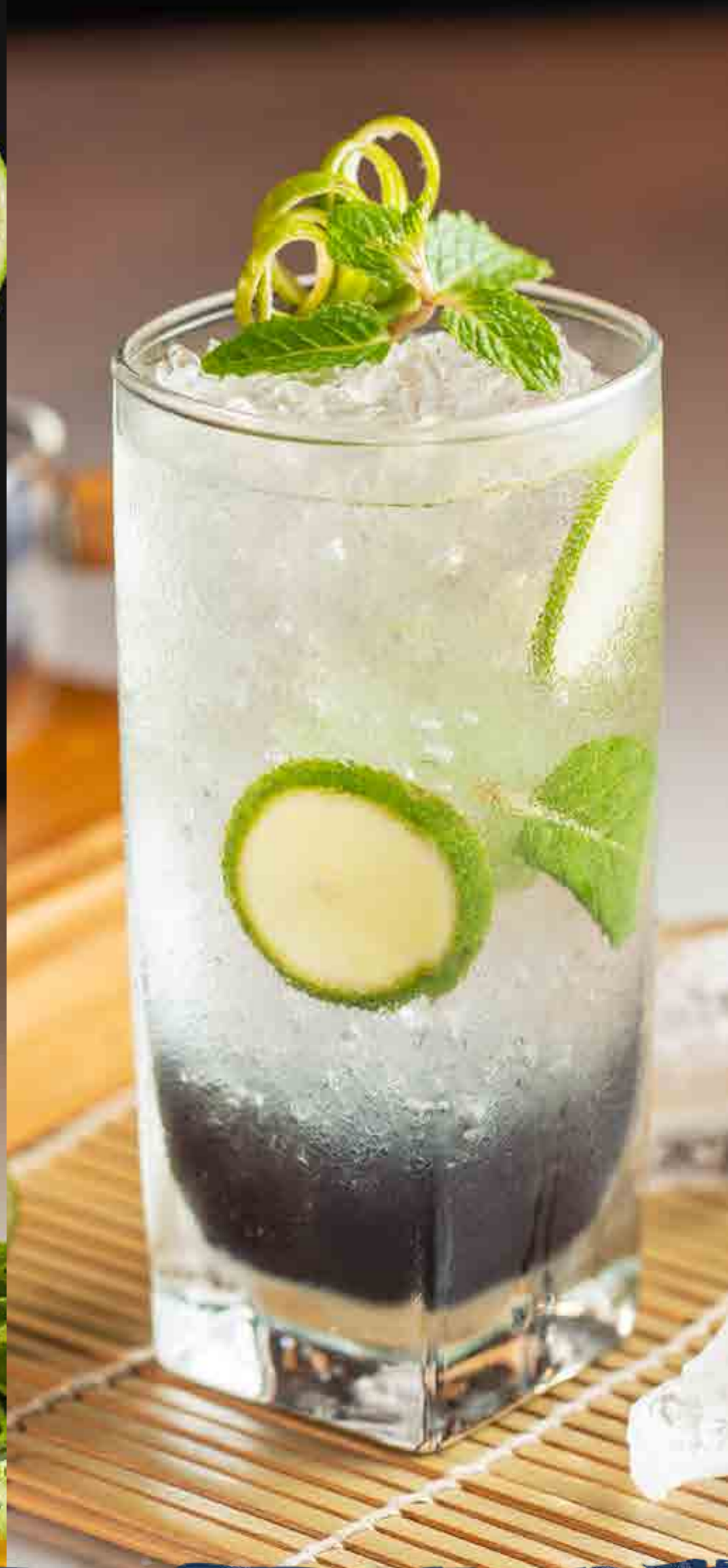
Blueberry Mojito Blueberry & Soda Water