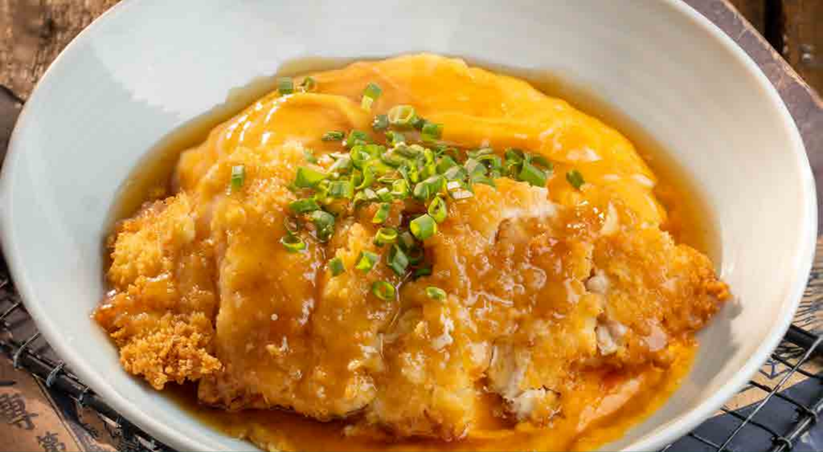
Chiffon Rice Chicken Katsu 吉列鸡绵绵饭