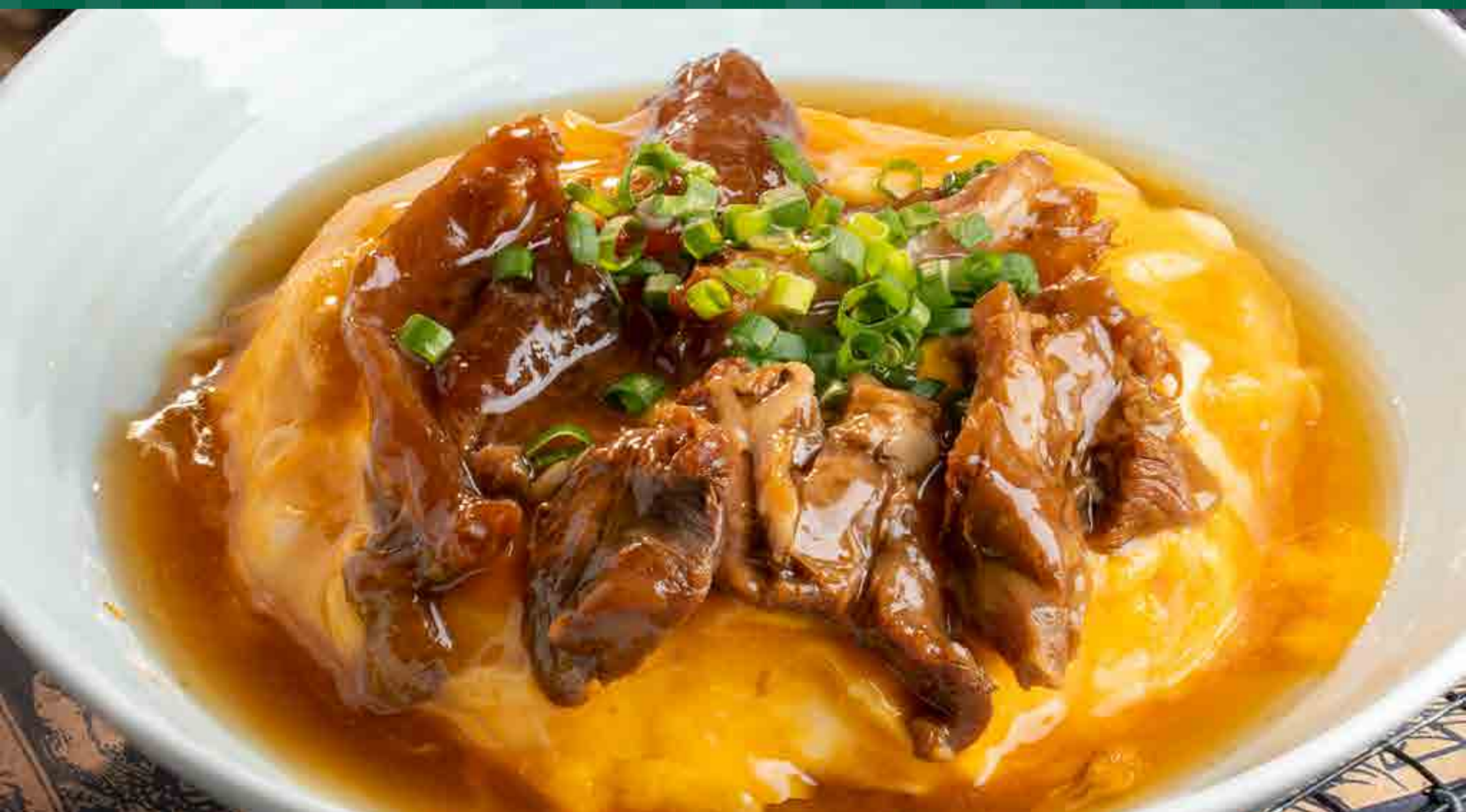
Chiffon Rice Beef Tendon