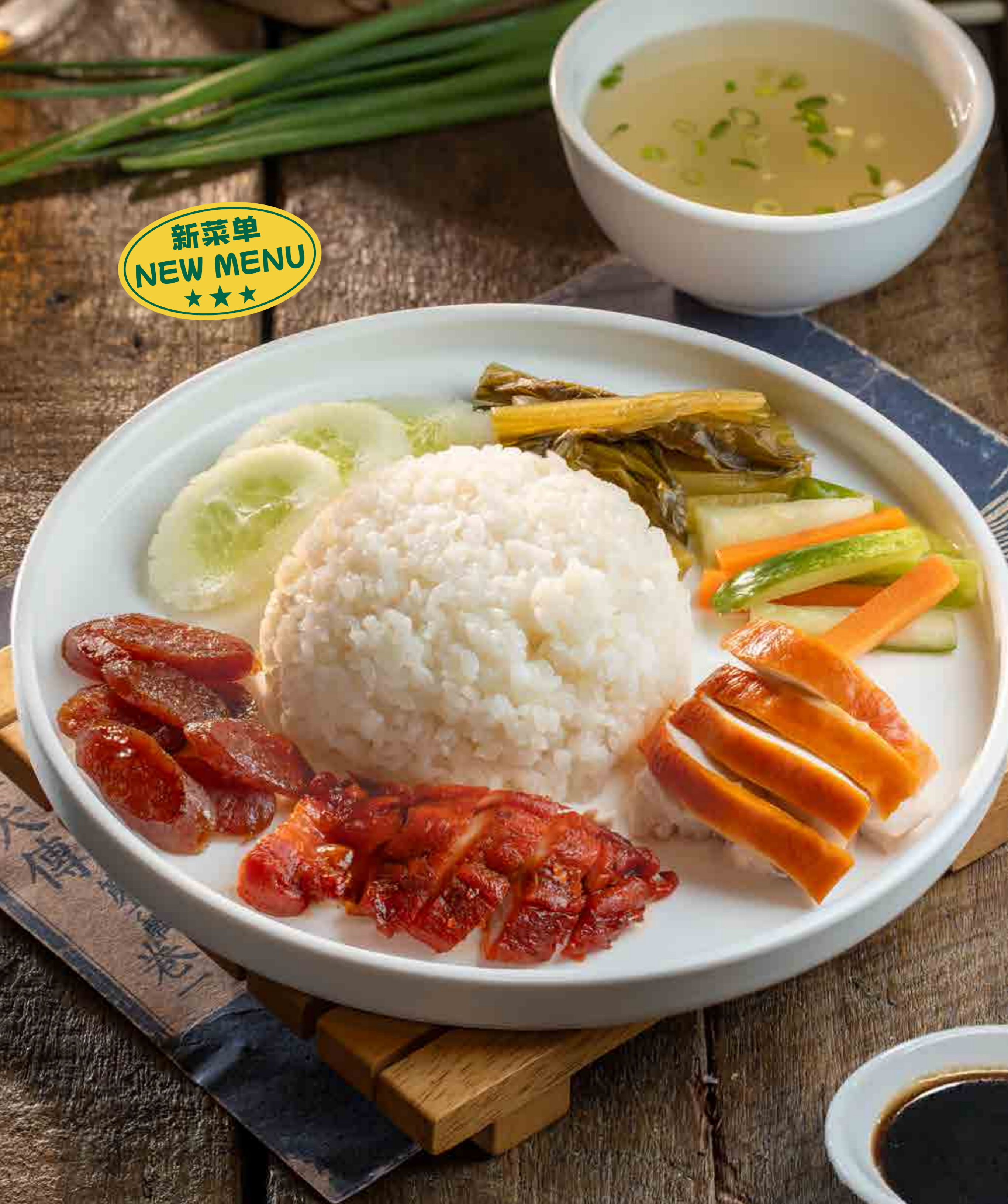
Nasi Campur Su Wah: Roast Chicken, Chicken Char Siew & Lap Cheong (Choice of White or Hainan Rice)