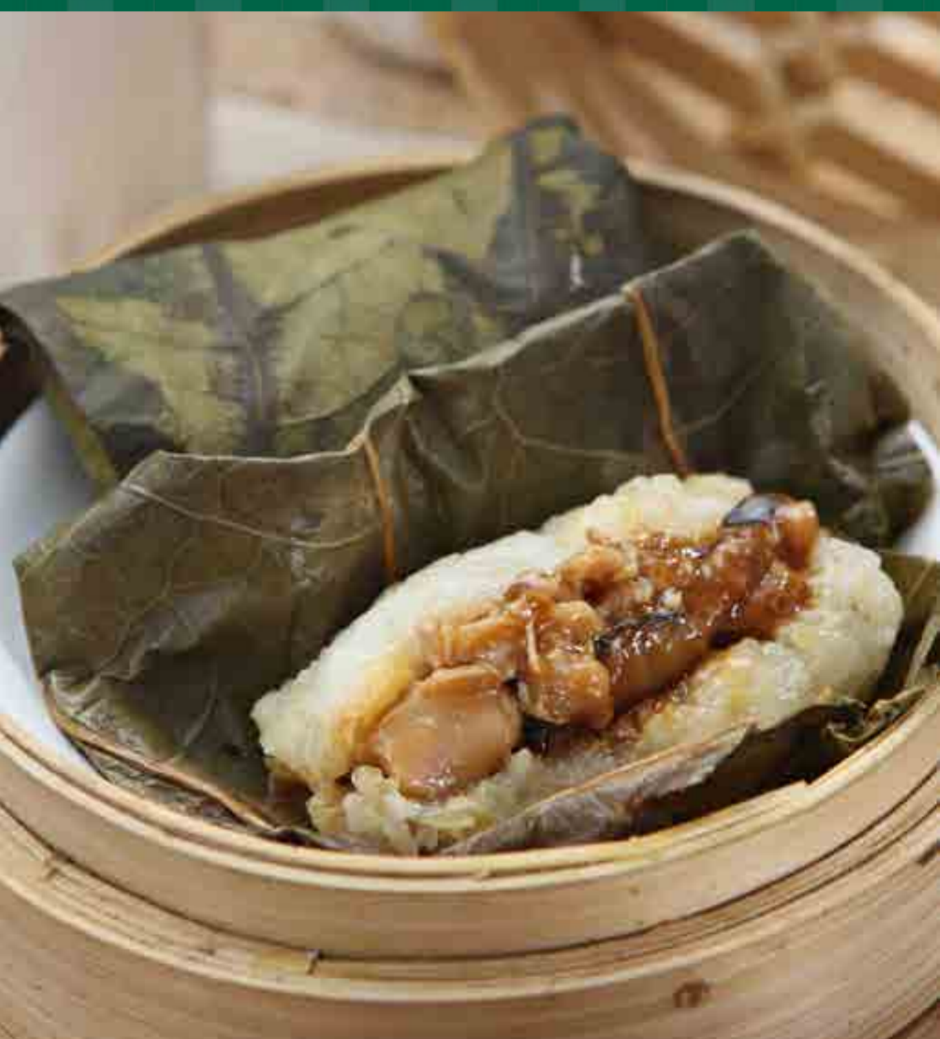
Lo Mai Gai 糯米鸡