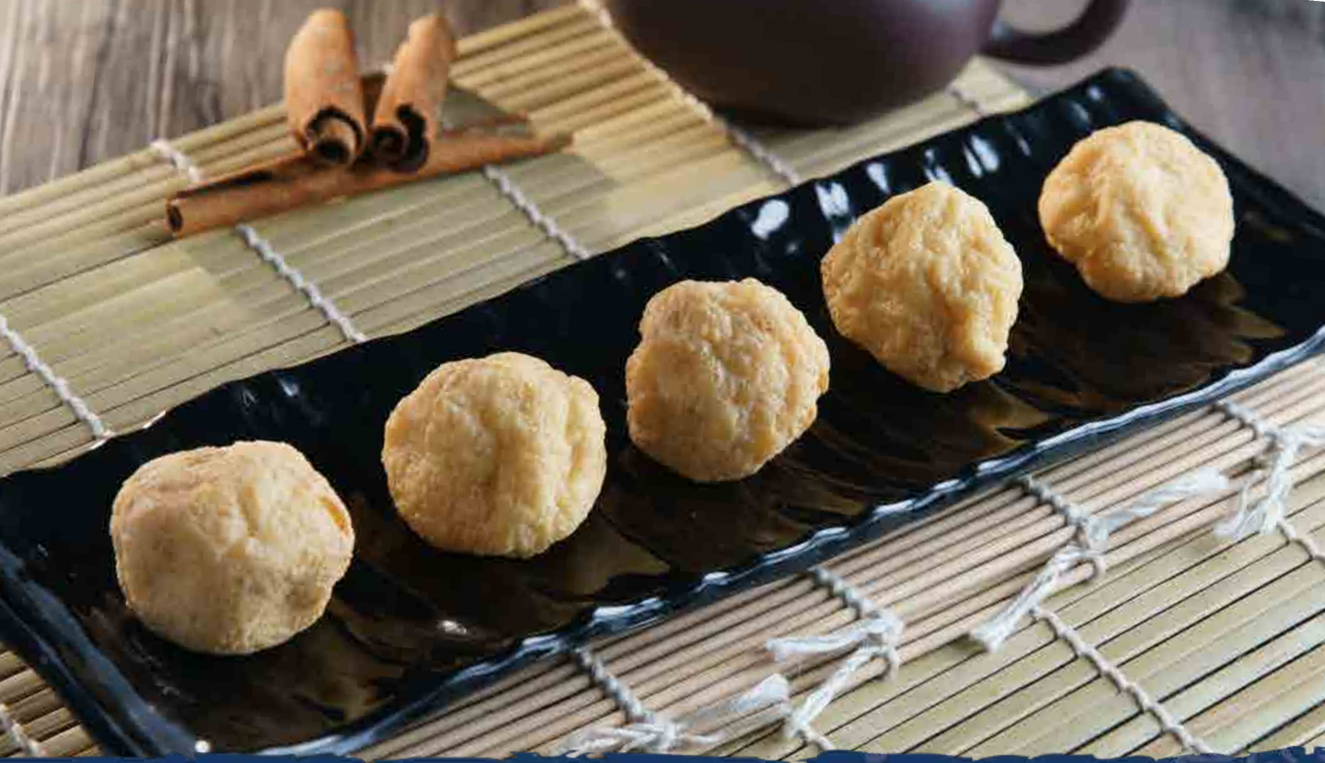
黄尾鱼丸 Bakso Tahu Suji (5 pcs) Fried Fish Ball