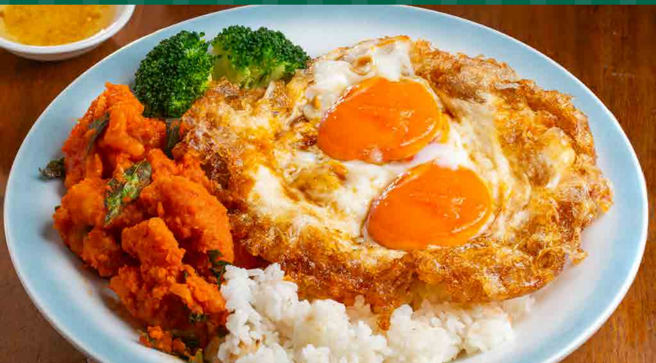
Salted Egg Chicken