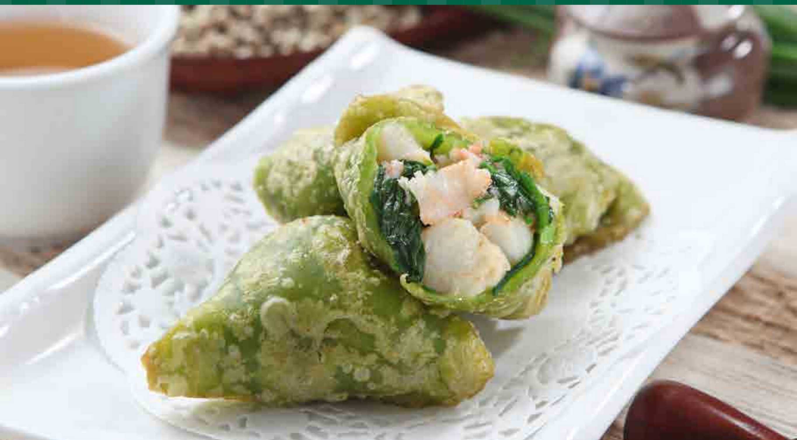
Fried Dumpling Chives