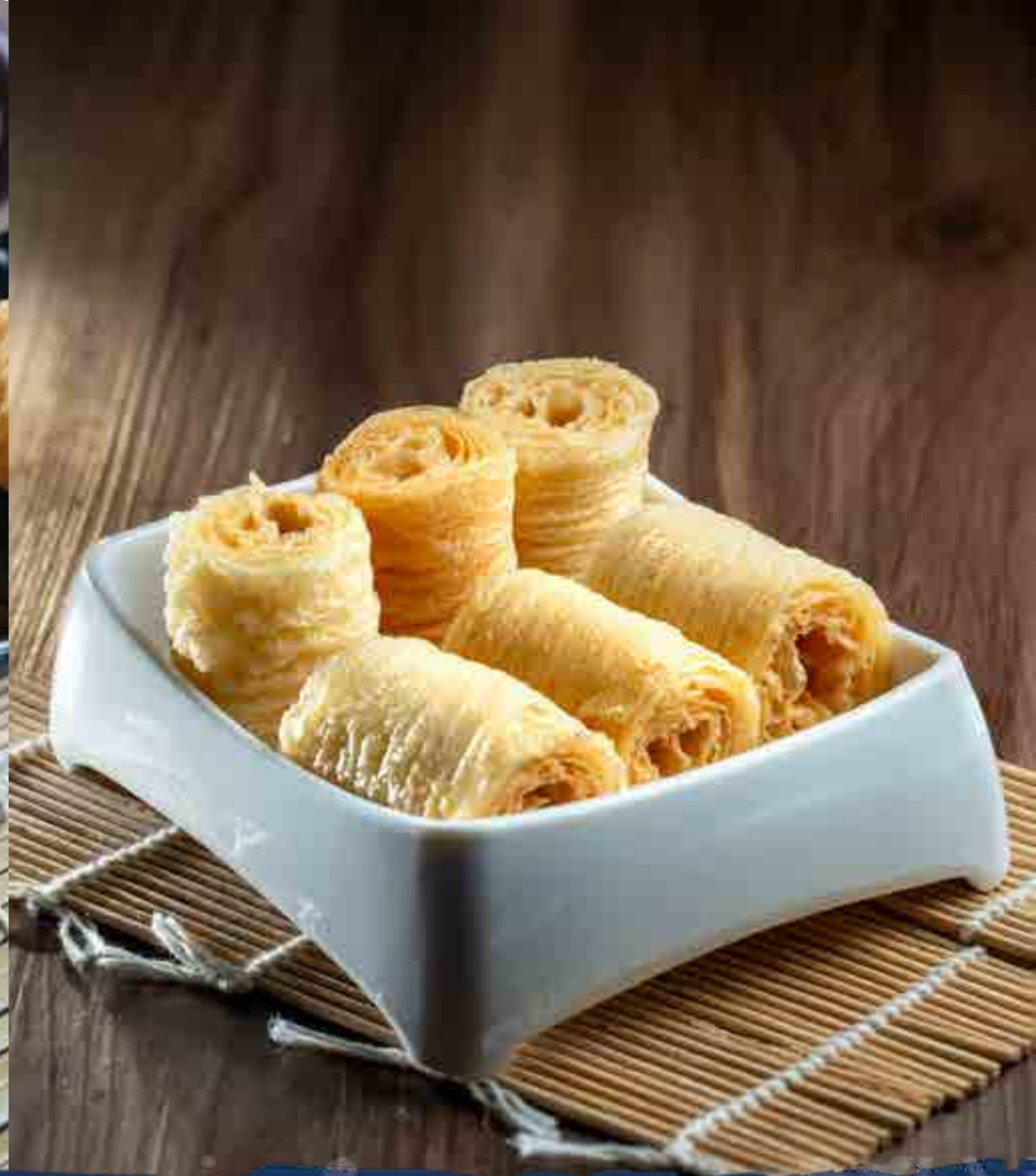
铃铃卷 Kulit Tahu Roll Fried Bean Curd Skin