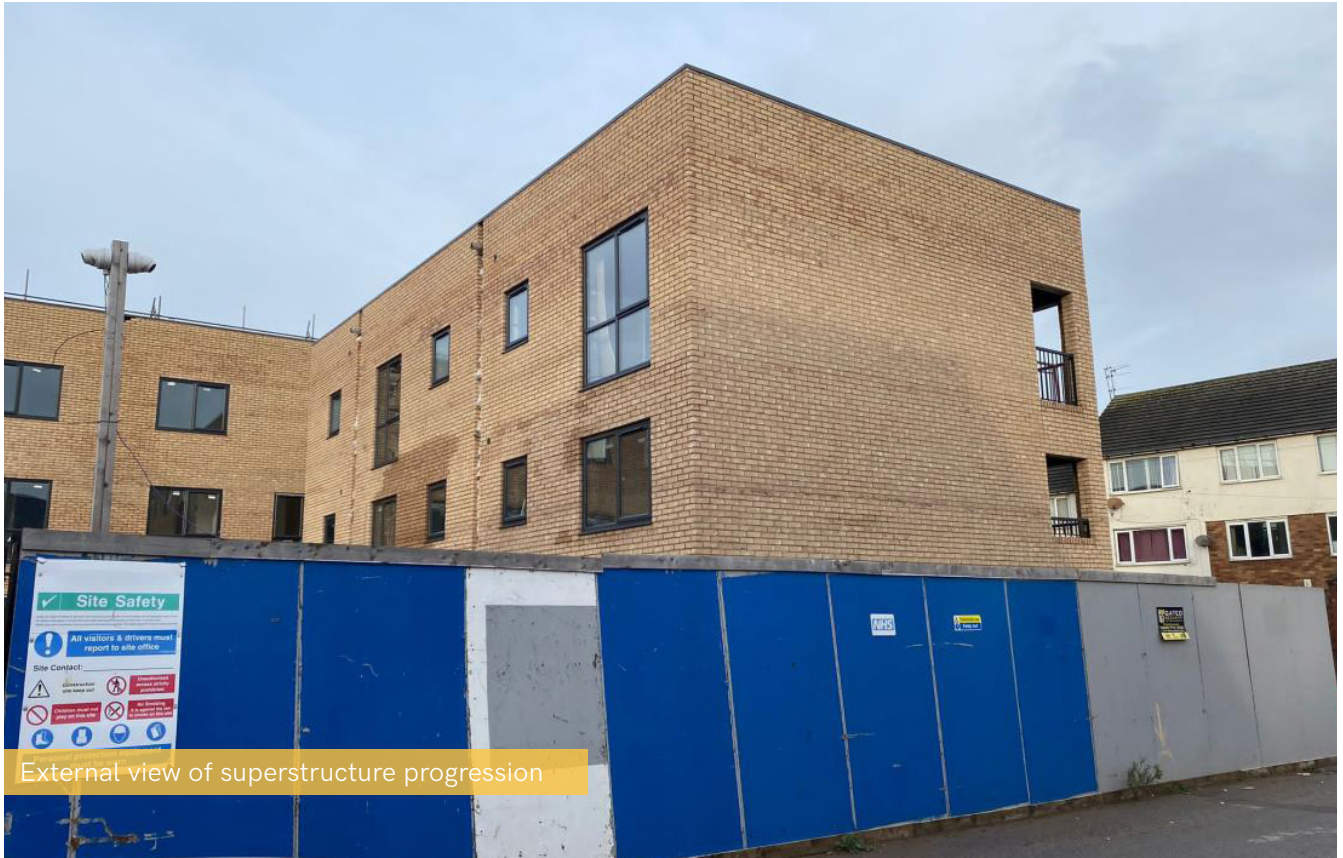
External view of superstructure progression