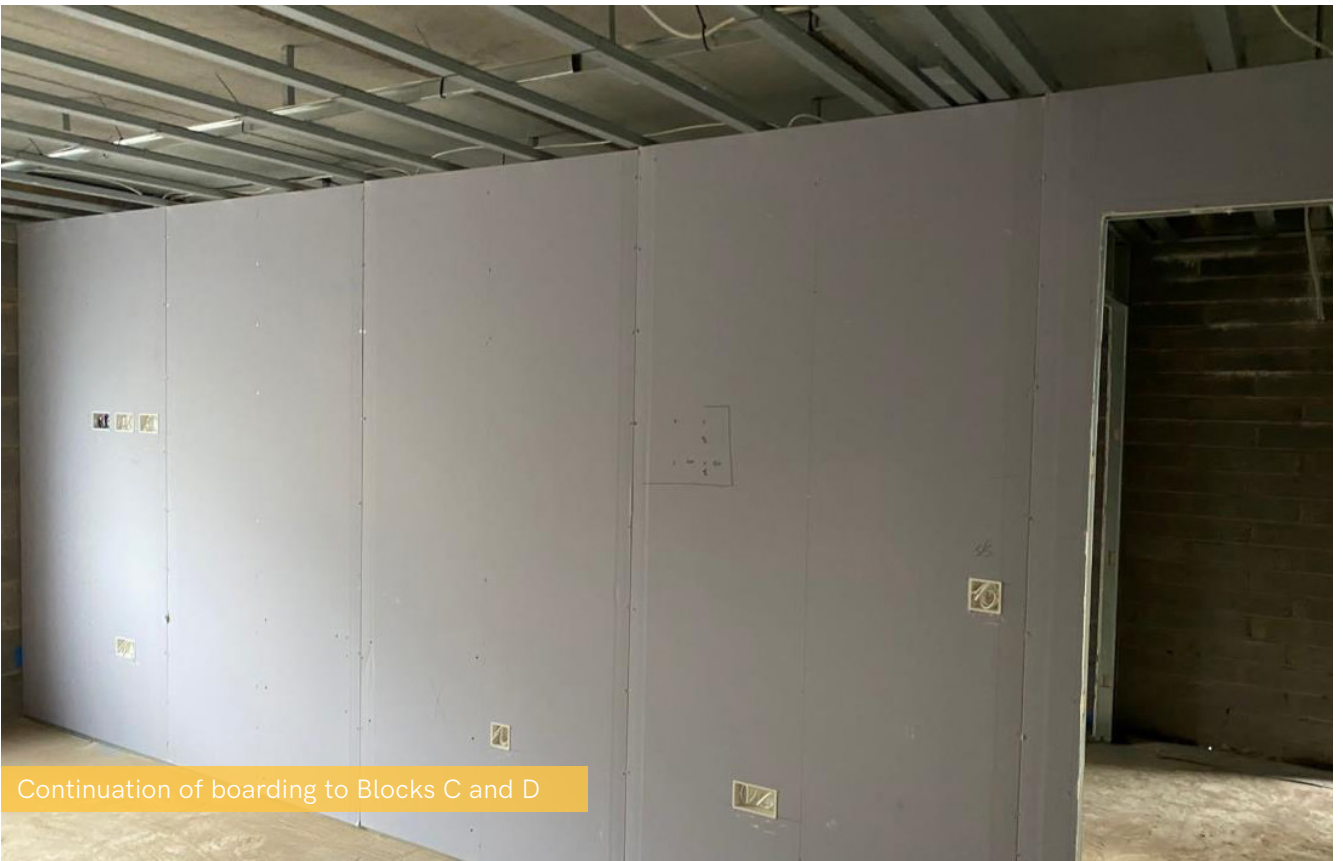
Continuation of boarding to Blocks C and D