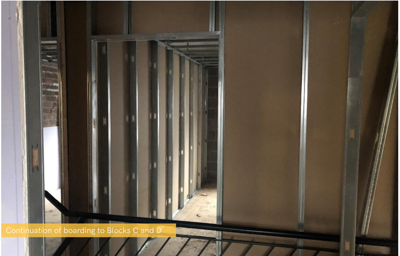
Continuation of boarding to Blocks C and D