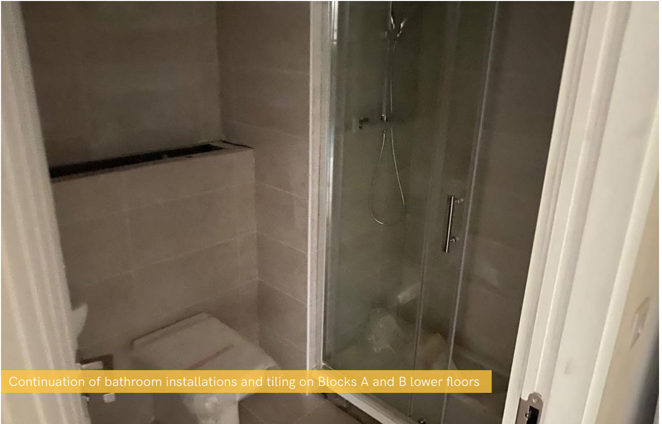
Continuation of bathroom installations and tiling on Blocks A and B lower floors