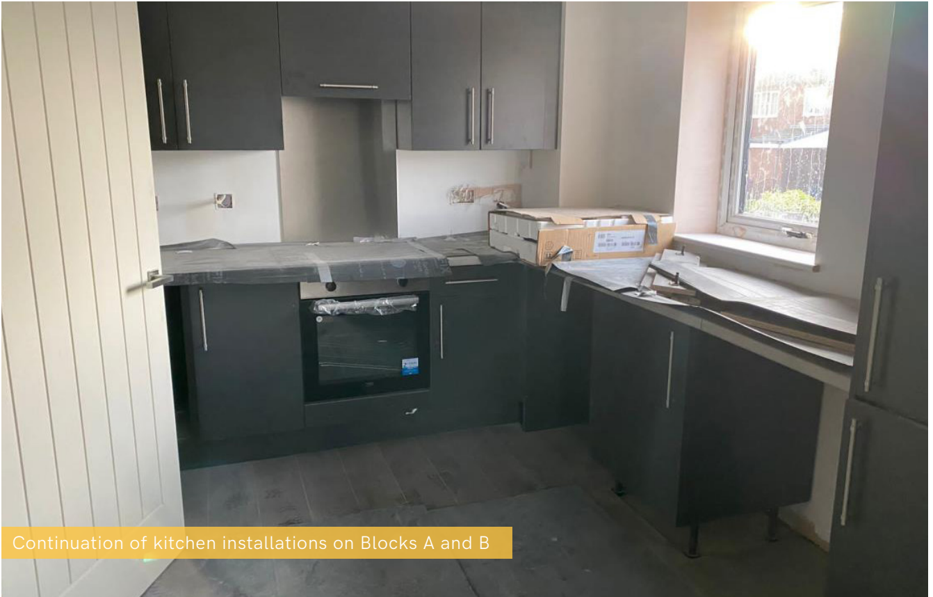
Continuation of kitchen installations on Blocks A and B