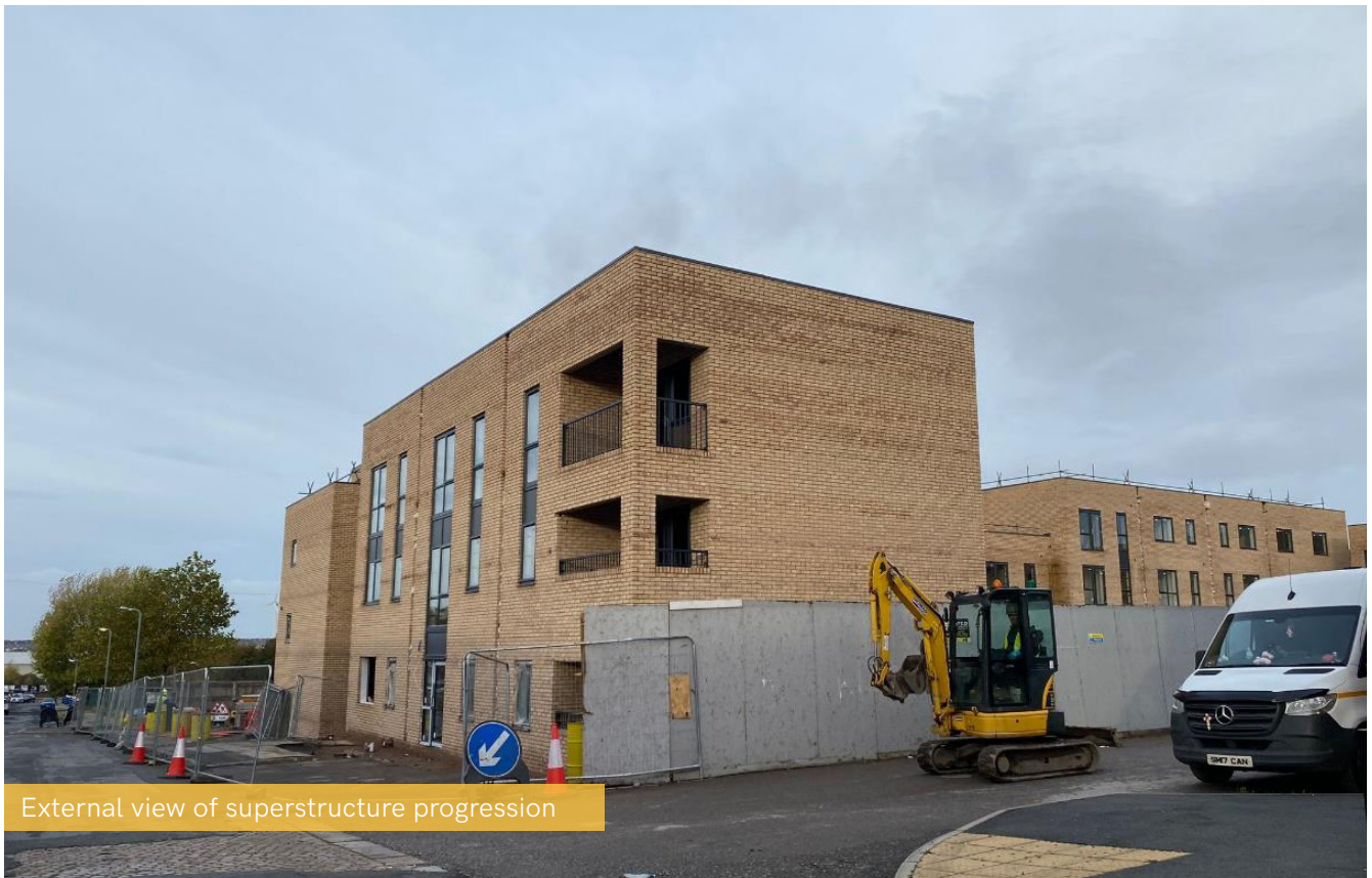
External view of superstructure progression