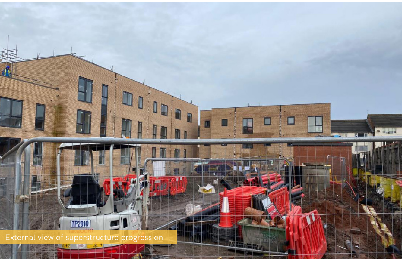
External view of superstructure progression