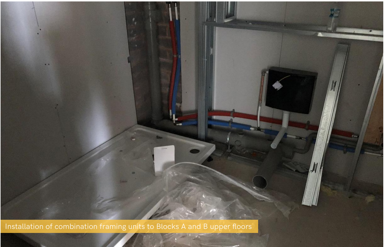
Installation of combination framing units to Blocks A and B upper floors