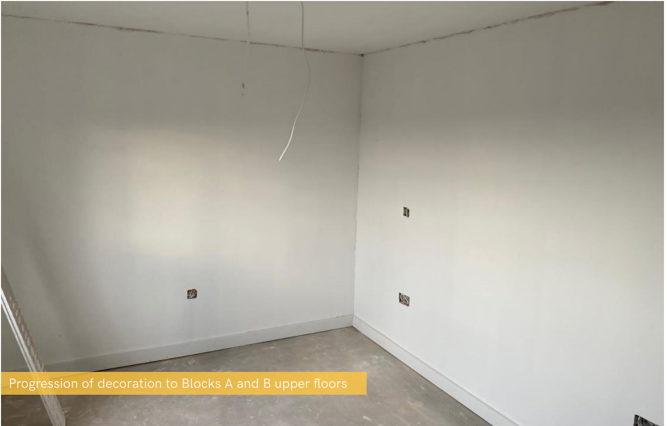
Progression of decoration to Blocks A and B upper floors