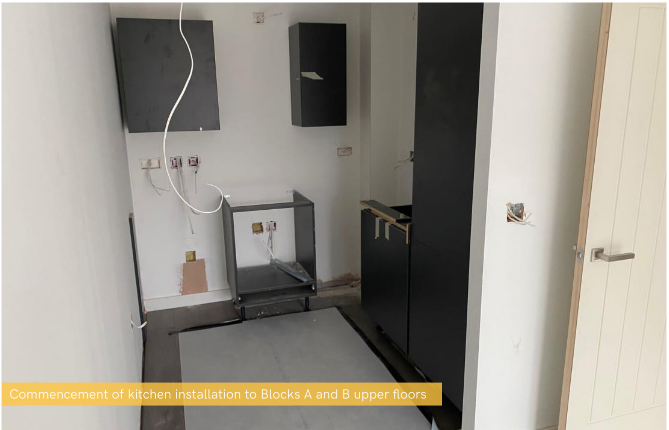
Commencement of kitchen installation to Blocks A and B upper floors