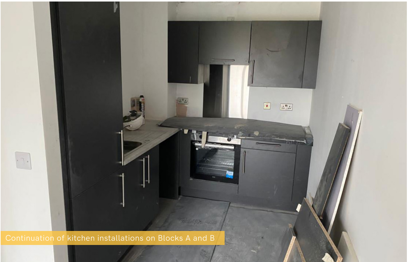
Continuation of kitchen installations on Blocks A and B