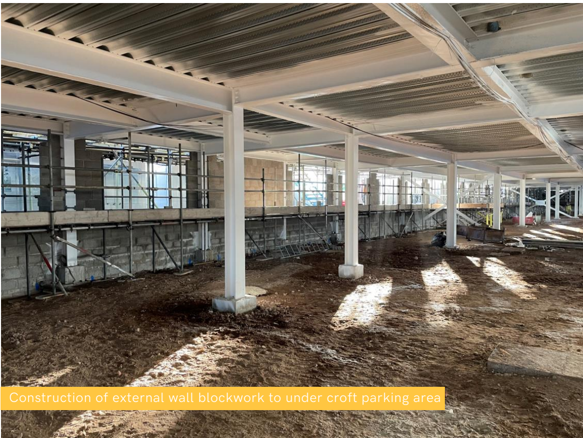
Construction of external wall blockwork to undercroft parking area