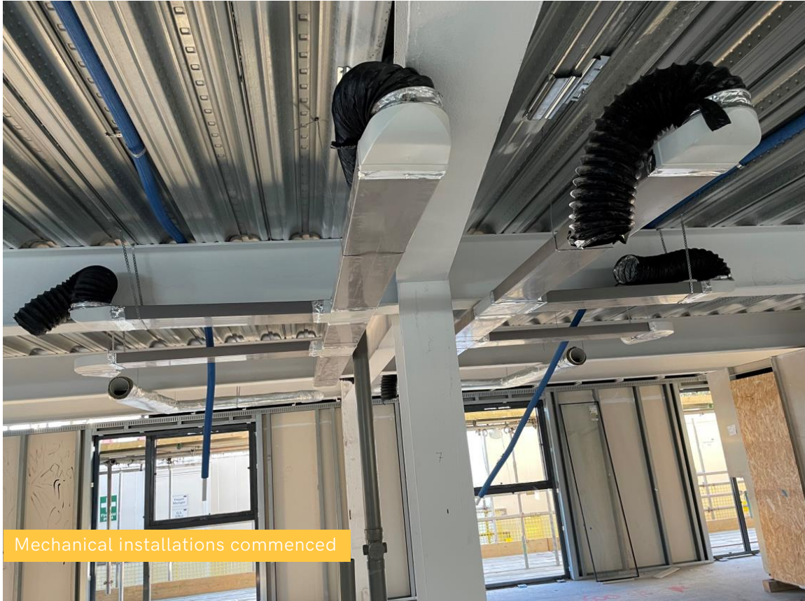
Mechanical installations commenced