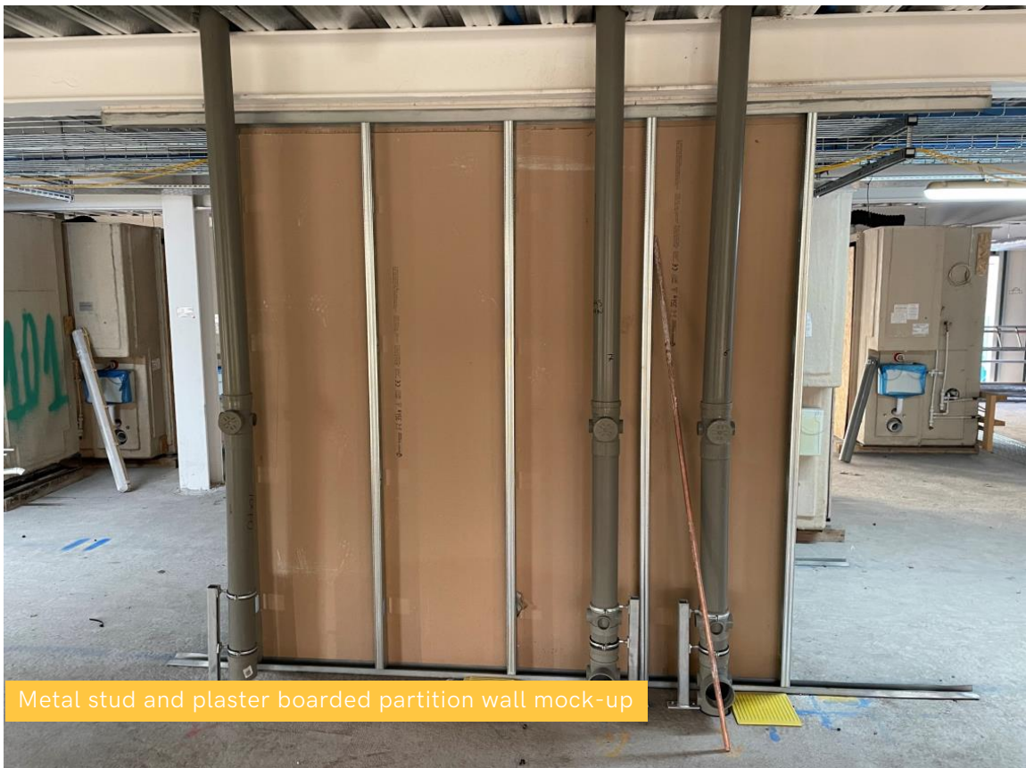
Metal stud and plaster boarded partition wall mock-up