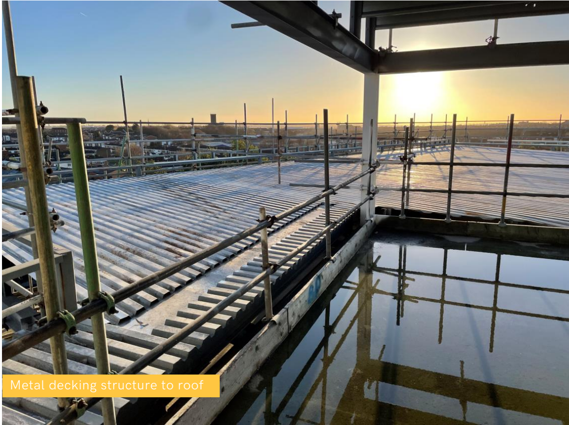
Metal decking structure to roof