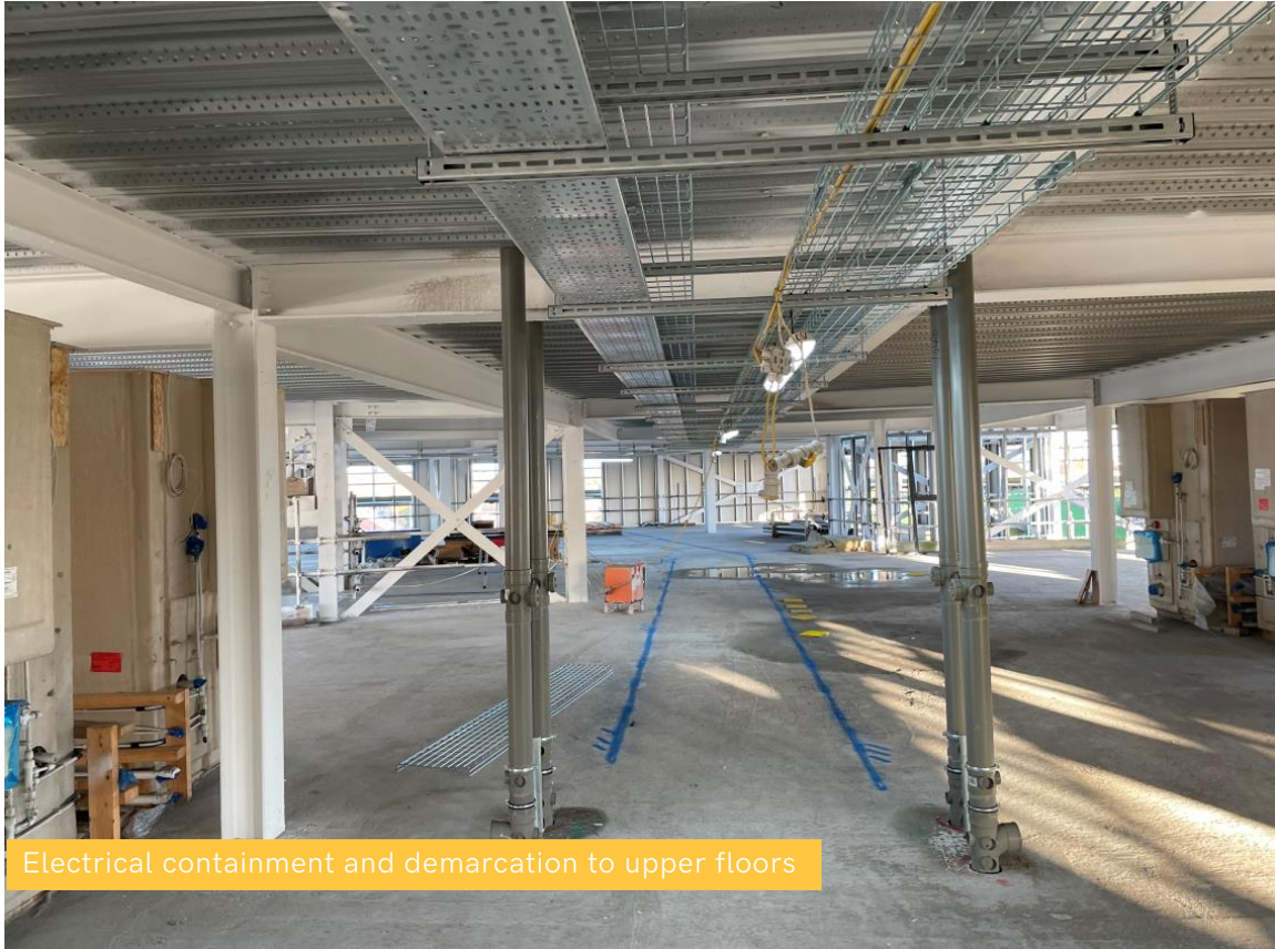
Electrical containment and demarcation to upper floors