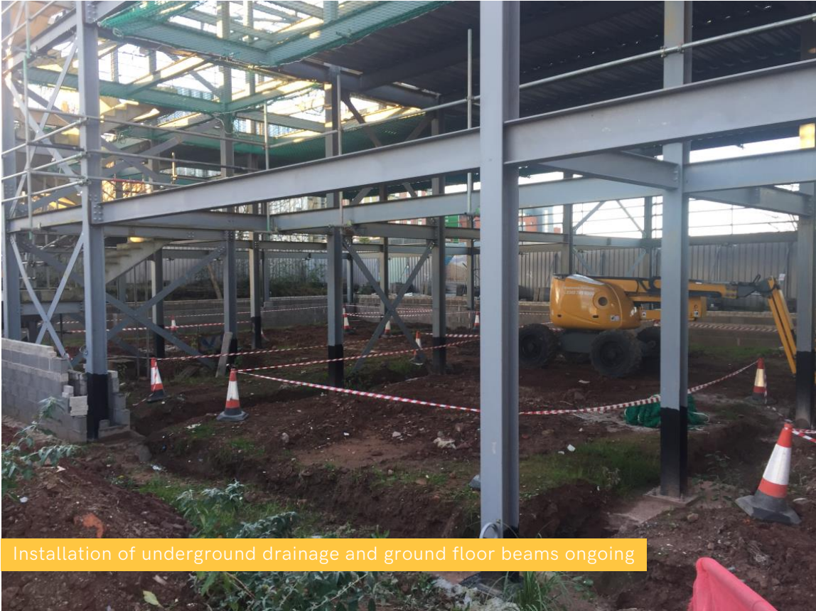
Installation of underground drainage and ground floor beams ongoing