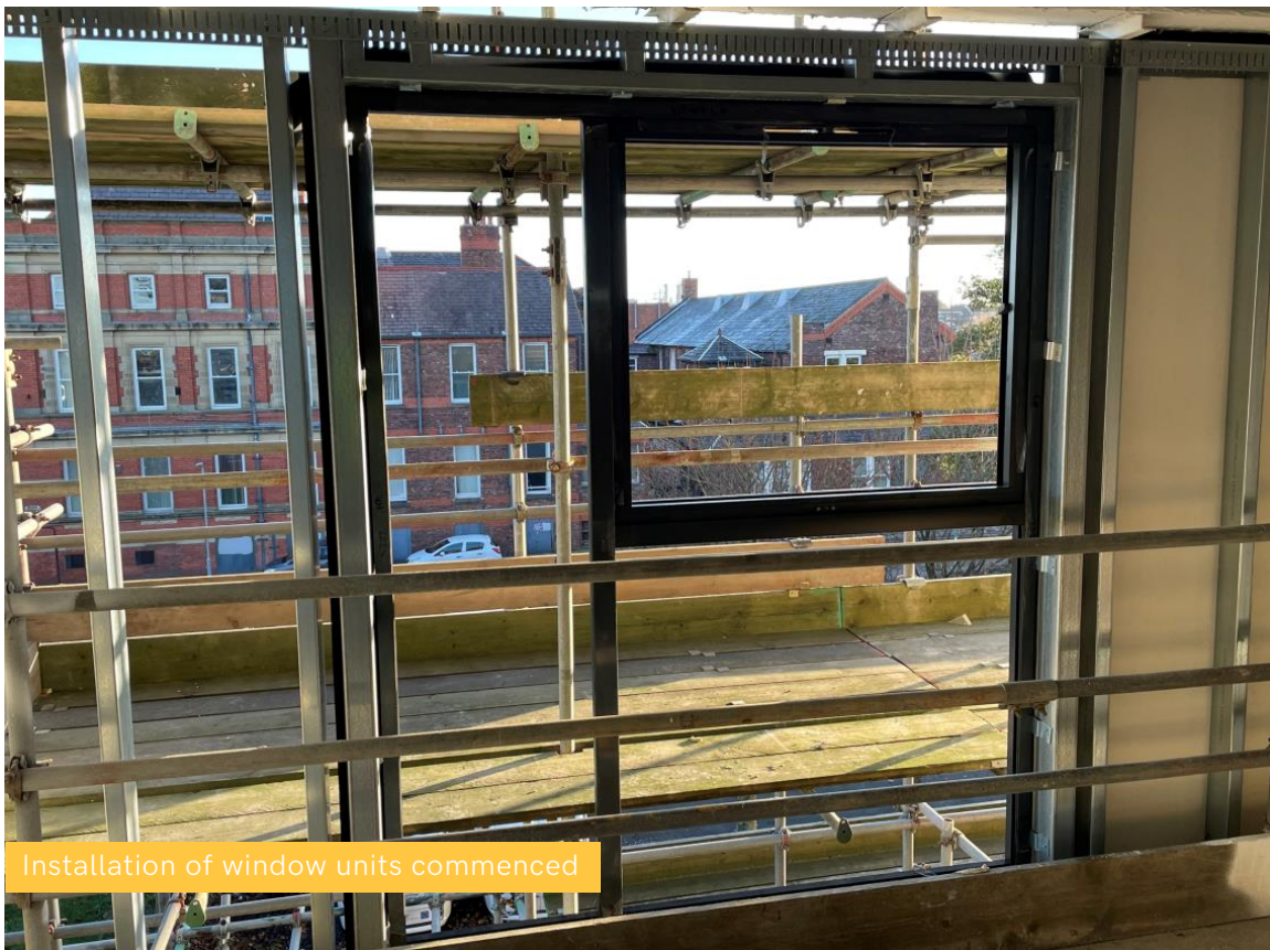
Installation of window units commenced