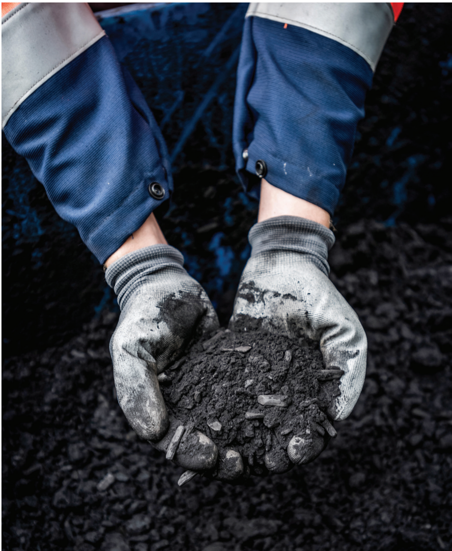
Biochar is made up of biogenic carbon.