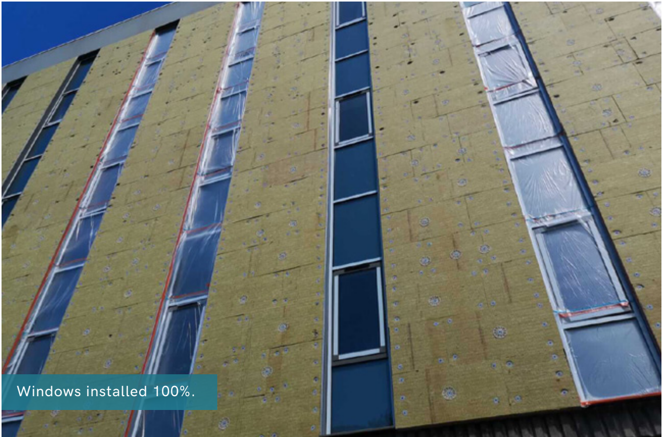
Windows installed 100%.