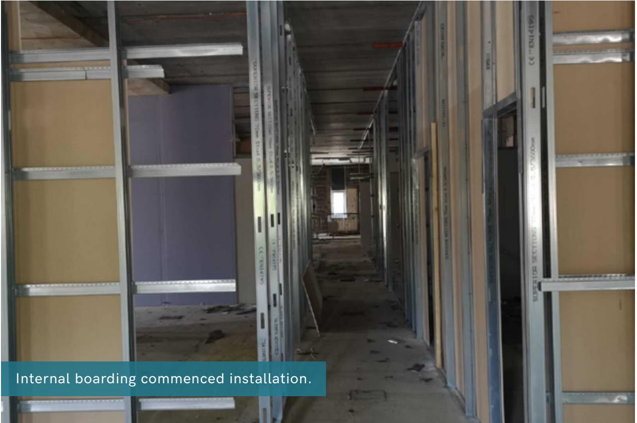
Internal boarding commenced installation.