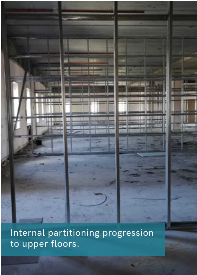
Internal partitioning progression to upper floors.