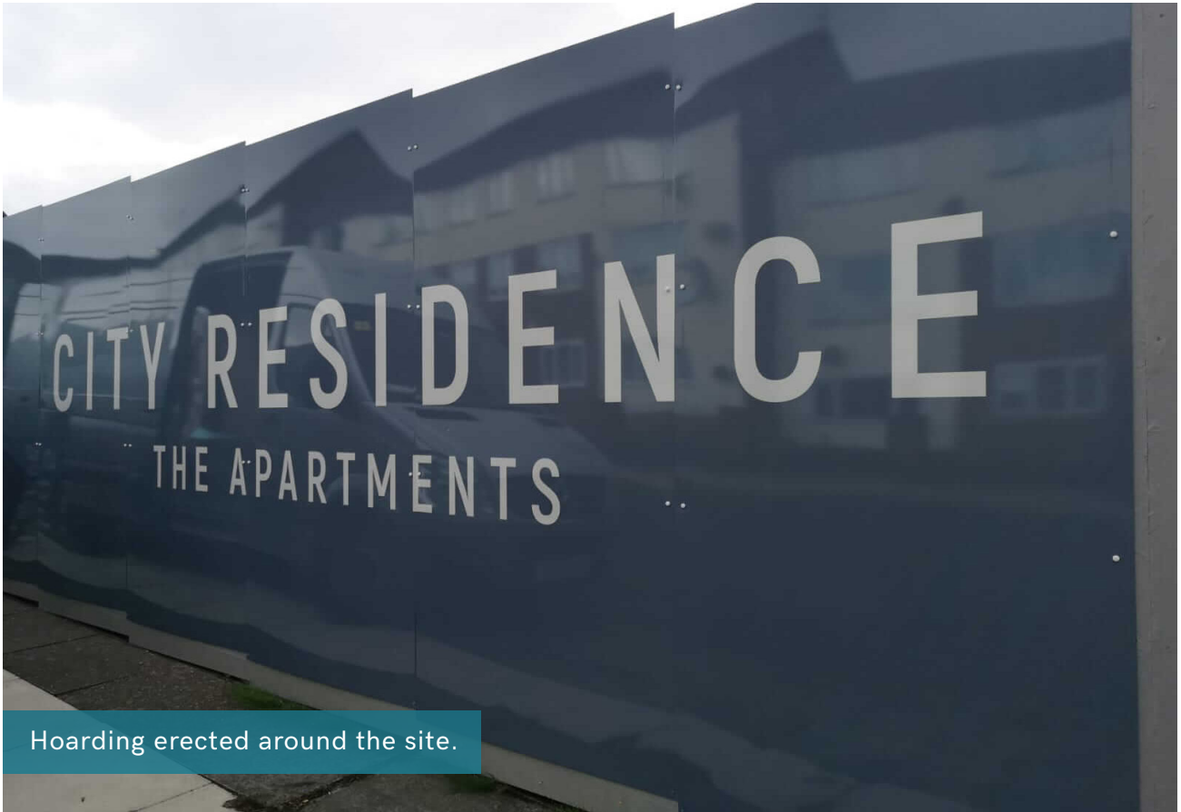
Hoarding erected around the site.