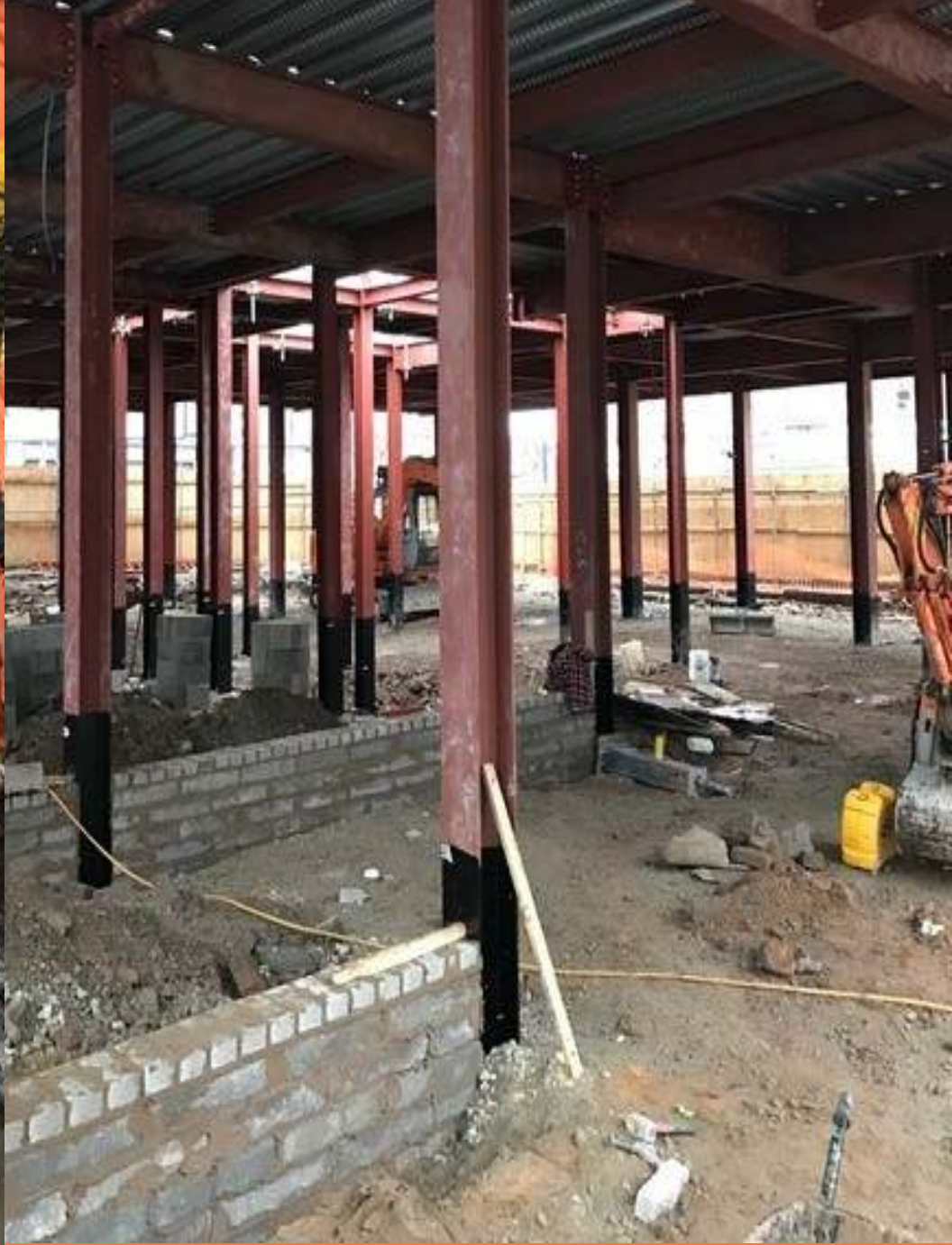
Brickwork is being prepared to lay the ground floor slab in readiness for Timber Frame erection.