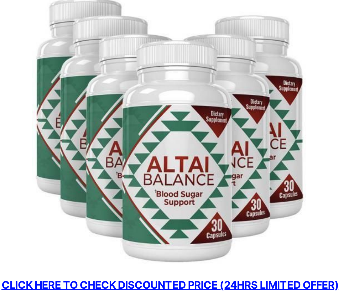
Why Altai Balance?

Altai Balance enhancement that tends to balance the sugar levels, Altai Balance handles the body's insulin opposition cycle by utilizing a special anti-aging blend consisting of 19 herbal extract ingredients. It balances blood sugar levels in both men and women. All the ingredients present in this supplement are extracted from herbs so that there are no ill effects.