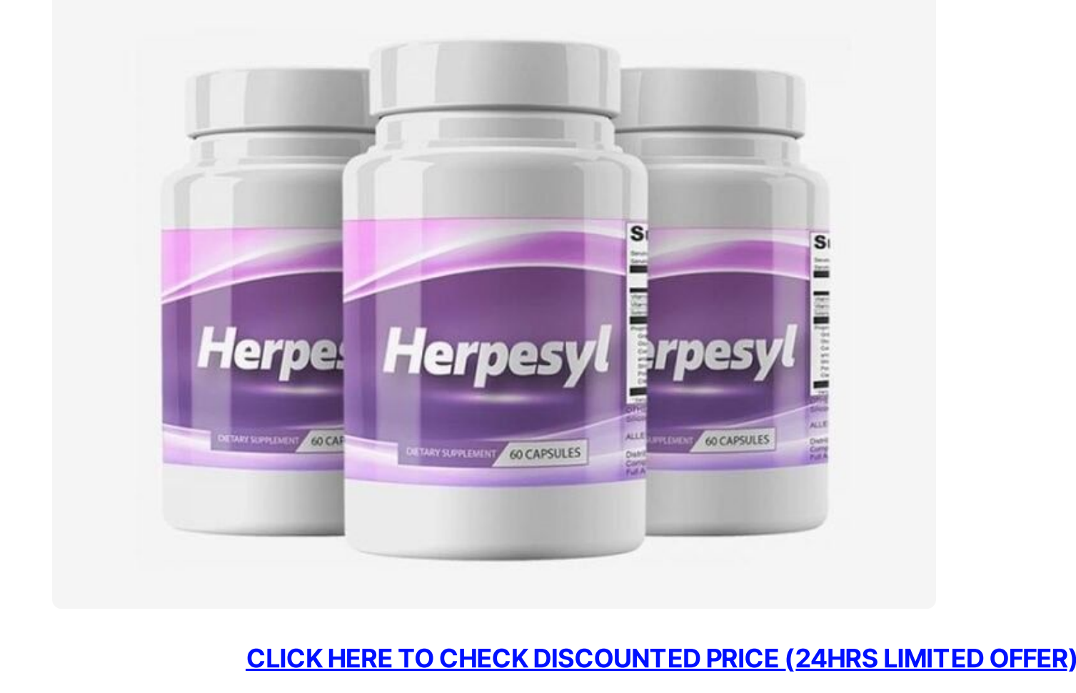
What Is Herpesyl?

However, is it the correct enhancement to attempt? We should discover it out with this thorough Herpesyl review.