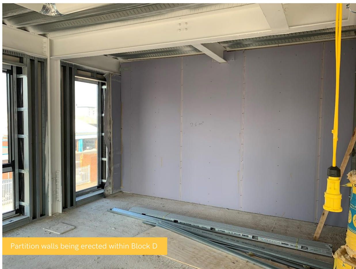
Partition walls being erected within Block D