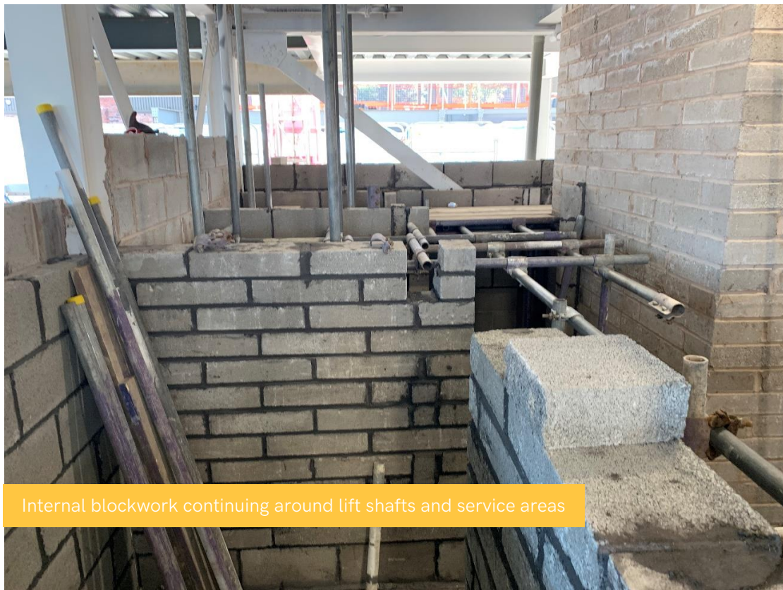
Internal blockwork continuing around lift shafts and service areas