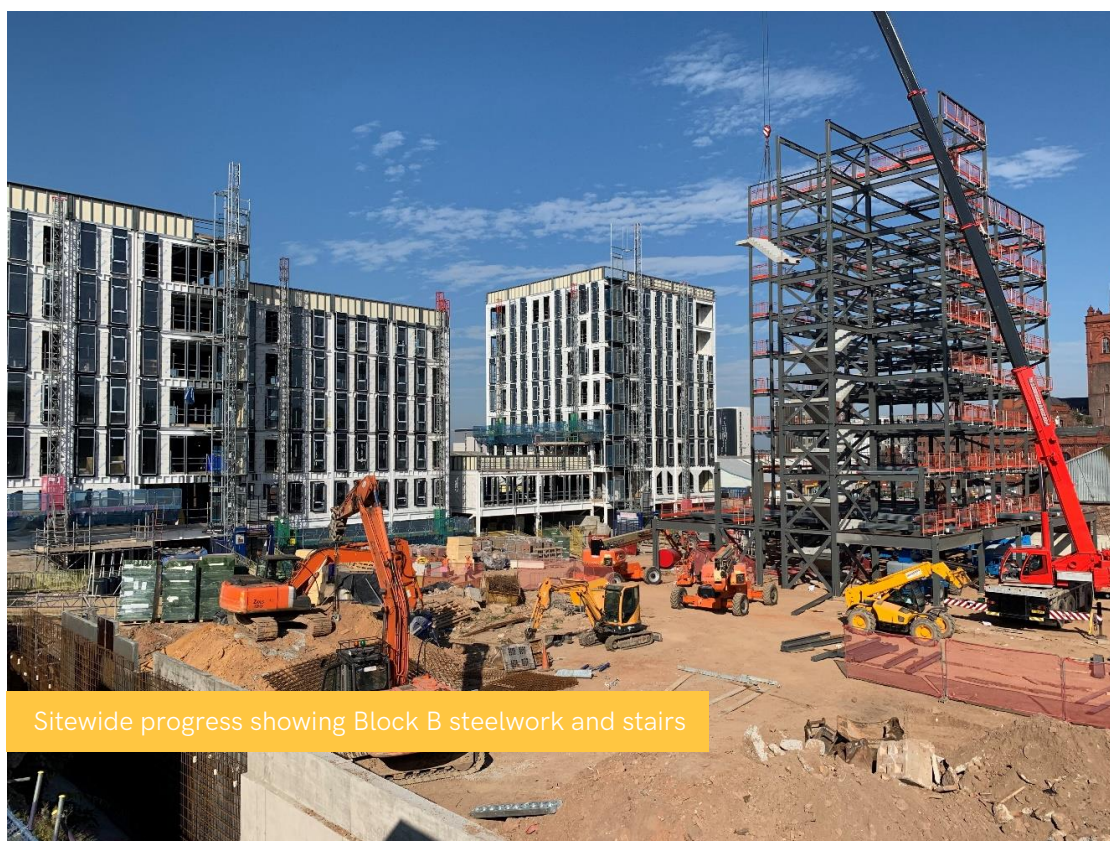
Sitewide progress showing Block B steelwork and stairs