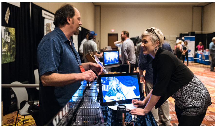
EXHIBIT HALL BOOTH

The Exhibit Hall is located in the Conference Hotel and is the best way to meet Americana industry professionals face-to-face. Purchase of a booth includes 1 conference registration and 2 additional booth worker passes. Music industry related exhibitors only.