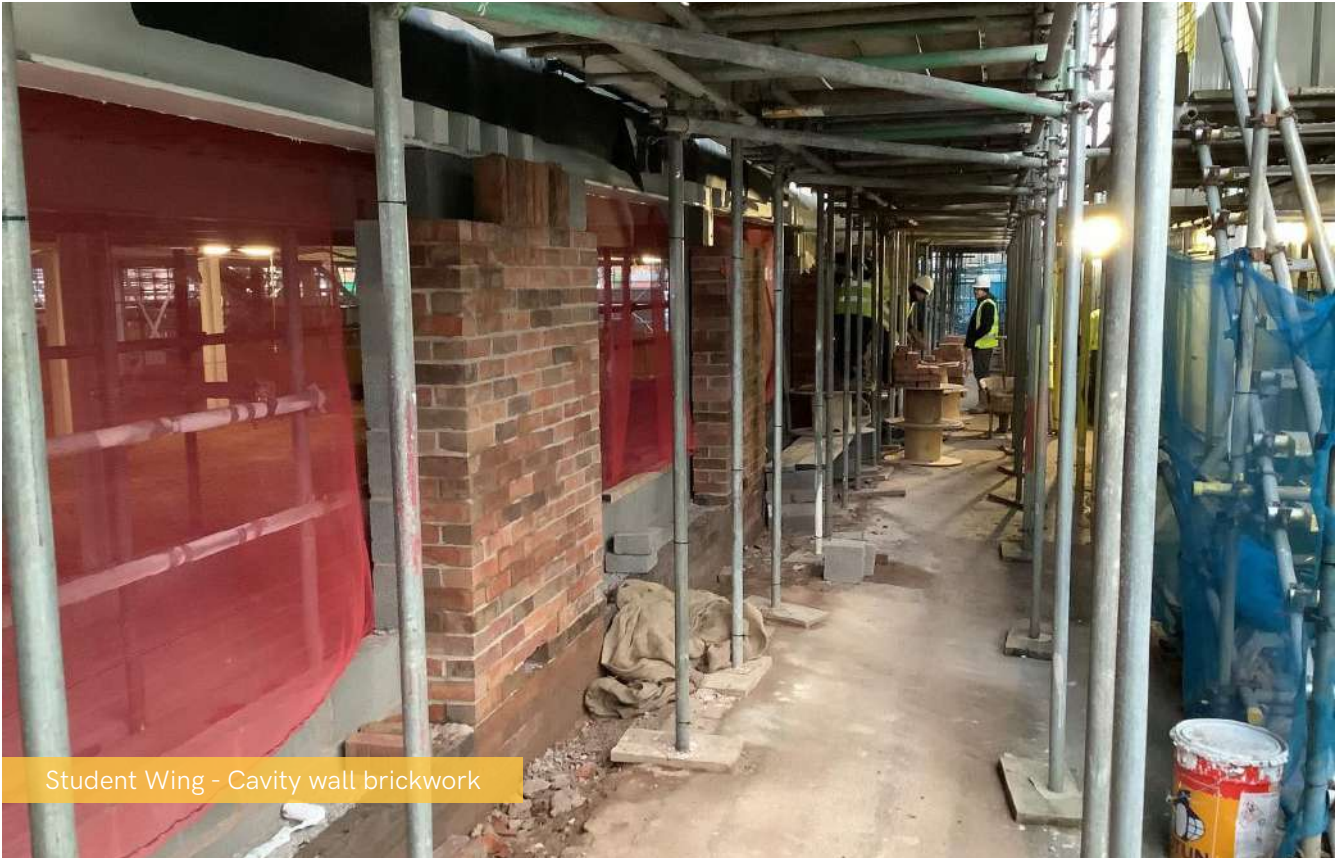
Student Wing - Cavity wall brickwork