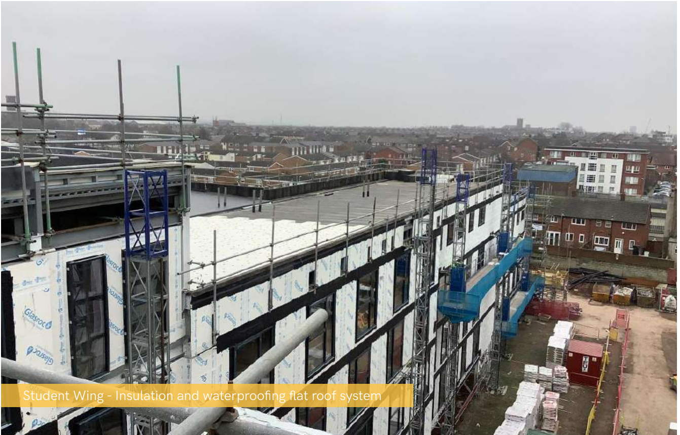
Student Wing - Insulation and waterproofing flat roof system