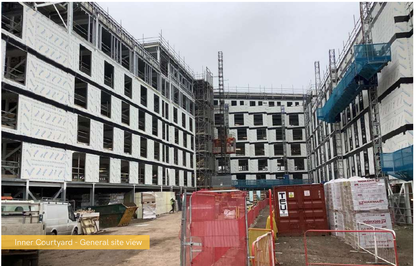
Inner Courtyard - General site view