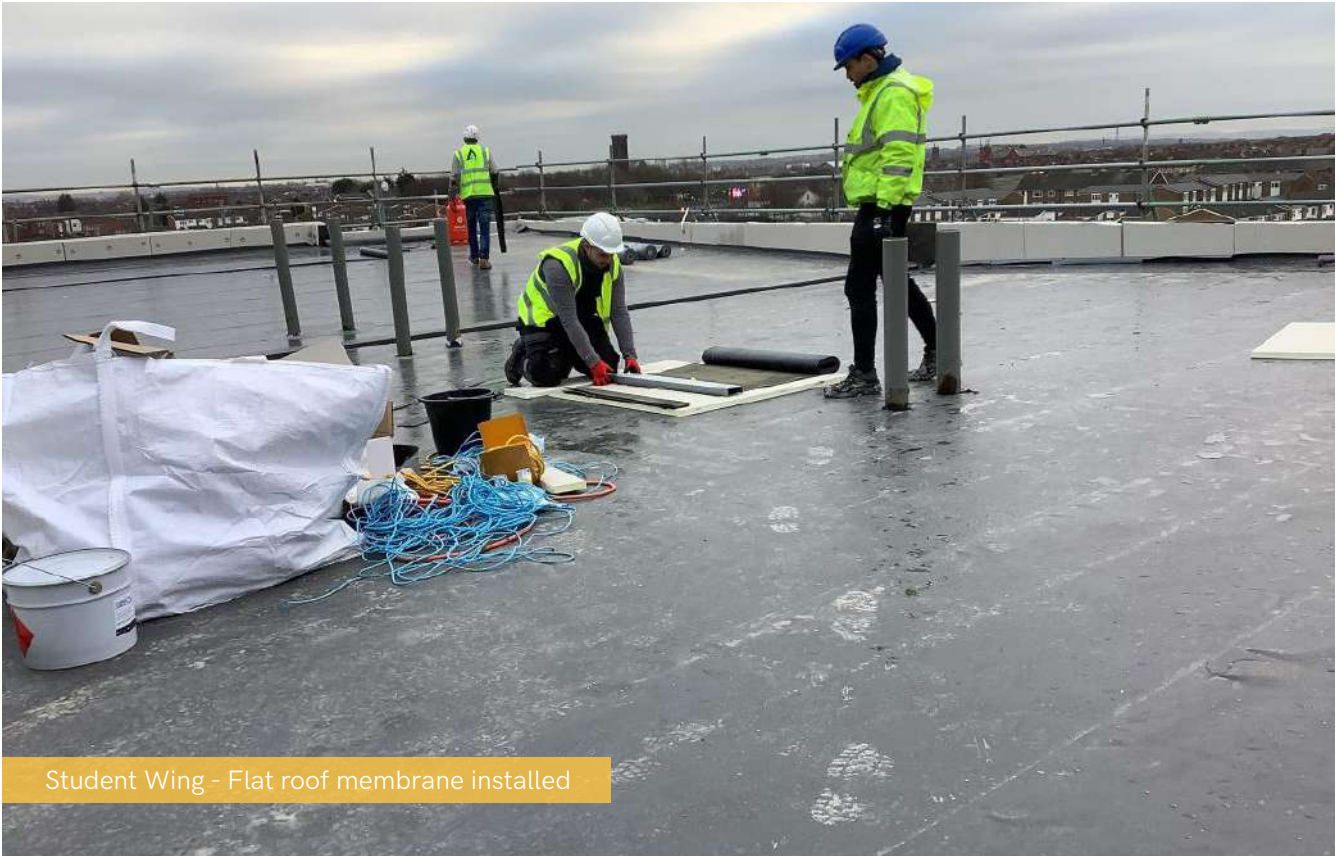
Student Wing - Flat roof membrane installed