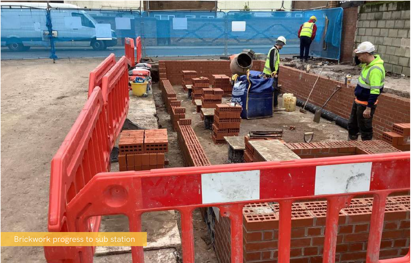
Brickwork progress to sub station