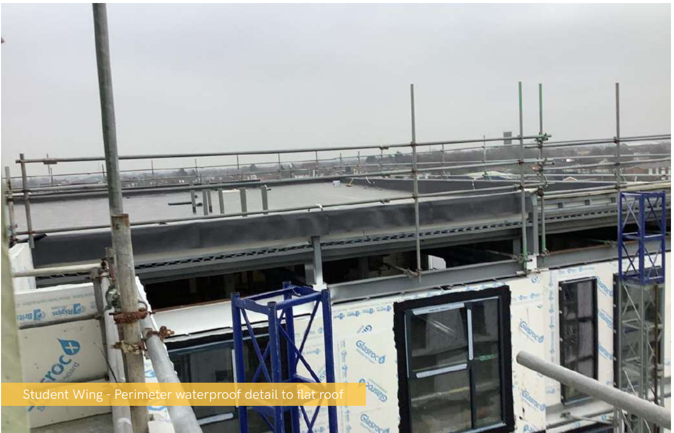
Student Wing - Perimeter waterproof detail to flat roof