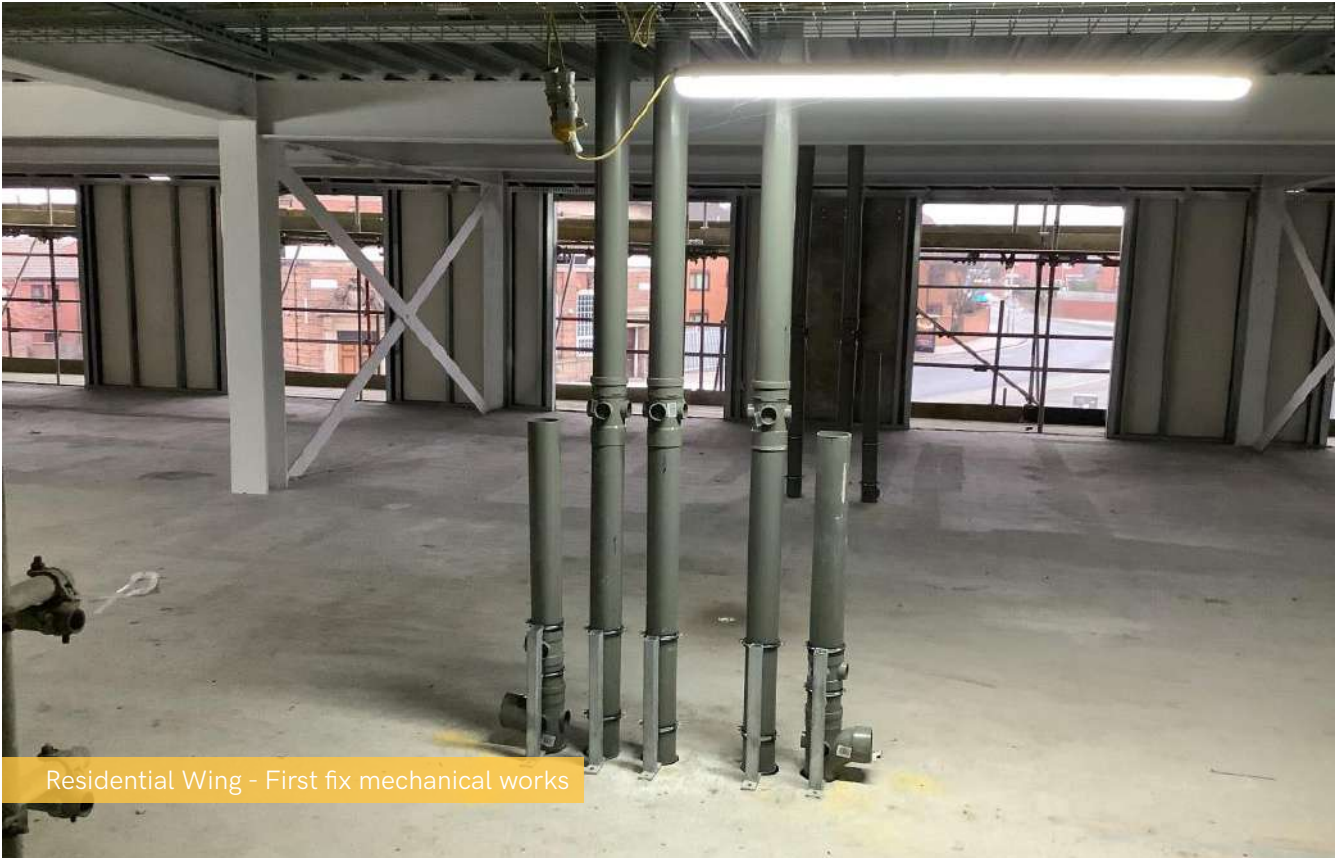
Residential Wing - First fix mechanical works