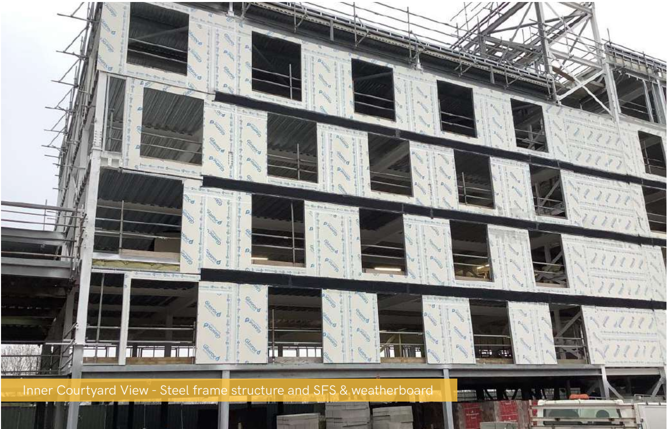
Inner Courtyard View - Steel frame structure and SFS & weatherboard