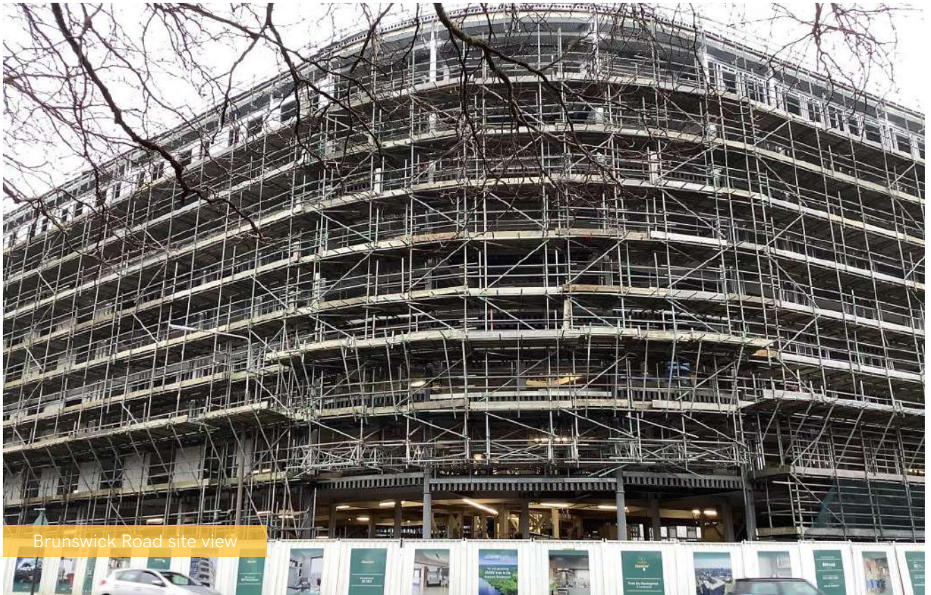
Brunswick Road site view