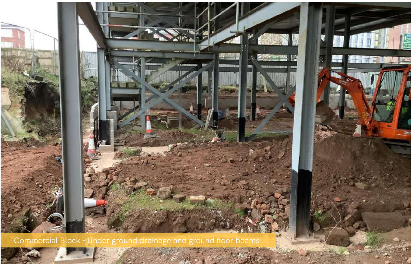
Commercial Block - Under ground drainage and ground floor beams