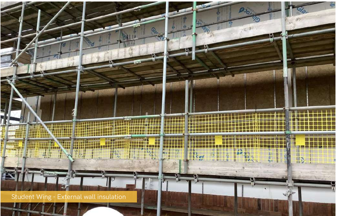
Student Wing - External wall insulation