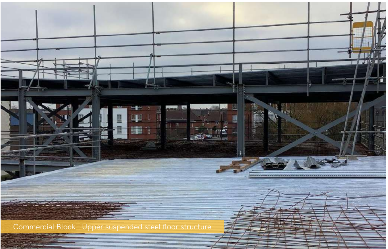
Commercial Block - Upper suspended steel floor structure