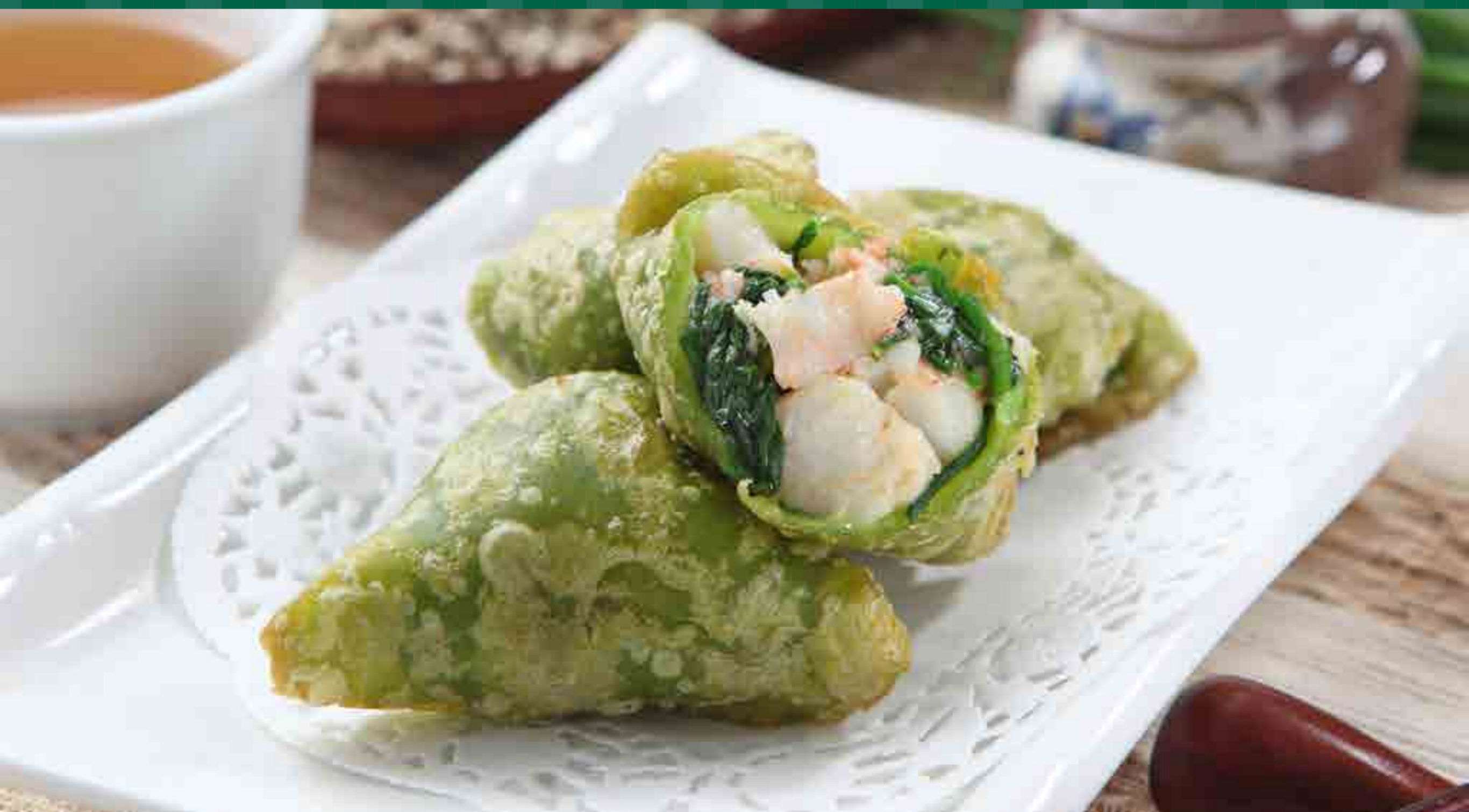
Fried Dumpling Chives