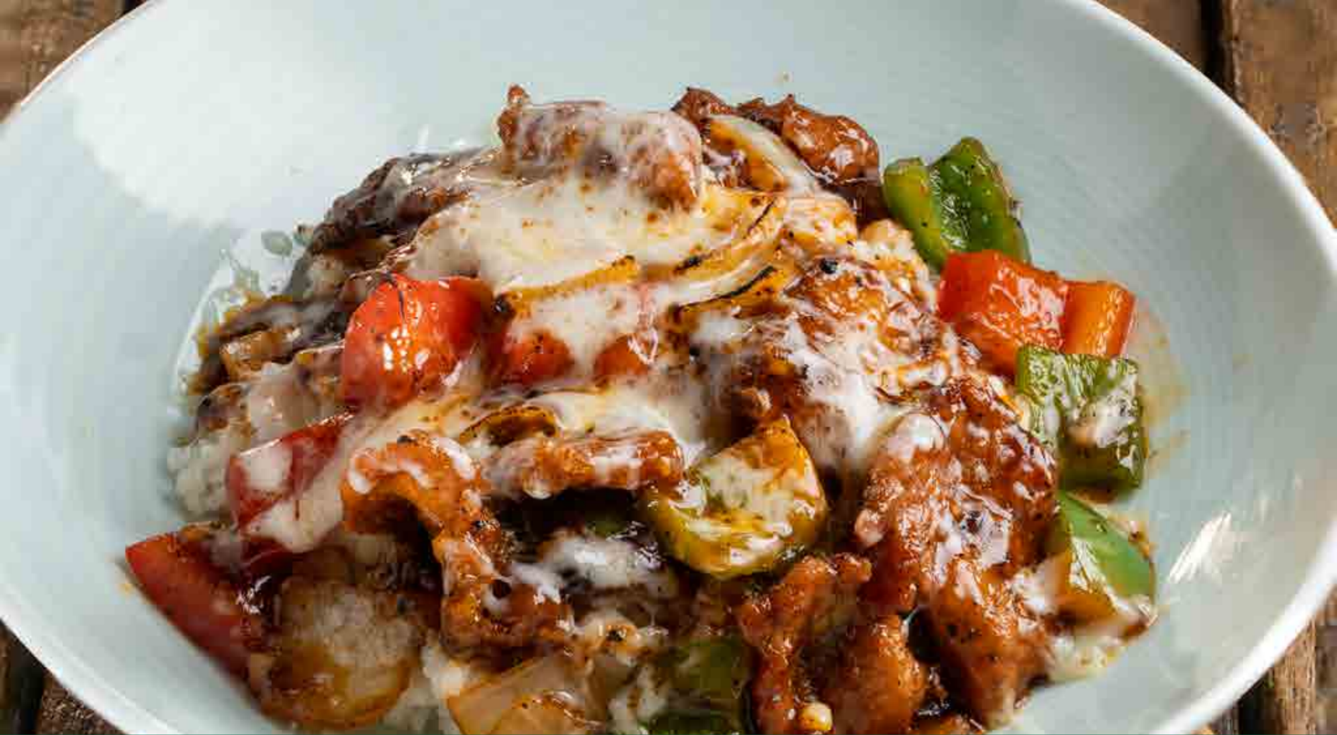
Flamed Rice with Blackpepper Beef 黑椒牛肉焗饭