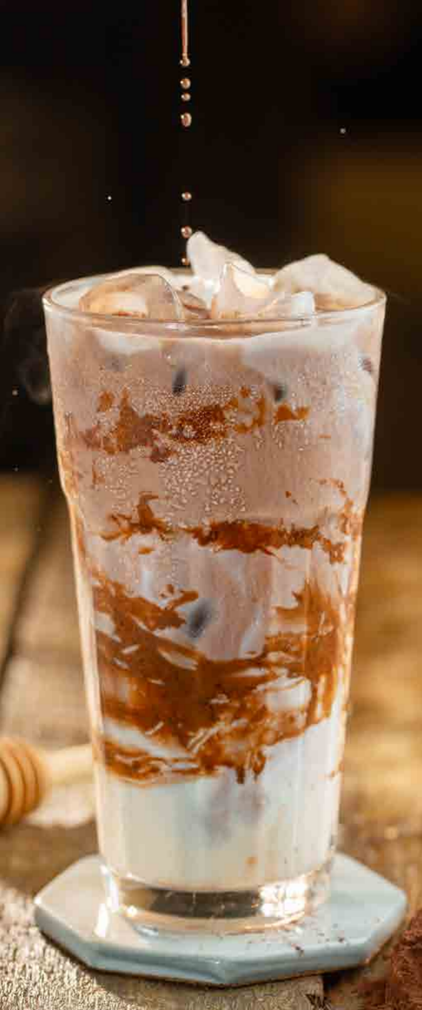
Horlicks Ovomaltine 好立克阿华田