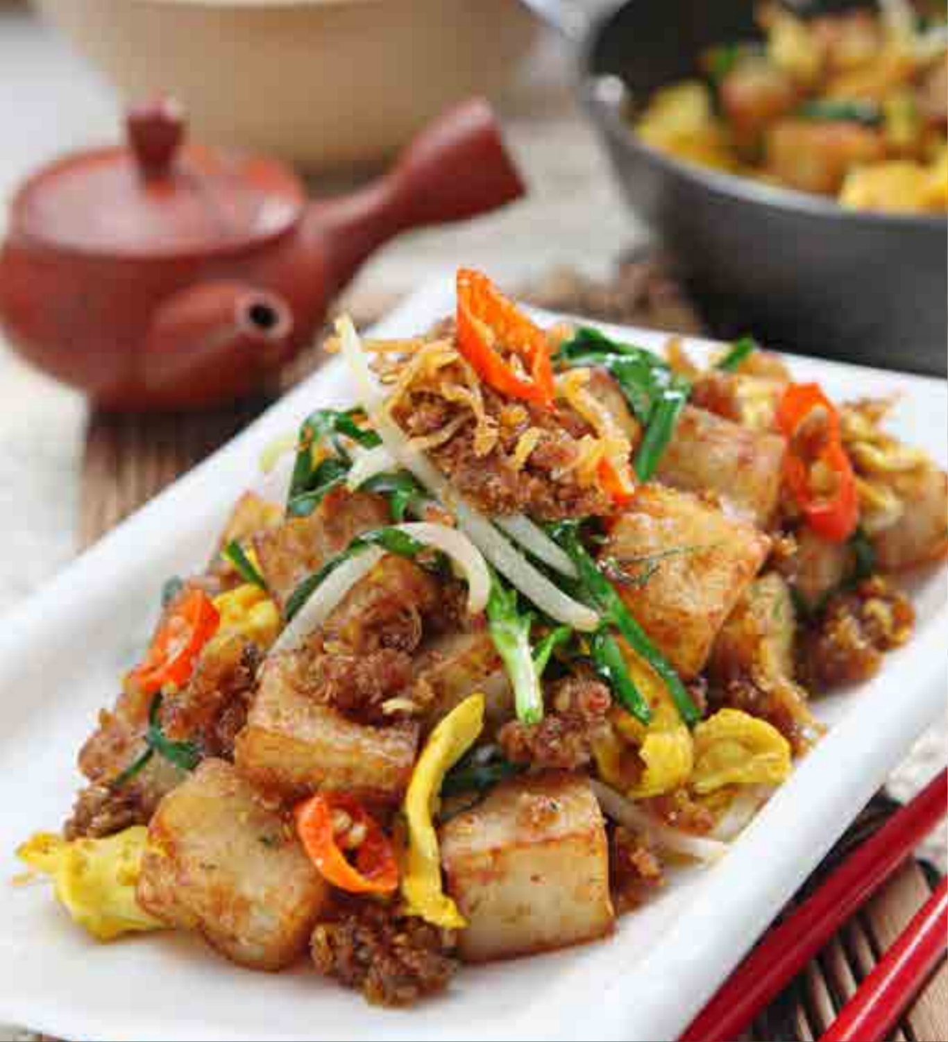
Fried Turnip XO Sauce XO酱炒萝卜糕