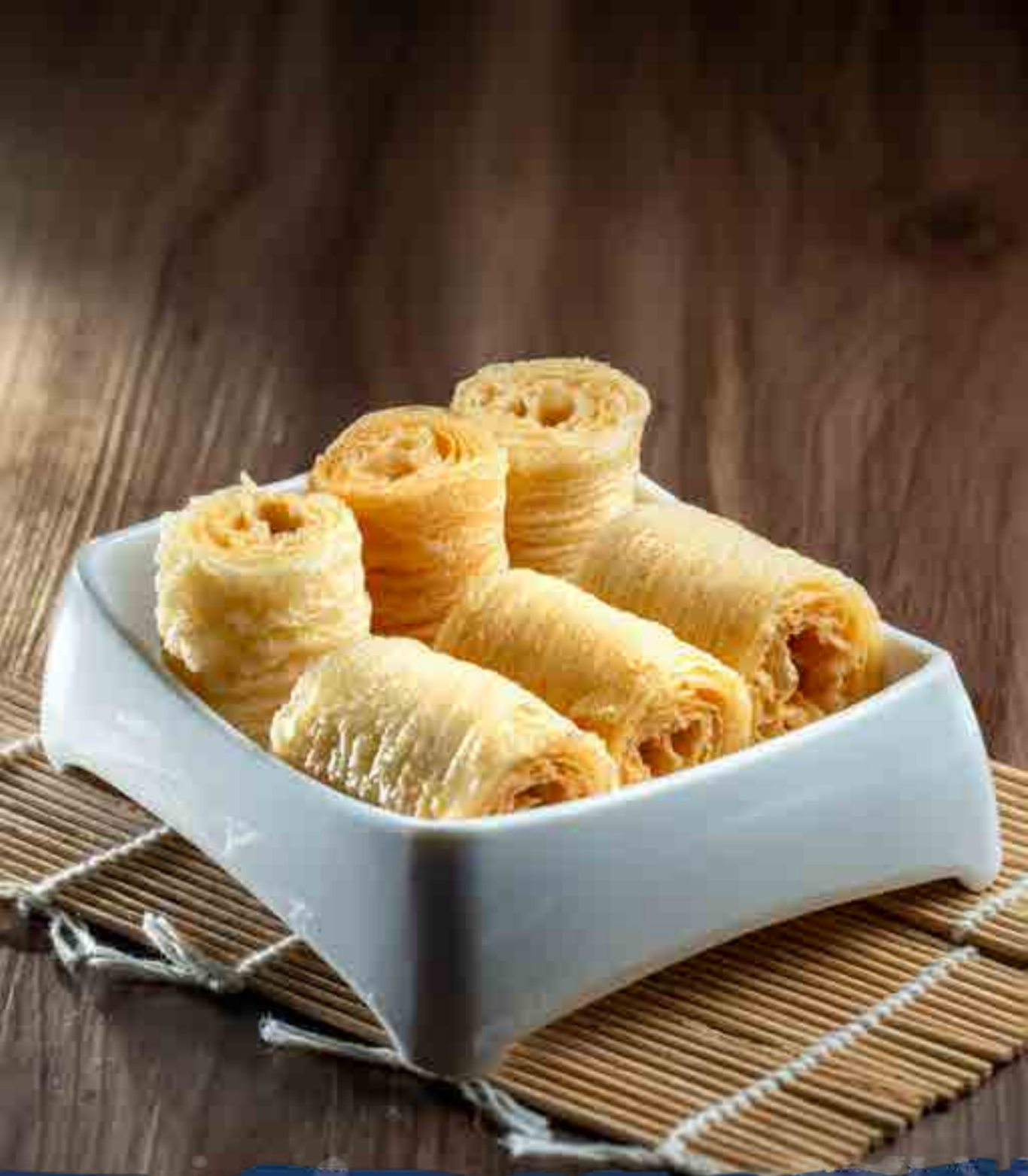
铃铃卷 Kulit Tahu Roll Fried Bean Curd Skin