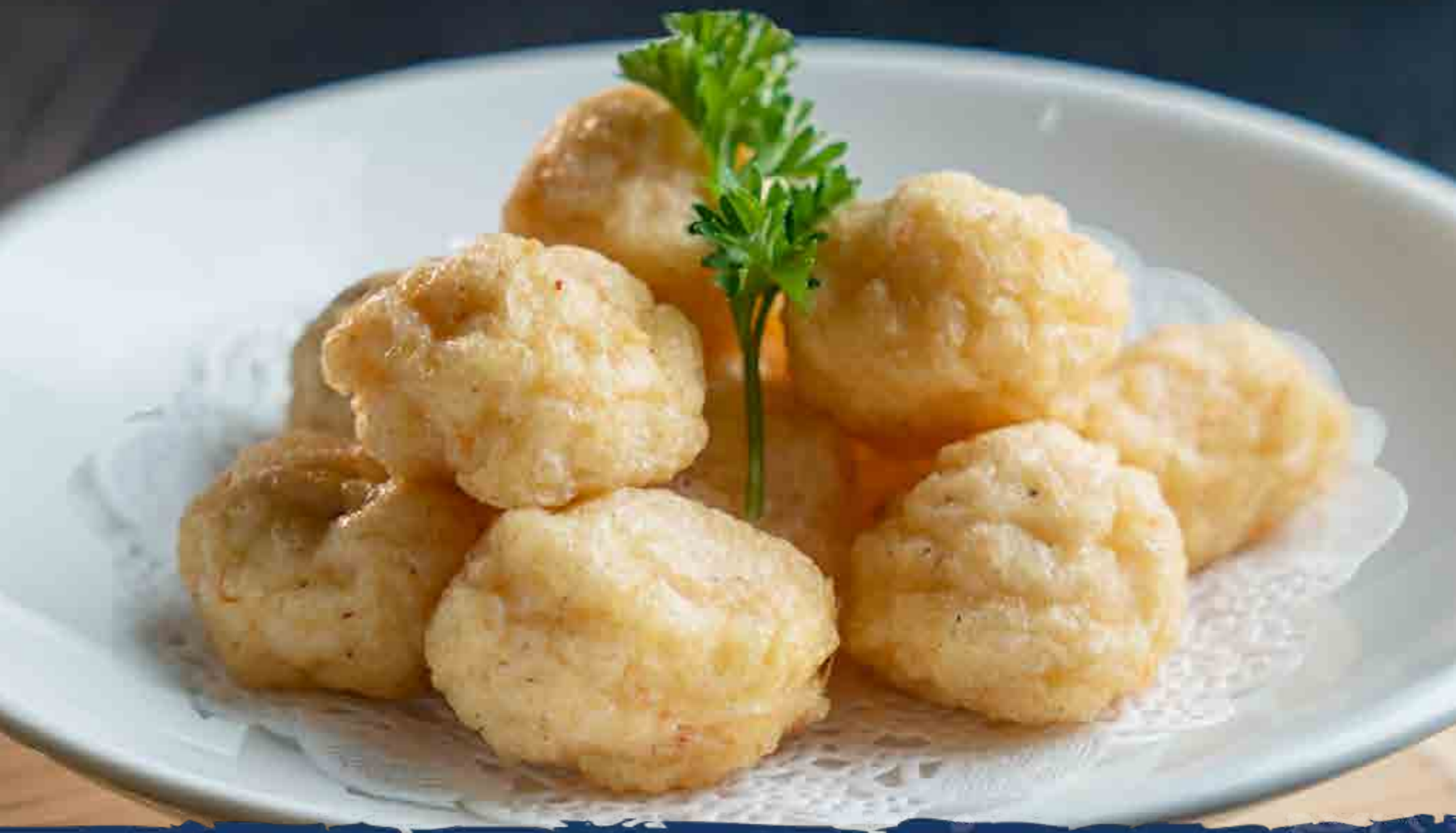
麻辣虾丸 Bola Udang Mala Mala Shrimp Balls