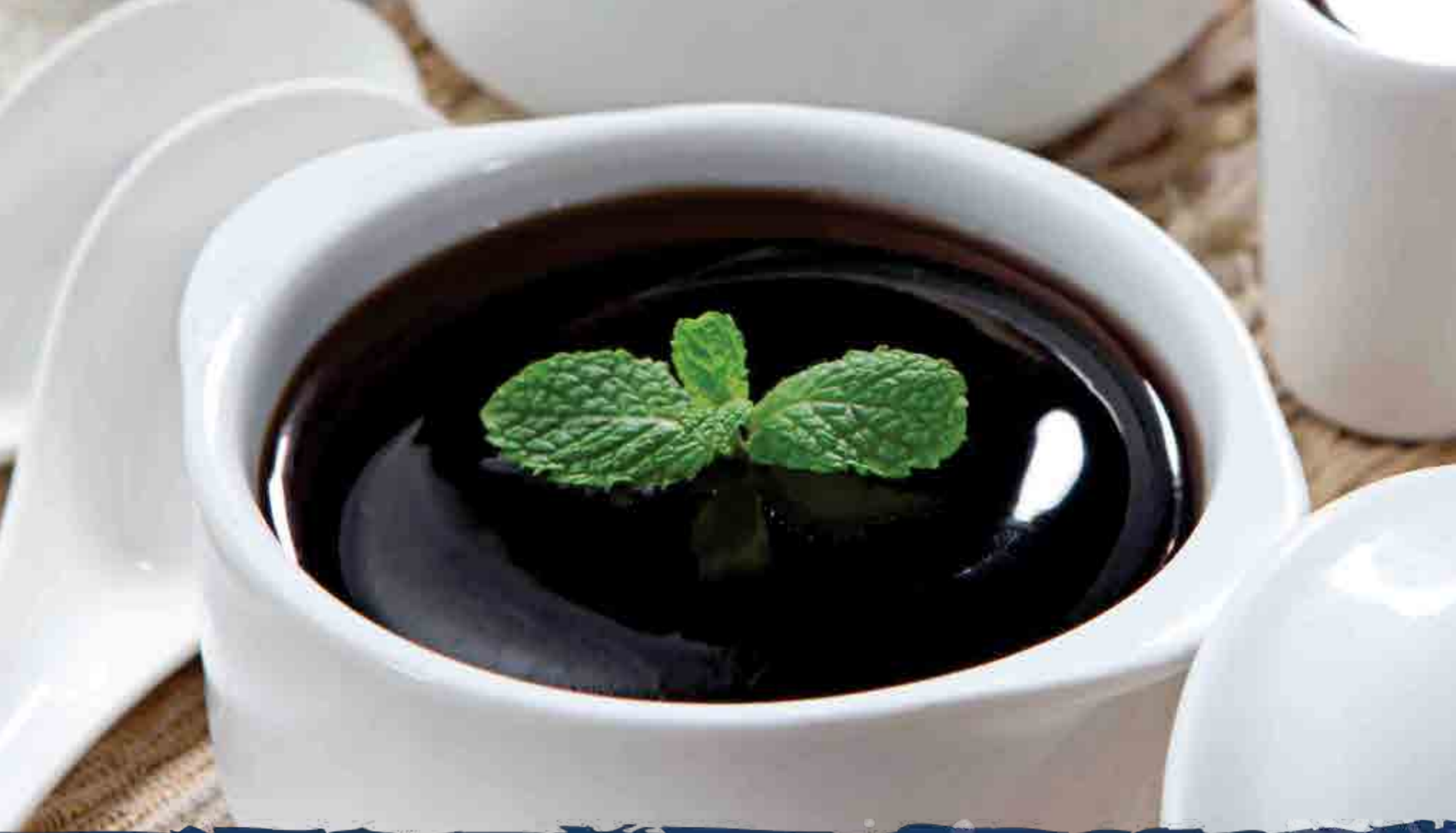
龟苓膏 Qui Ling Qao Chinese Herbal Drink