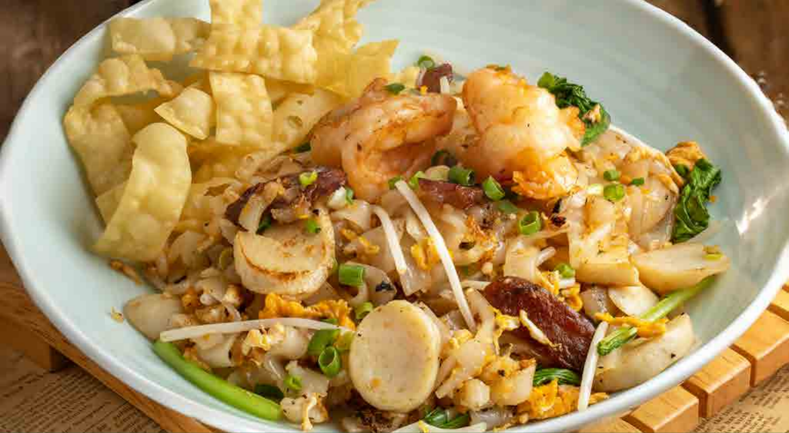
Fried Kway Teow Shrimp 干炒虾粿条