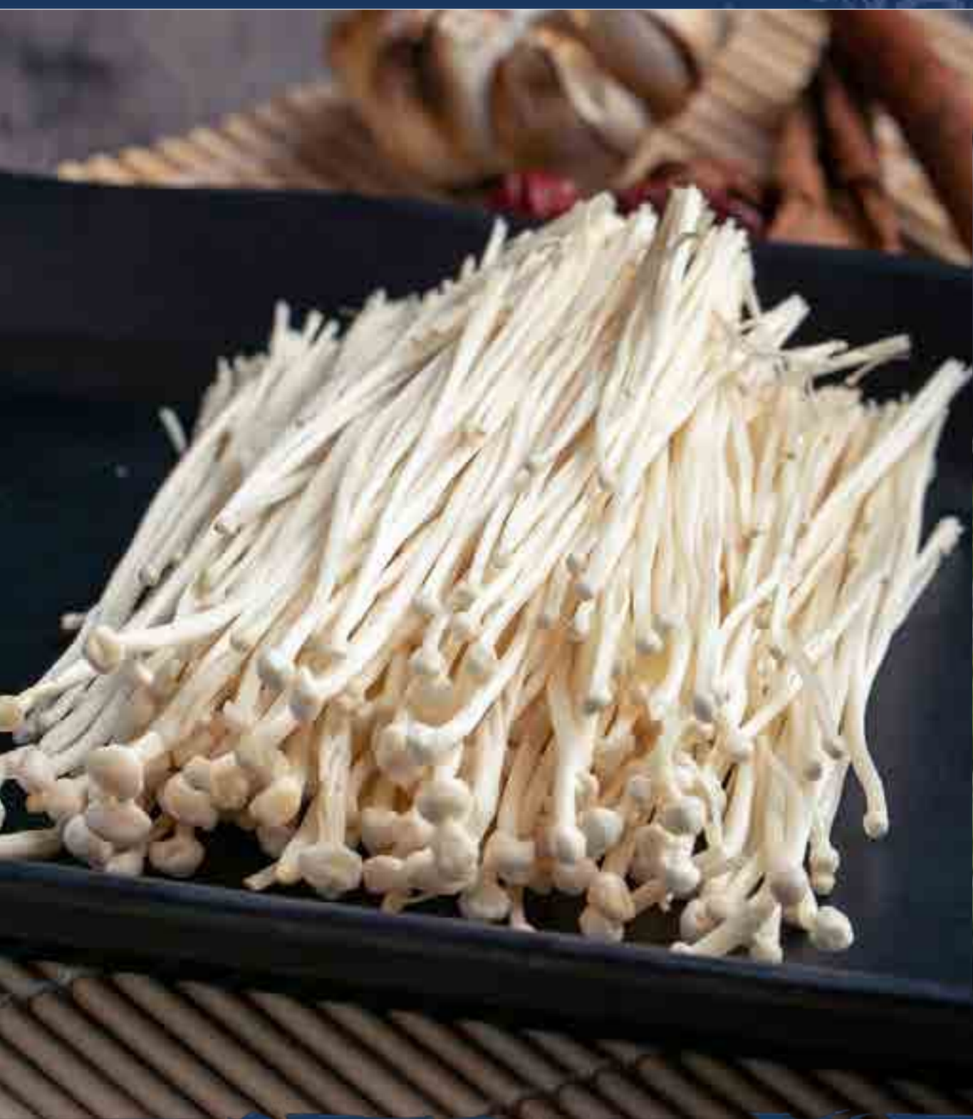
金针菇 Jamur Enoki Enoki Mushroom