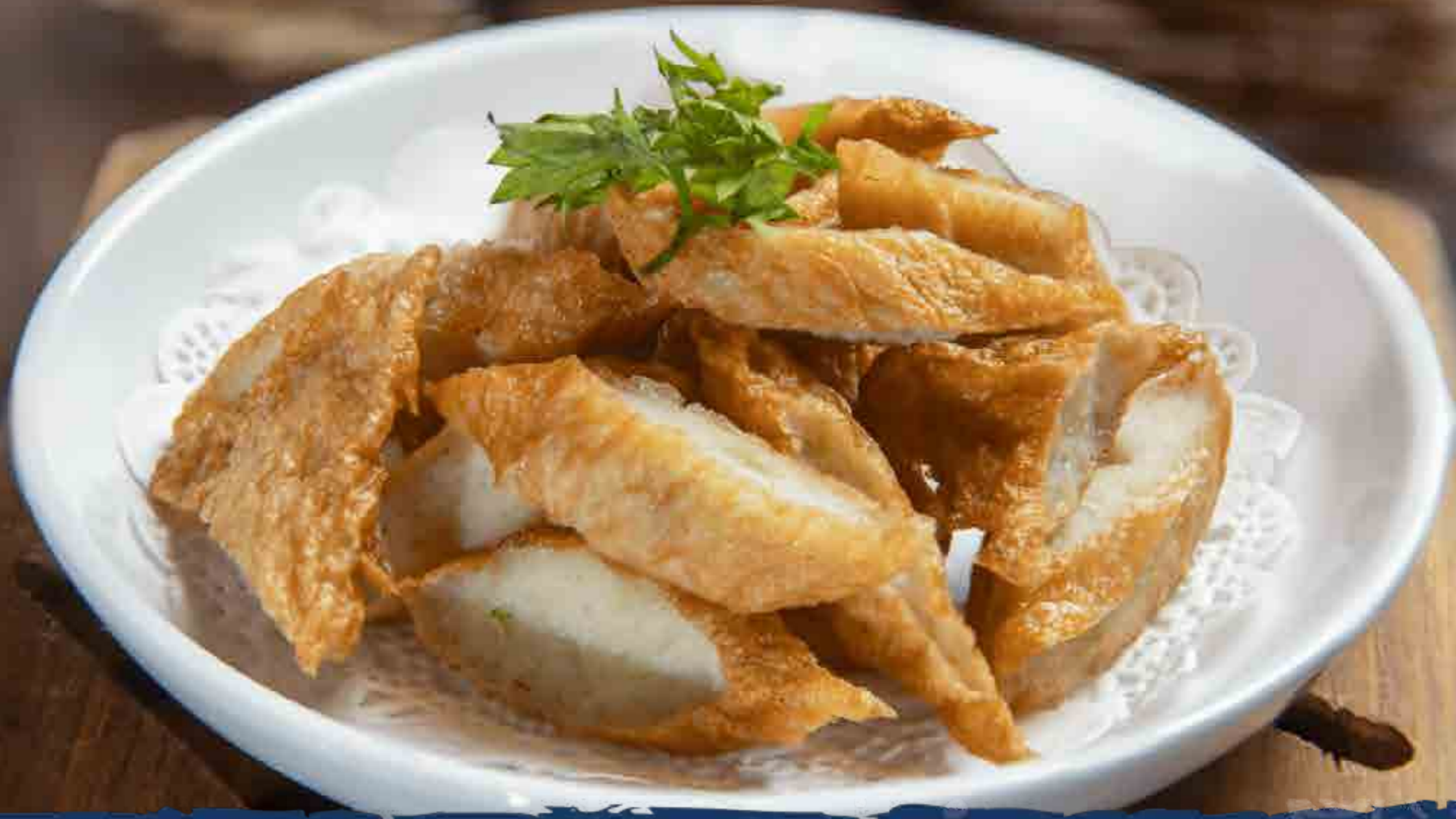
麻辣鱼糕 Otak Otak Mala Mala Grilled Fish Cake