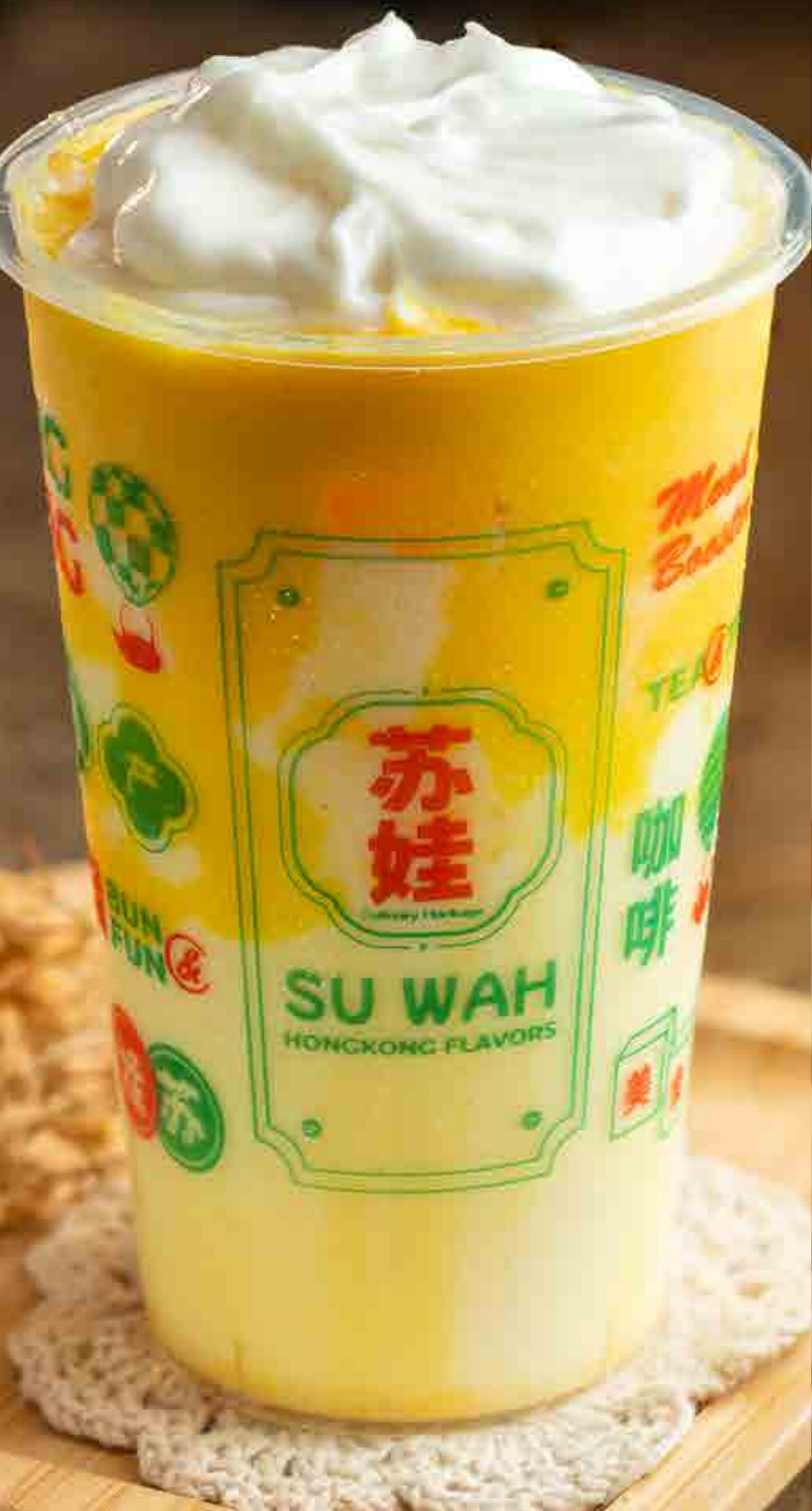
Cheesy Mango Dream 芒果芝芝梦幻