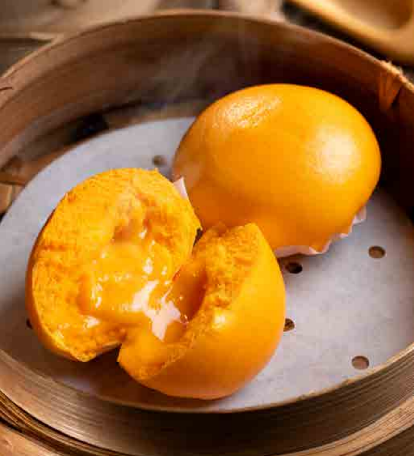
Salted Egg Bao 流沙包