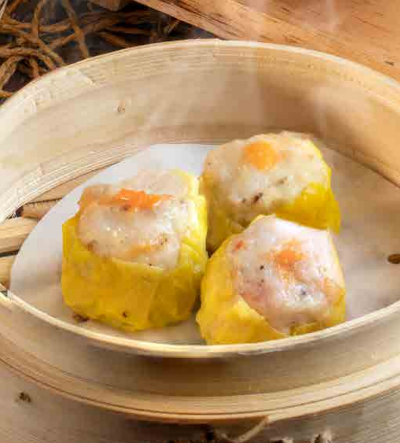
Siu Mai 烧卖