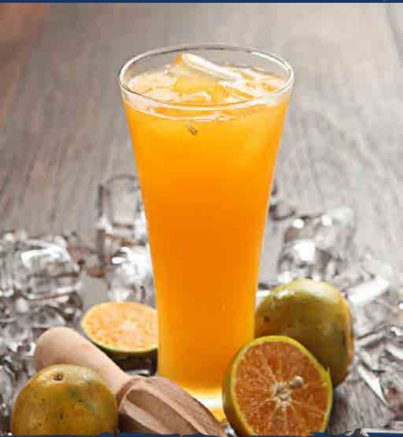
鲜橙汁 Jeruk Peras Fresh Orange Juice