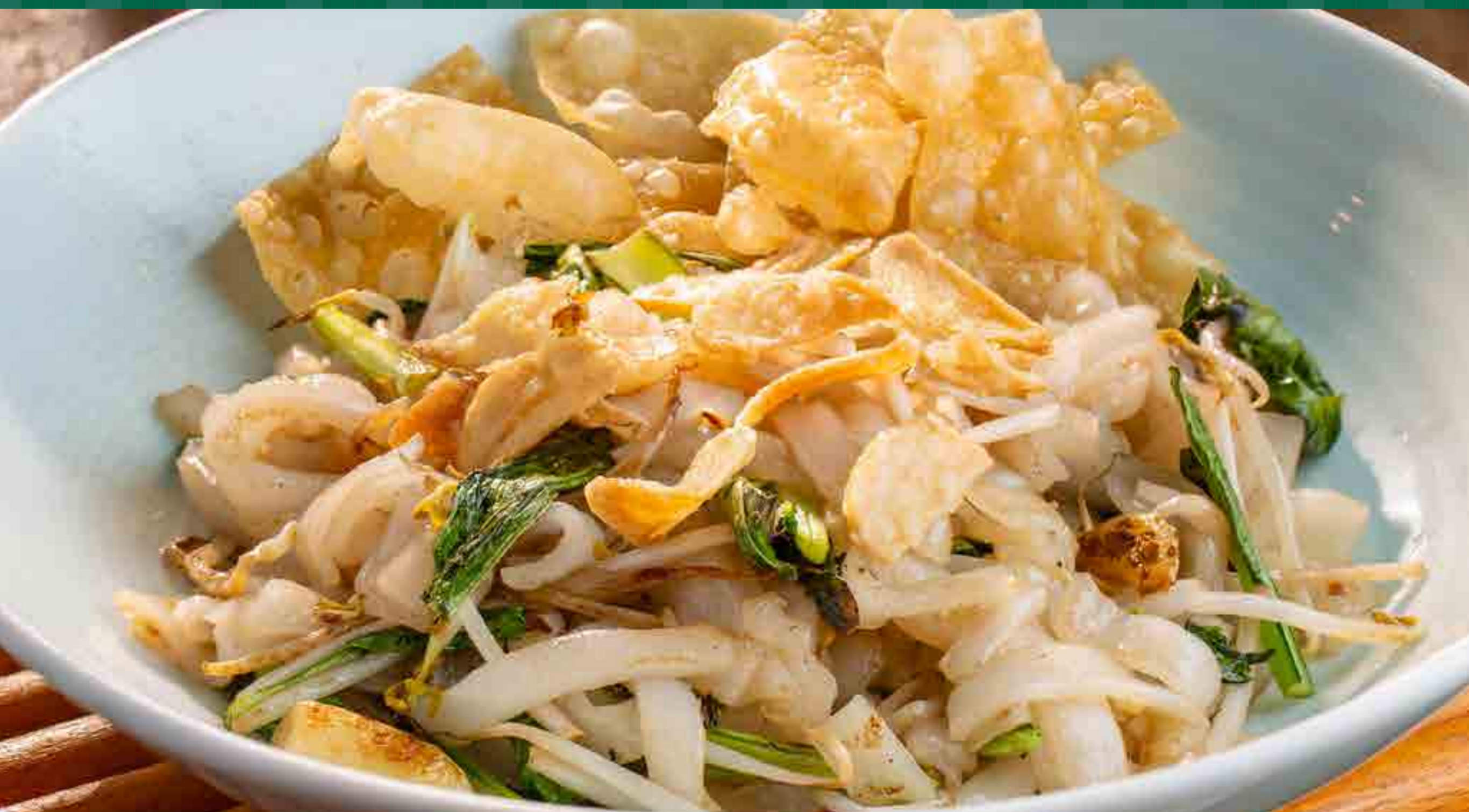
Fried Kway Teow Plain 炒貴刁(清炒)