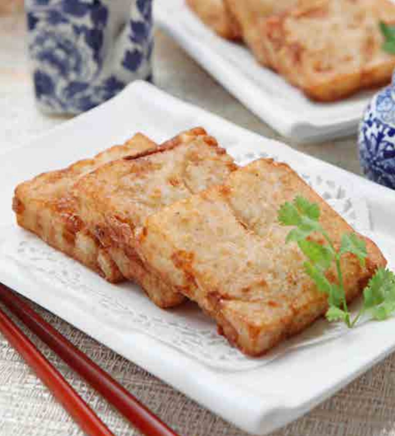
Fried Turnip Cake