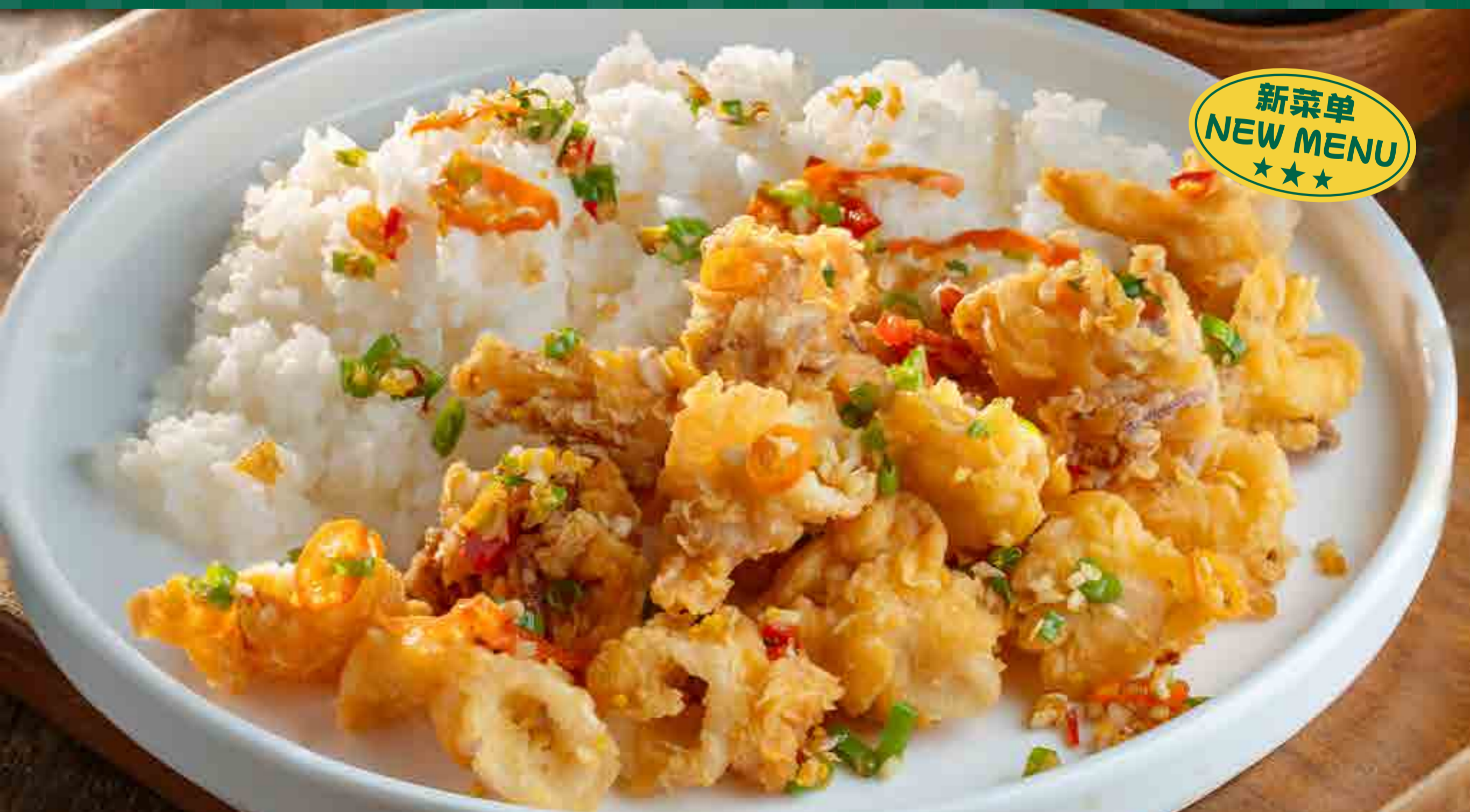
Salt & Pepper Squid Rice