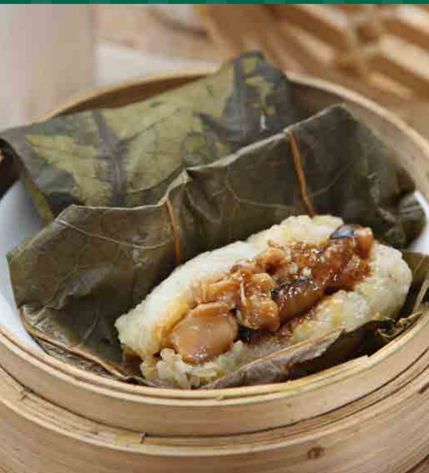
Lo Mai Gai 糯米鸡