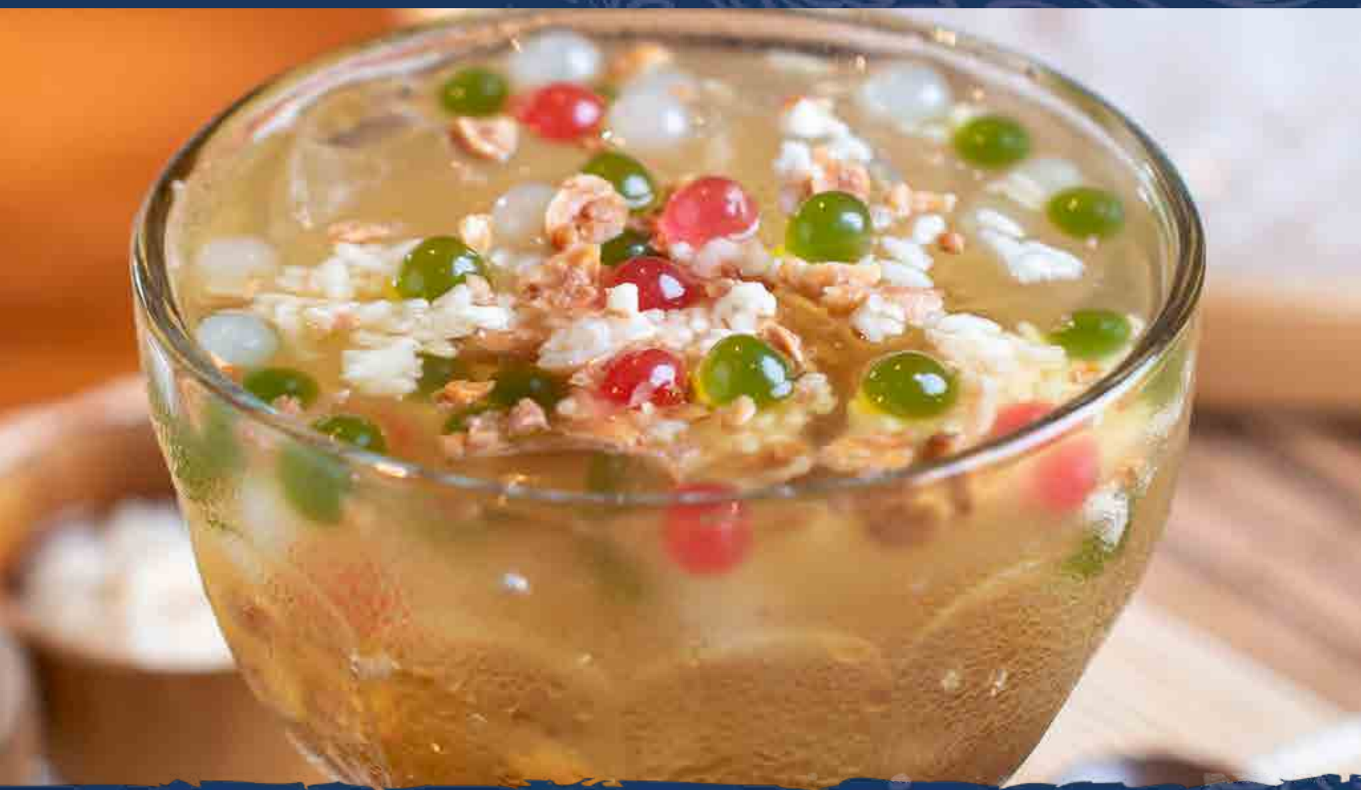
四川冰粉 Bing Fen Chengdu Jelly Dessert