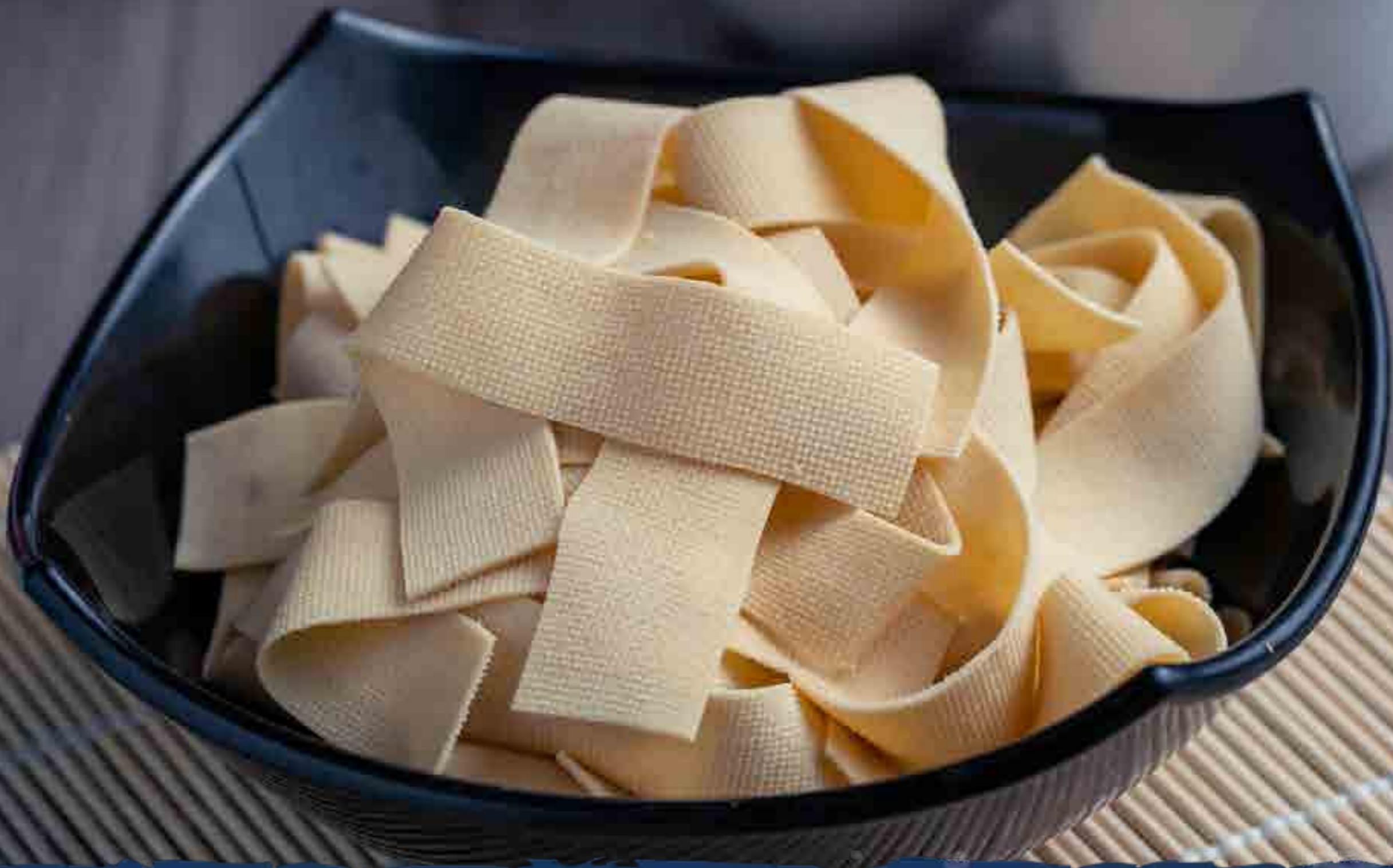
鲜豆皮 Kulit Tahu Fresh Tofu Skin