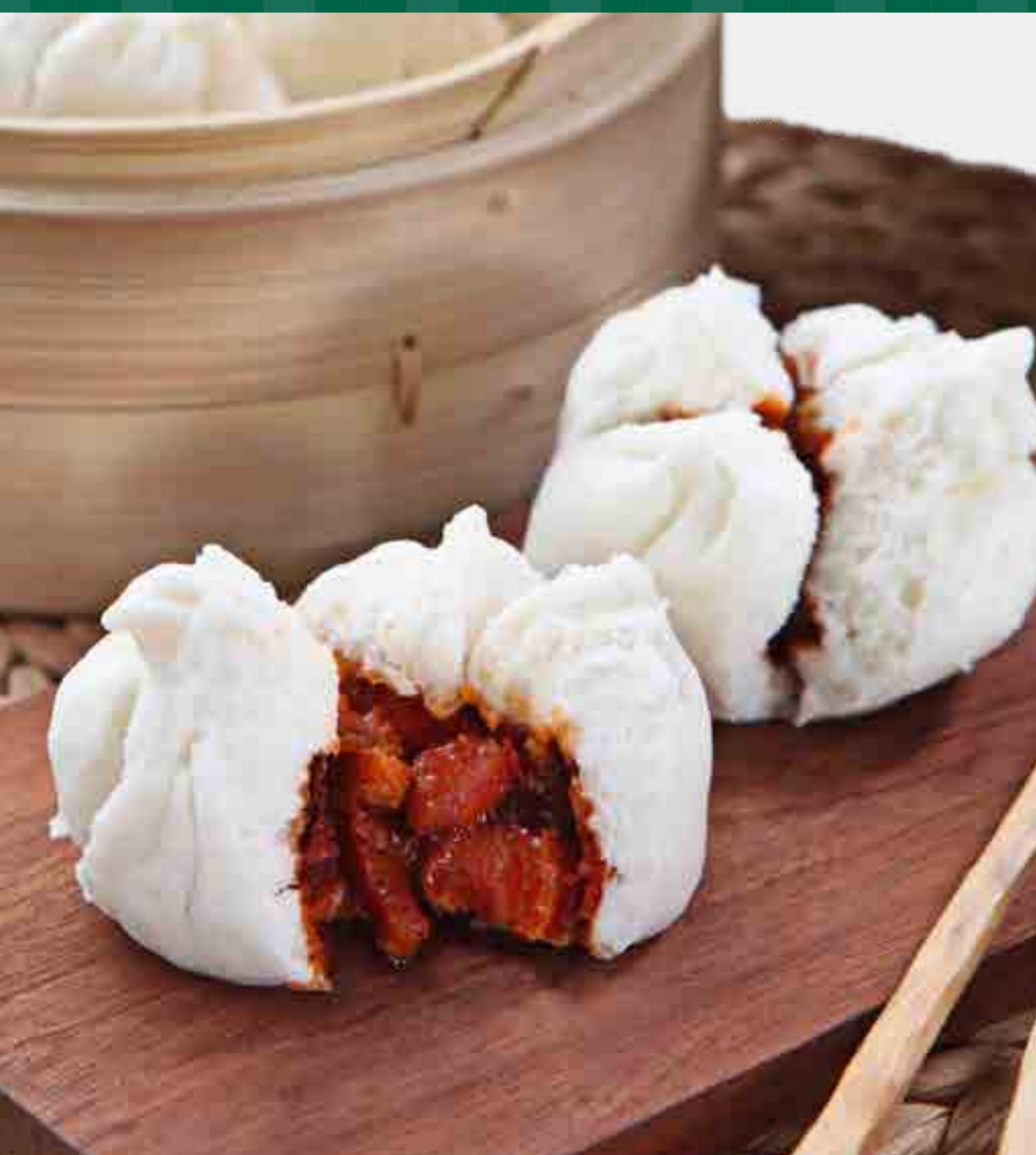
Char Siew Pao 叉烧包