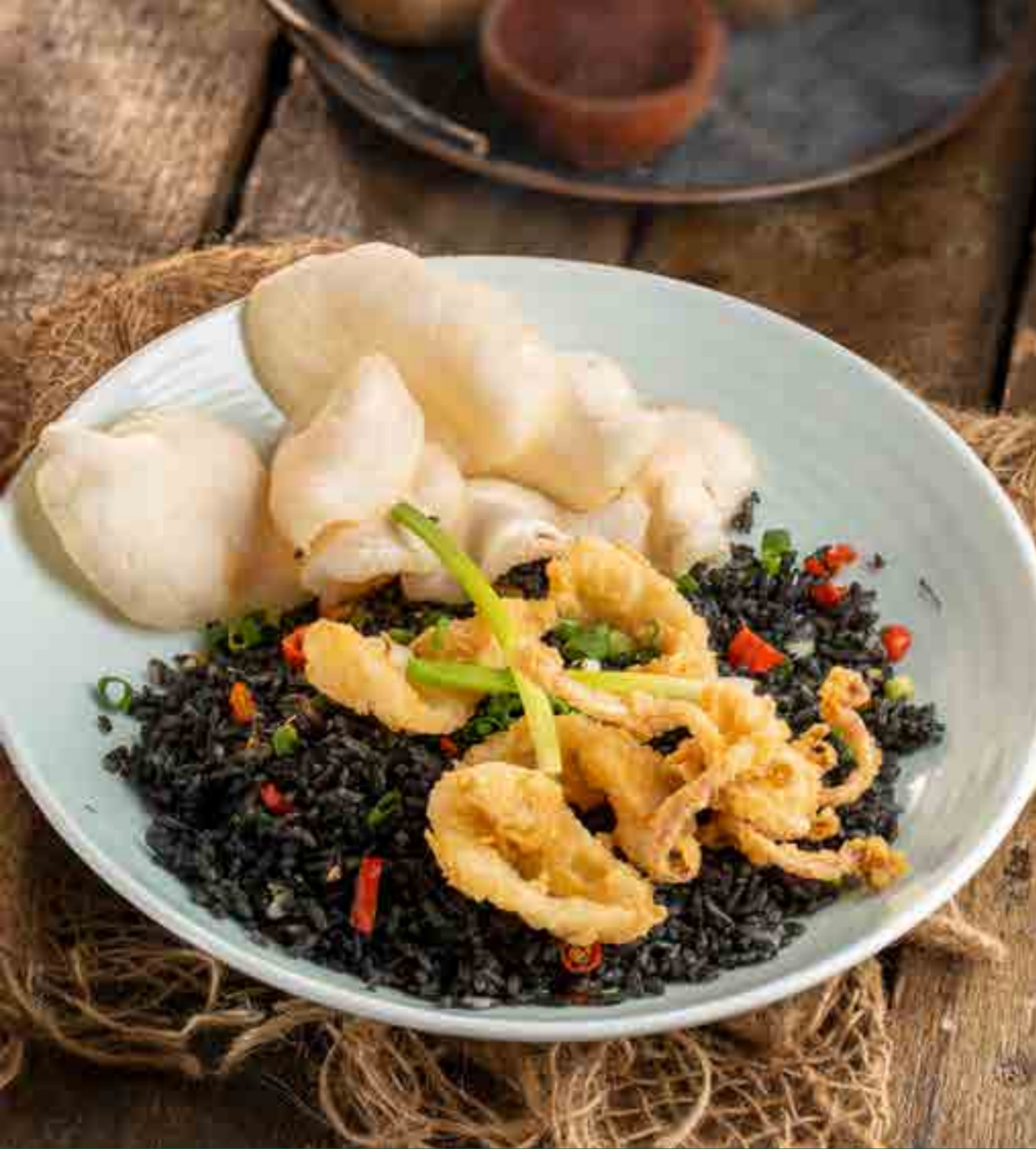
Squid Ink Fried Rice with Calamari