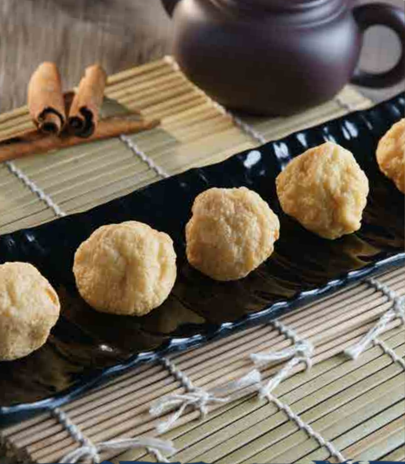
黄尾鱼丸 Bakso Tahu Suji (5 pcs) Fried Fish Ball