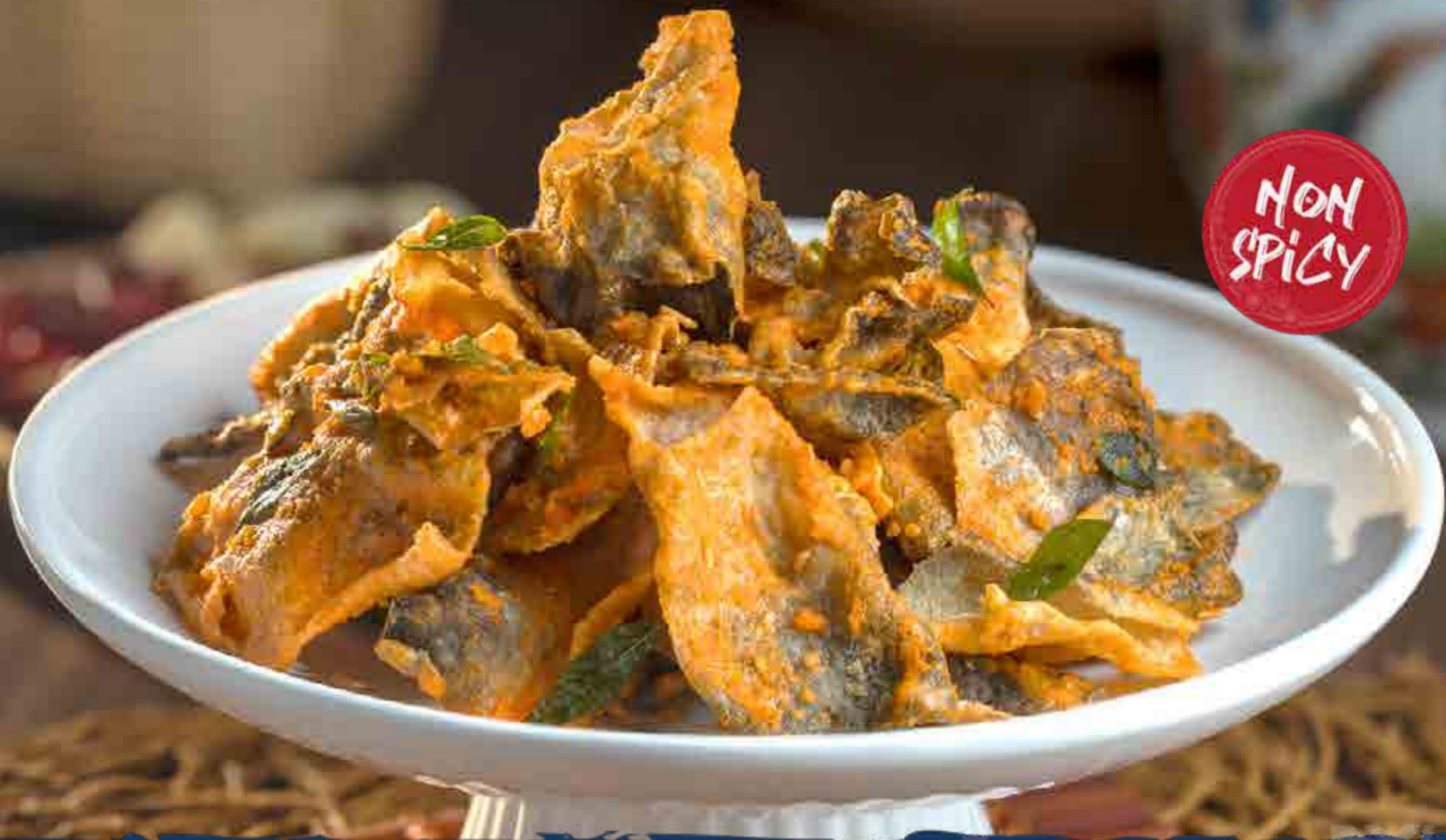
咸蛋黄鱼皮 Kulit Ikan Goreng Telur Asin Crispy Salted Egg Fish Skin