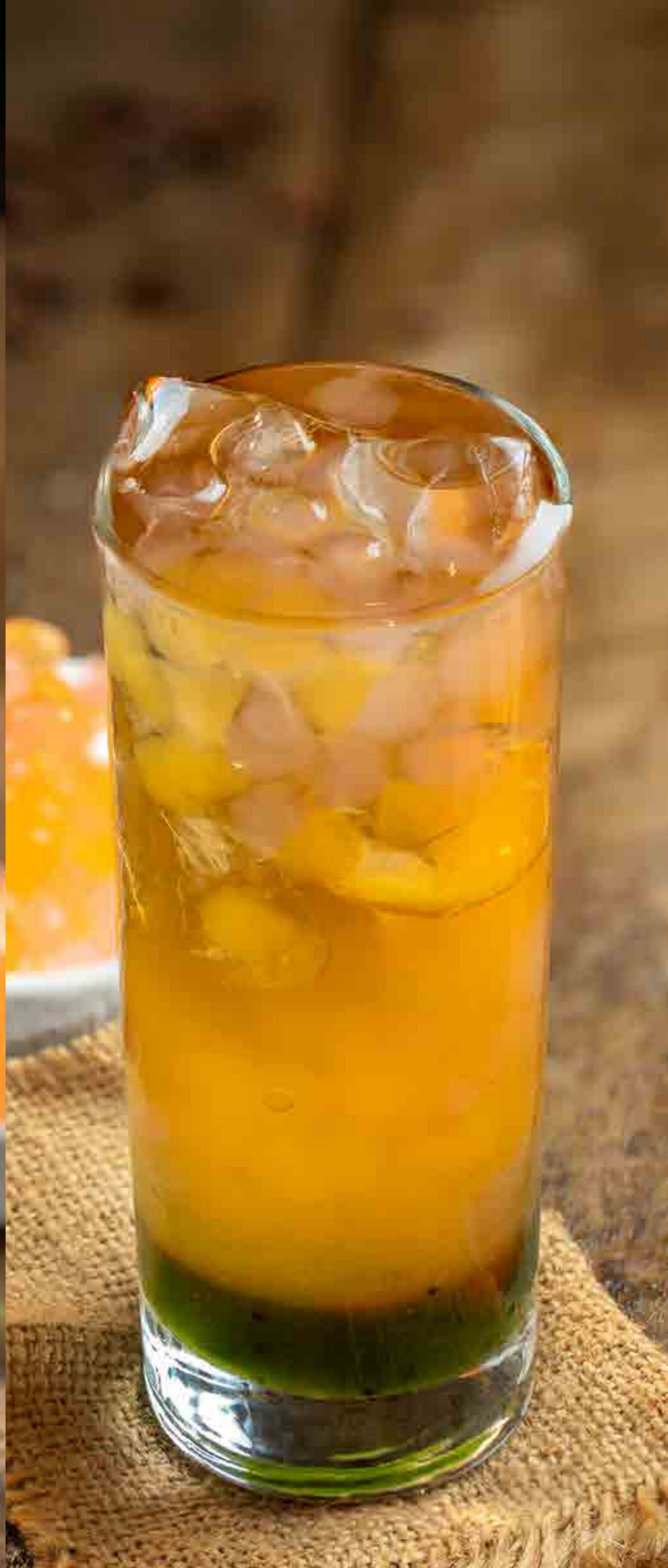
Blossom Kiwi Tea 奇异果花漾茶