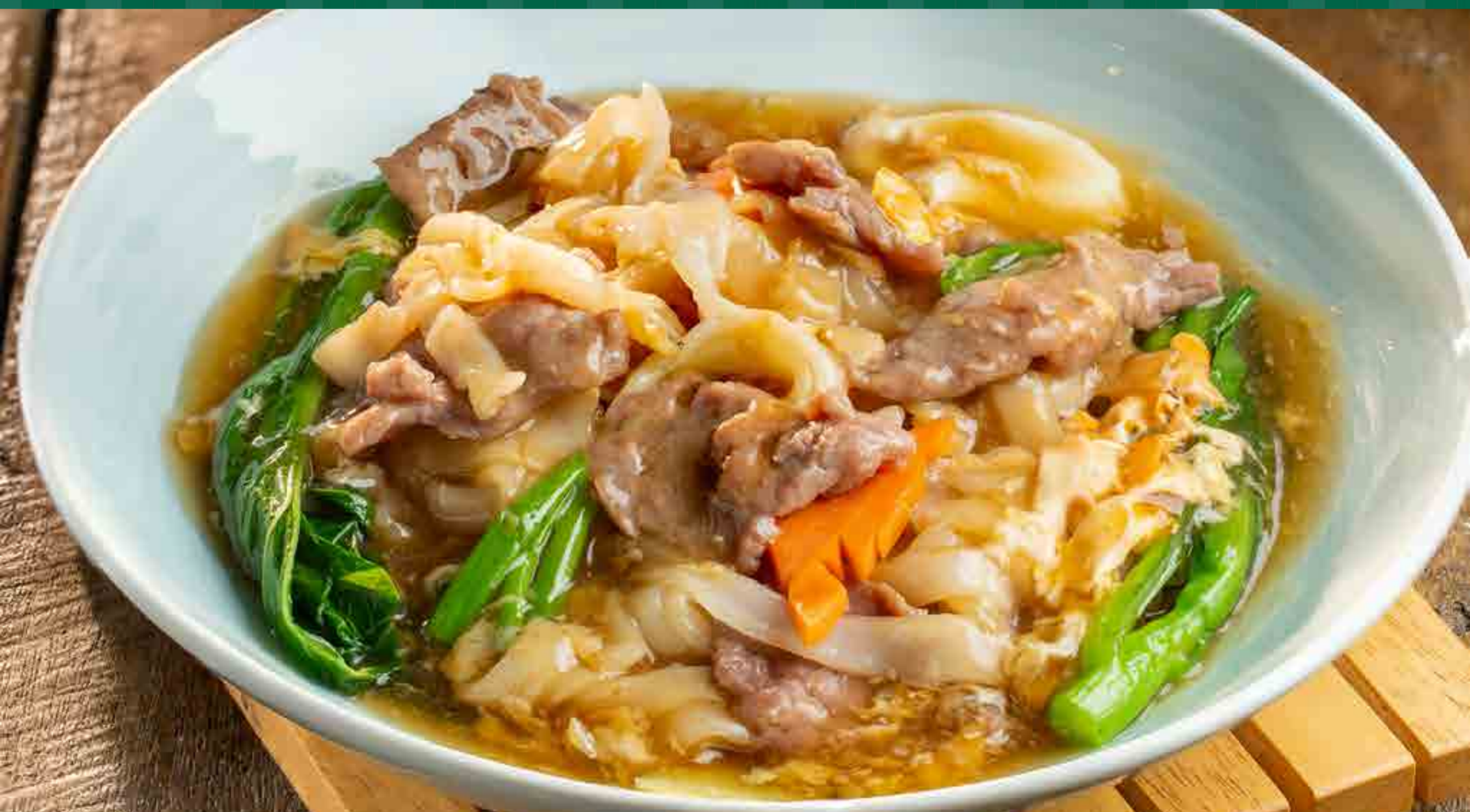
Beef Hor Fun 手工招牌牛肉粿条