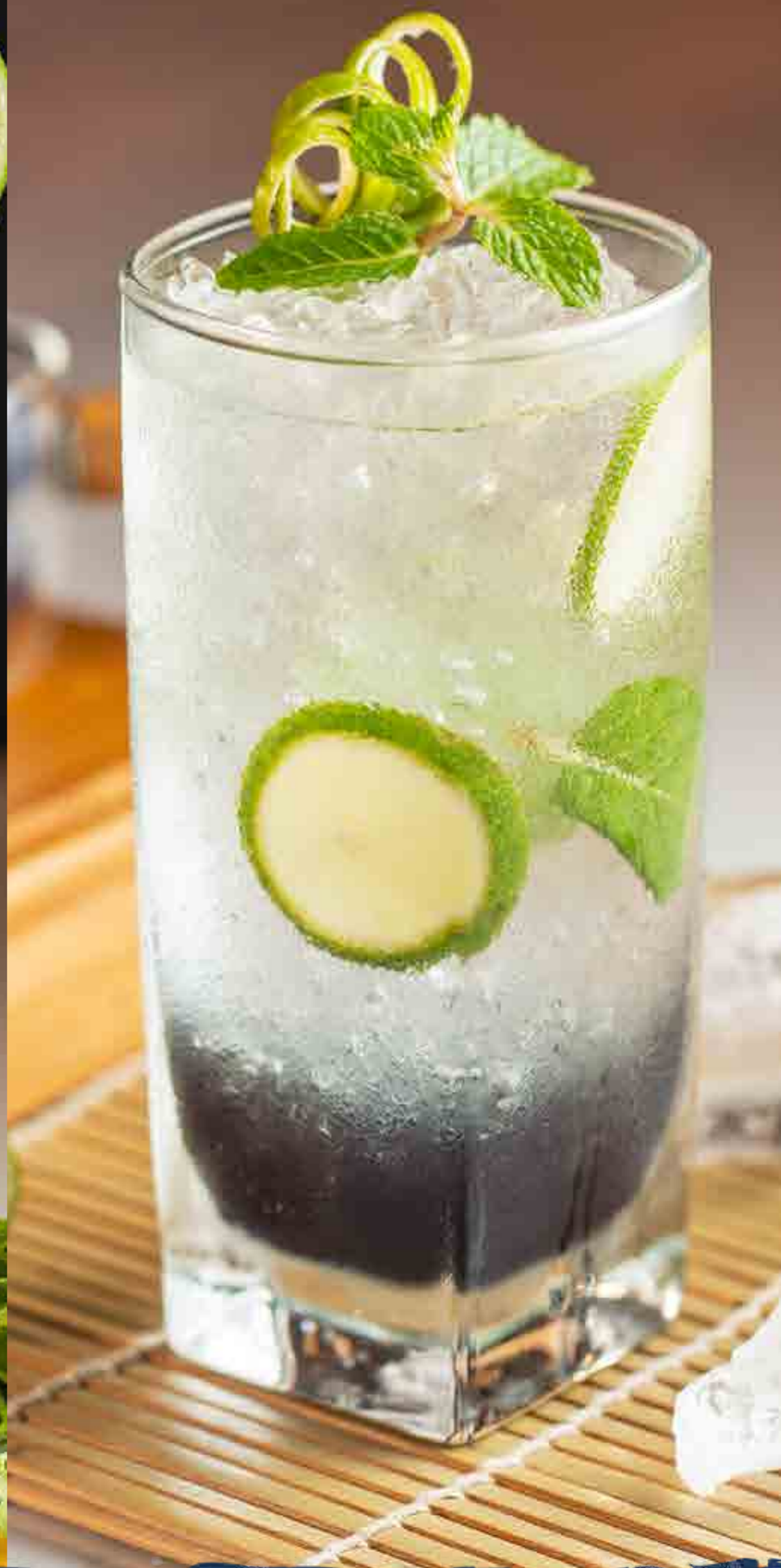
Blueberry Mojito Blueberry & Soda Water