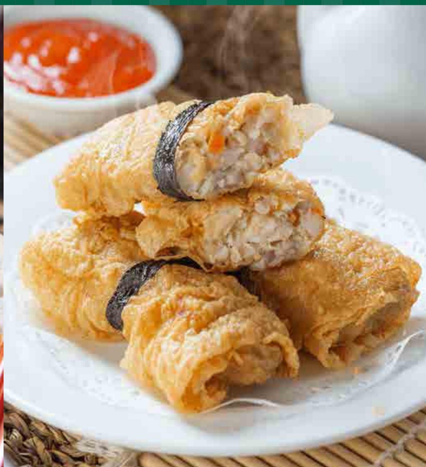
Fried Spring Roll 炸春卷