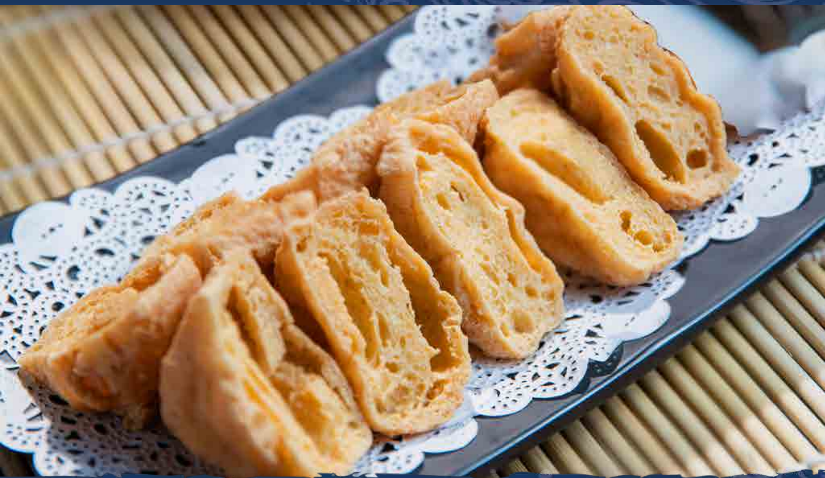
脆豆腐 Tahu Pong Fried Tofu