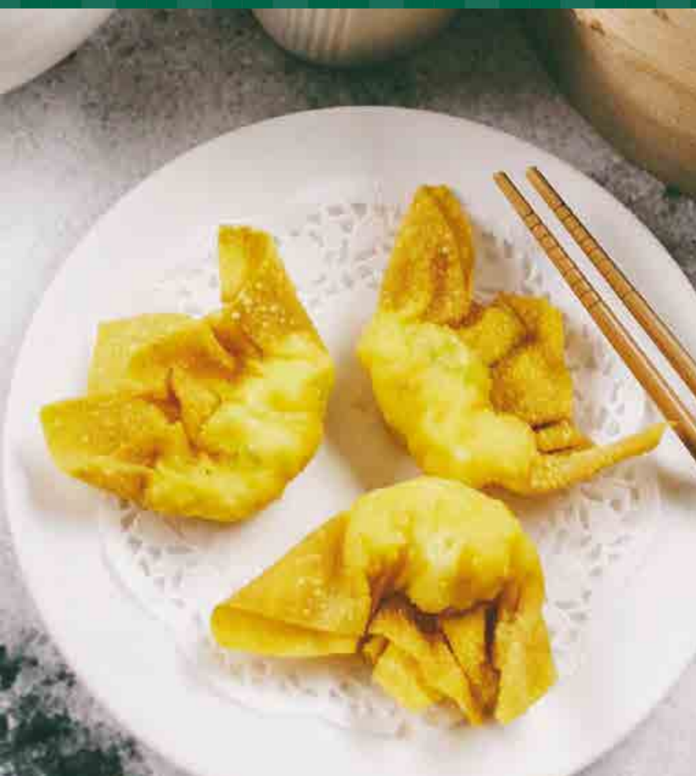
Fried Prawn Wonton Mayo 炸虾云吞配美乃滋