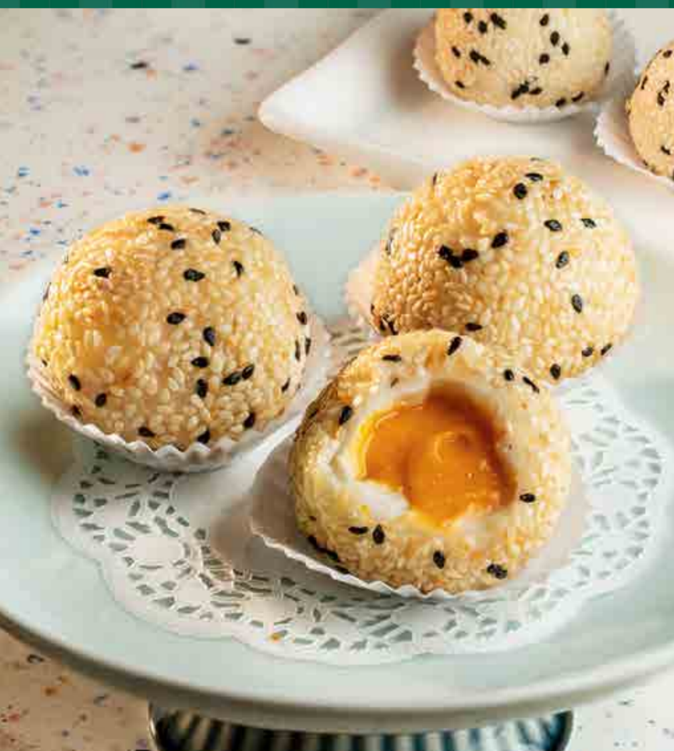
Onde Onde Salted Egg 咸蛋芝麻球