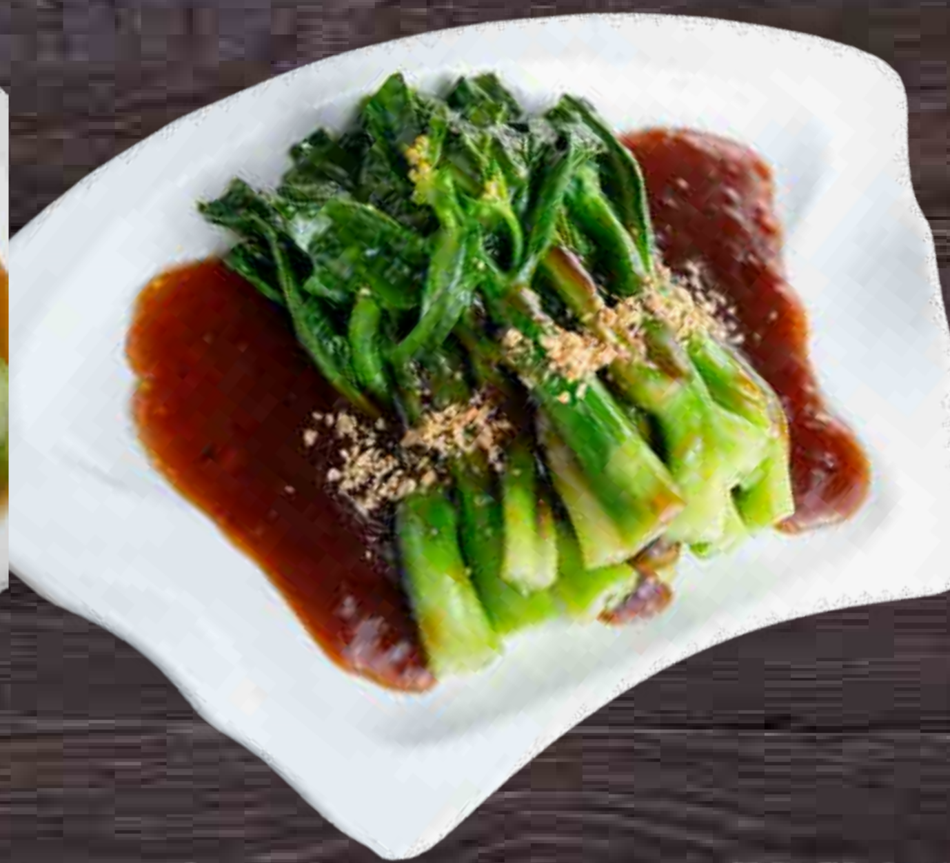
蚝油芥兰 Kailan Saus Tiram Chinese Kale in Oyster sauce