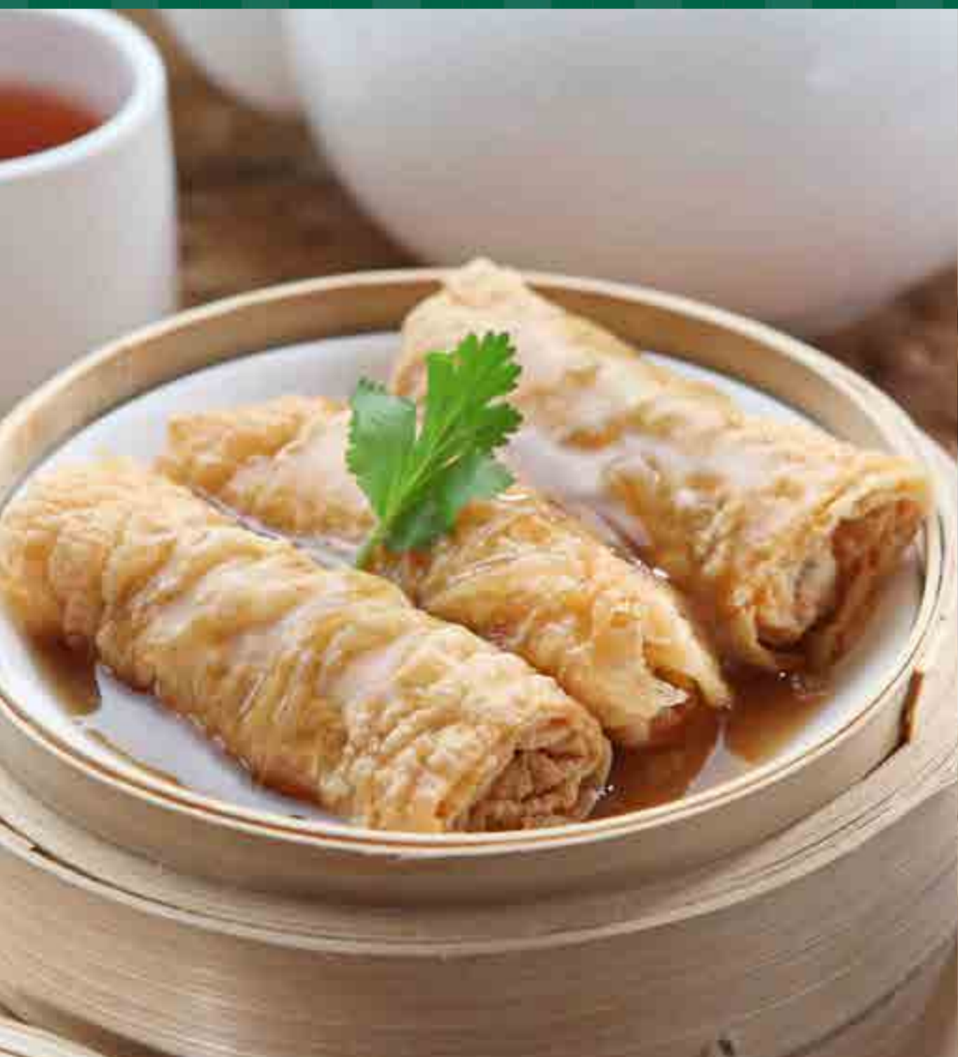
Prawn Spring Roll 鲜虾春卷