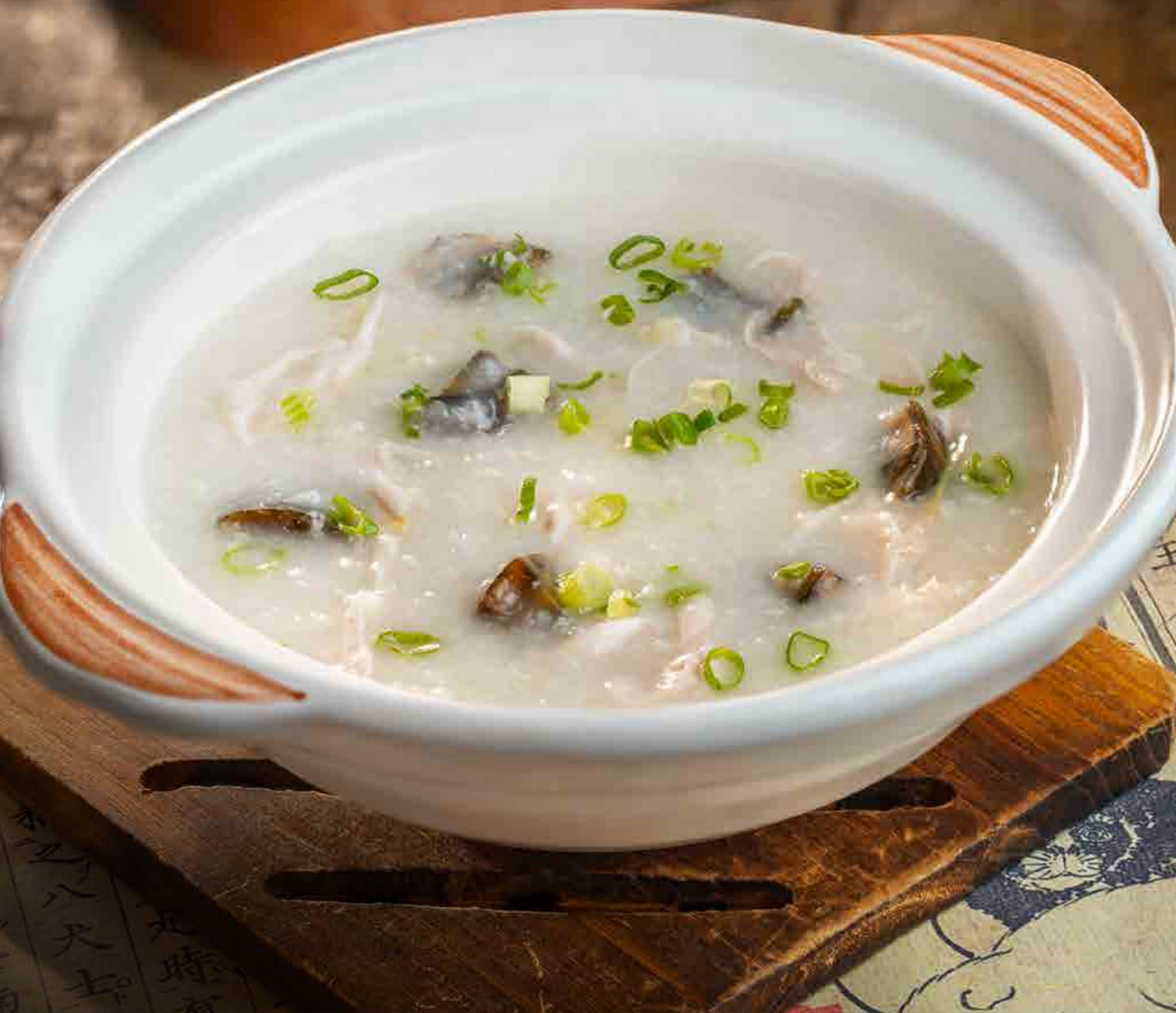
Silky Century Chicken Porridge 皮蛋滑鸡粥