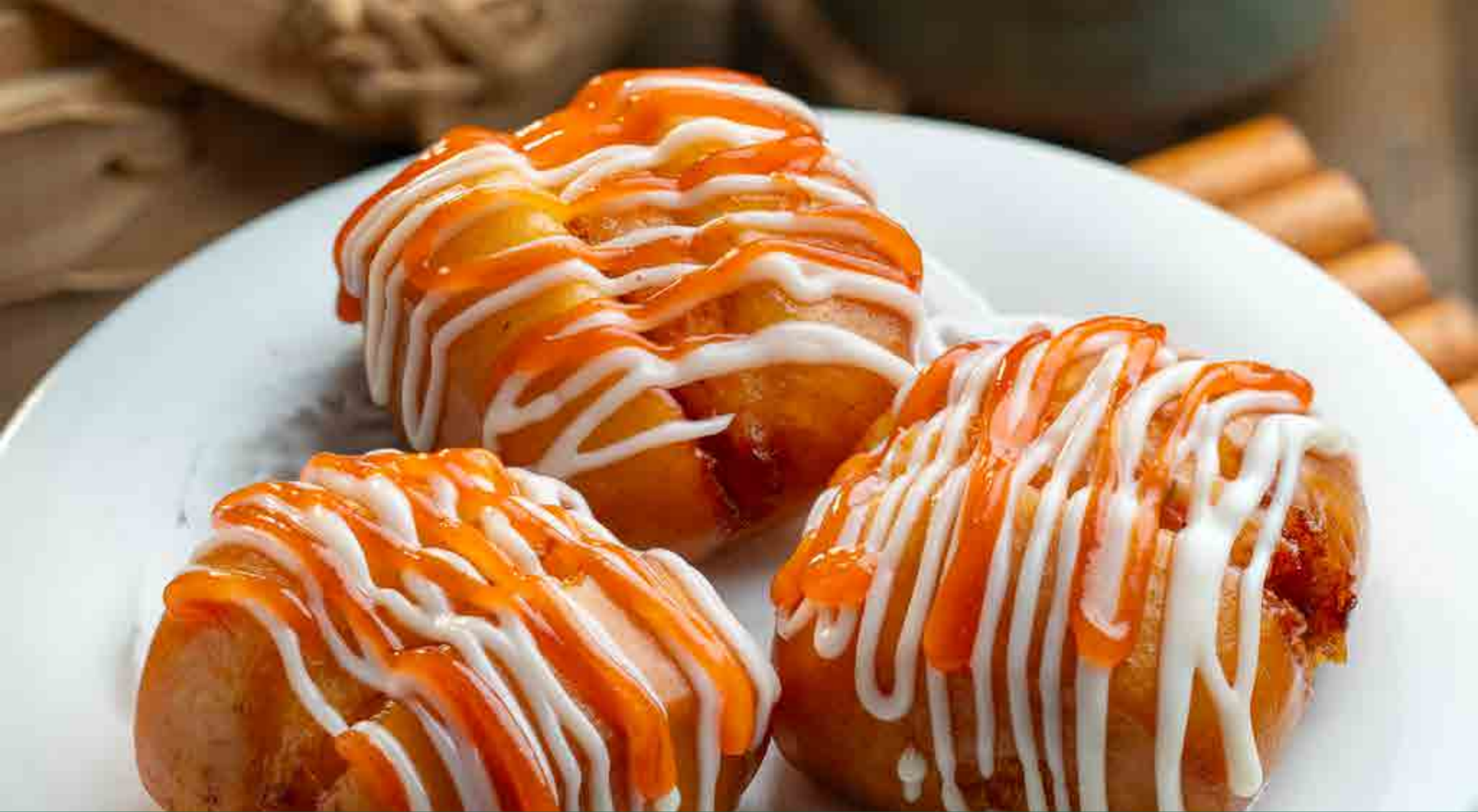
Fried Shrimp Mantou 香炸虾馒头