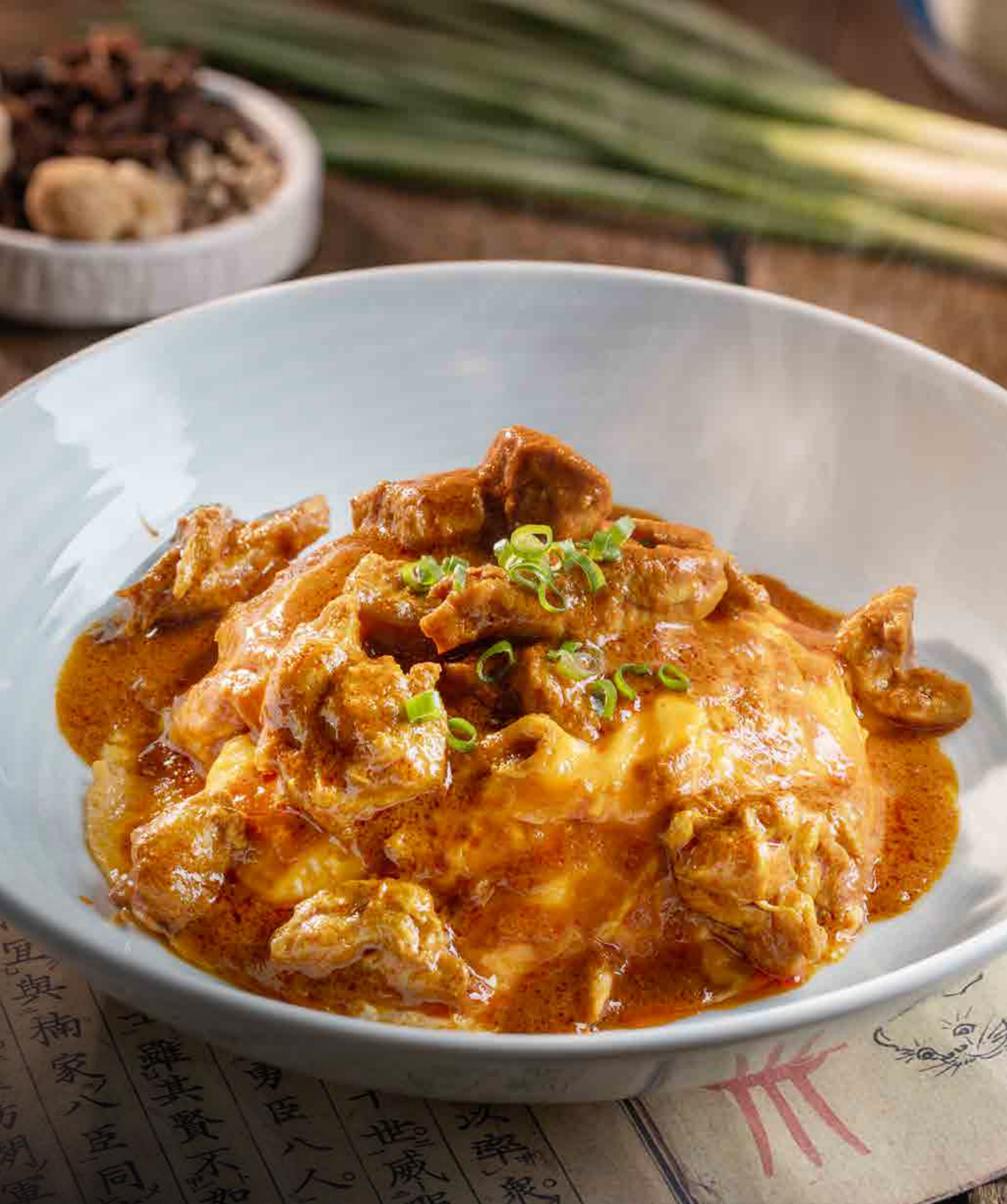
Chiffon Rice with HK Curry 港咖绵饭