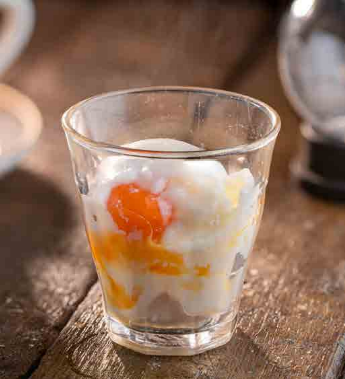
Half Boiled Omega 3 Egg 半熟蛋