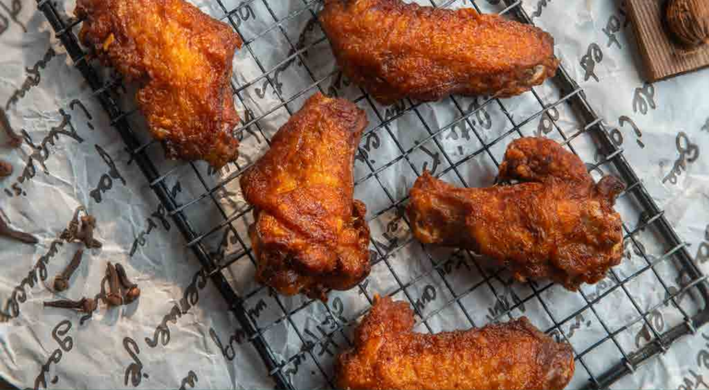
Butter Chicken Wings (5 pcs)