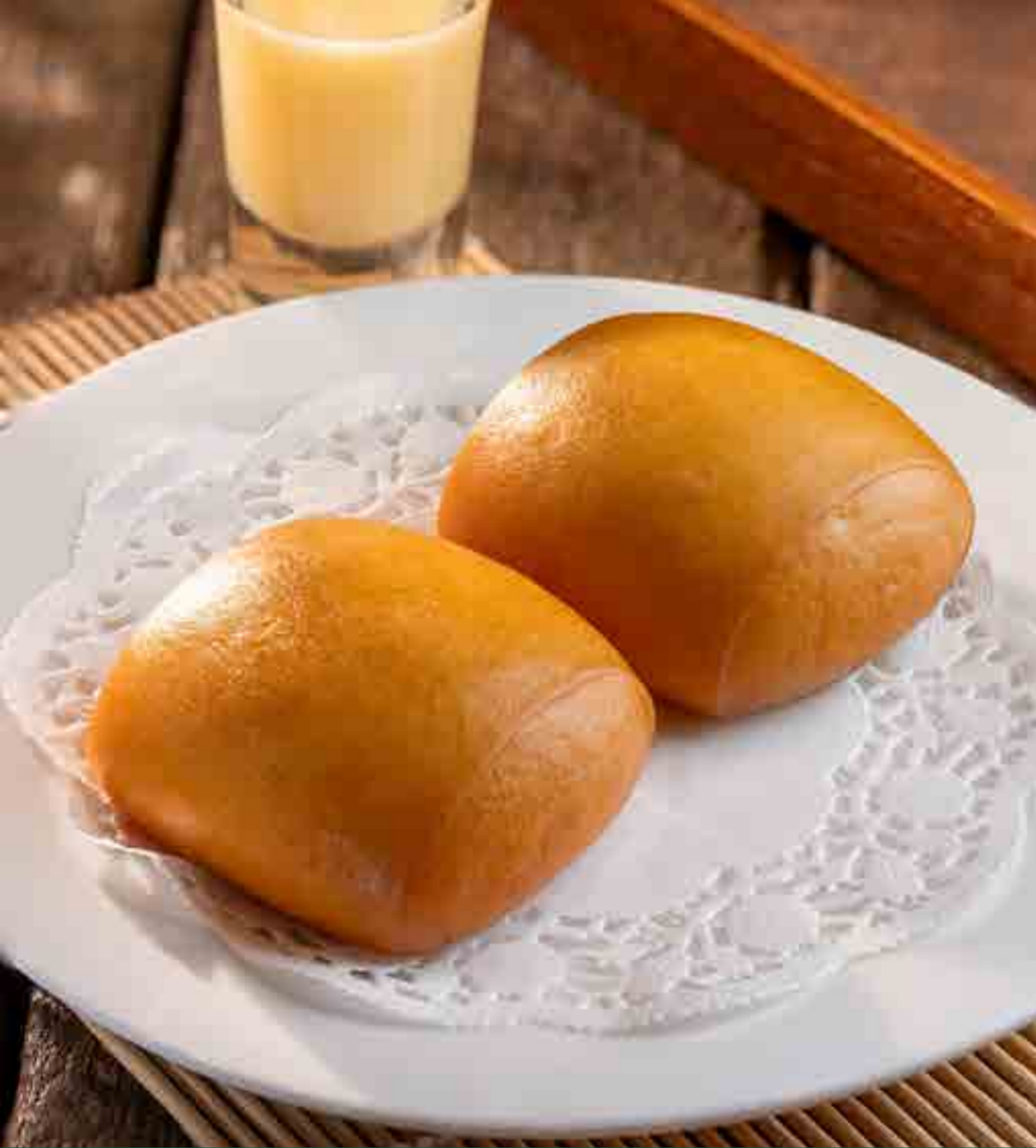
Fried Mantou 炸馒头