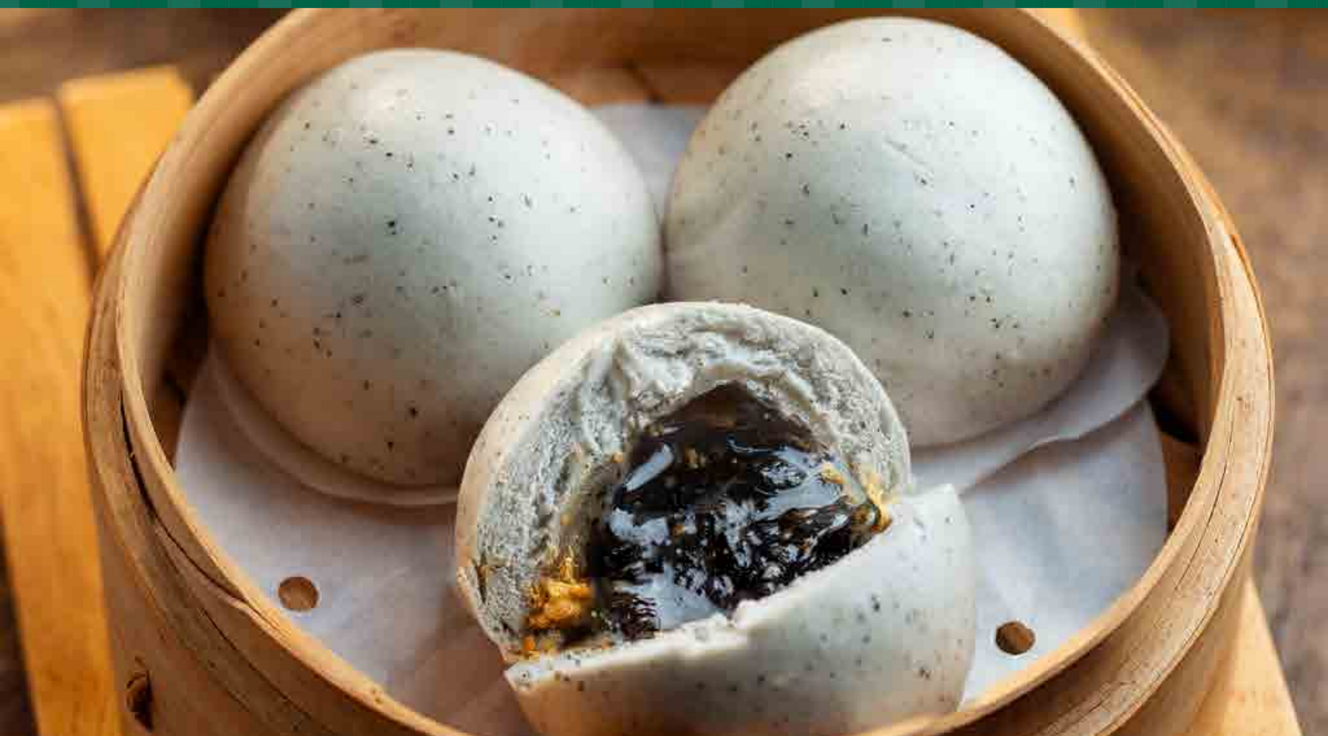
Black Sesame Mochi Bao 黑芝麻糯米包