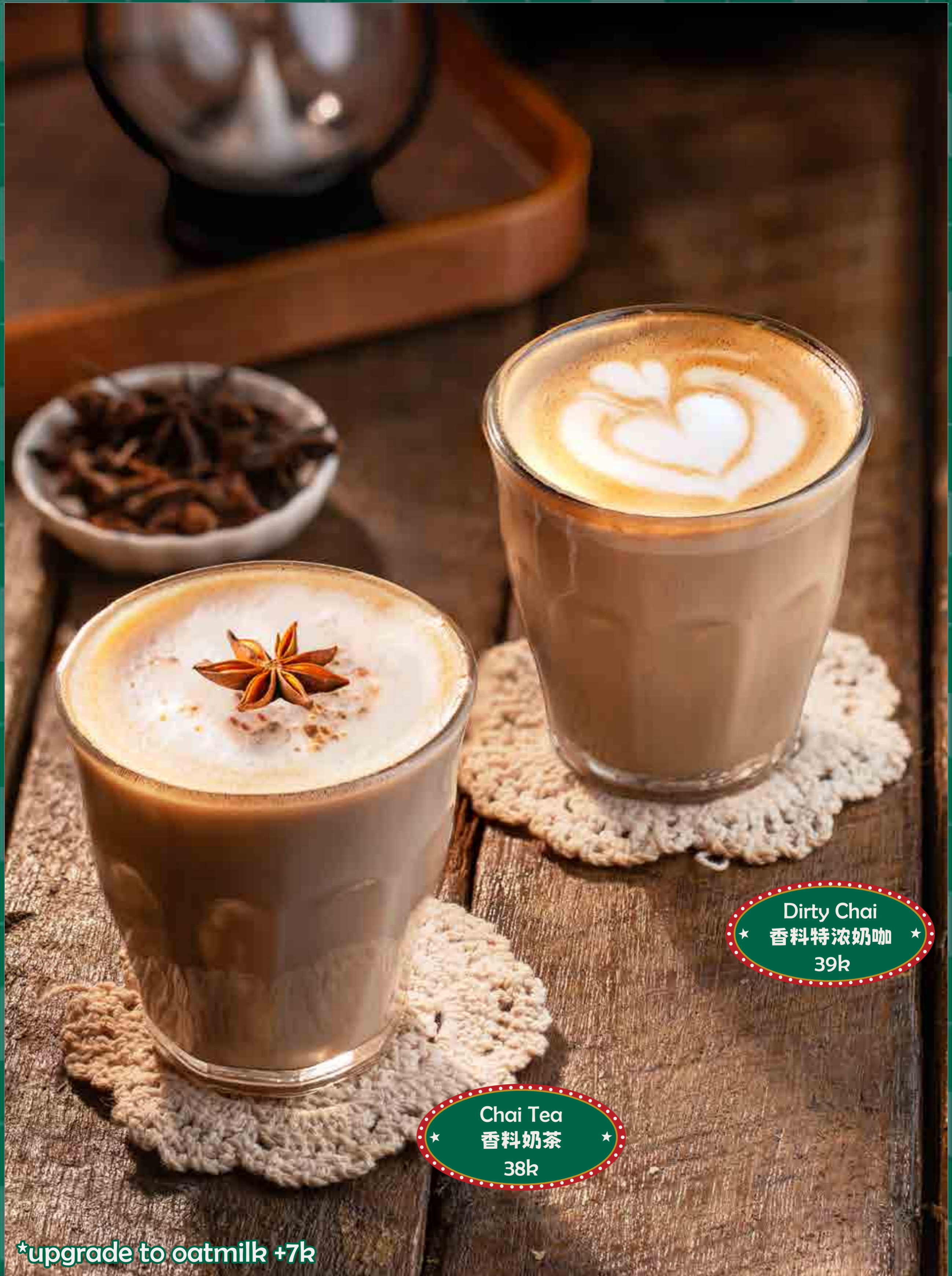
★ Dirty Chai ★ ★ 香料特浓奶咖 ★ 39k