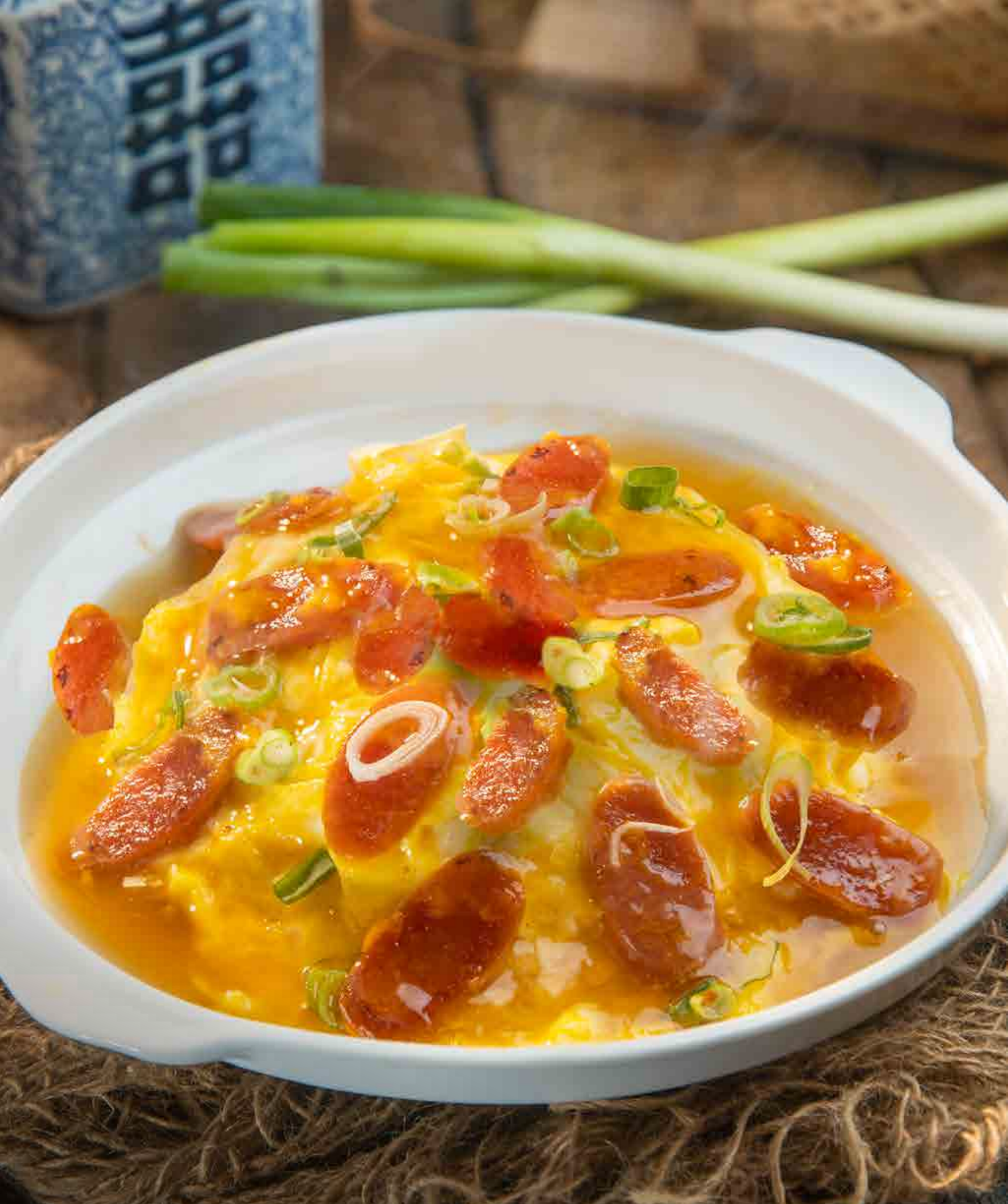
Chiffon Rice Chicken Lap Cheong 腊肠绵绵饭