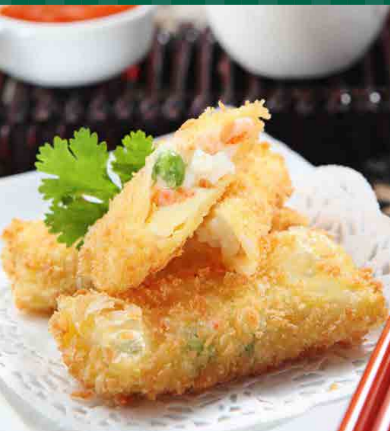
Seafood Cheese Spring Roll 海鲜芝士春卷