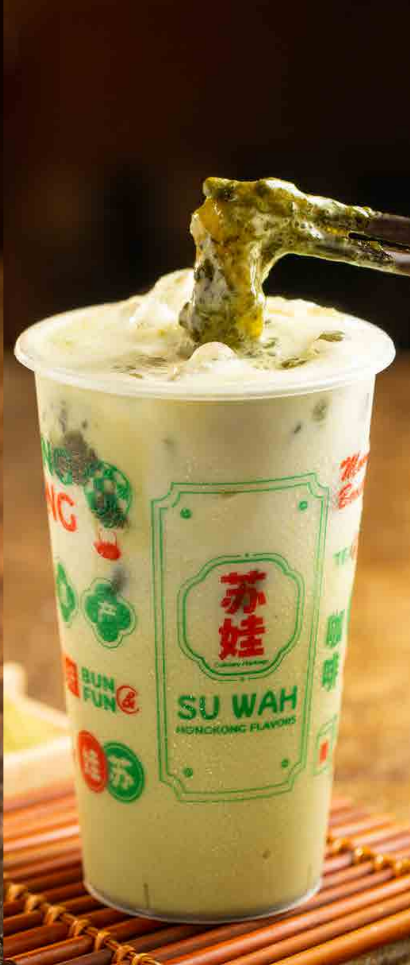
Matcha Mochi Milkyway 抹茶麻糬银河饮