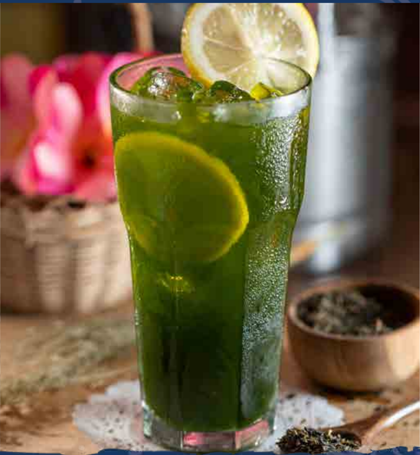
Lemon Teh Hijau Lemonade Green Tea