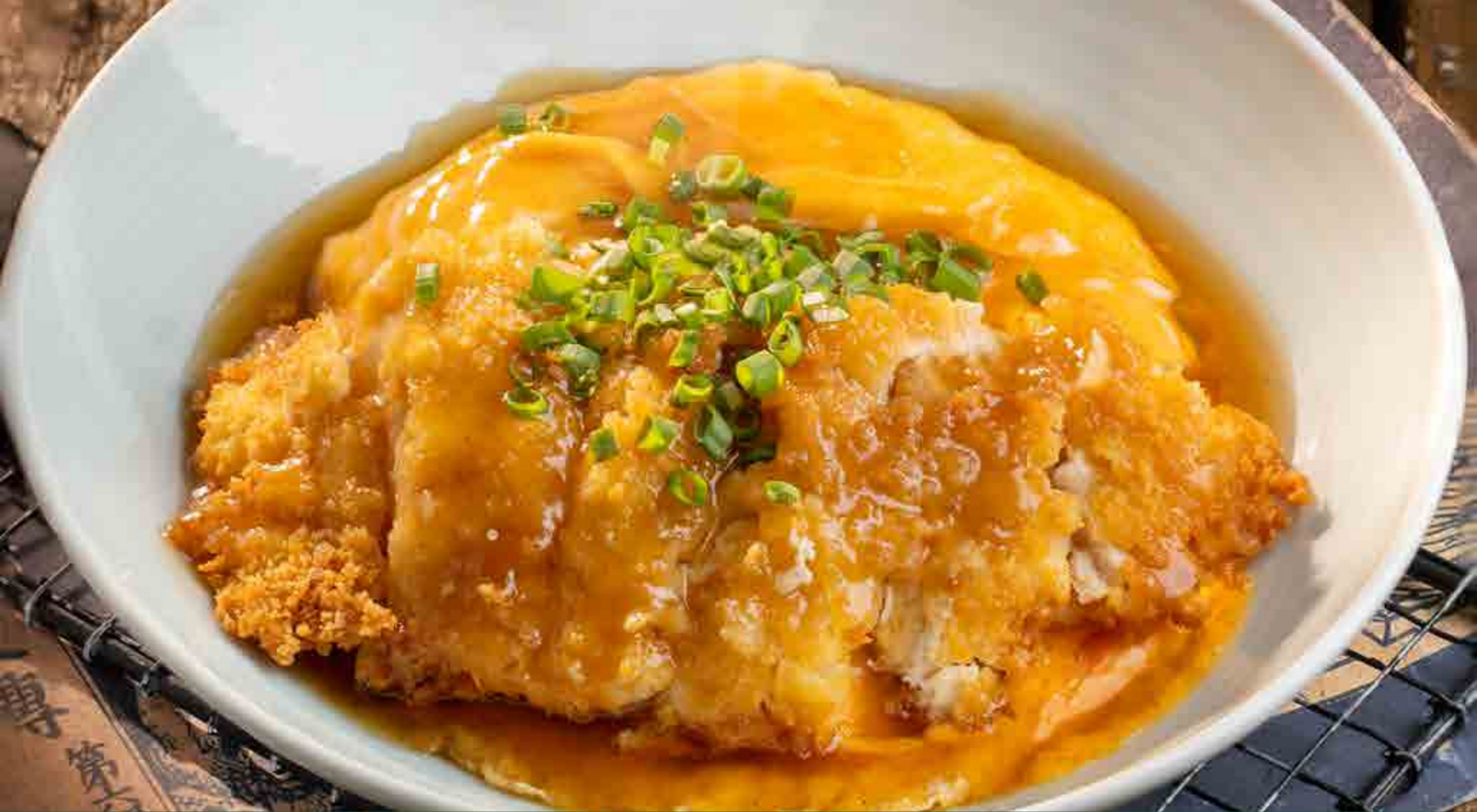
Chiffon Rice Chicken Katsu 吉列鸡绵绵饭