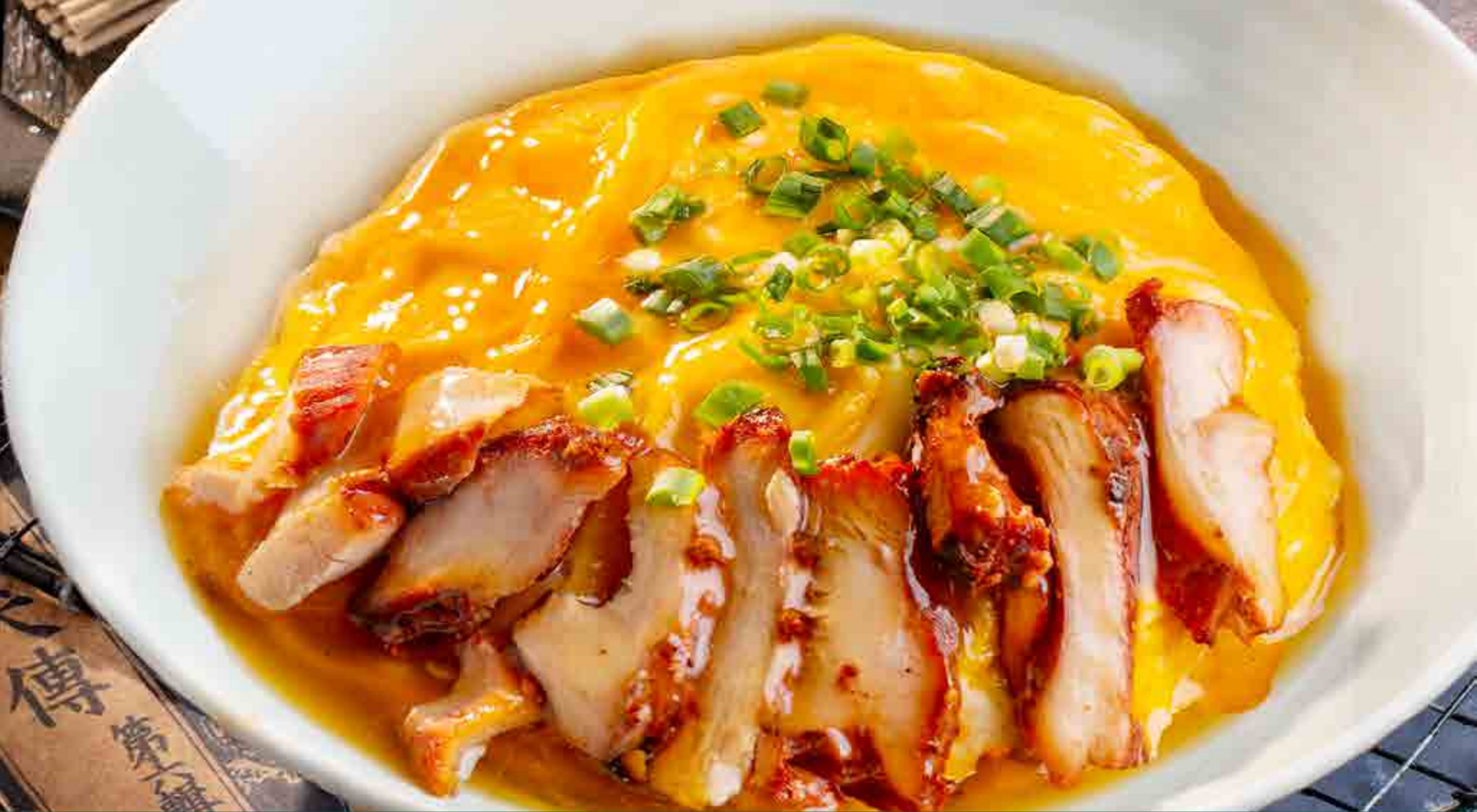
Chiffon Rice Chicken Char Siew 叉烧绵绵饭