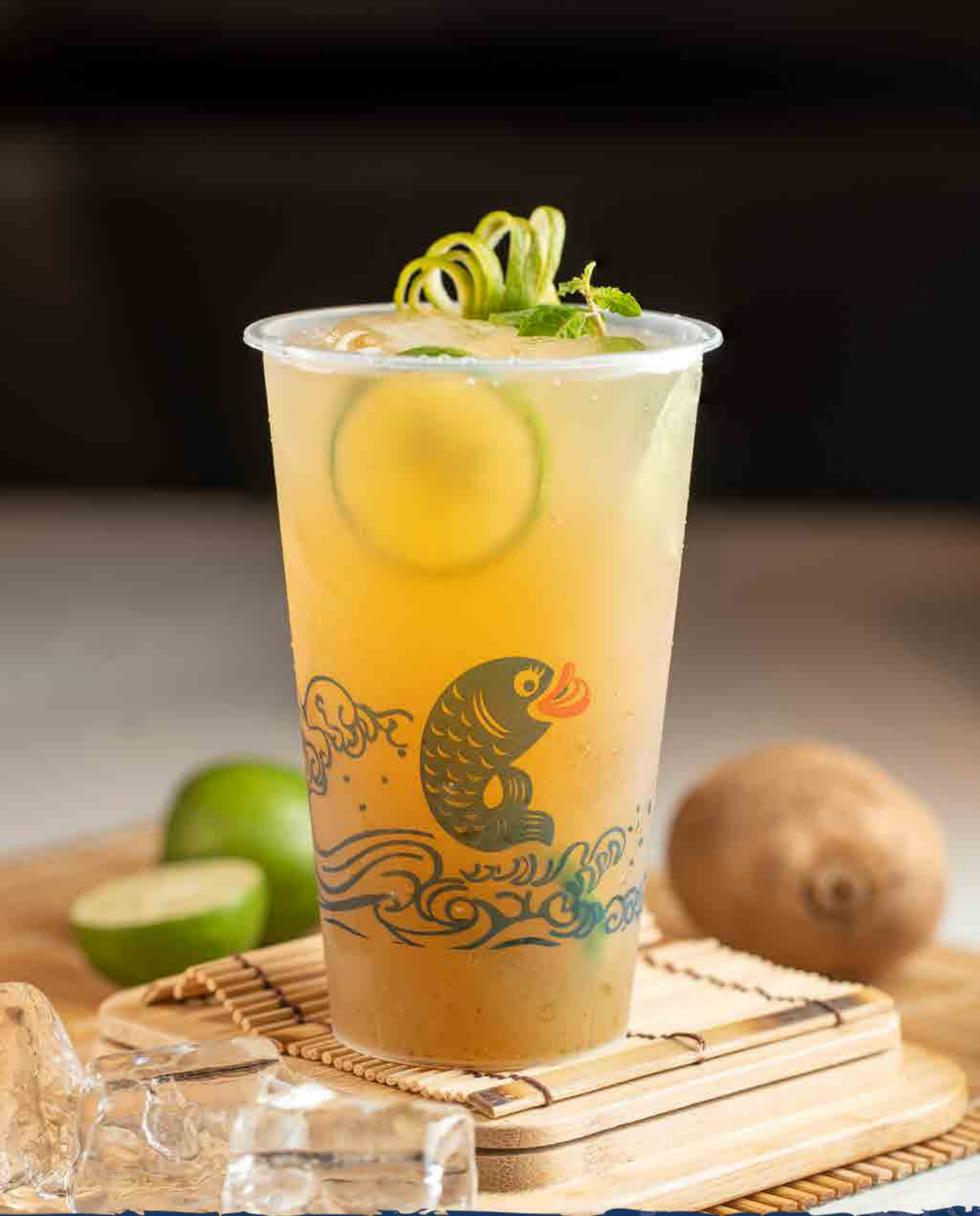
Kiwi Lime Mix of Kiwi and Lime Juice