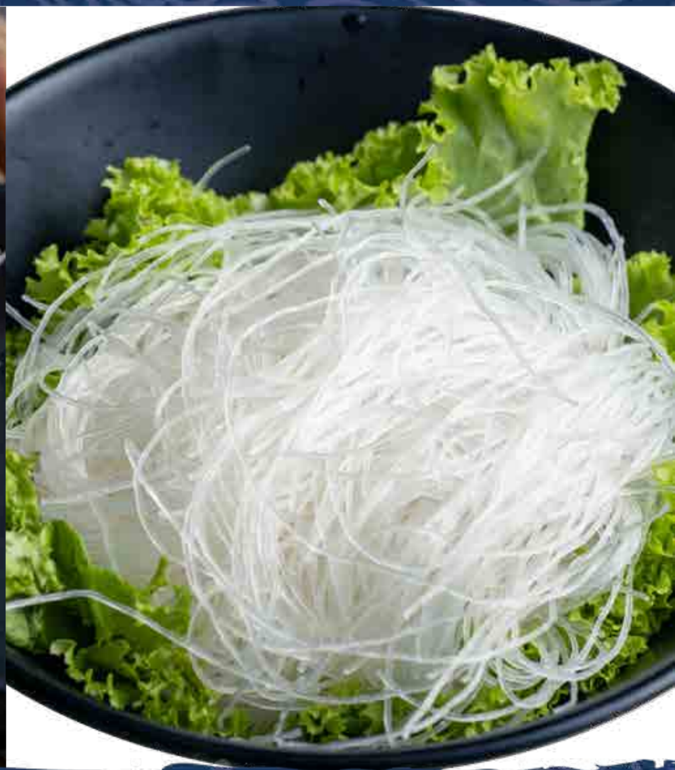
冬粉 Soun Vermiceli