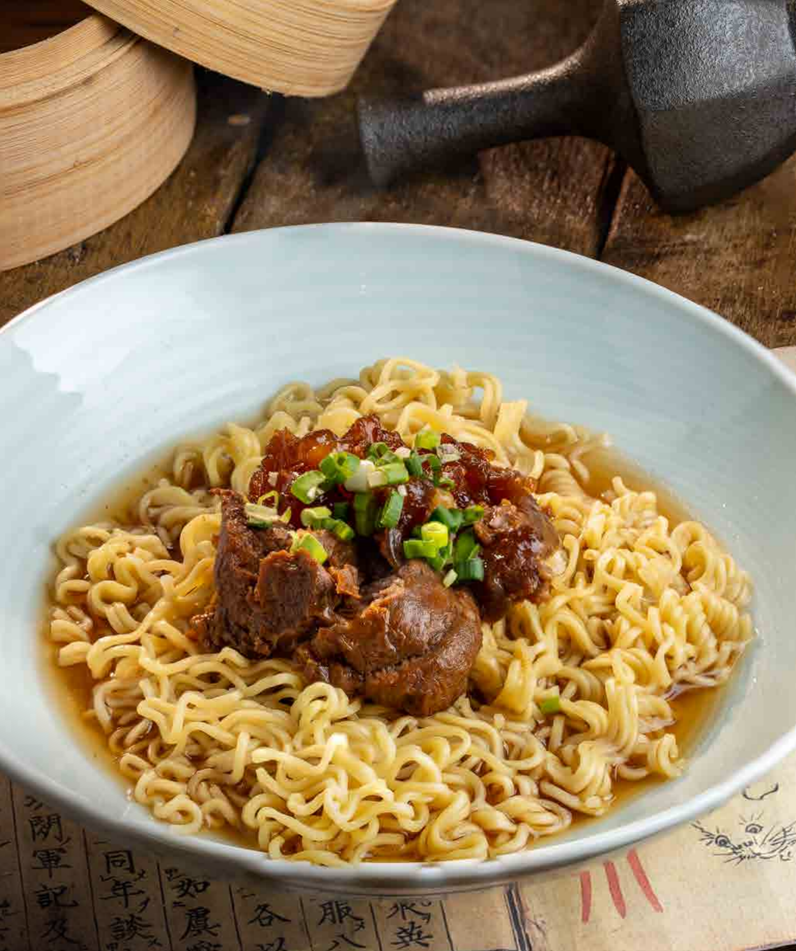
Beef Tendon Noodle Soup