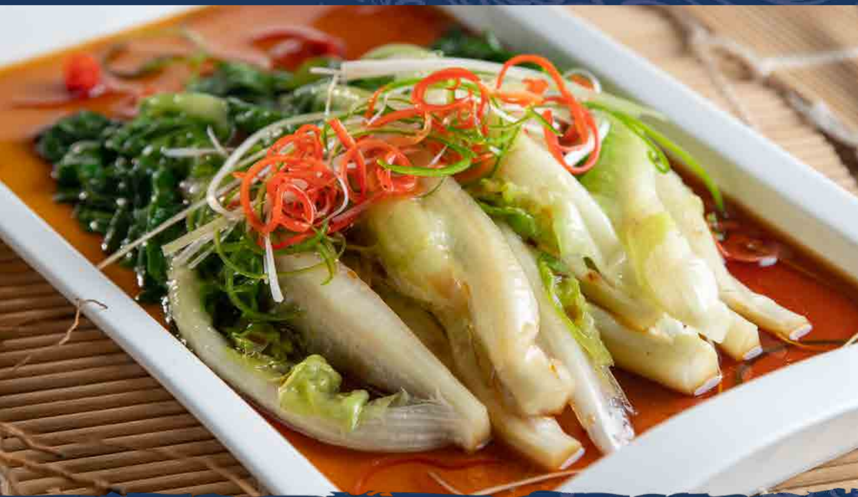
蚝油菜心 Romaine dengan saus Tiram Romaine Lettuce with Oyster sauce