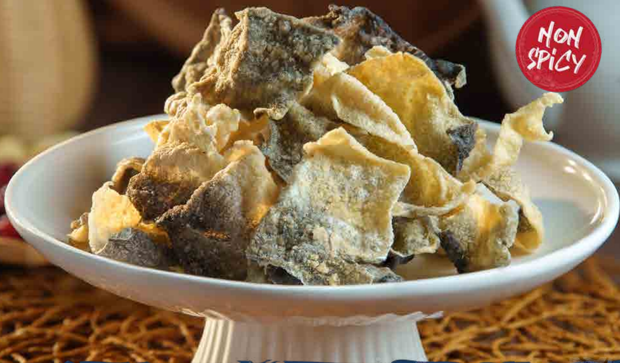
脆皮鱼皮 Kulit Ikan Goreng Crispy Fish Skin