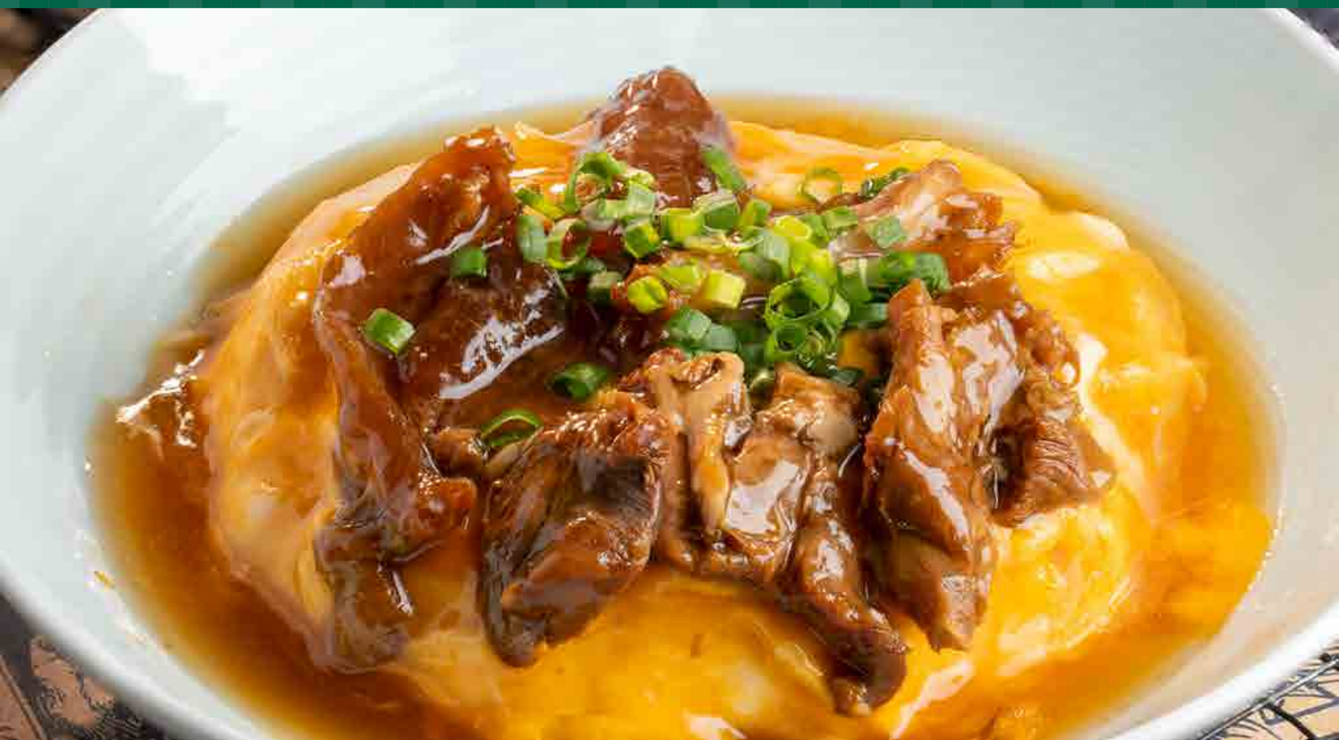
Chiffon Rice Beef Tendon