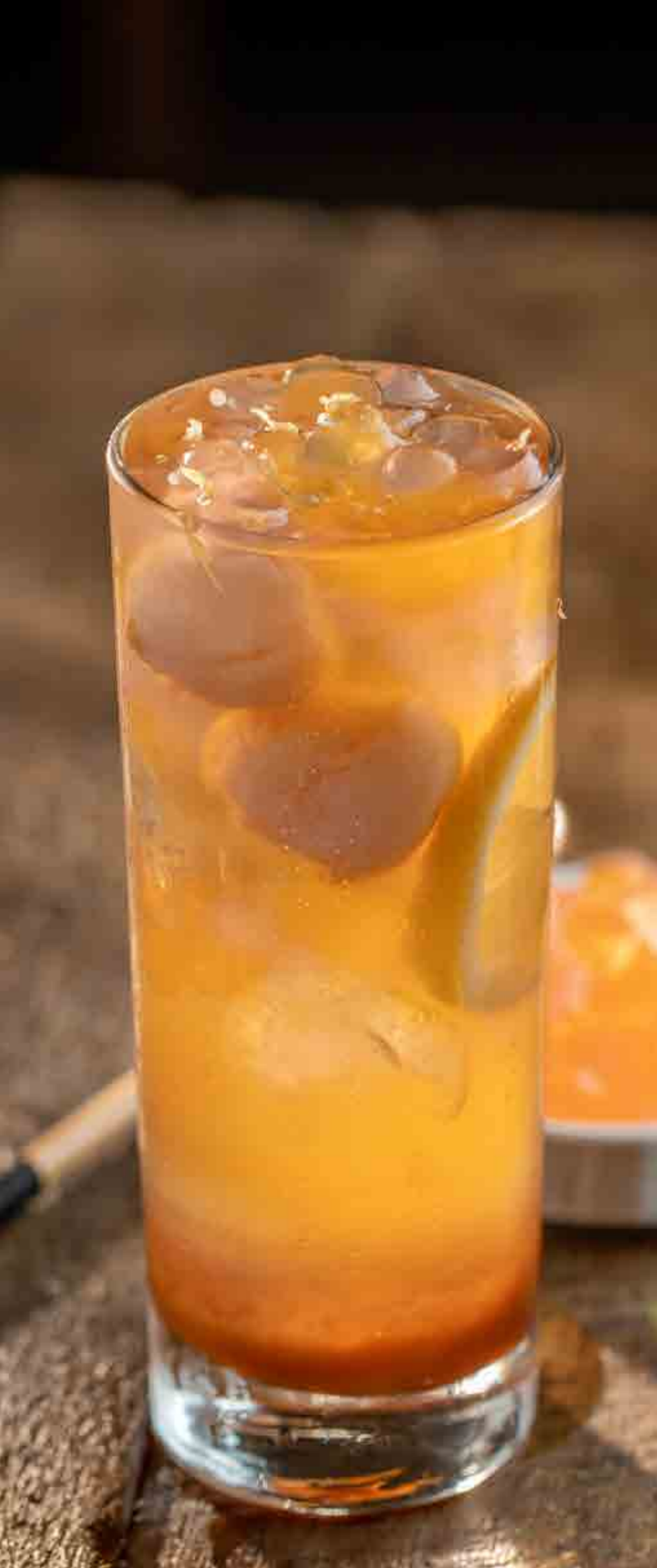
Blossom Lychee Tea 荔枝花漾茶