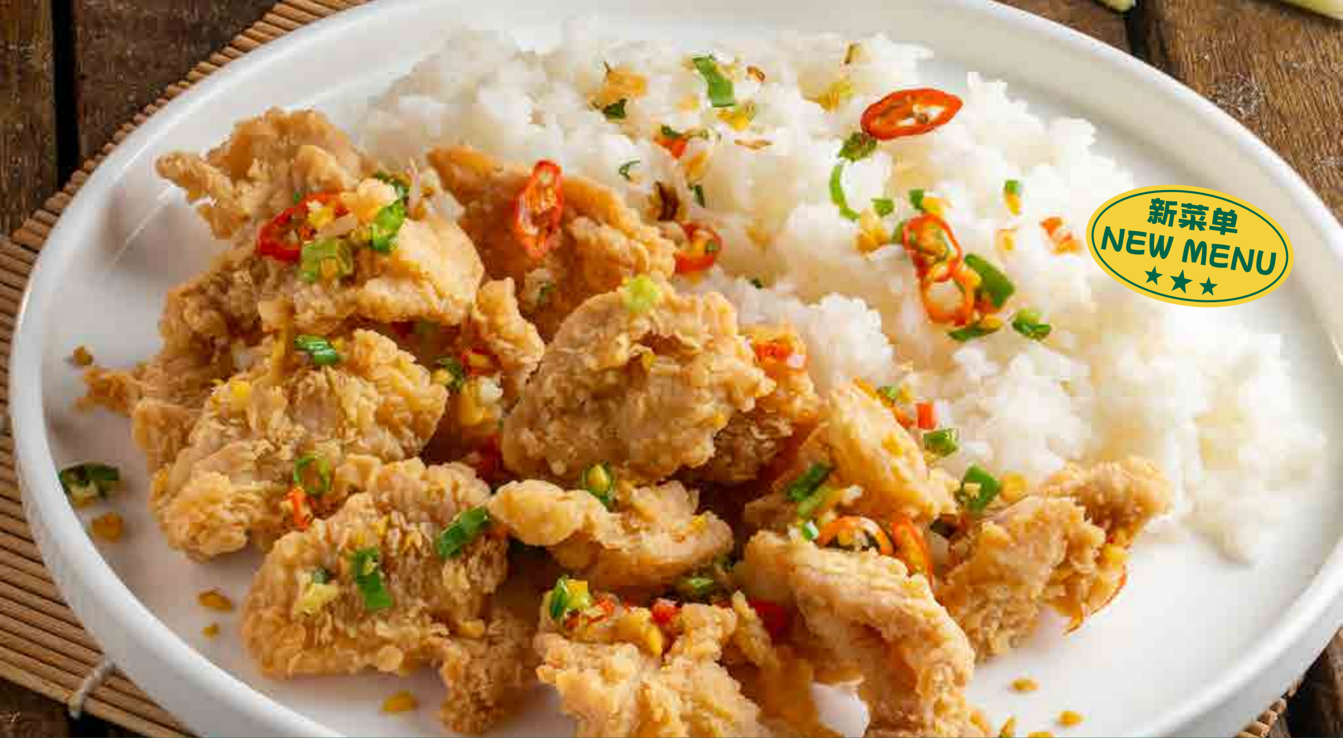
Salt & Pepper Chicken Rice