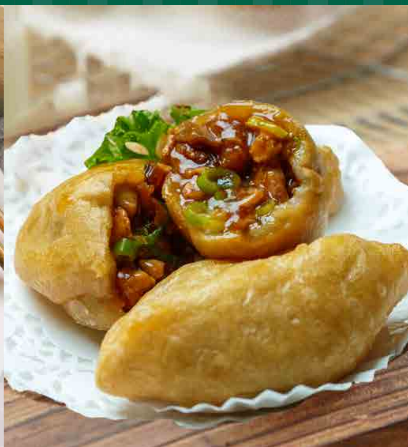
Fried Glutinous Dumpling 咸水角