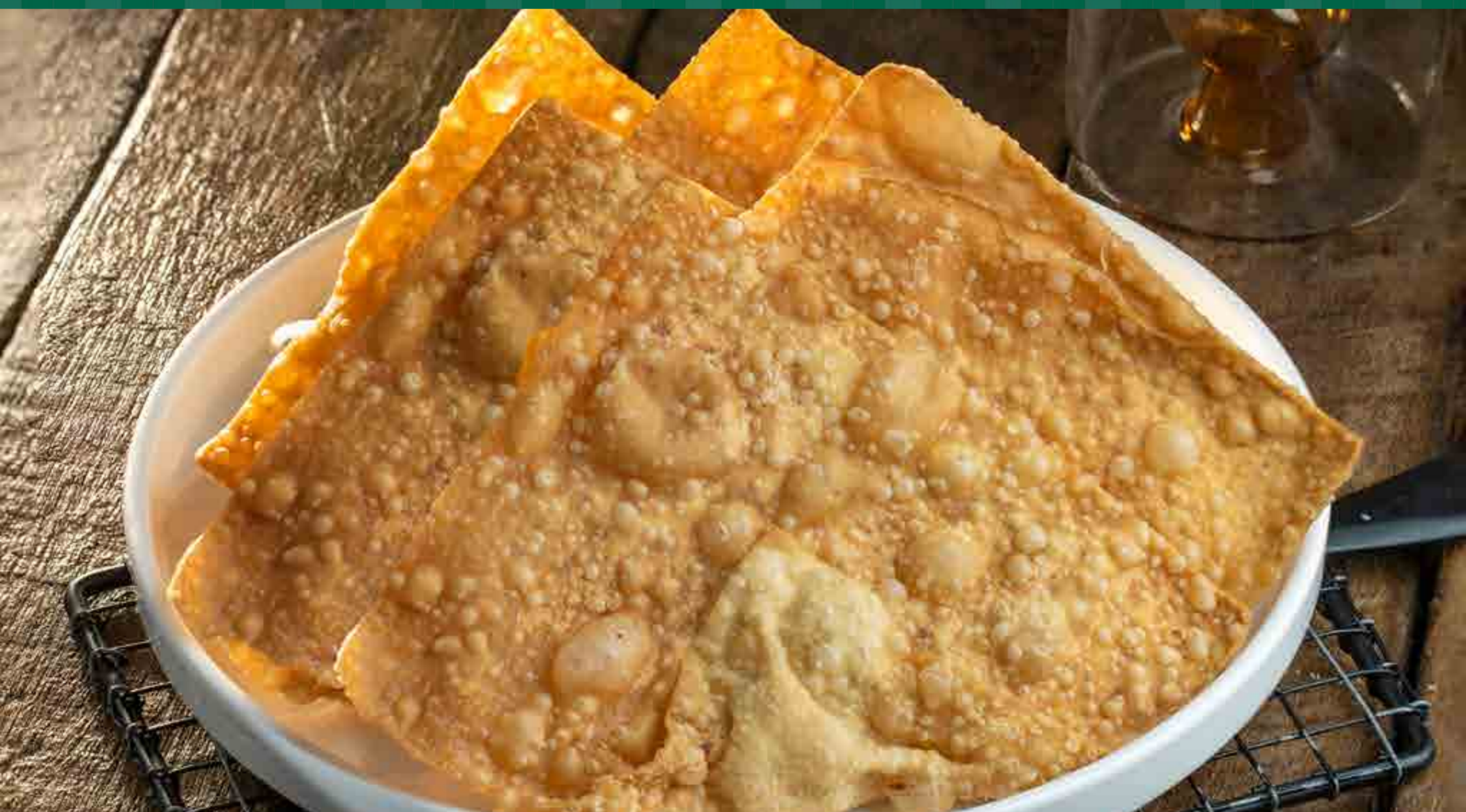
Pangsit Goreng (5 pcs)