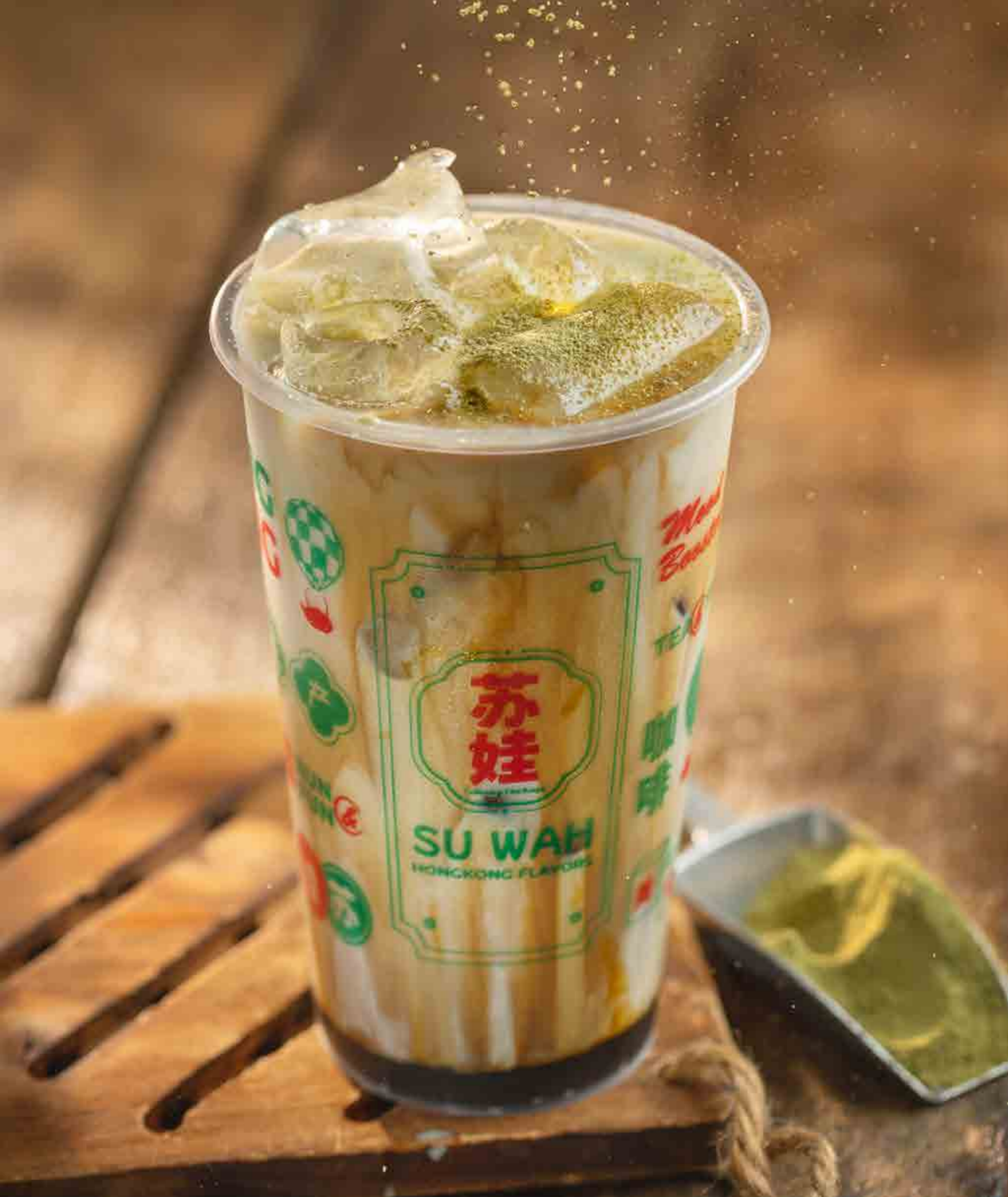
Dirty Matcha 抹茶特濃奶咖