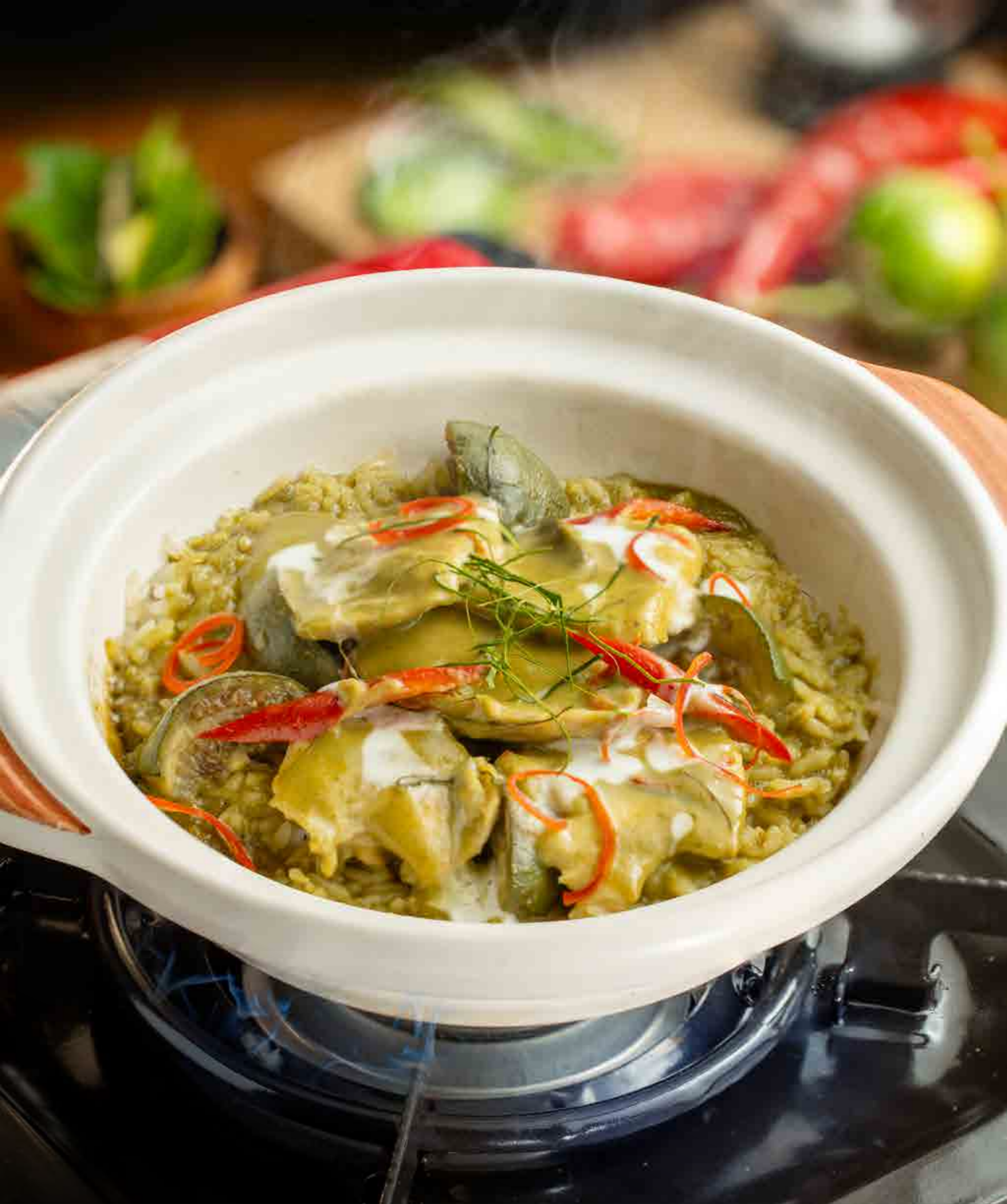
Green Curry Chicken Claypot