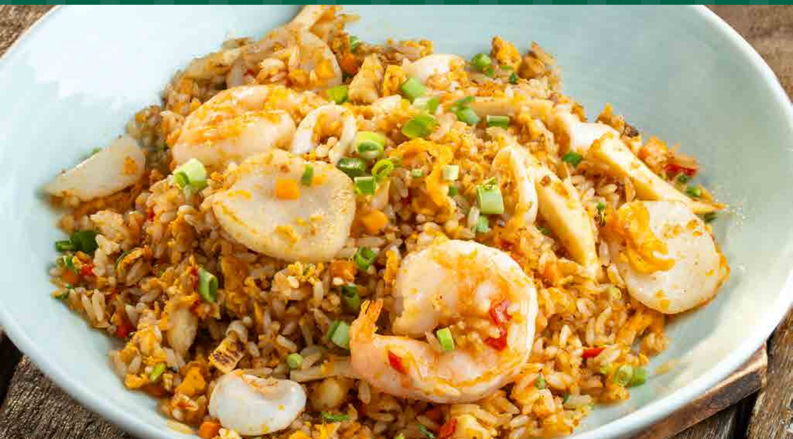
Seafood Fried Rice