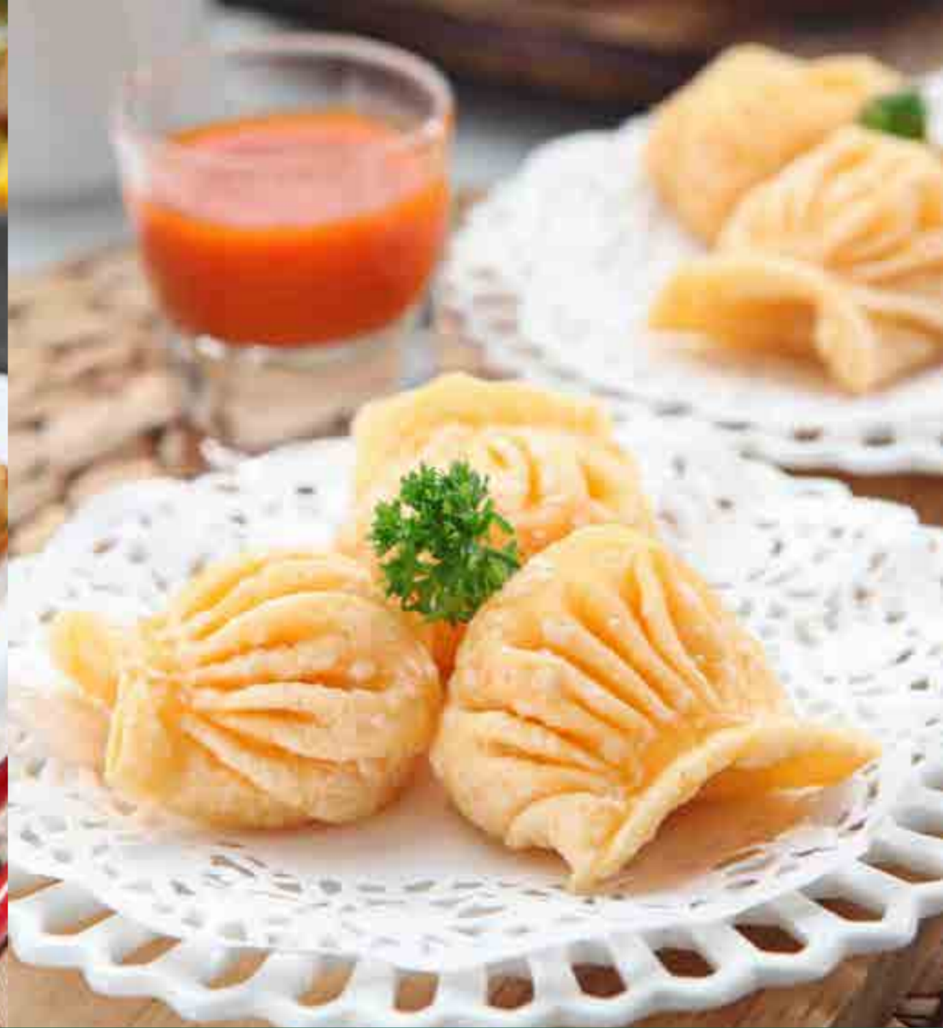
Fried Har Gow 炸虾饺