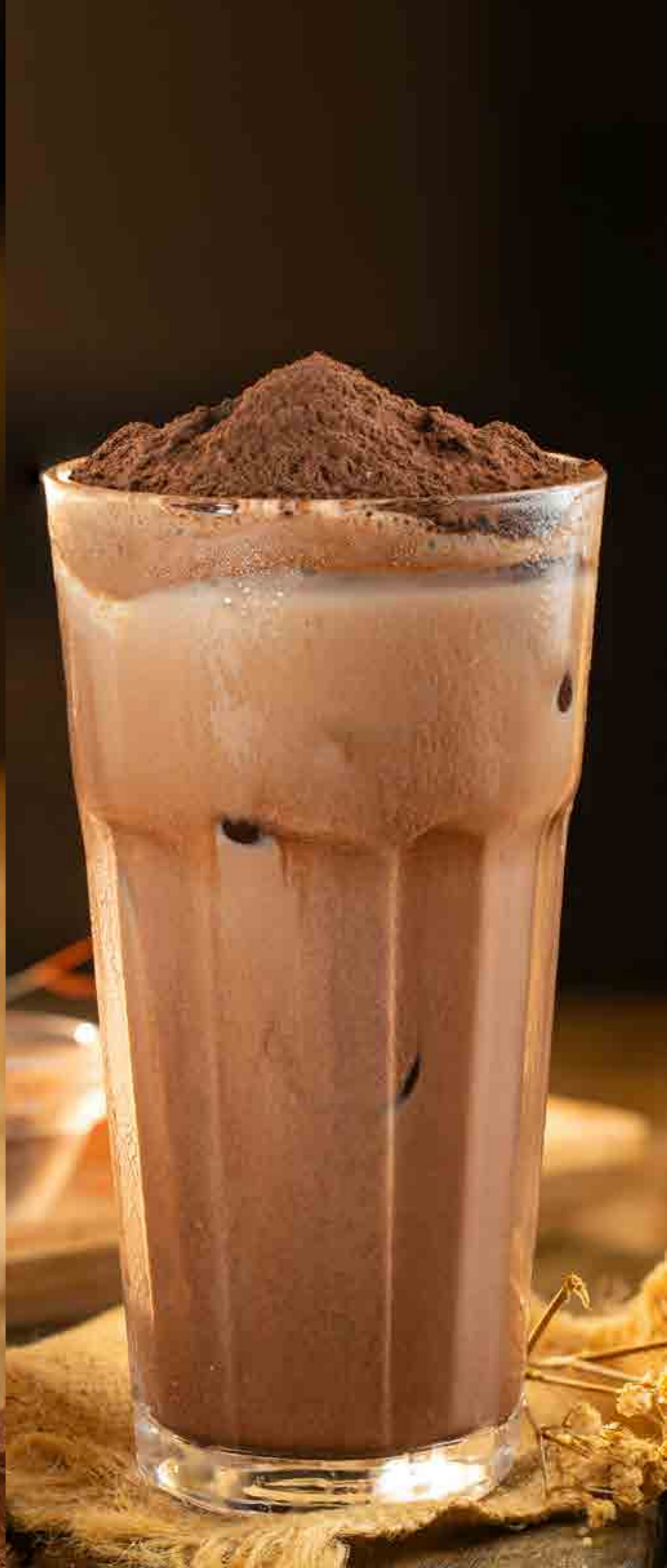
Milo Dinosaur 美禄恐龙