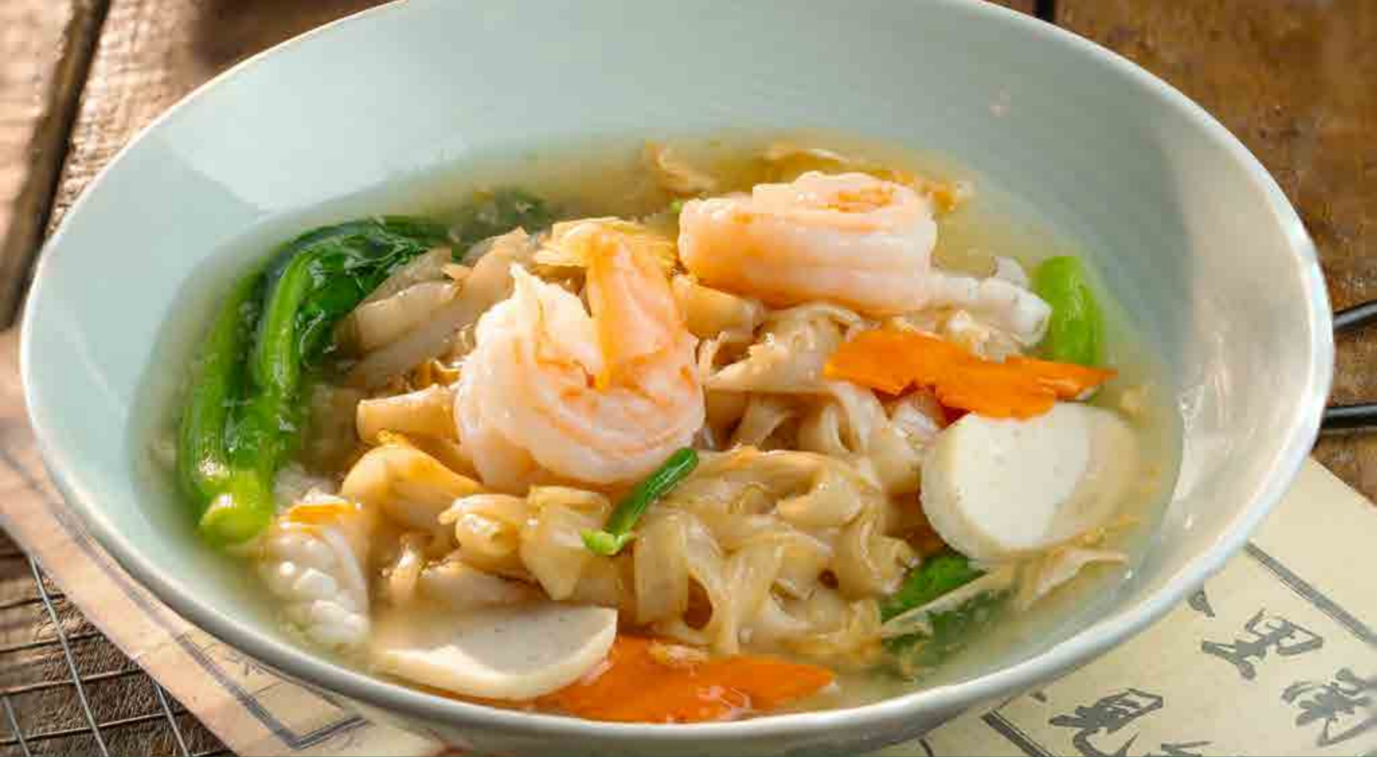
Seafood Hor Fun 鲜虾海鲜河粉