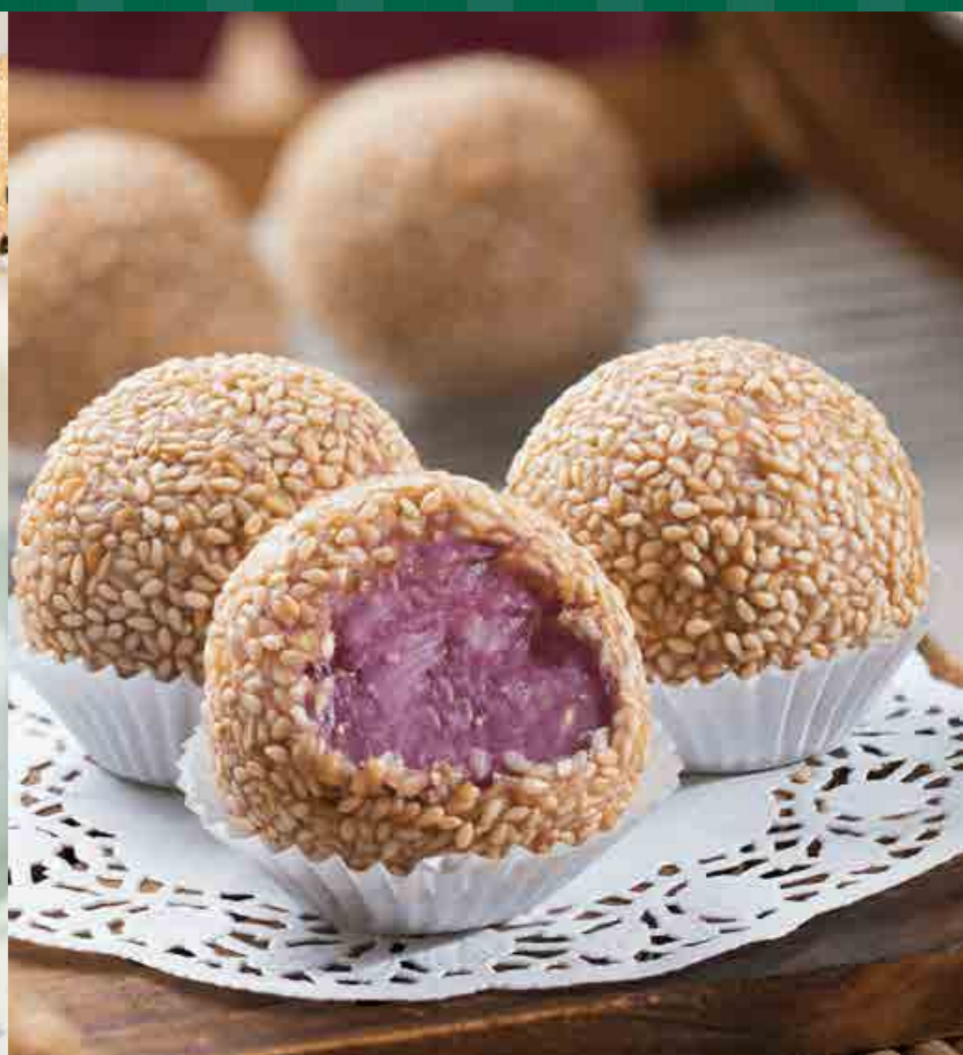
Onde Onde Ube 紫薯芝麻球