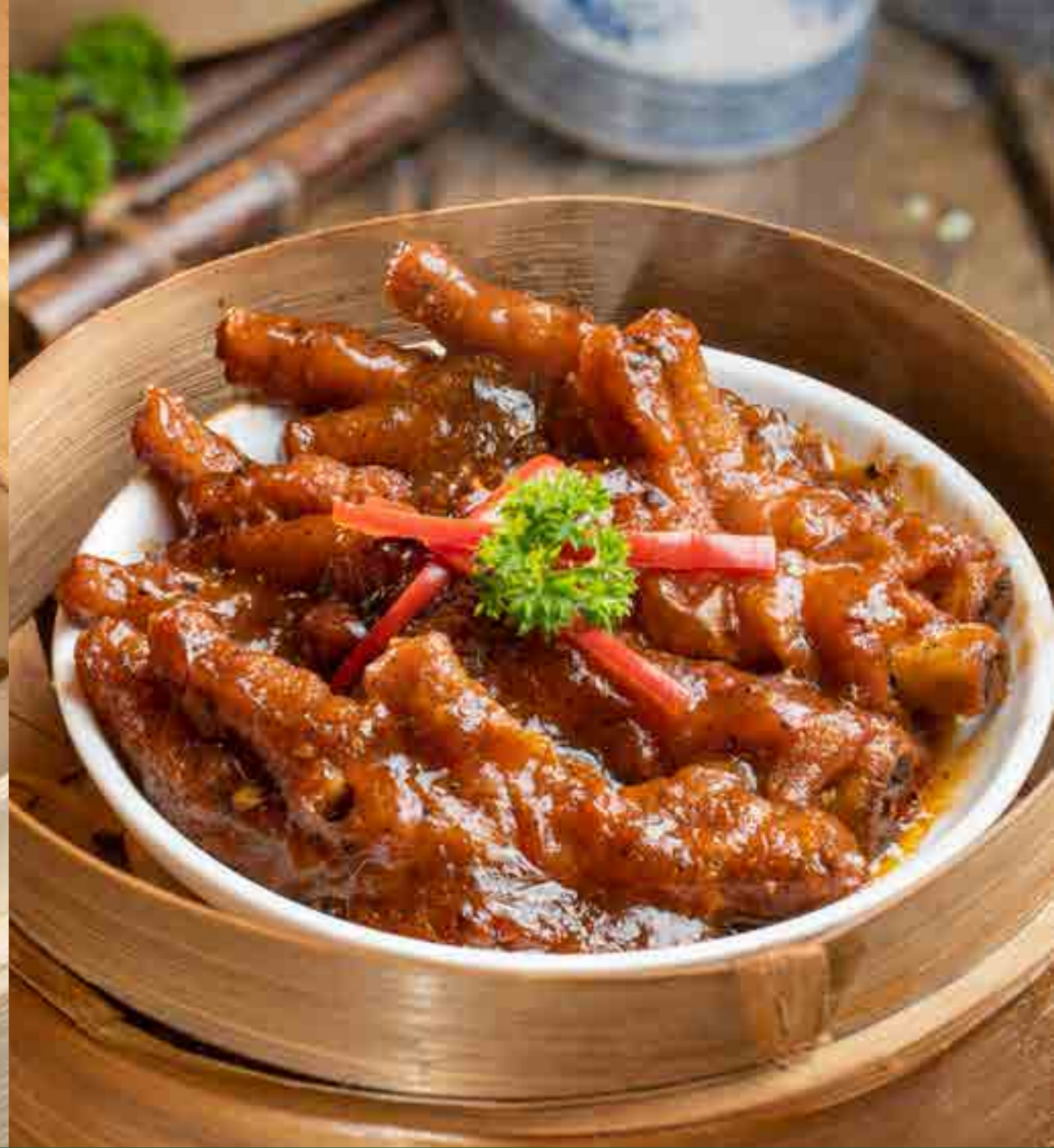
Braised Chicken Feet 卤凤爪