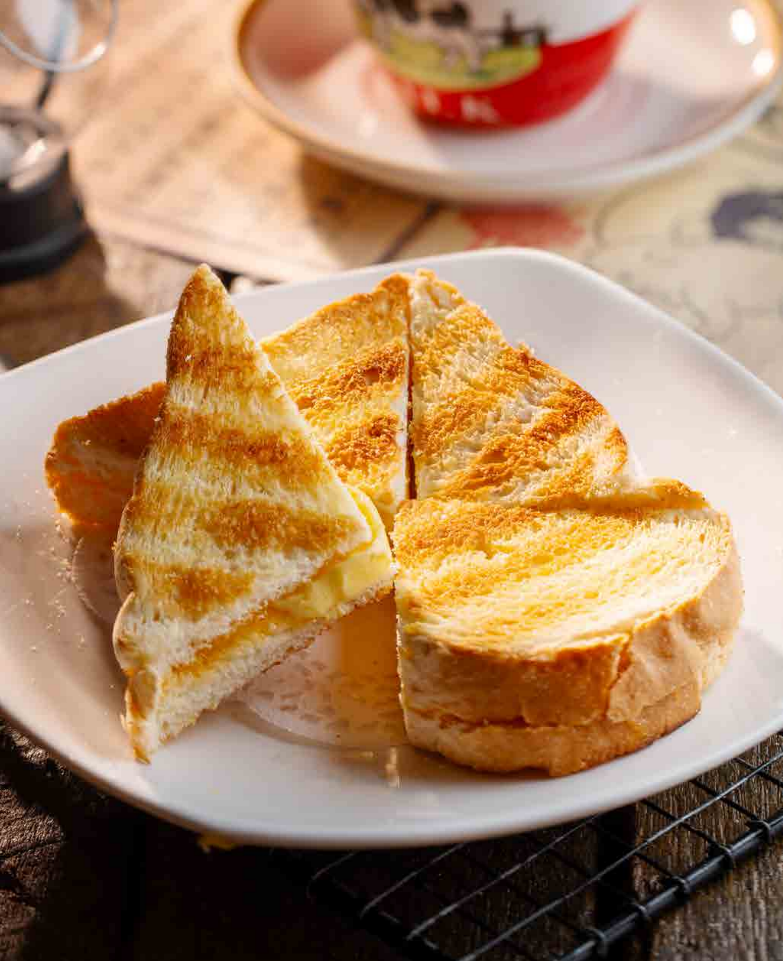
Kaya Toast 咖椰麥多