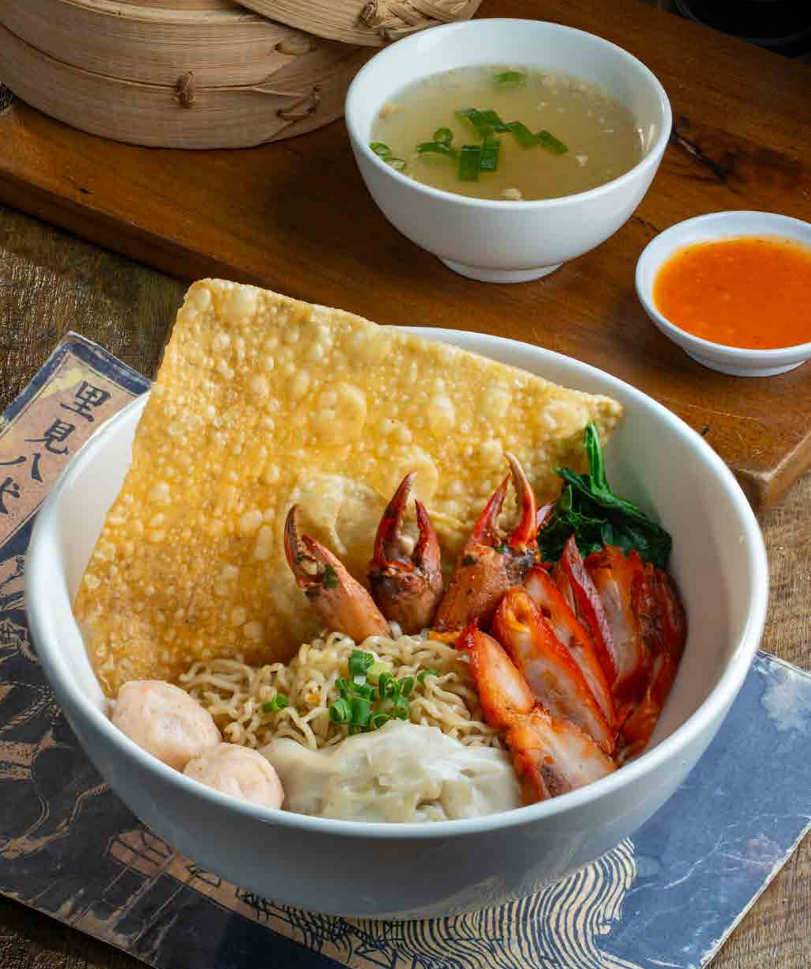
Su Wah Signature Noodle