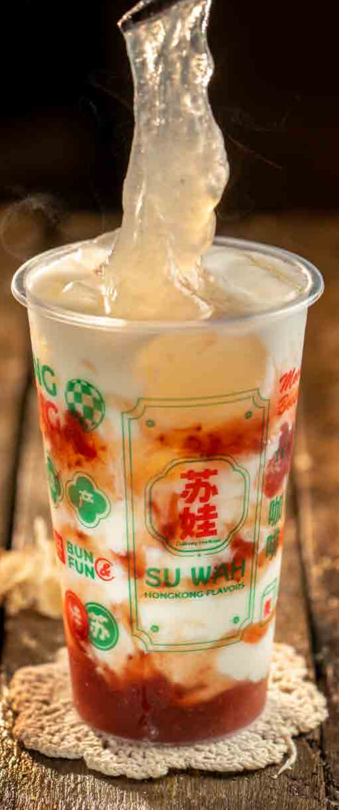
Strawberry Mochi Milkyway 草莓麻糬银河饮