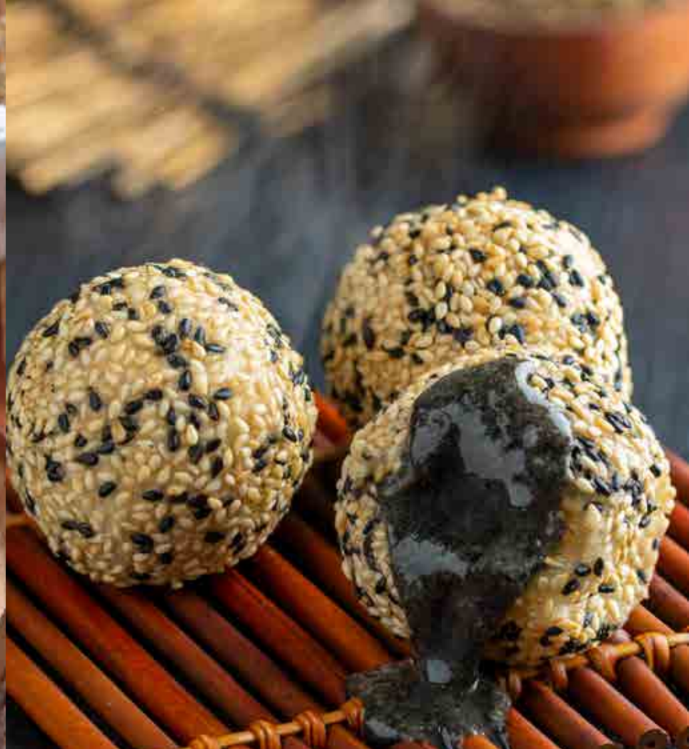
Onde Onde Sesame 麻薯球