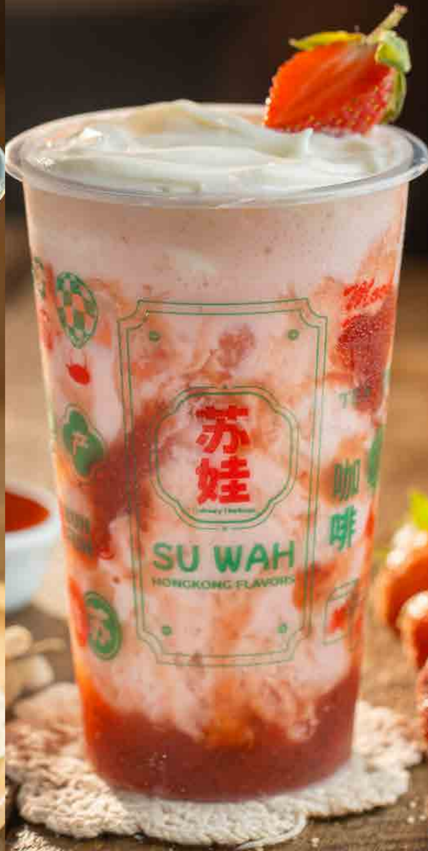
Cheesy Berry Dream 莓莓芝芝梦幻