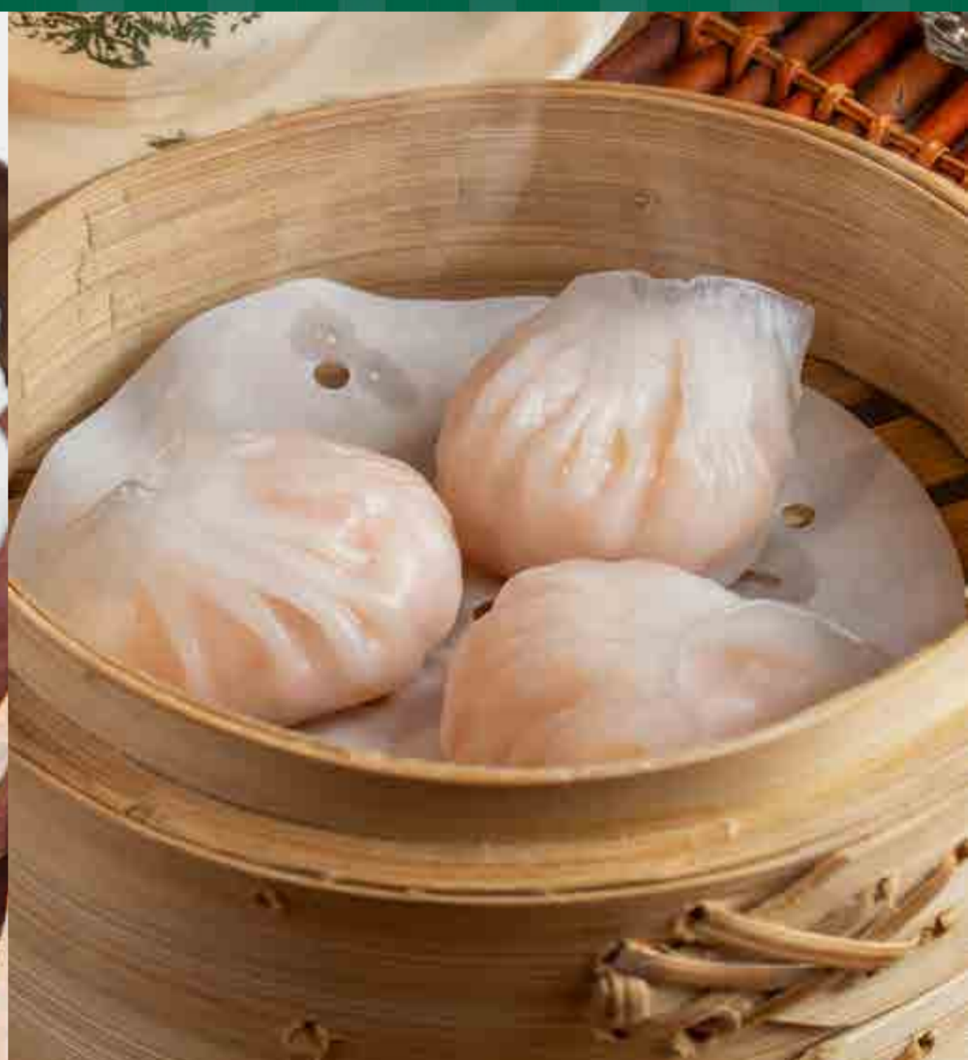
Har Gow 虾饺