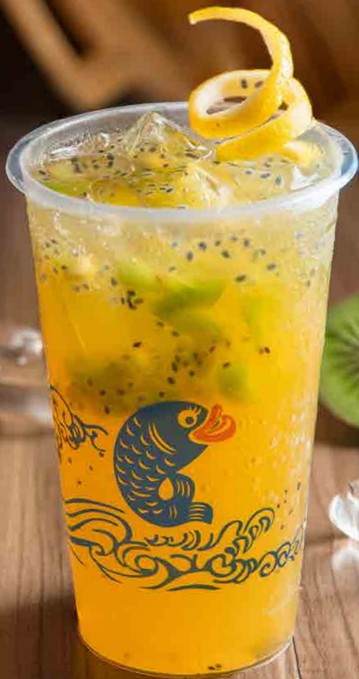
日落 Sunset Island Mixture of Kiwi, Lemon Juice & Selasih