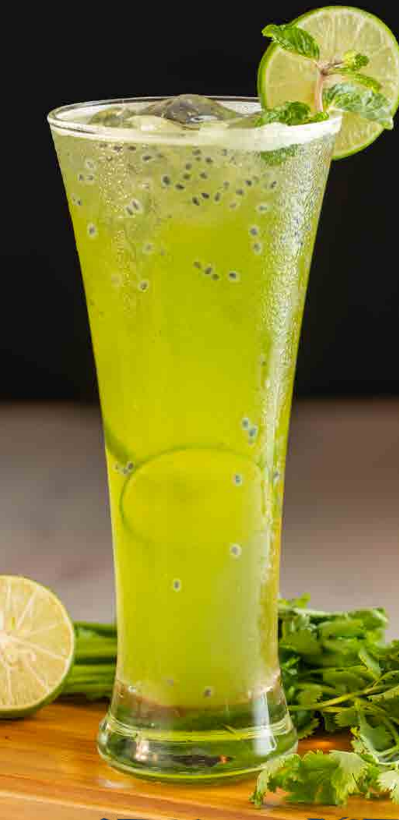
Green Passion Mix Corriander dan Lime