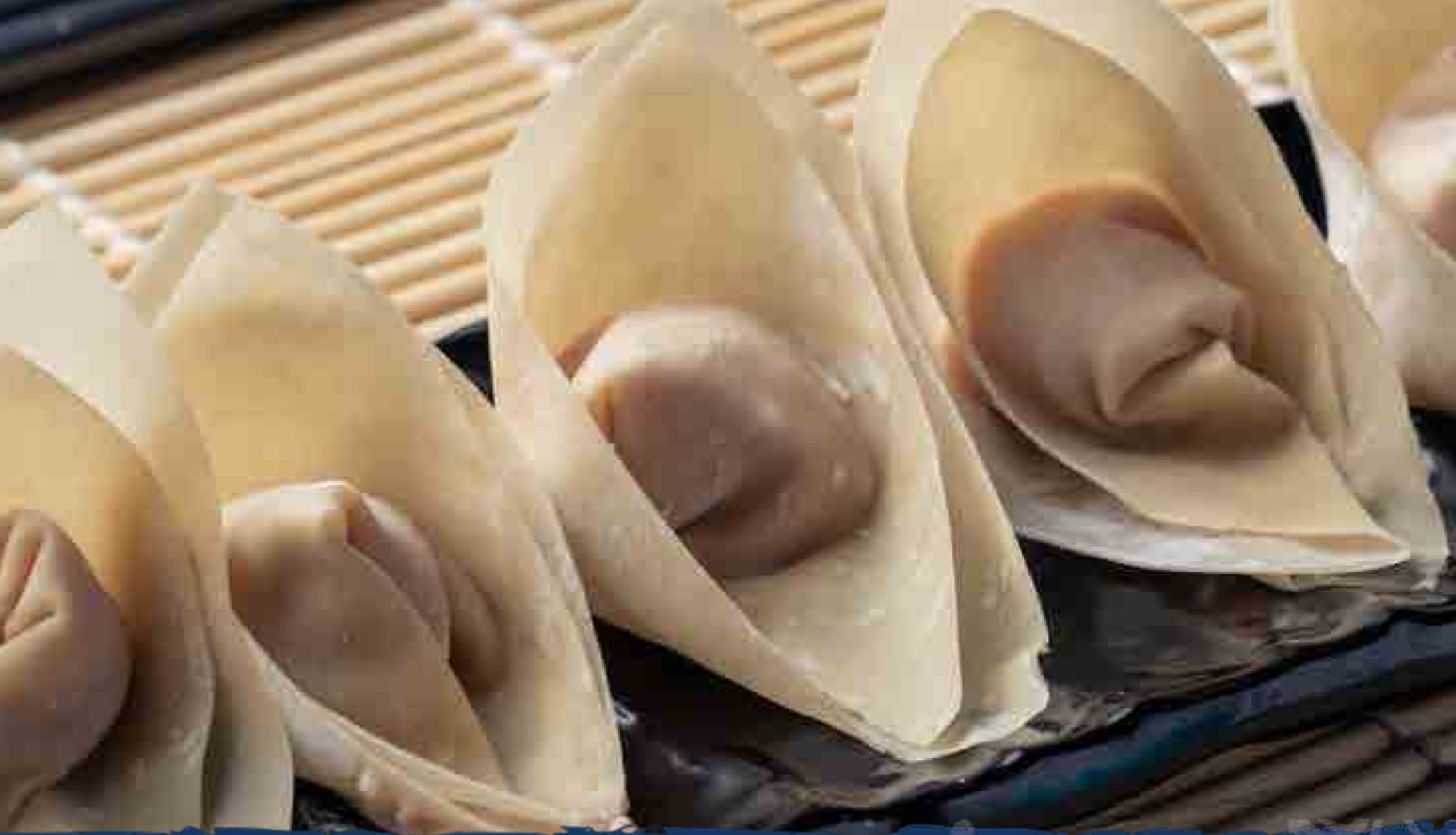
炒手 Pangsit Rebus Steamed Dumplings