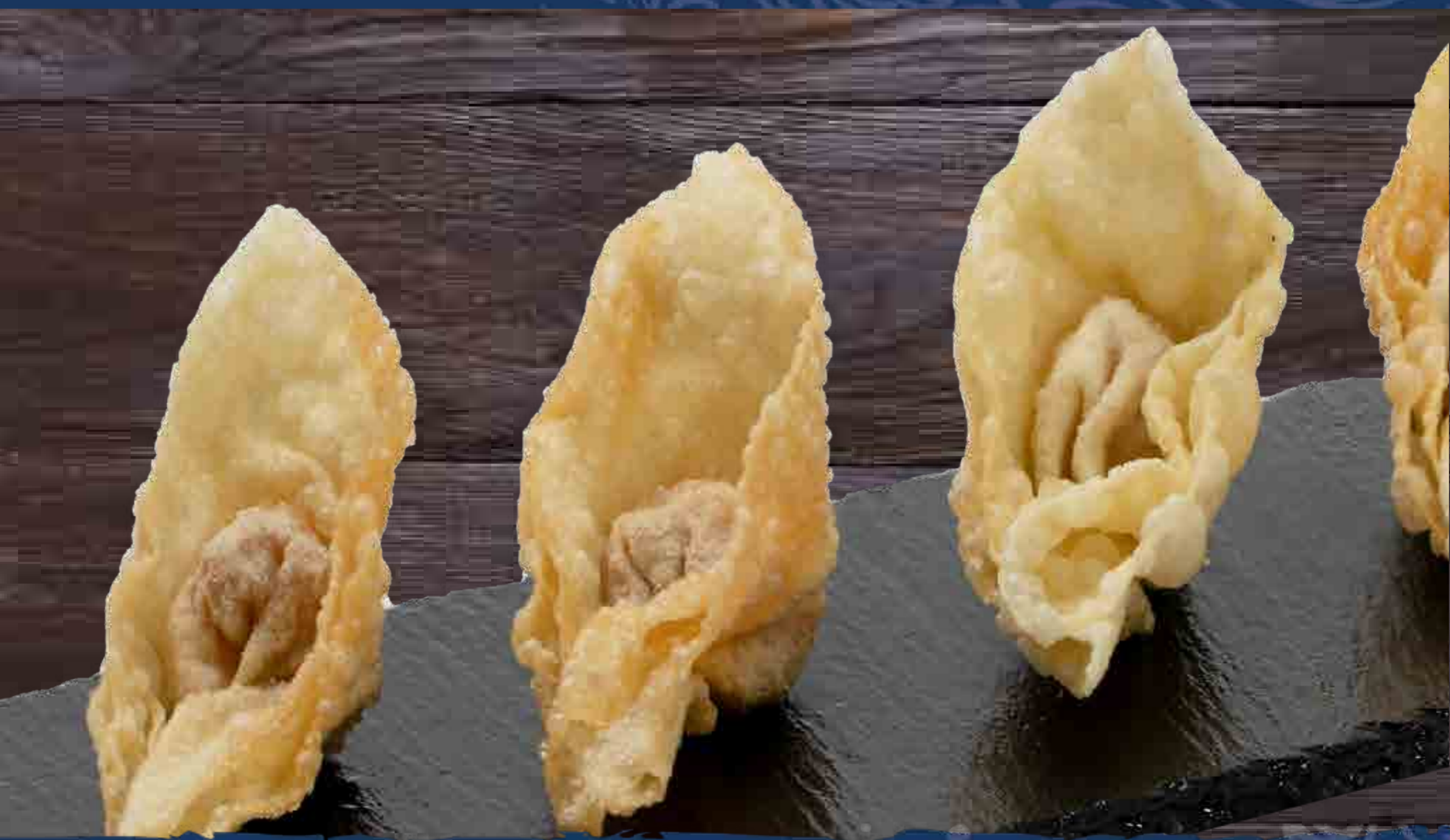
炸炒手 Pangsit Goreng Udang Fried dumplings