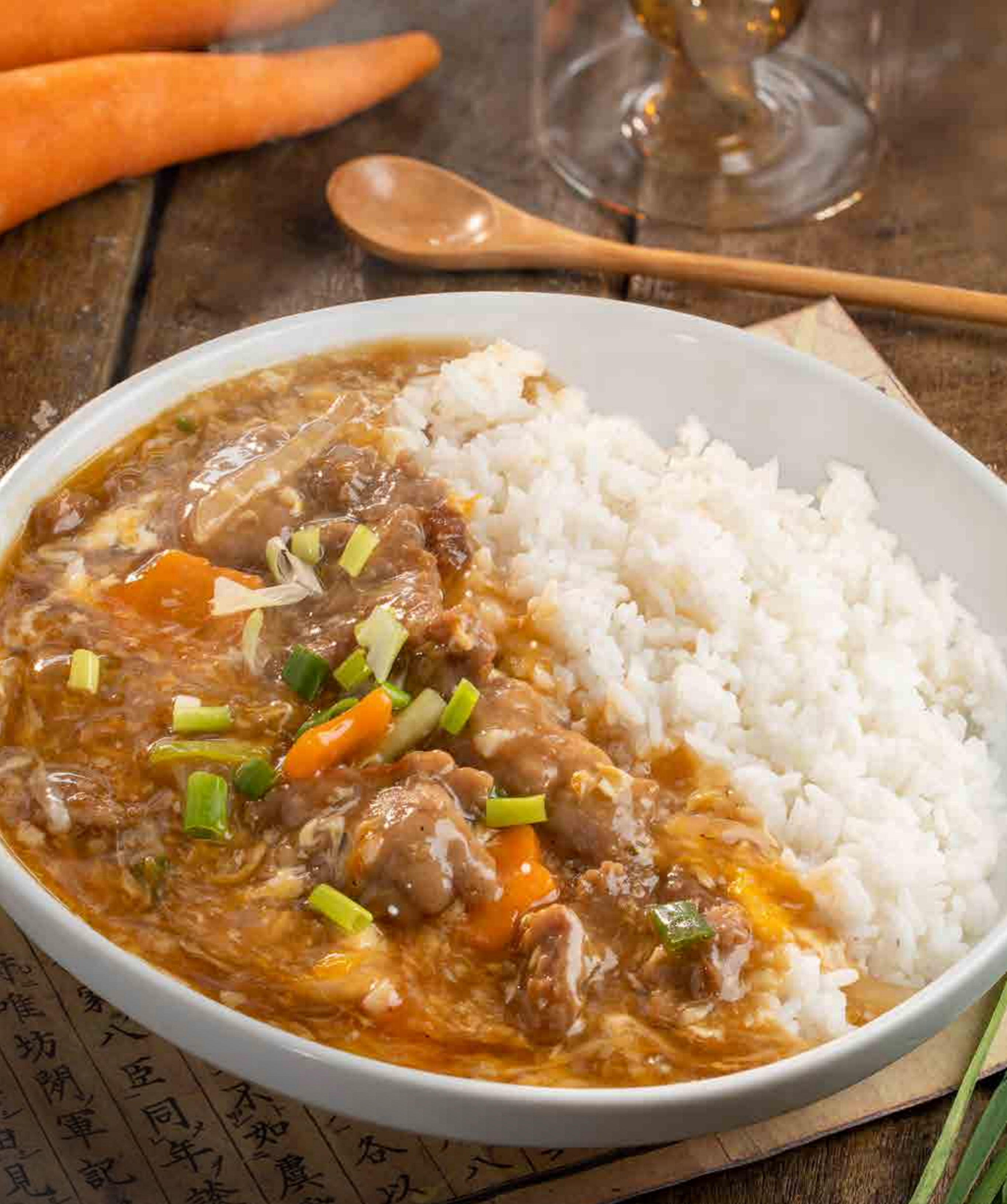
Egg Gravy with Beef & Rice