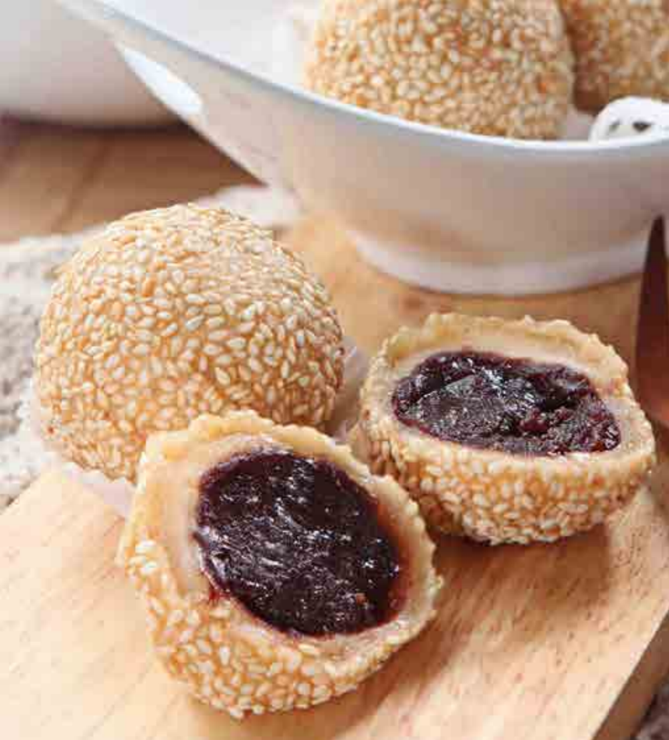
Onde Onde Red Bean 红豆芝麻球