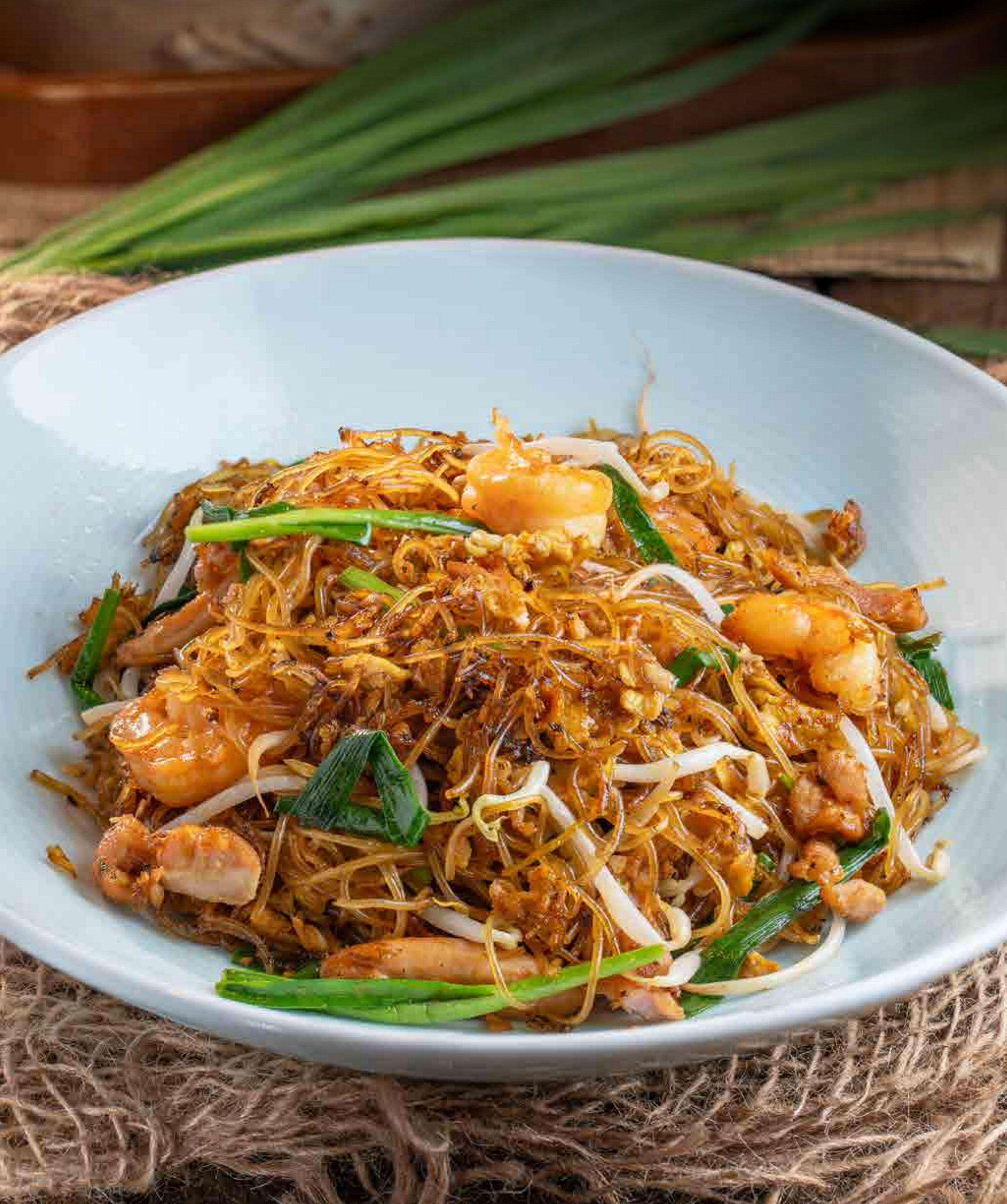
Fried Beehoon with Prawns and Chicken 虾鸡炒米粉