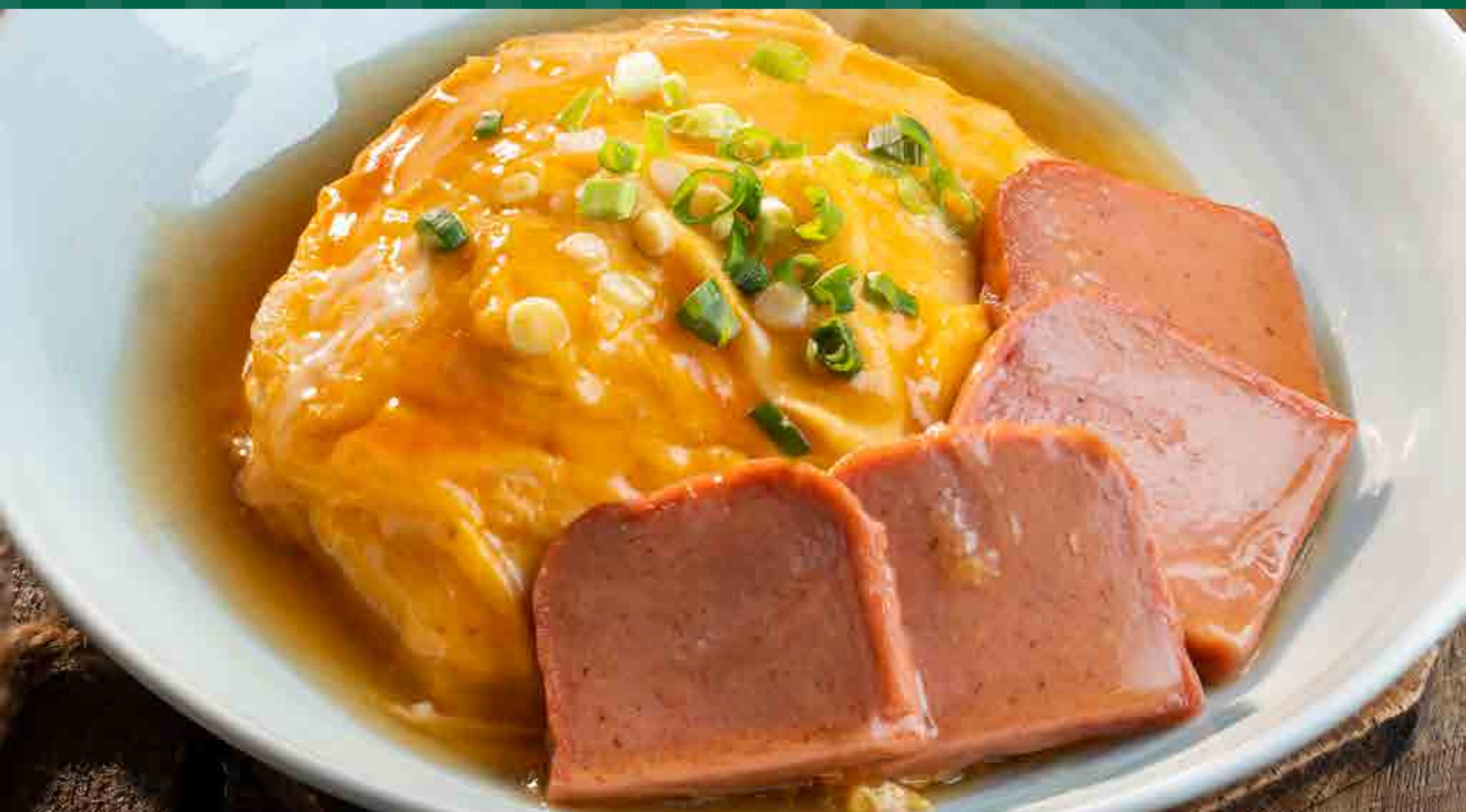
Chiffon Rice Beef Luncheon 午餐肉绵绵饭