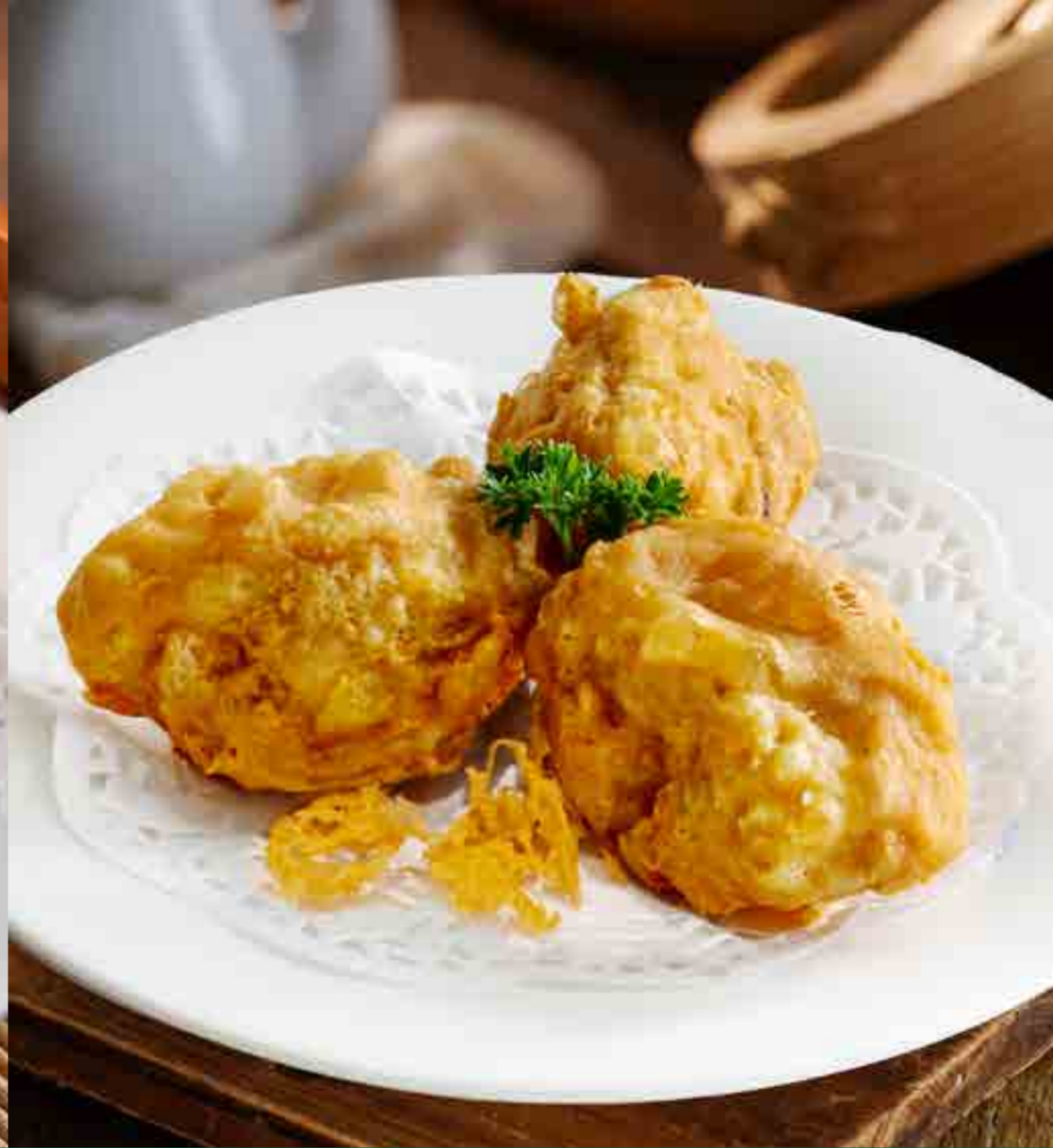
Fried Tofu Dumplings 炸豆腐饺