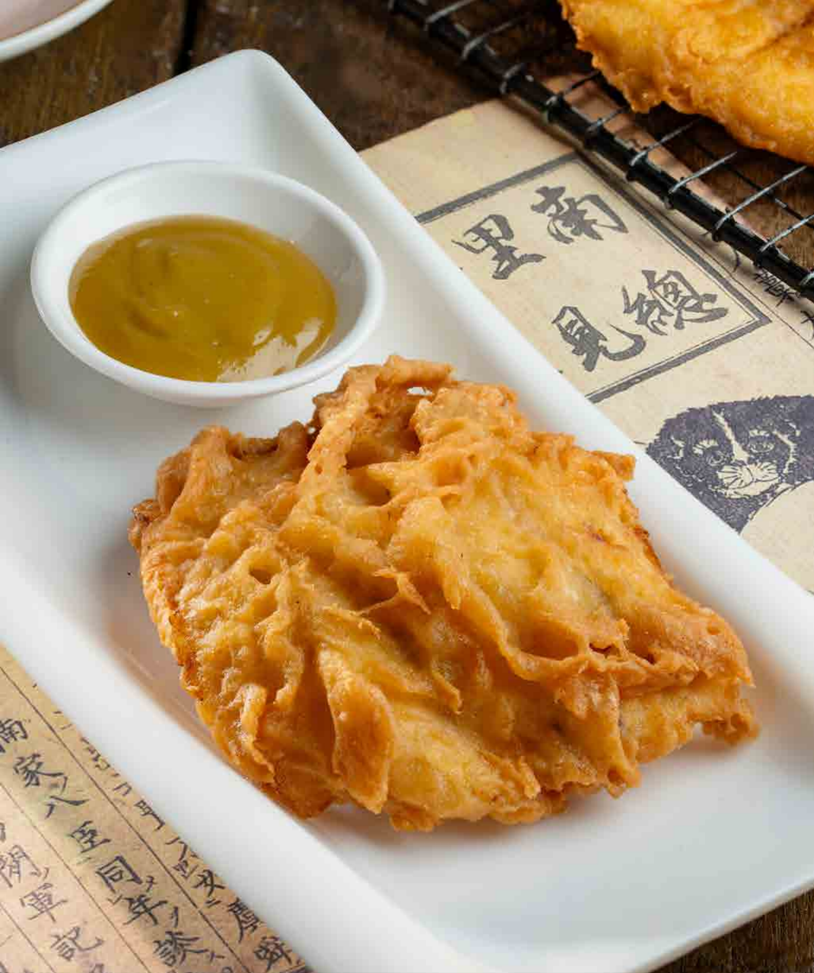
Golden Banana Kaya