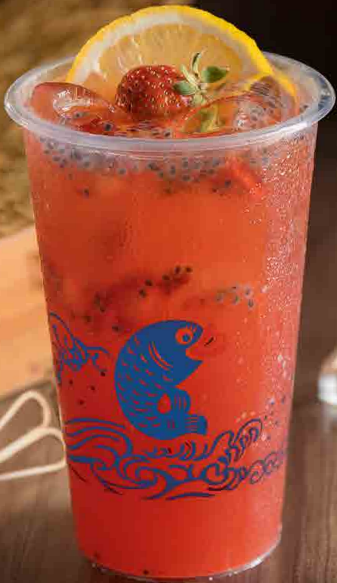
日出 Sunrise Island Mixture of Strawberry, Lemon Juice & Selasih