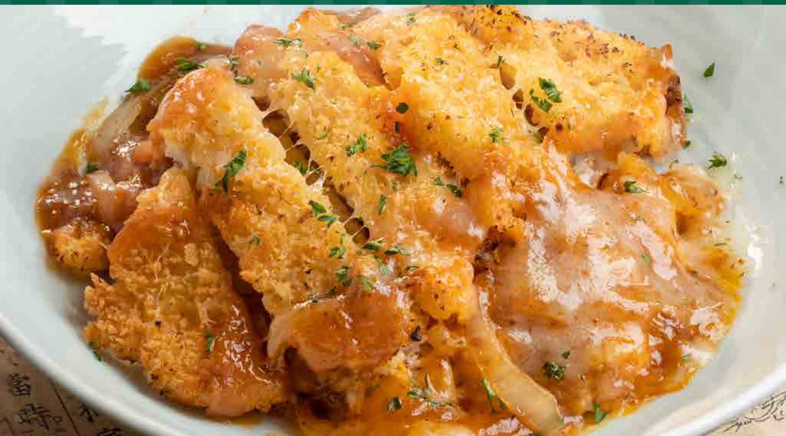
Flamed Rice with Chicken Katsu Bolognaise 吉列鸡扒焗饭