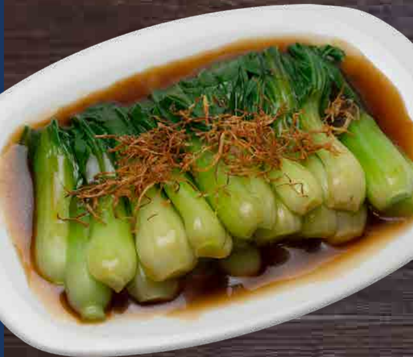
蚝油小白菜 Pak Coy Saus Tiram Pak Choi in Oyster sauce