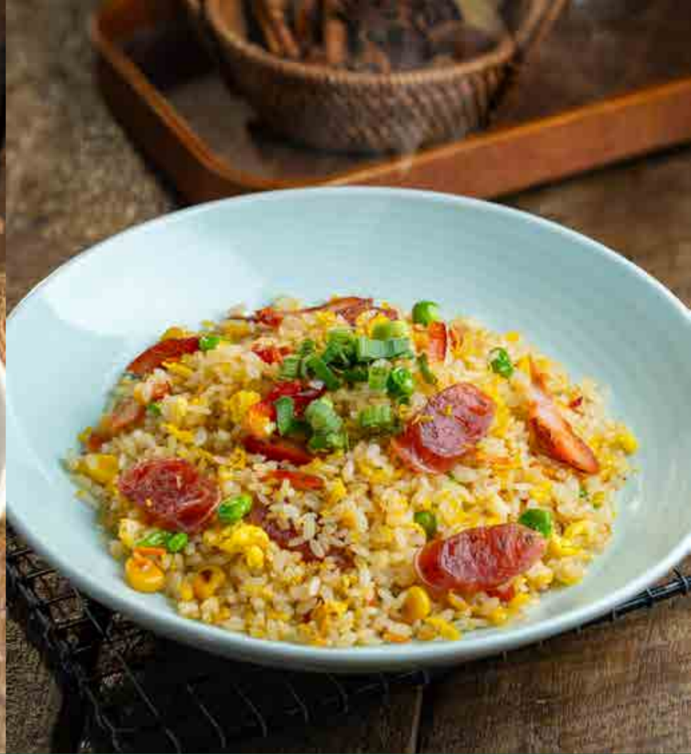
Fried Rice Yang Chow