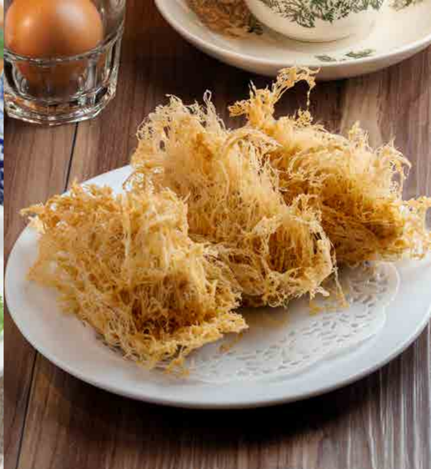
Taro Chicken & Mushroom