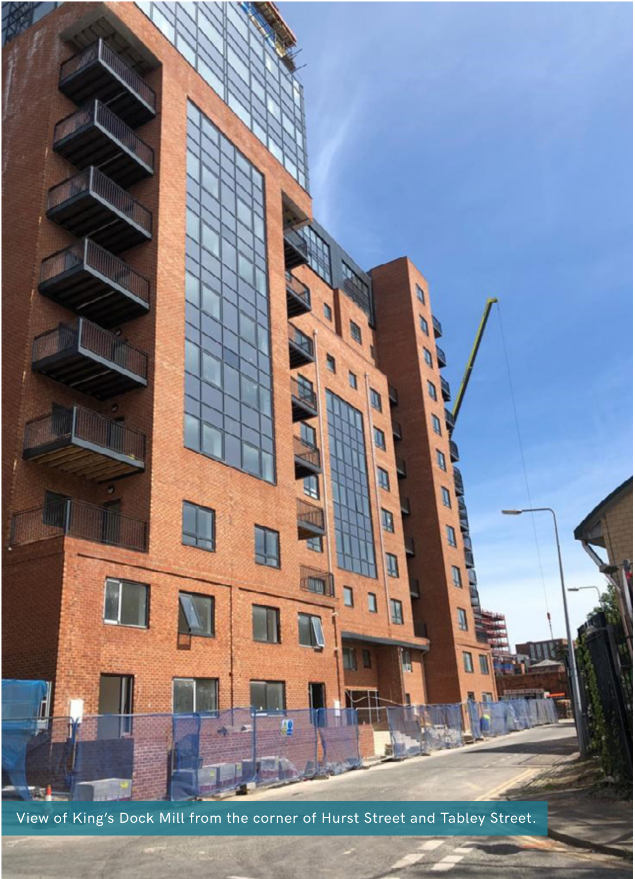
View of King's Dock Mill from the corner of Hurst Street and Tabley Street.