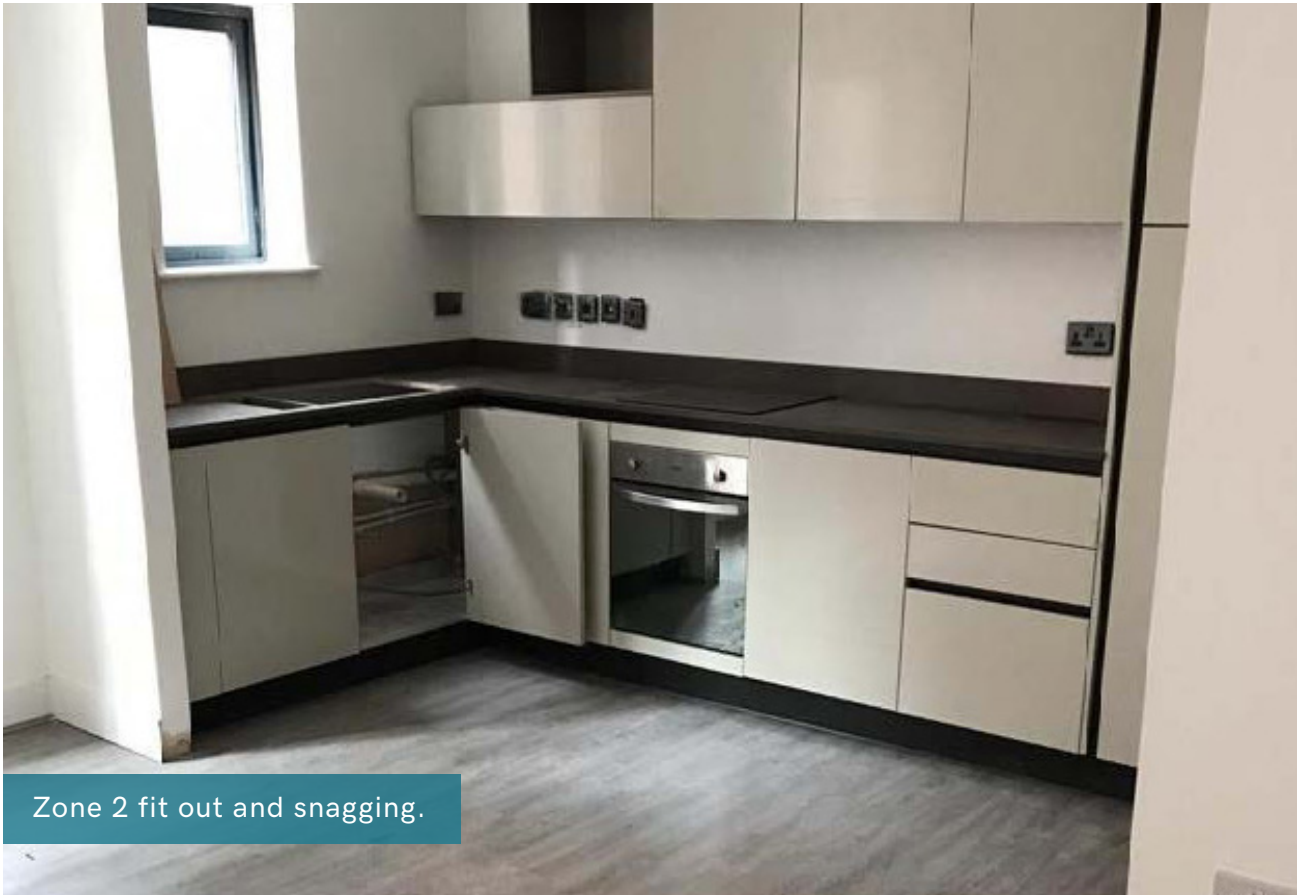
Zone 2 fit out and snagging.