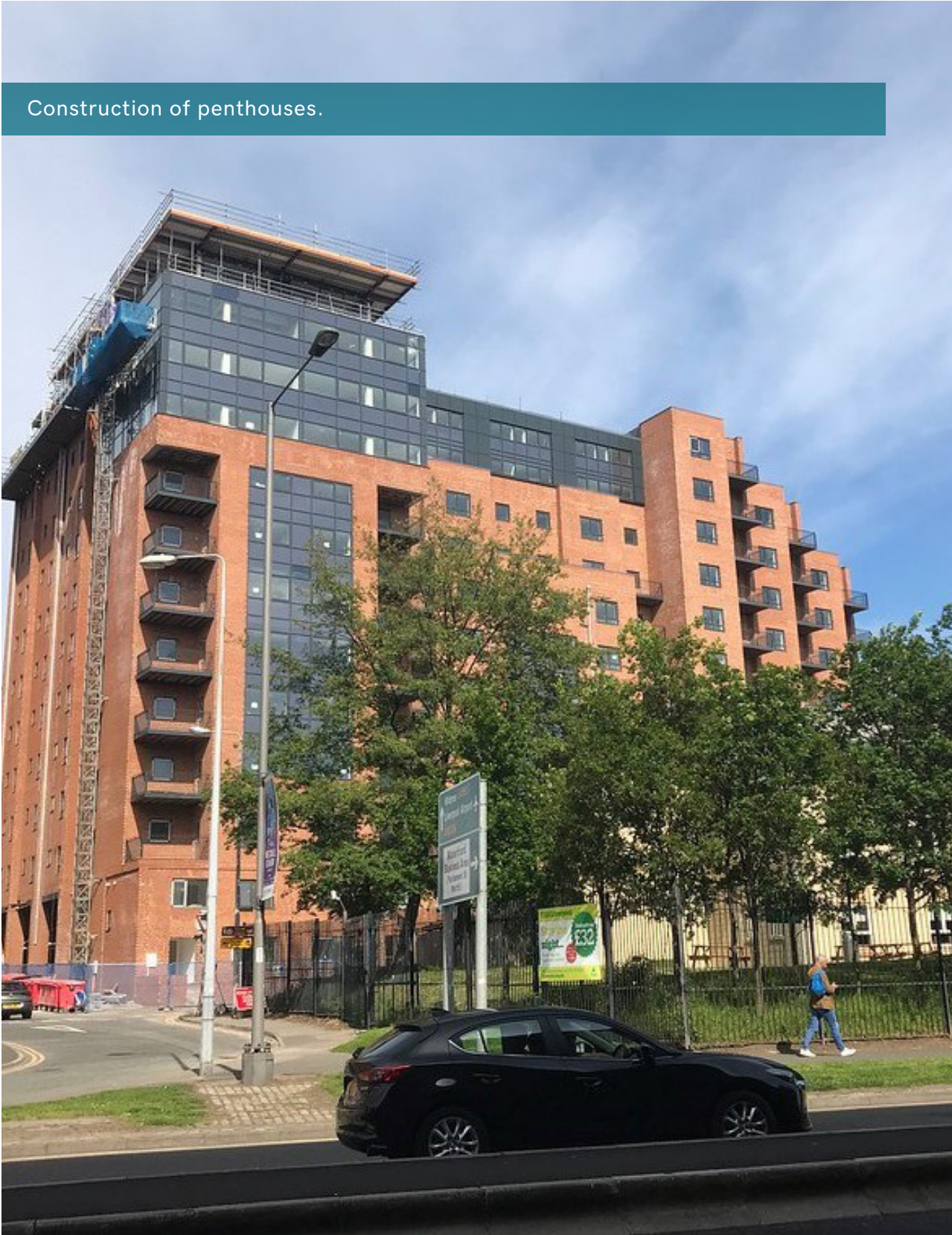
Construction of penthouses.