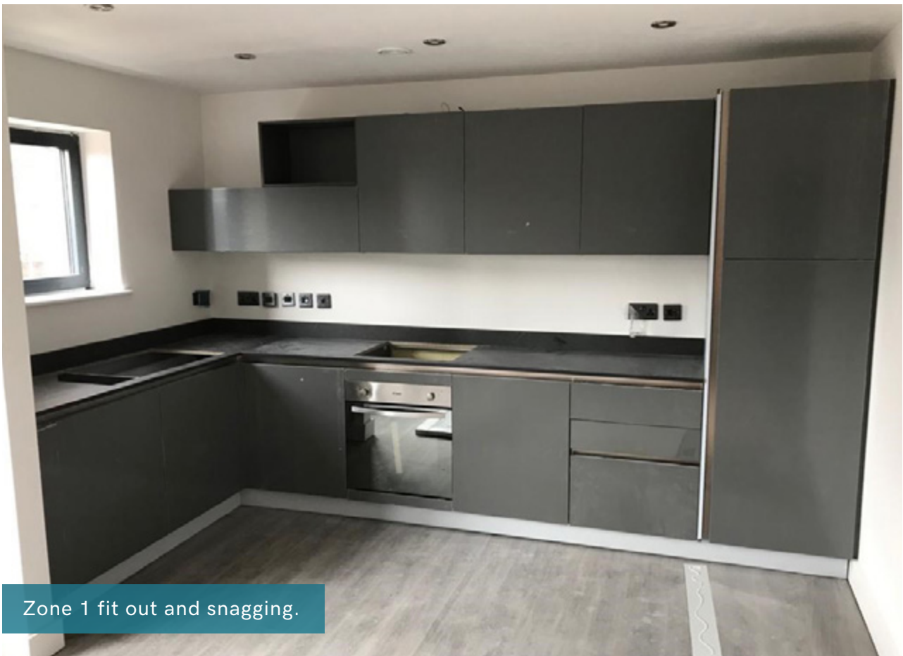
Zone 1 fit out and snagging.

Section 278 works including flagging and landscaping to Hurst Street are 90% completed.