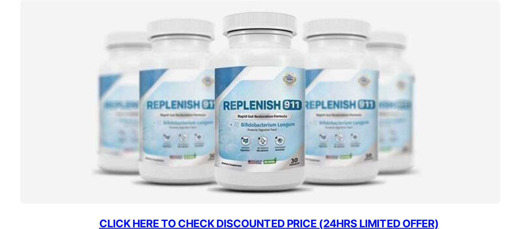
PhytAge Labs Replenish 911 assumes an imperative function in improving your gut wellbeing, and you can

Replenish 911 is a quality blend of probiotics that may work to increase the nutrient absorption of the food you eat, combat gut diseases, rebalance your digestive system, and can improve your overall health.