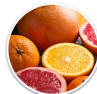
Bigarade Orange (citrus bioflavonoids)