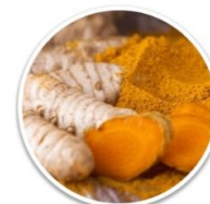
Turmeric Rhizome (turmeric root)