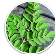
Drumstick Tree Leaf (moringa leaf)