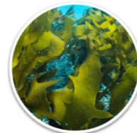
Golden Algae (fucoxanthin)

6 clinically-proven ingredients that target inner body temperature supercharging your calorie-burning engine