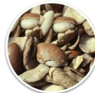
Dika Nut (african mango seed)