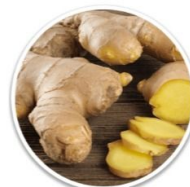
Ginger Rhizome (ginger root)