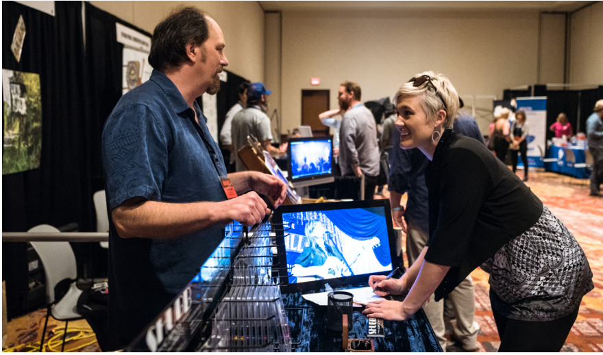
EXHIBIT HALL BOOTH

The Exhibit Hall is located in the Conference Hotel and is the best way to meet Americana industry professionals face-to-face. Purchase of a booth includes 1 conference registration and 2 additional booth worker passes. Music industry related exhibitors only.