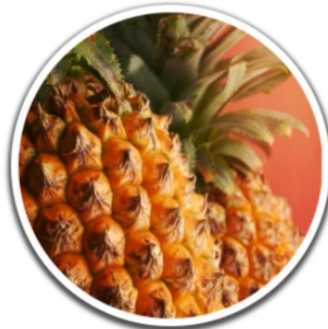
Pineapple ( ananas comosus )