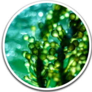
Polynesian 'Imu Algae ( arthrospira platensis )

6 clinically-proven ingredients that trigger the release of the "Fat Swarm" and supercharge your weight loss.