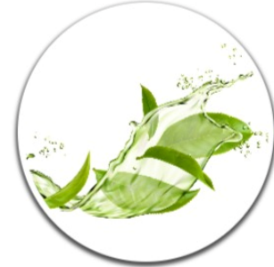
South Pacific Green Tea ( camellia sinensis )