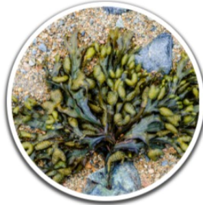
Seaweed ( fucoxanthin )