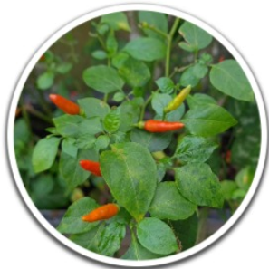
Capsaicin ( capsicum annuum )