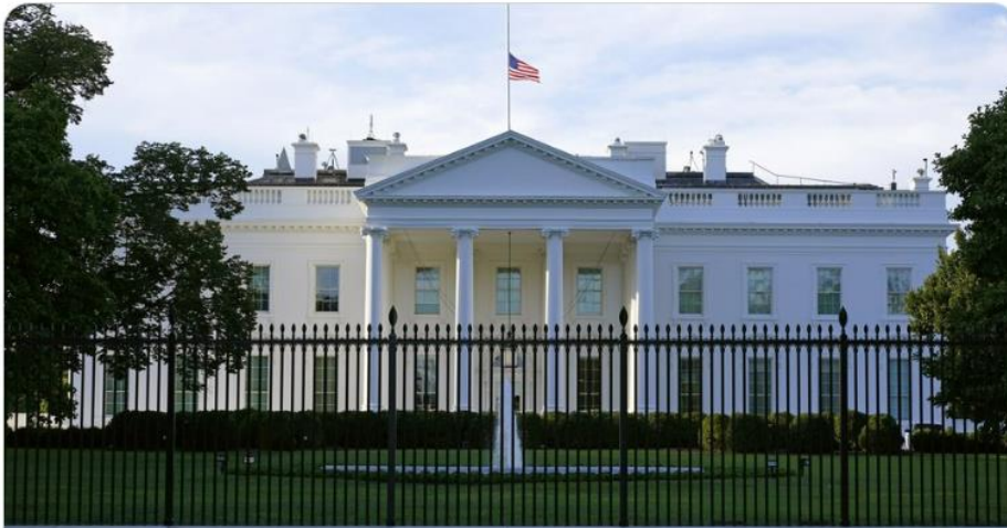
AP sources: Woman accused of sending ricin letter arrested WASHINGTON (AP) — A woman suspected of sending an envelope containing the poison ricin, which was addressed to White House, has been arrested at the New... apnews.com

BREAKING: Woman suspected of sending envelope containing the poison ricin addressed to White House has been arrested at New York-Canada border, @AP sources say.