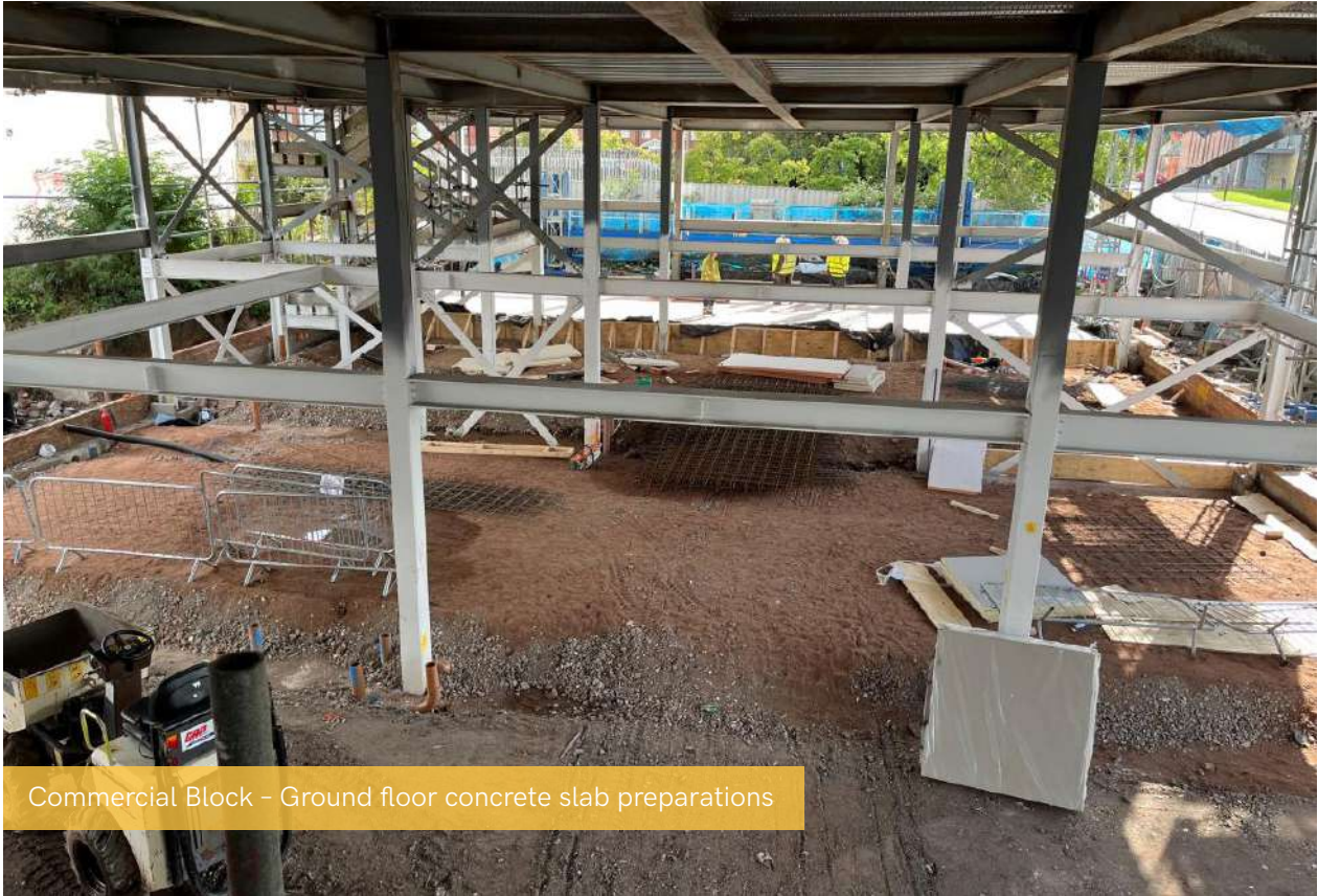
Commercial Block - Ground floor concrete slab preparations