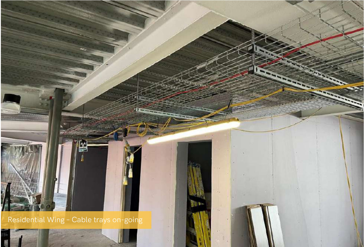
Residential Wing - Cable trays on-going