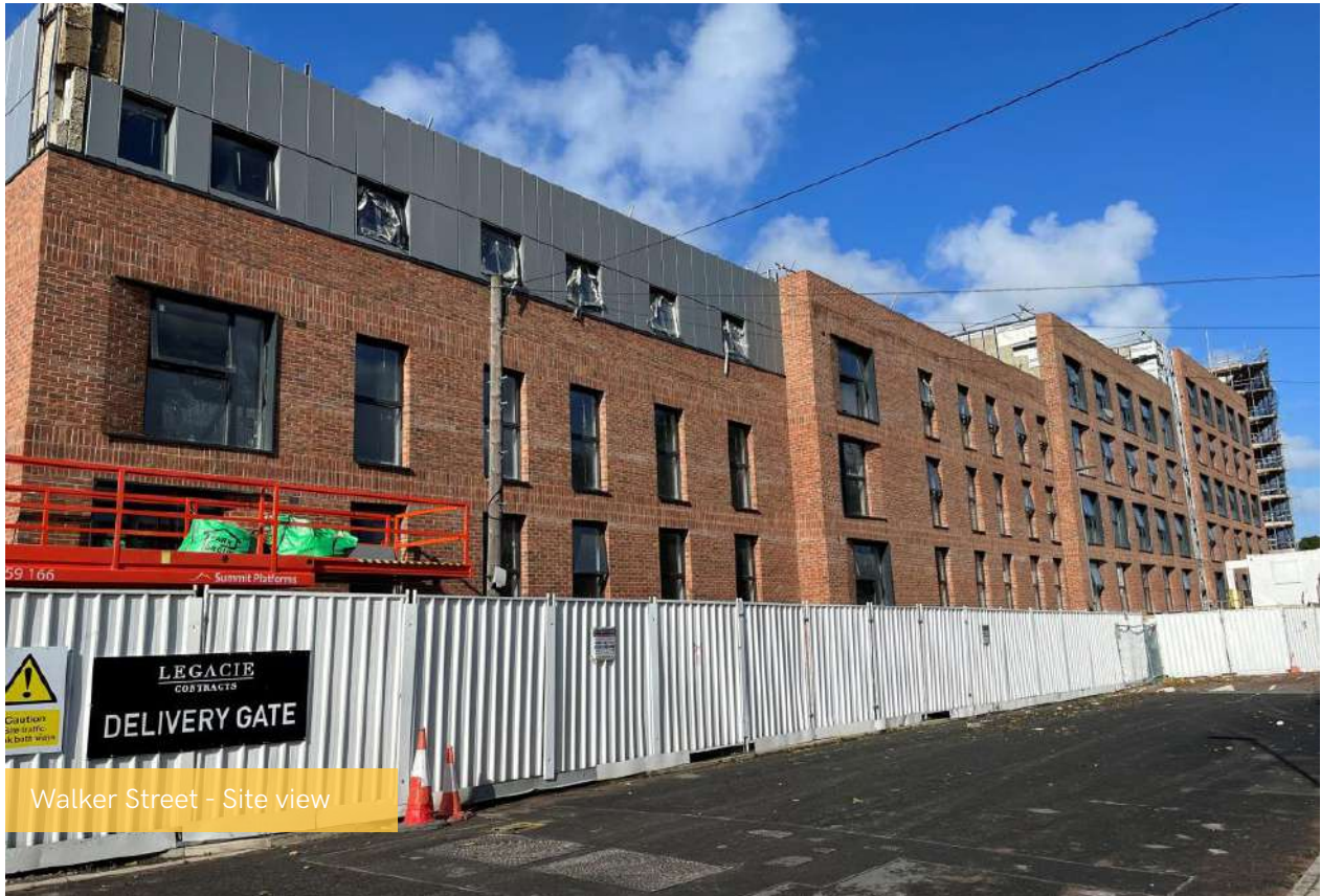
Walker Street - Site view