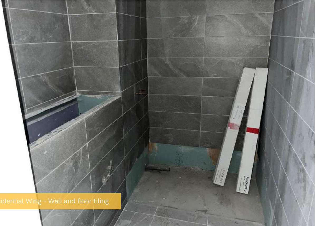
Residential Wing - Wall and floor tiling