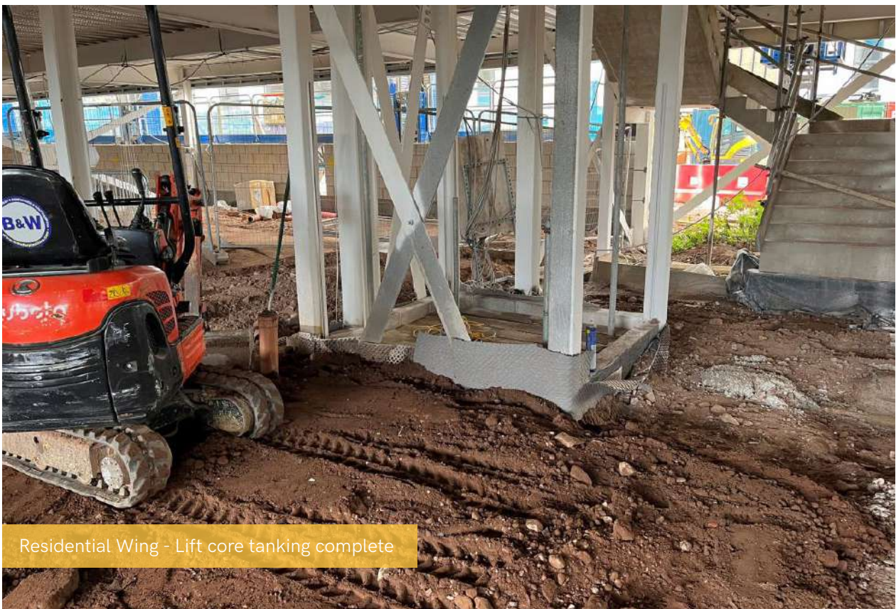
Residential Wing - Lift core tanking complete