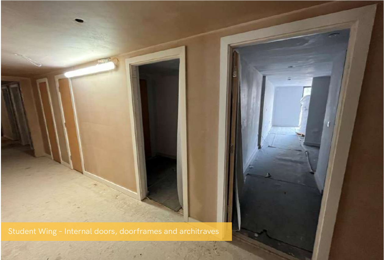
Student Wing - Internal doors, doorframes and architraves