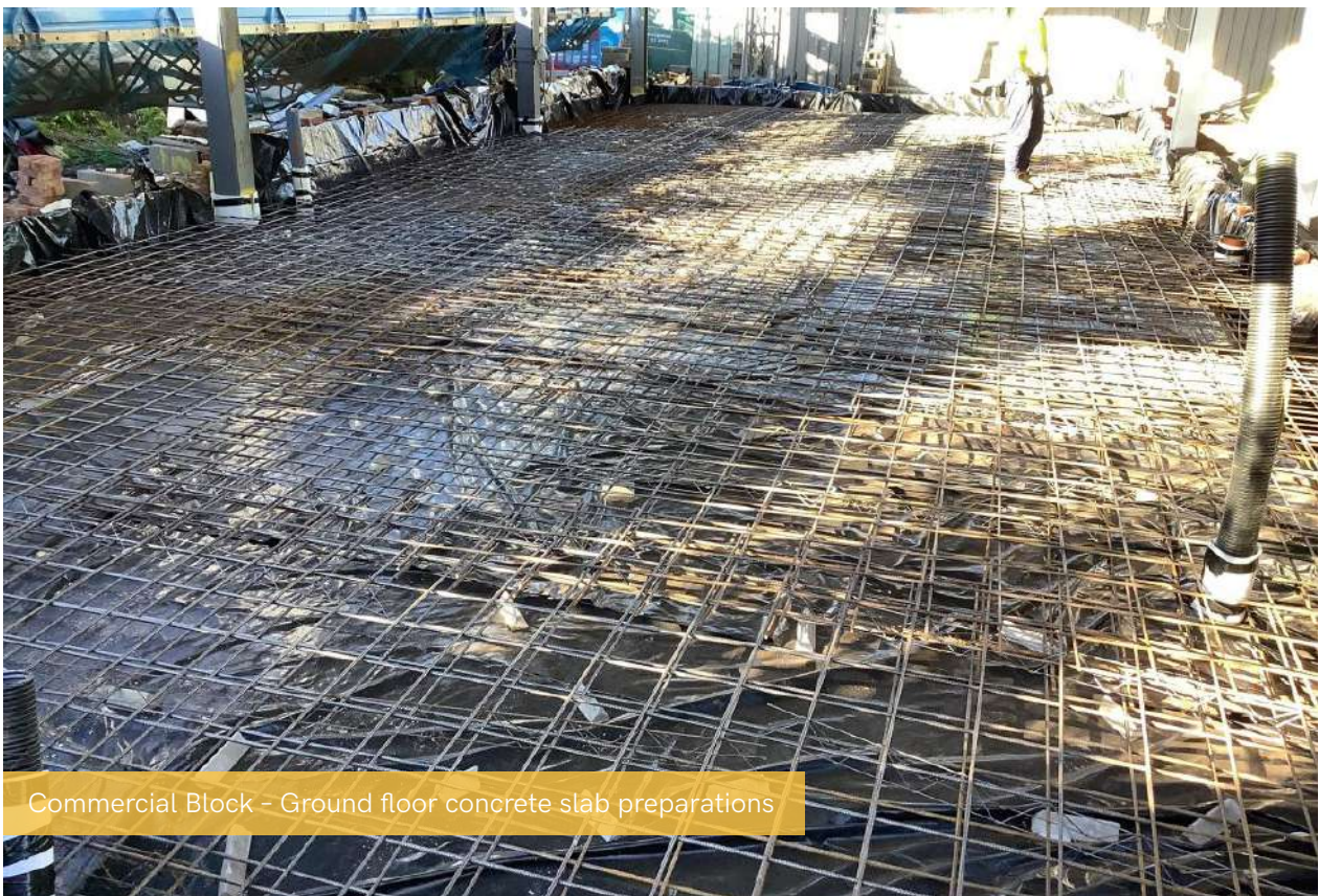
Commercial Block - Ground floor concrete slab preparations