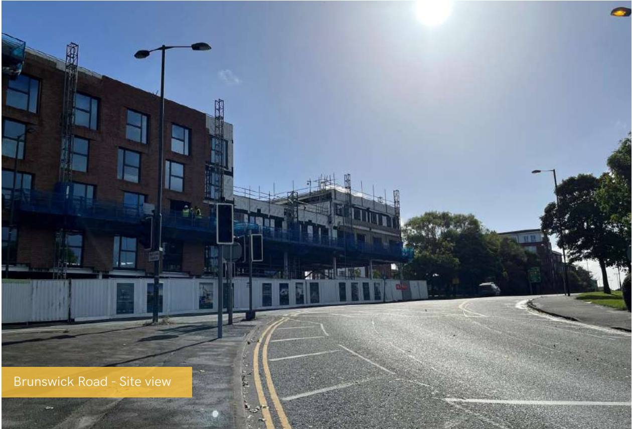
Brunswick Road - Site view