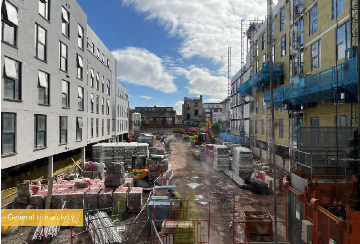
General site activity