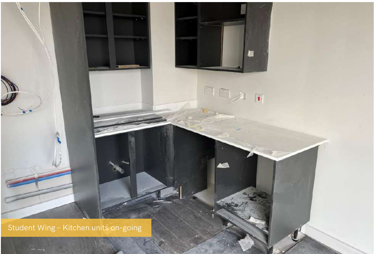
Student Wing - Kitchen units on-going