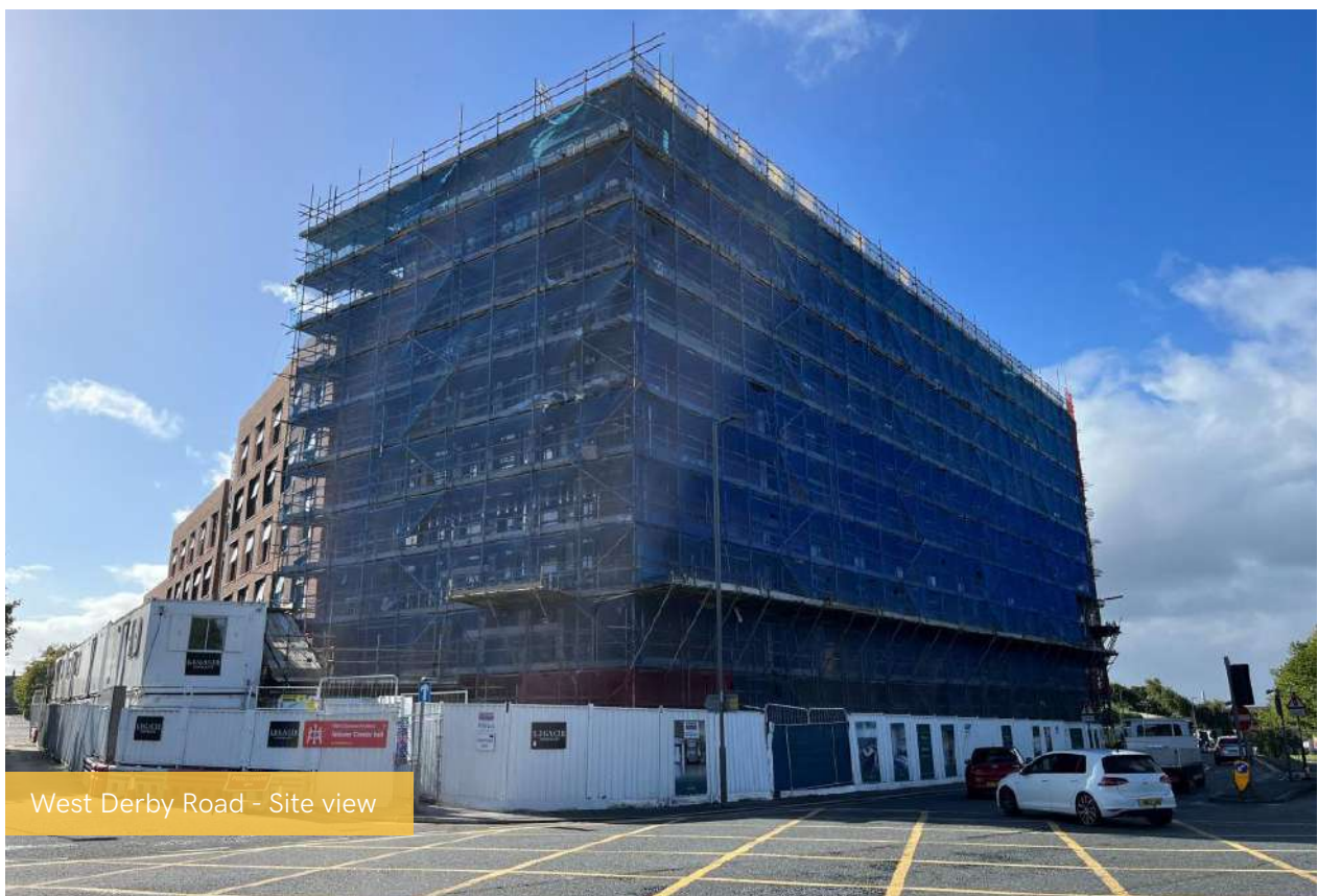
West Derby Road - Site view