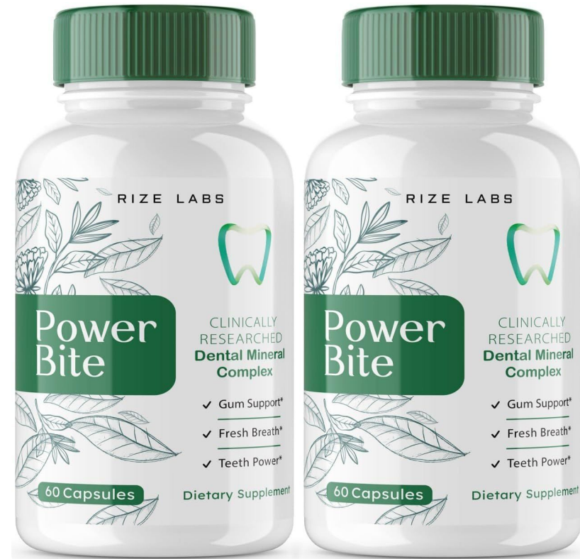
A close-up photo of PowerBite Supplement

Furthermore, the supplement has garnered positive feedback for its rapid absorption and noticeable impact on overall well-being. Whether it's the convenient form factor or the scientifically-backed ingredients, the reviews consistently highlight the positive impact of PowerBite on their daily routines.