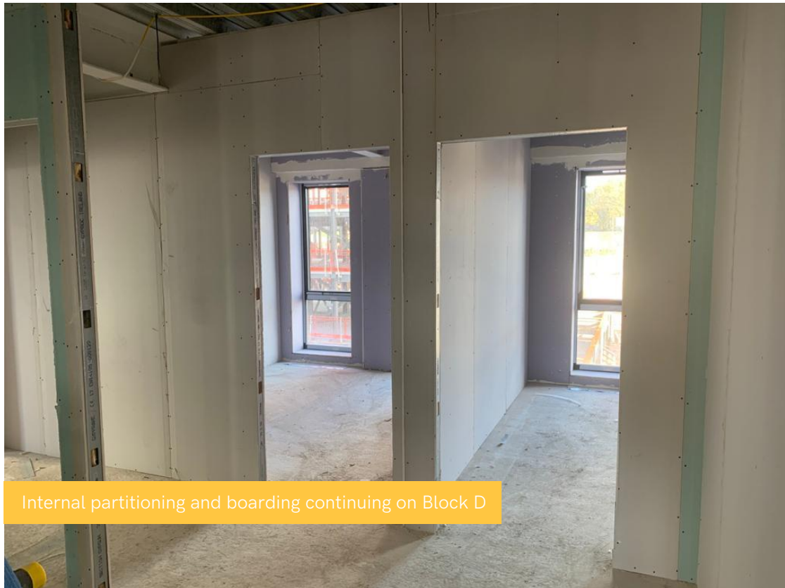
Internal partitioning and boarding continuing on Block D