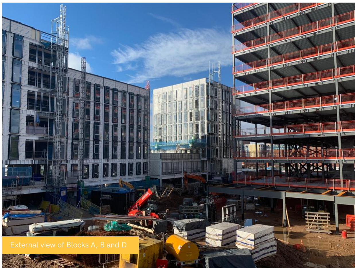
External view of Blocks A, B and D