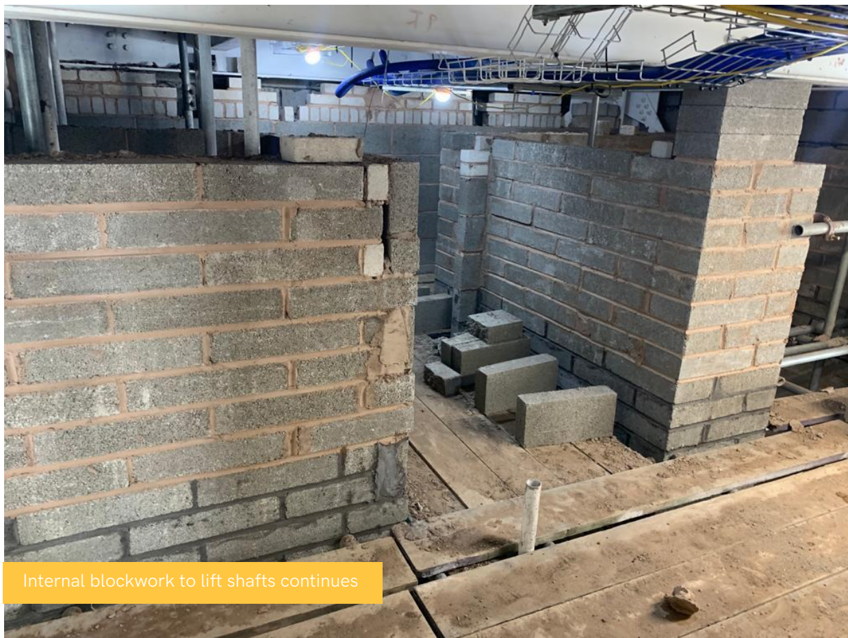
Internal blockwork to lift shafts continues