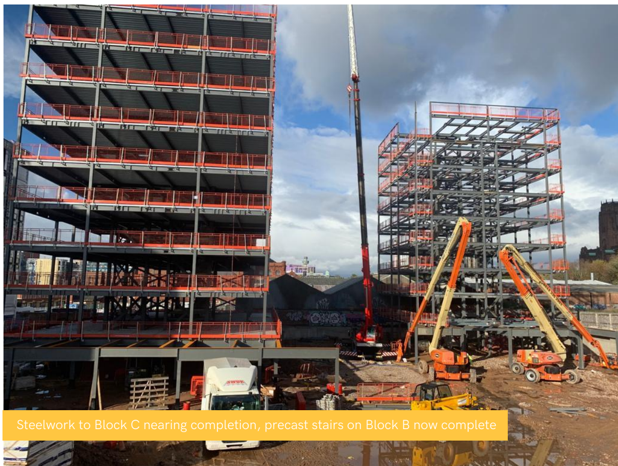
Steelwork to Block C nearing completion, precast stairs on Block B now complete