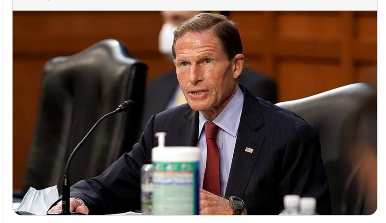
1:56 PM · Nov 10, 2020 · Twitter for Android

Blumenthal condemns Barr authorization of DOJ election fraud investigations: "Deeply troubled" hill.cm/SGTeIQA