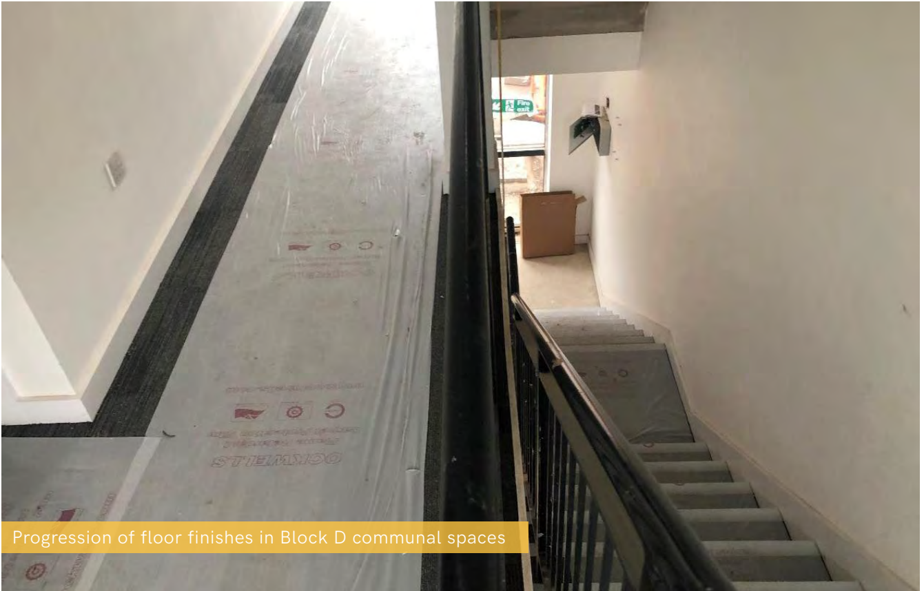
Progression of floor finishes in Block D communal spaces