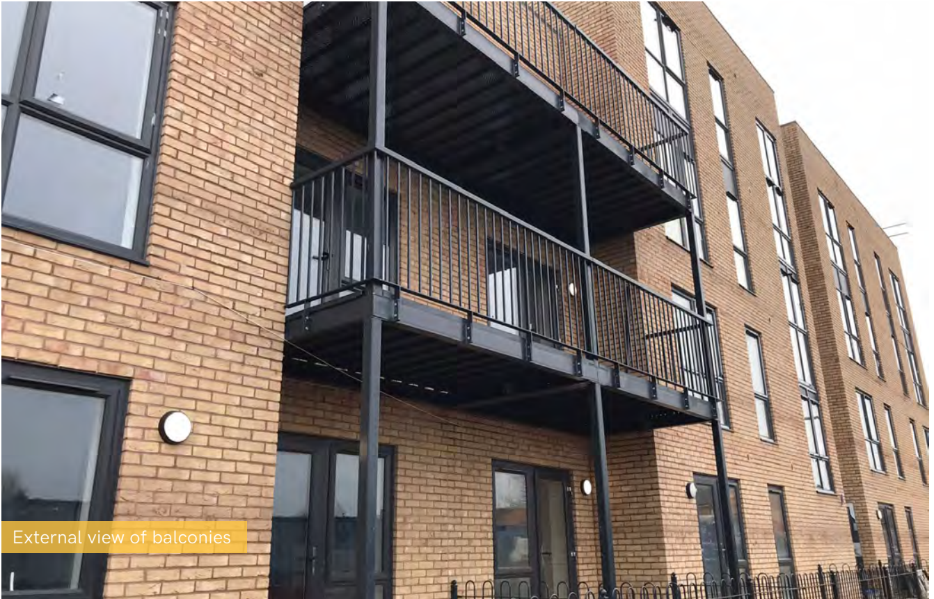
External view of balconies