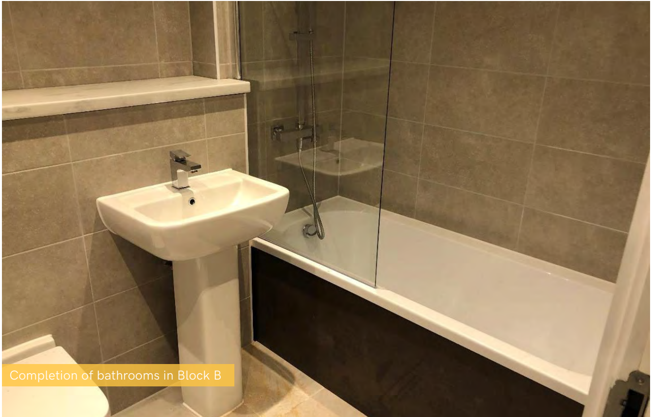
Completion of bathrooms in Block B