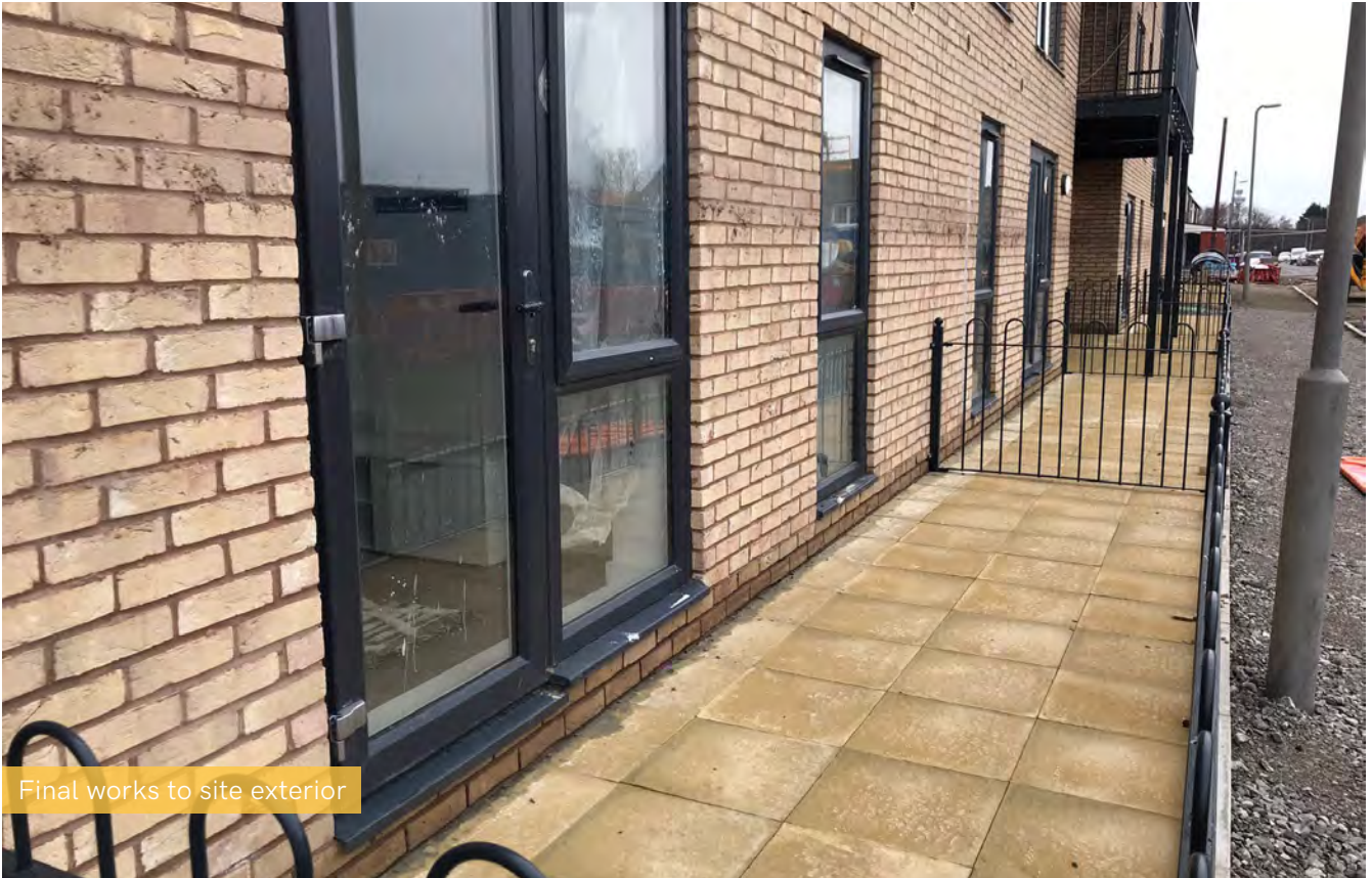
Final works to site exterior