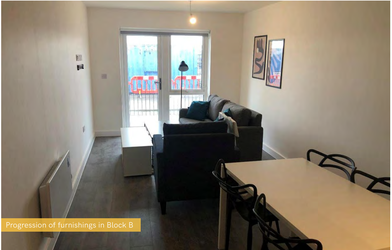
Progression of furnishings in Block B