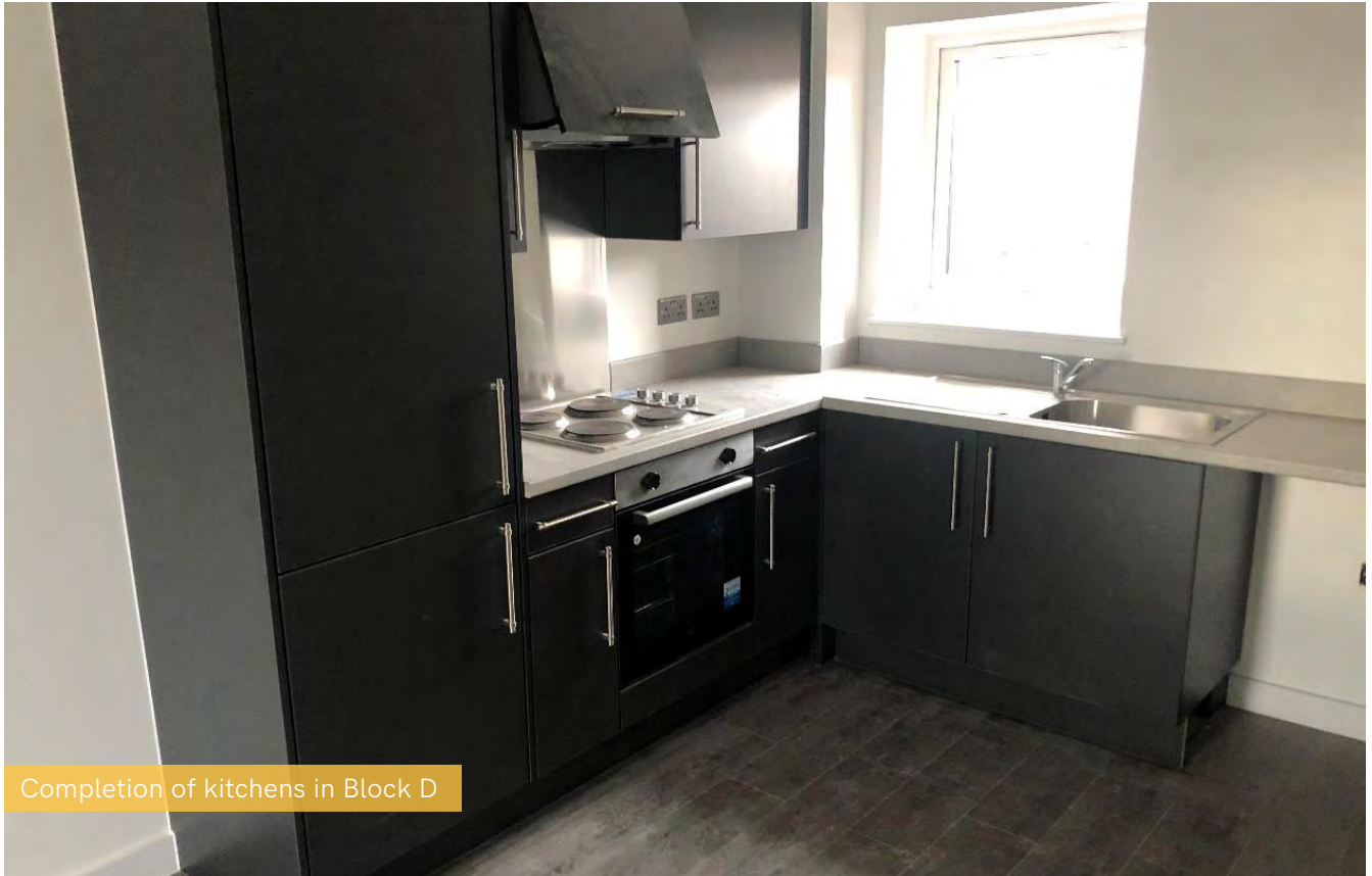
Completion of kitchens in Block D