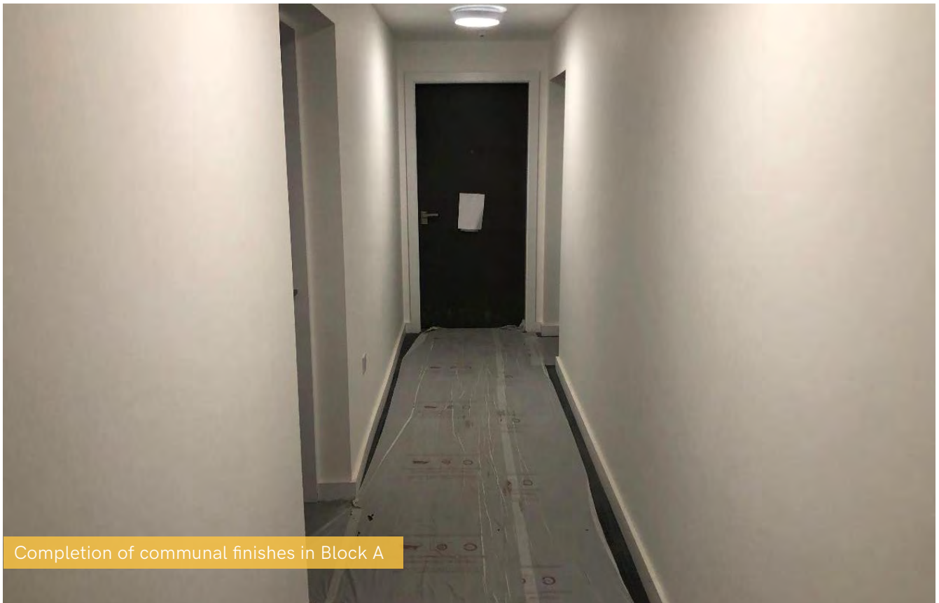
Completion of communal finishes in Block A