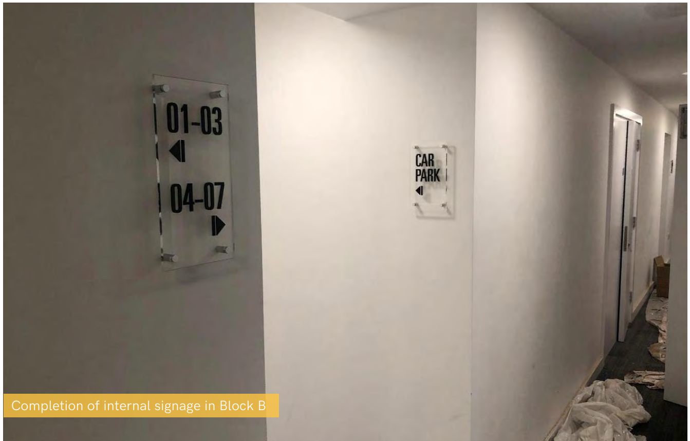
Completion of internal signage in Block B