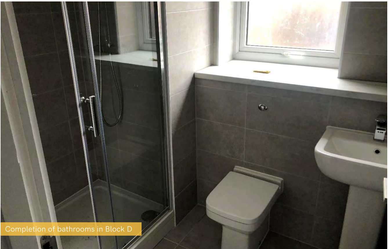
Completion of bathrooms in Block D