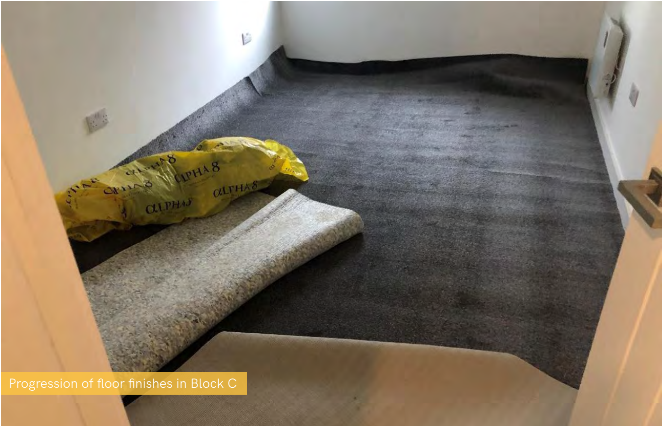
Progression of floor finishes in Block C