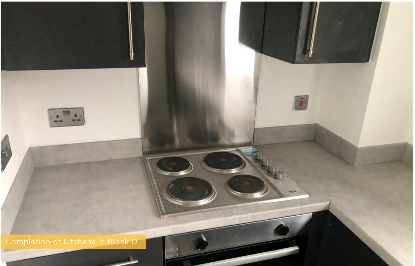
Completion of kitchens in Block D