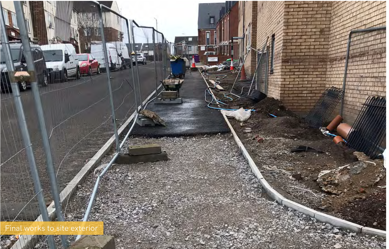
Final works to site exterior