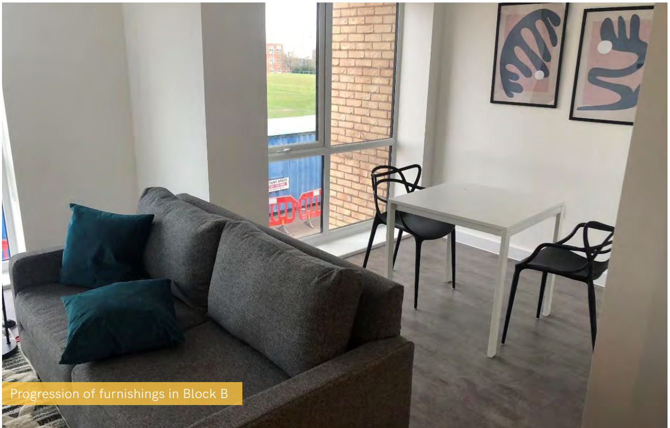
Progression of furnishings in Block B