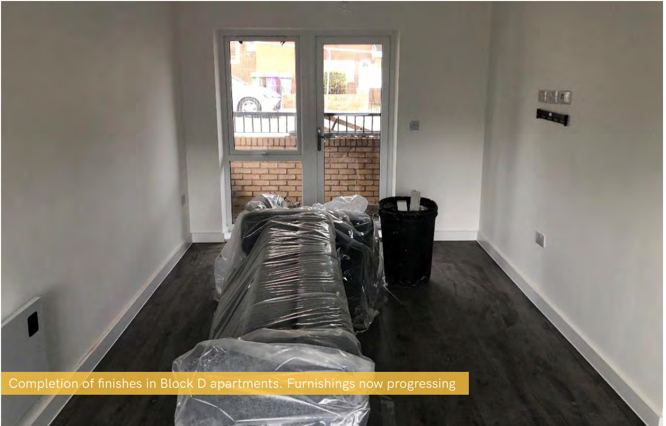
Completion of finishes in Block D apartments. Furnishings now progressing