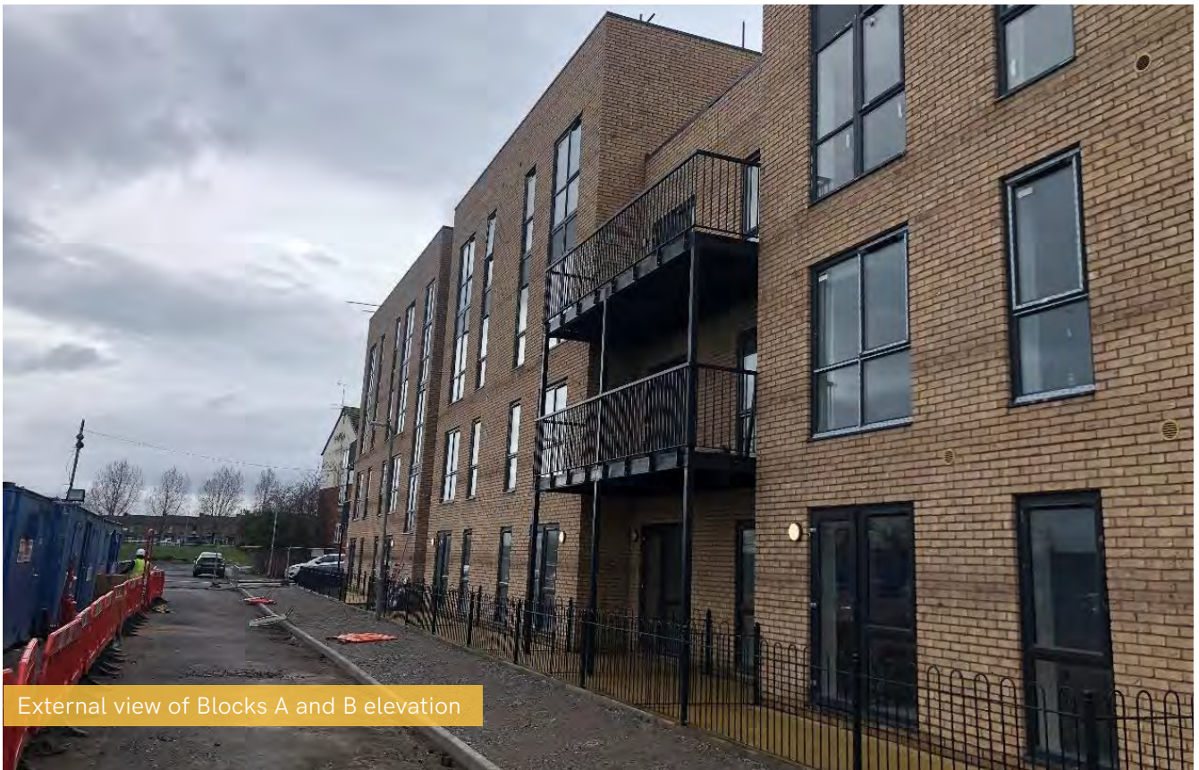
External view of Blocks A and B elevation