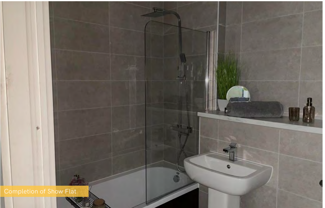
Completion of Show Flat