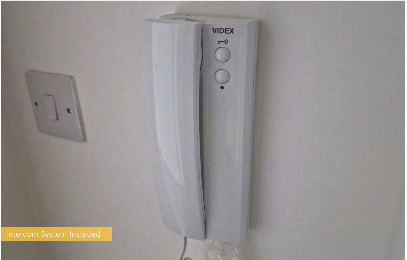
Intercom System Installed