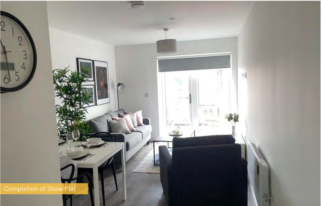
Completion of Show Flat