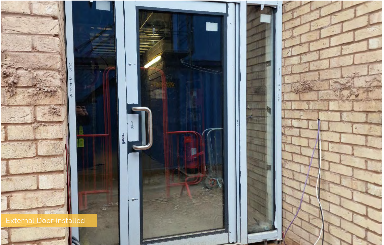
External Door installed