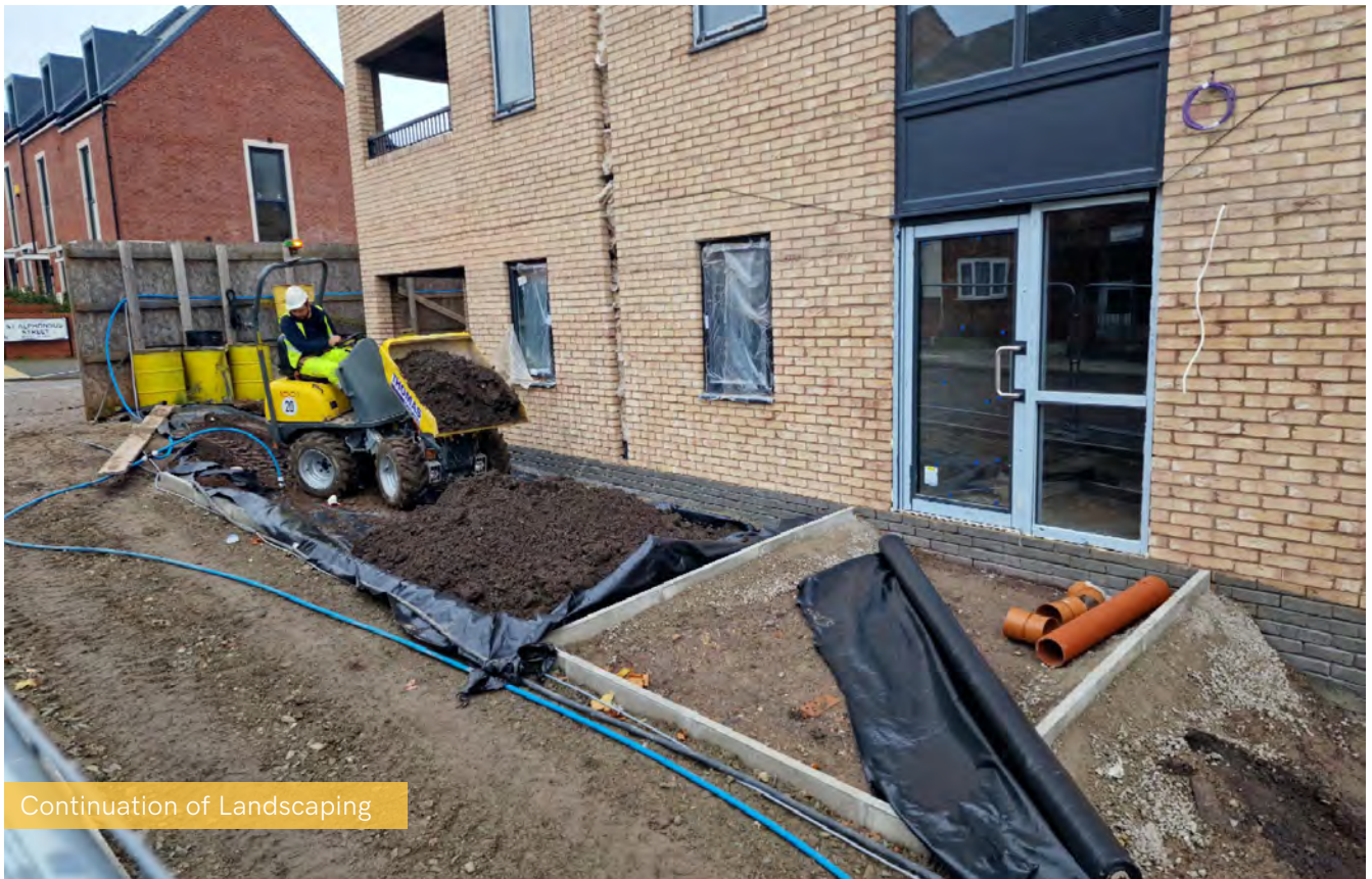
Continuation of Landscaping