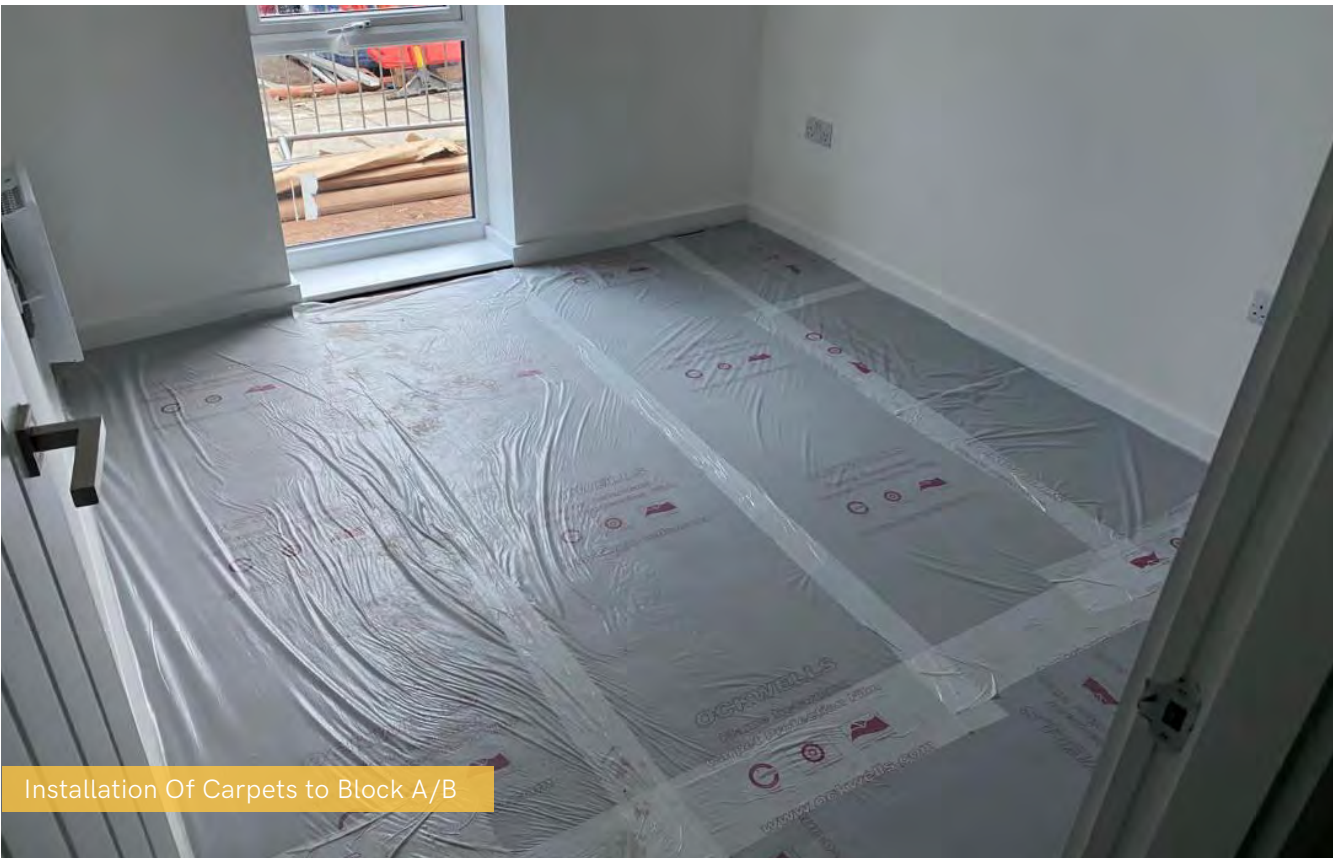
Installation Of Carpets to Block A/B