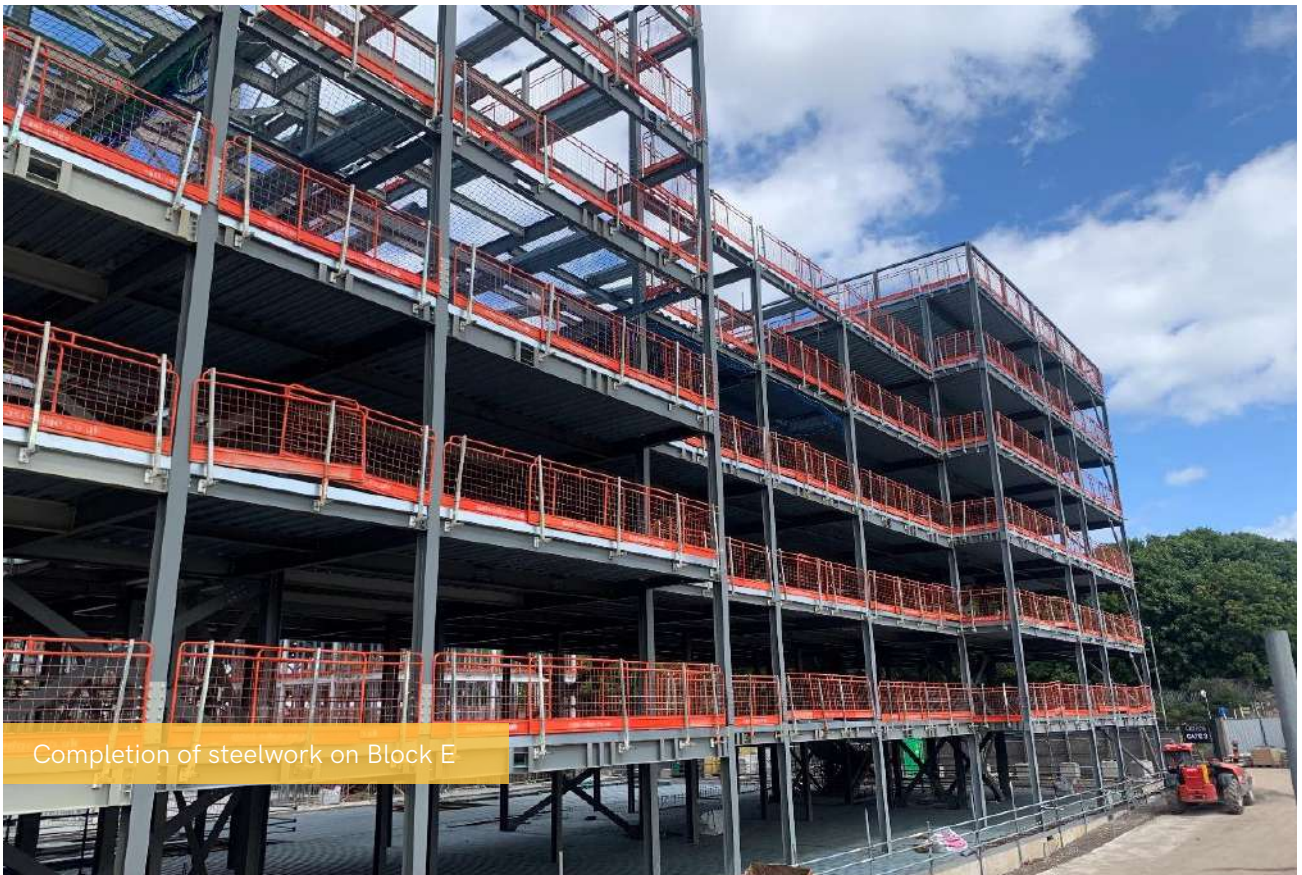
Completion of steelwork on Block E