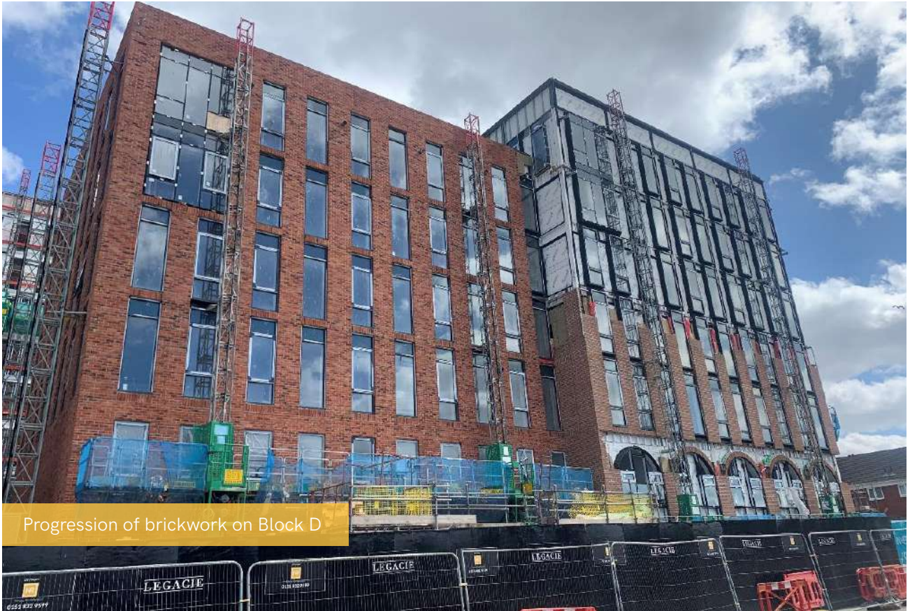
Progression of brickwork on Block D