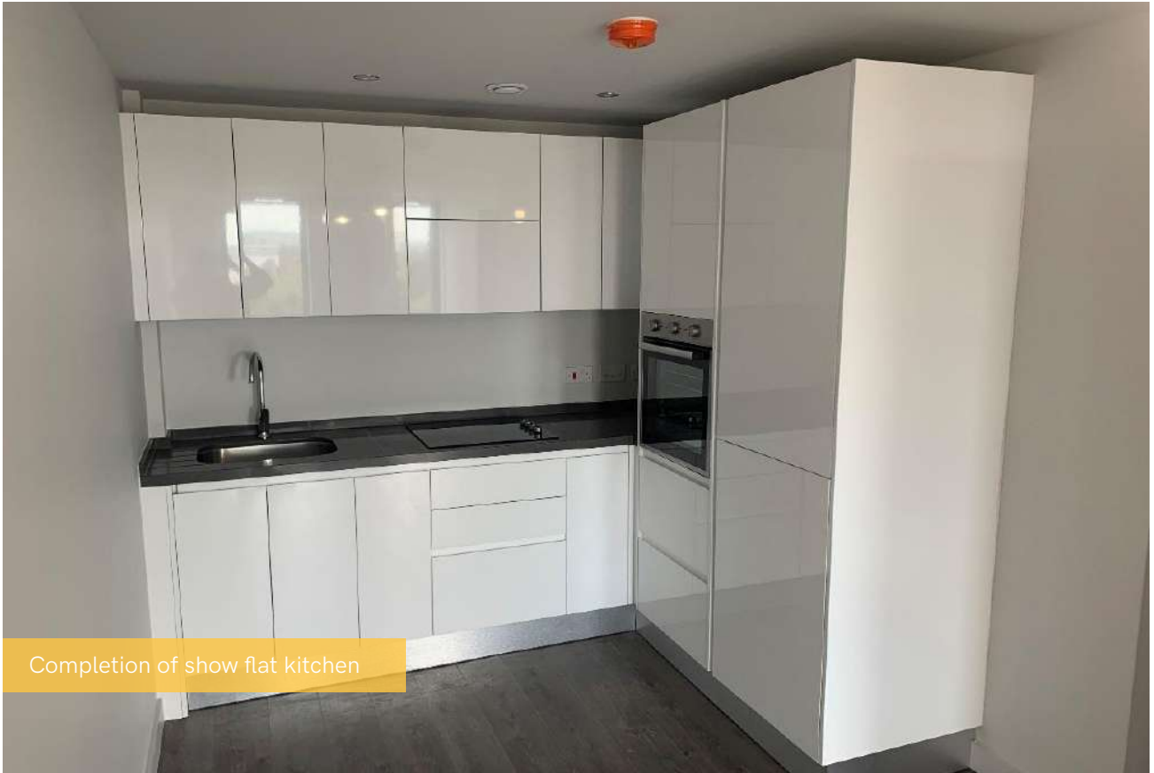
Completion of show flat kitchen