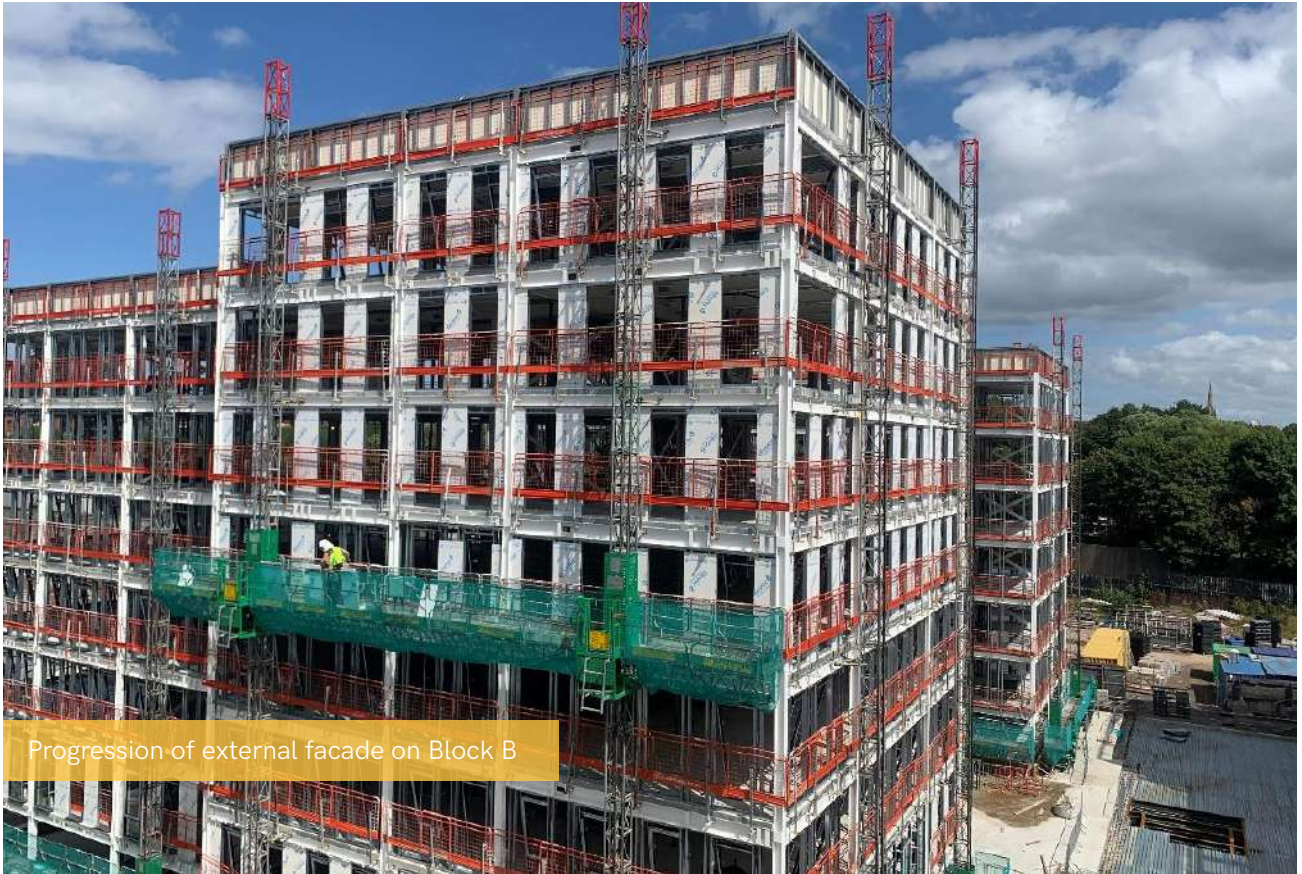
Progression of external facade on Block B