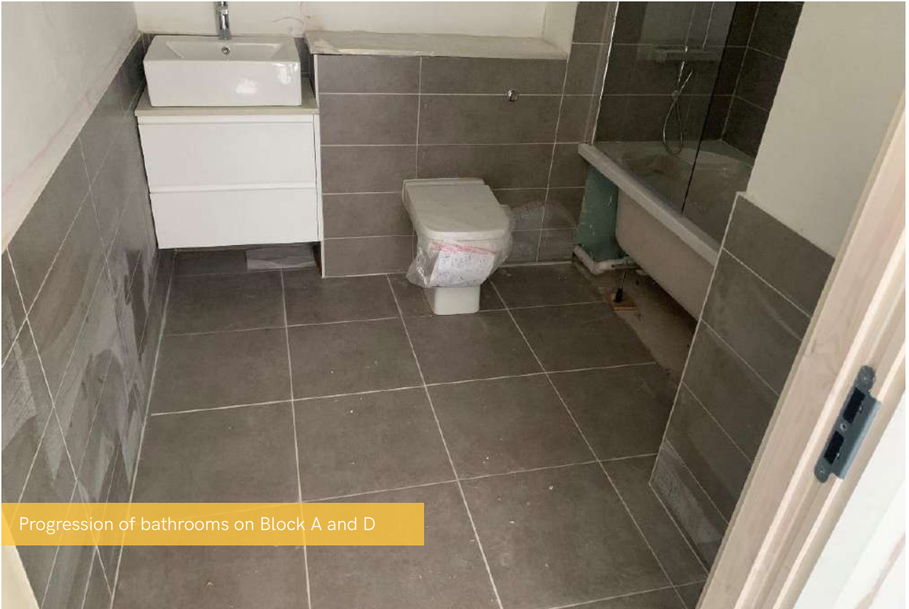
Progression of bathrooms on Block A and D