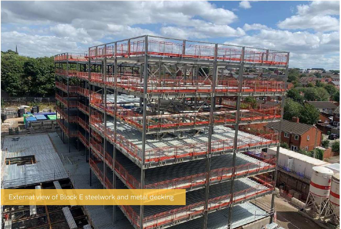
External view of Block E steelwork and metal decking