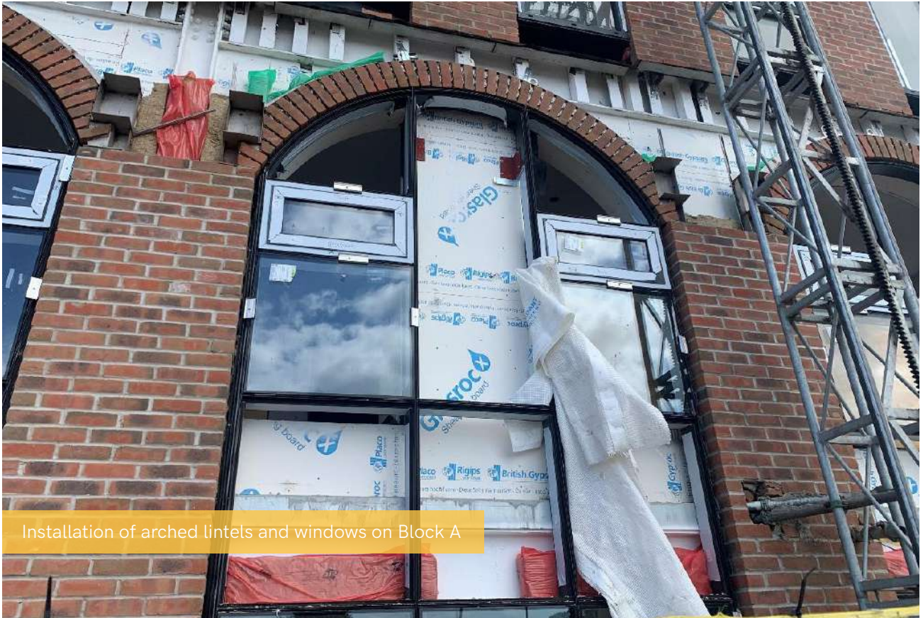
Installation of arched lintels and windows on Block A