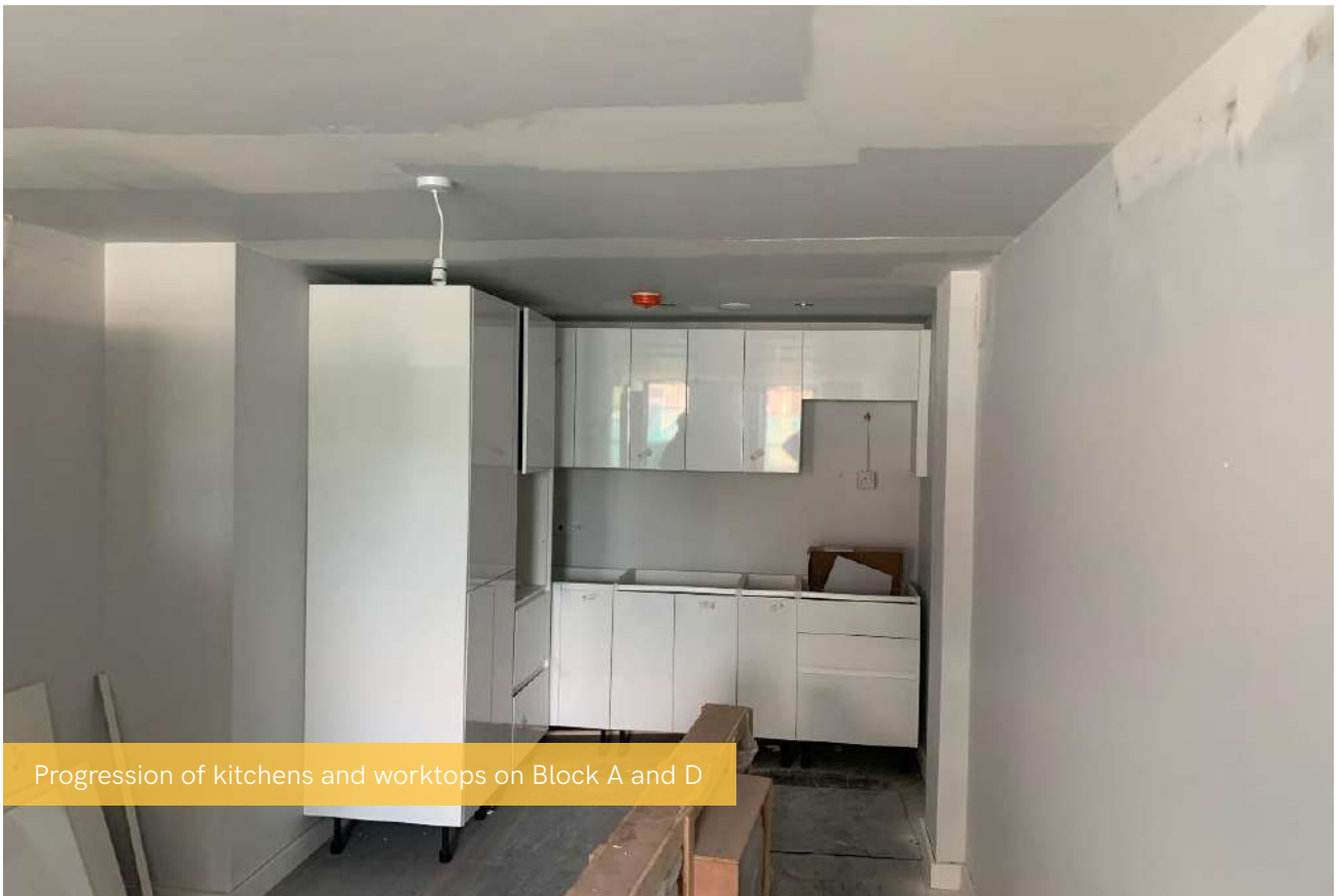
Progression of kitchens and worktops on Block A and D