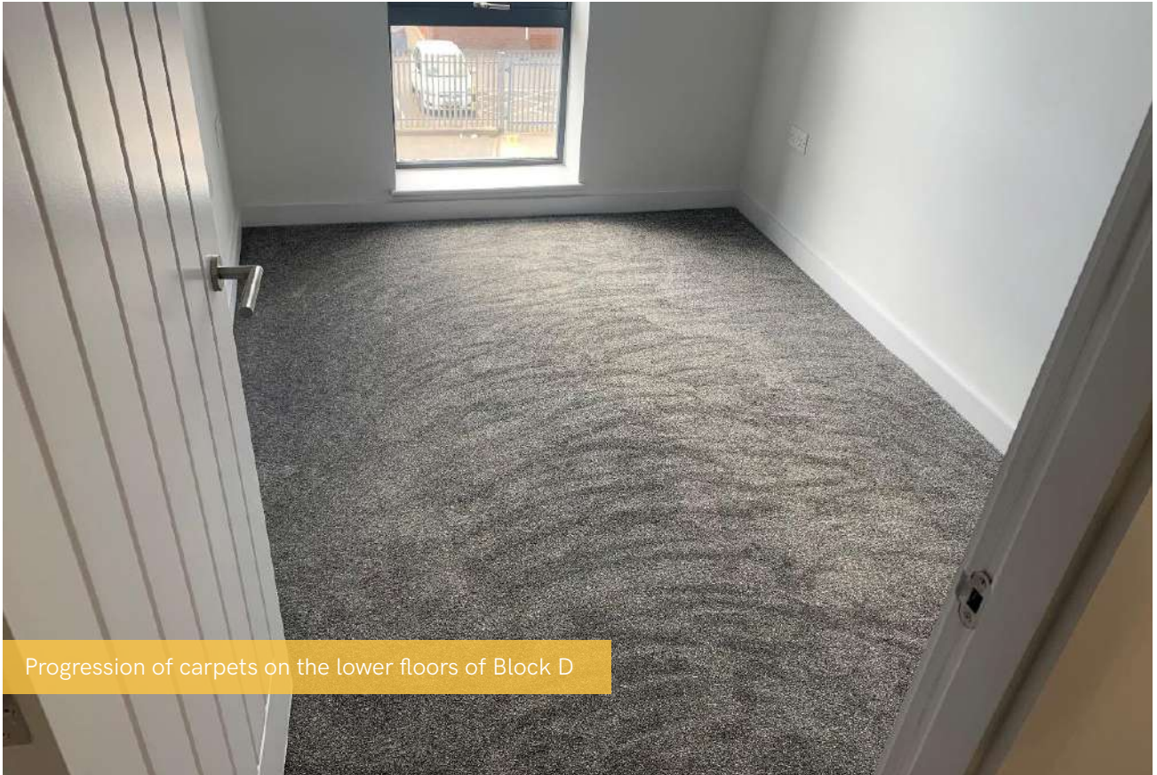
Progression of carpets on the lower floors of Block D