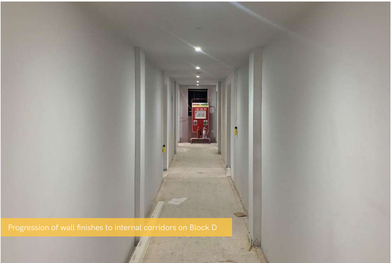
Progression of wall finishes to internal corridors on Block D