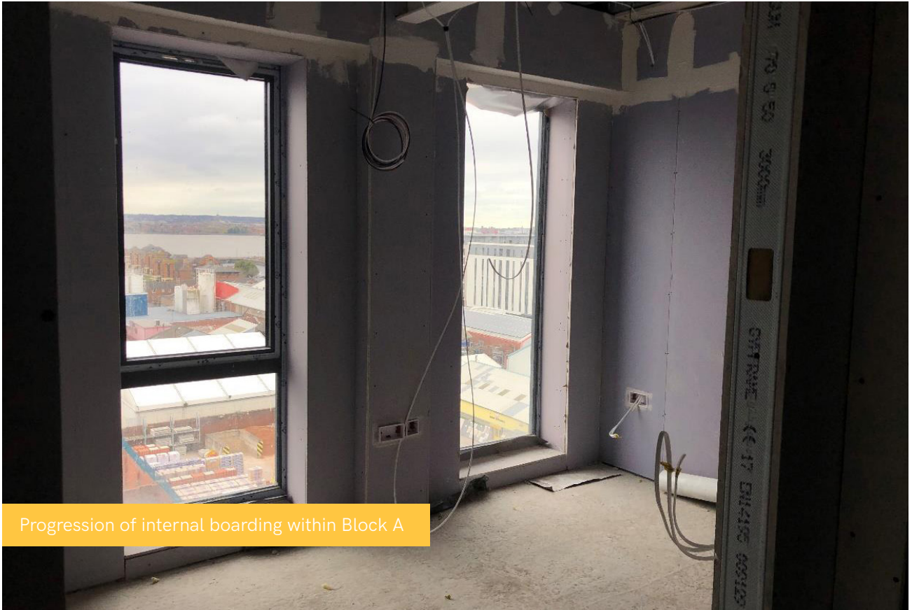
Progression of internal boarding within Block A