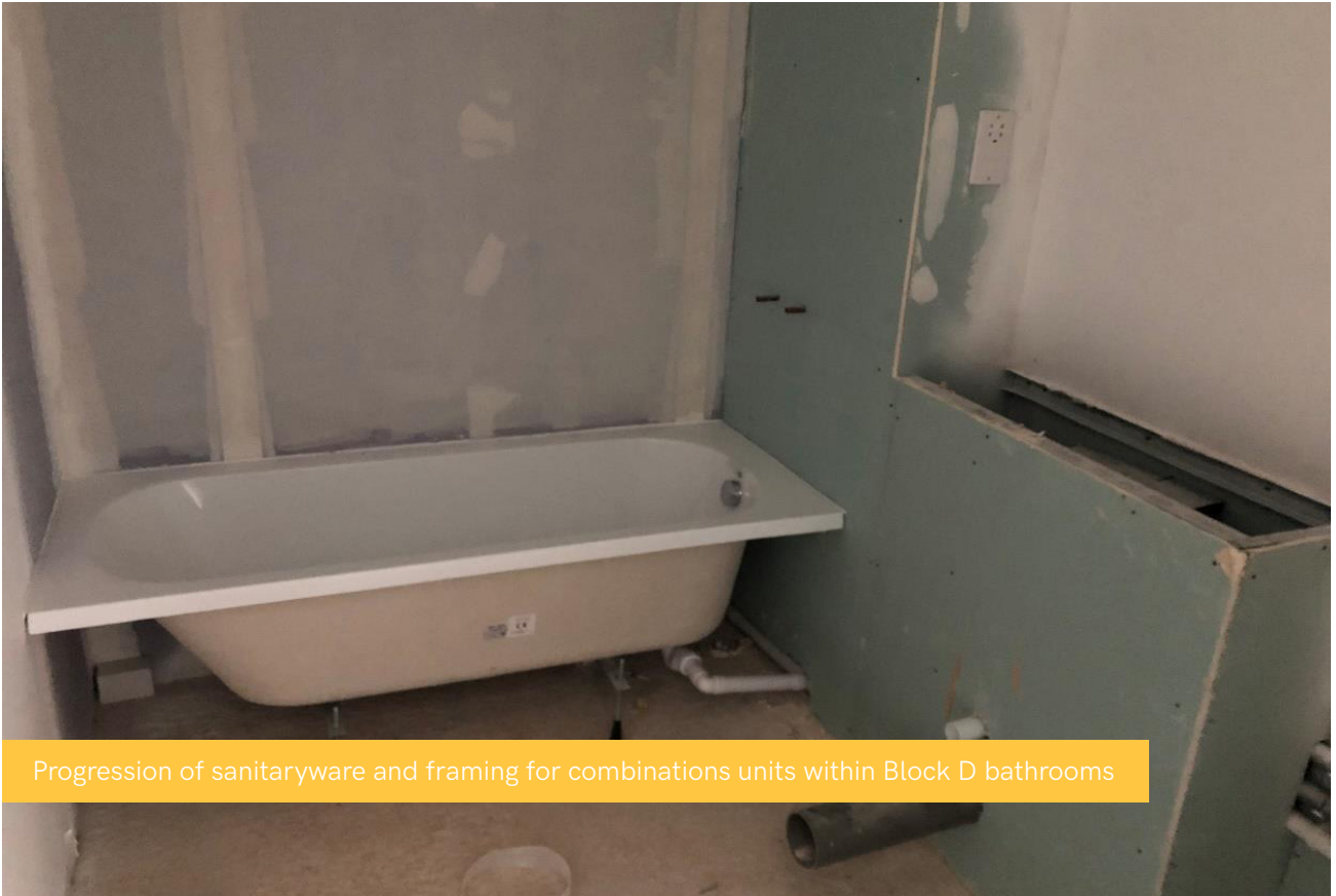
Progression of sanitaryware and framing for combinations units within Block D bathrooms