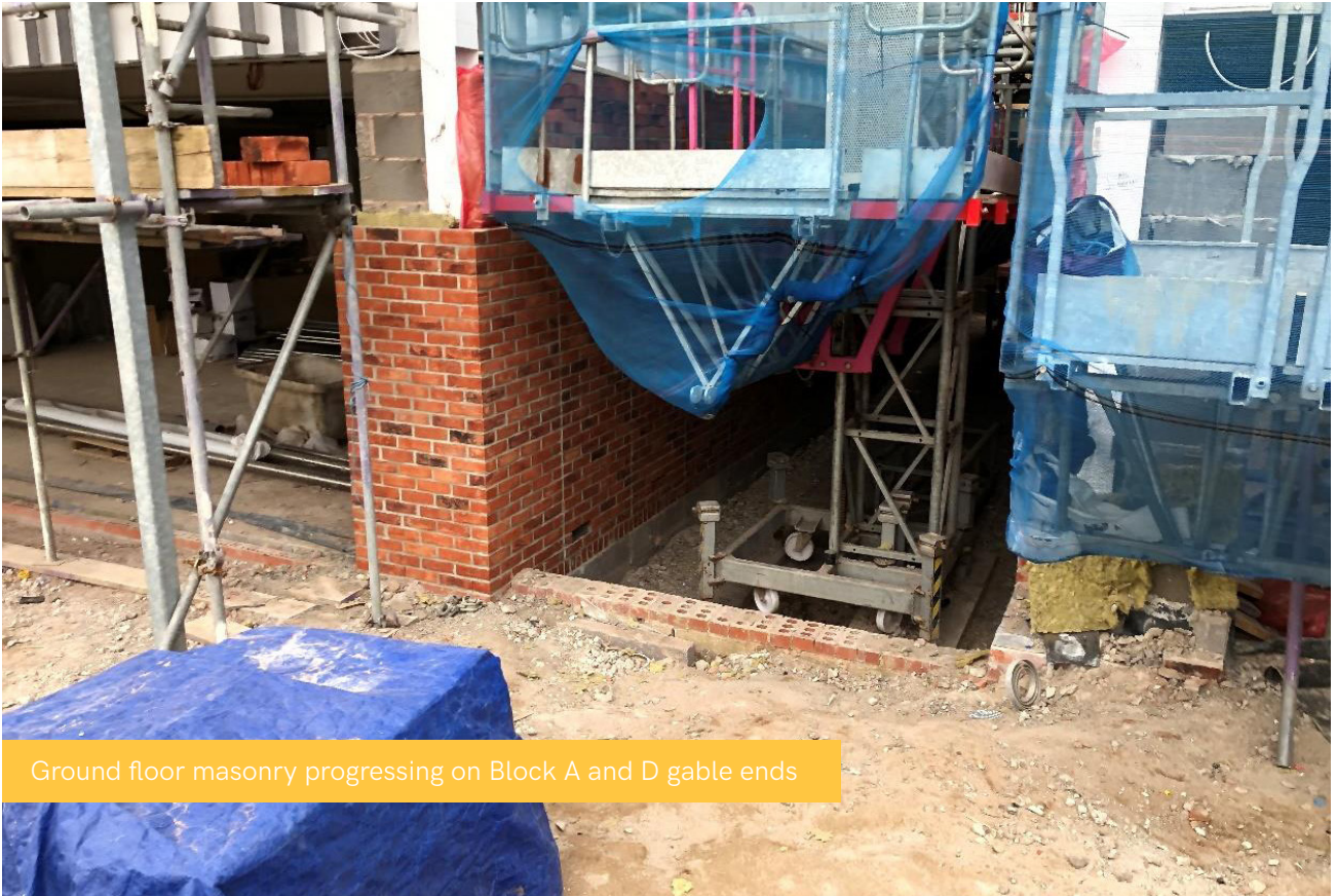
Ground floor masonry progressing on Block A and D gable ends