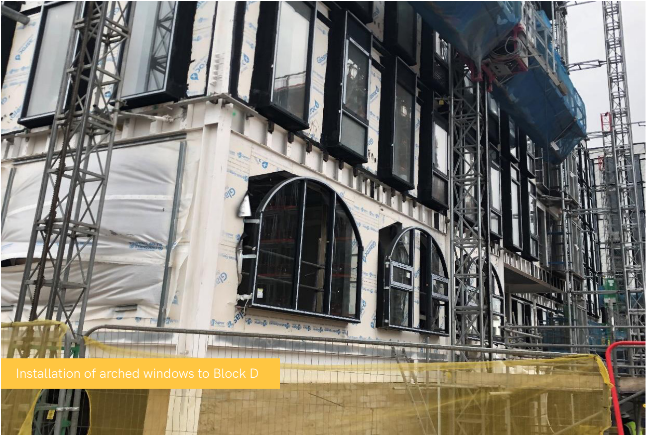
Installation of arched windows to Block D