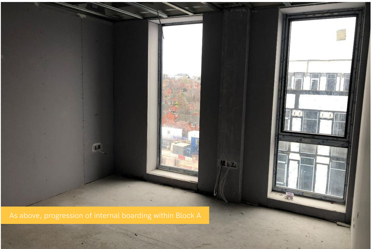
As above, progression of internal boarding within Block A