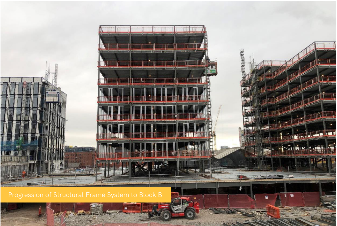
Progression of Structural Frame System to Block B