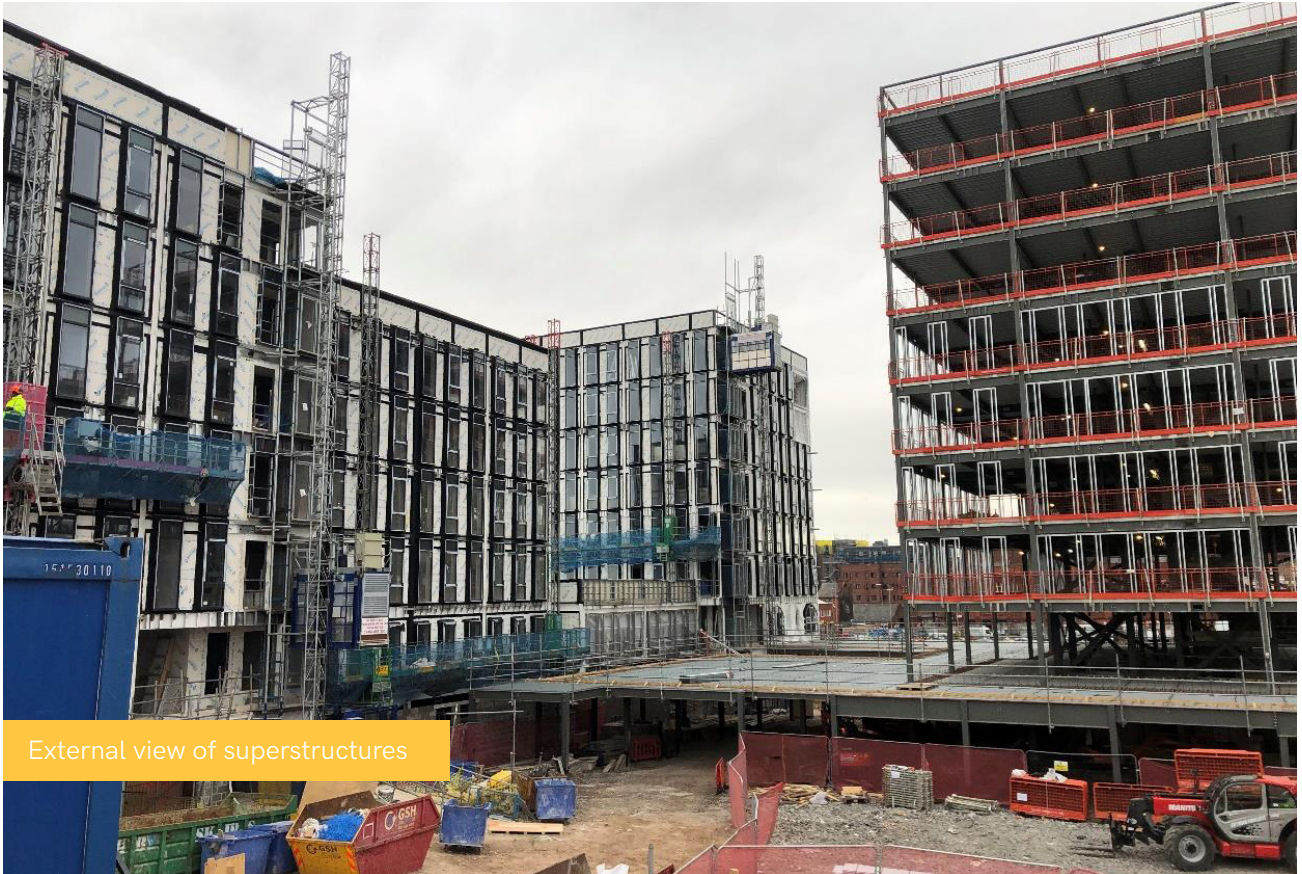
External view of superstructures