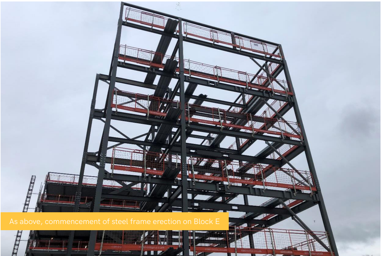
As above, commencement of steel frame erection on Block E