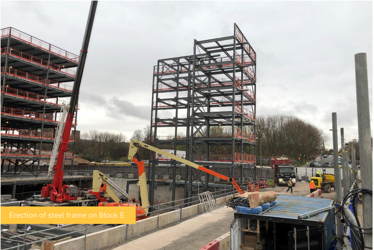
Erection of steel frame on Block E