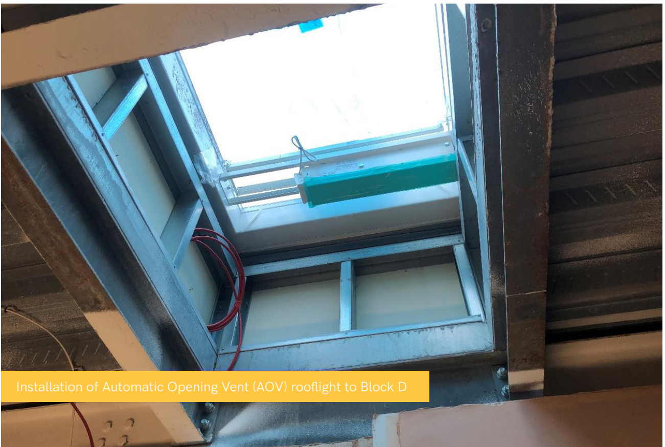
Installation of Automatic Opening Vent (AOV) rooflight to Block D