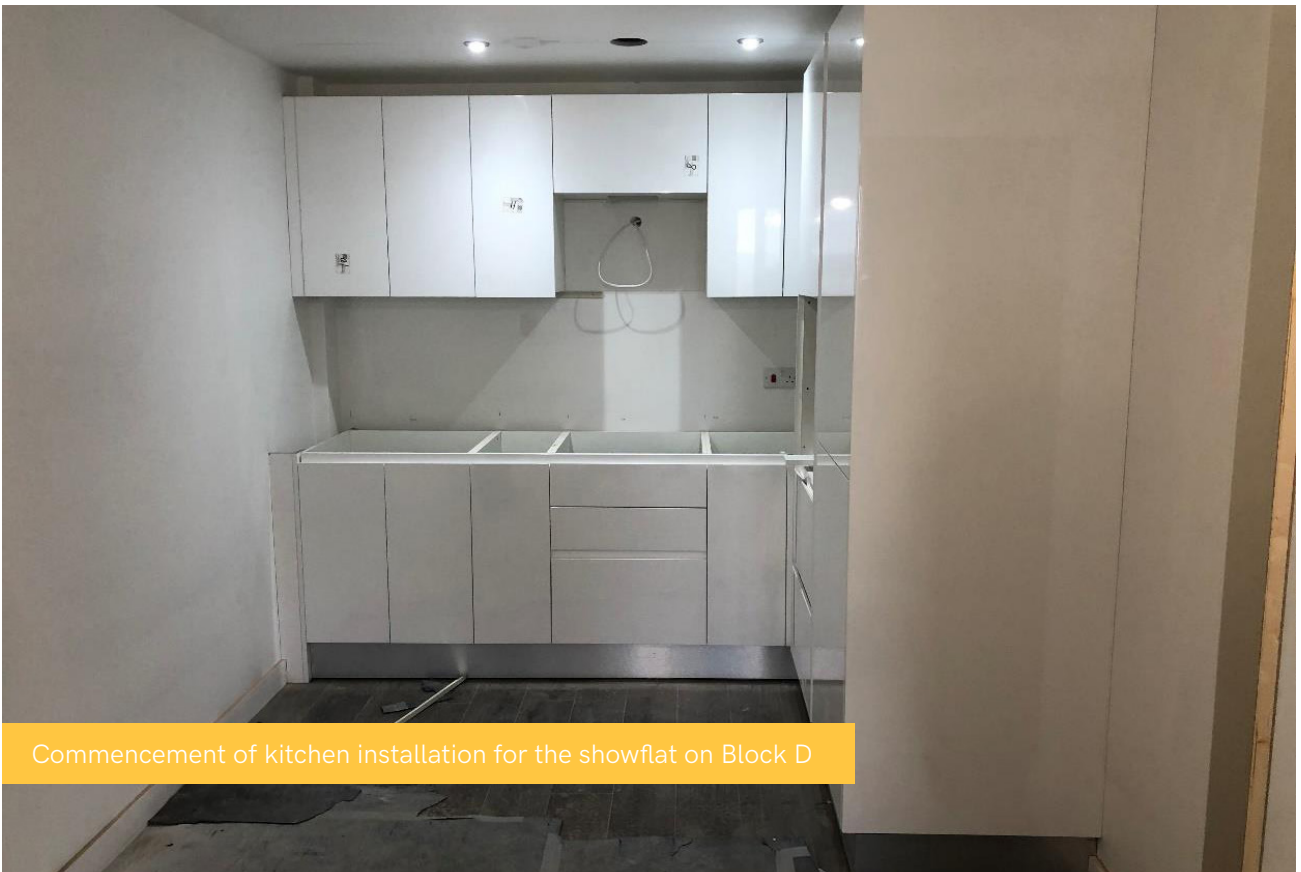
Commencement of kitchen installation for the showflat on Block D