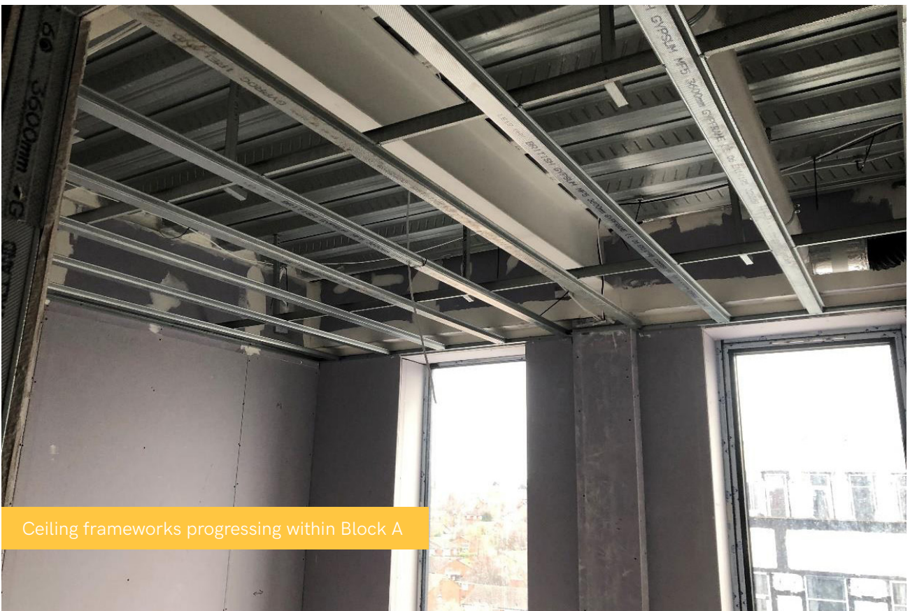
Ceiling frameworks progressing within Block A