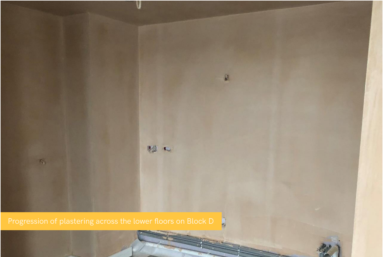
Progression of plastering across the lower floors on Block D