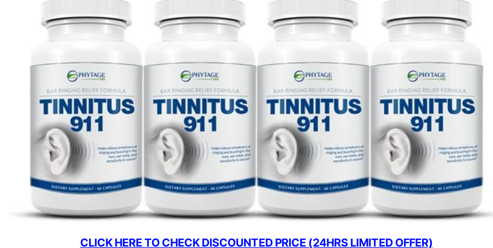
Why Tinnitus 911?

Labs Tinnitus 911 Customer Reviews are very positive and people of every age are consuming these pill with 100% satisfactory results.