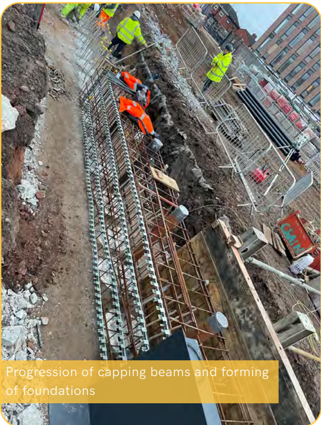
Progression of capping beams and forming of foundations