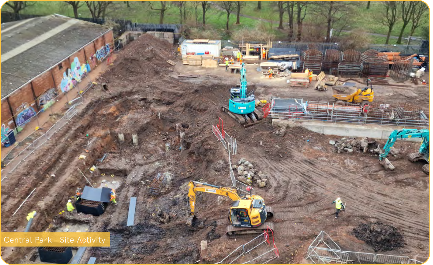
Central Park - Site Activity