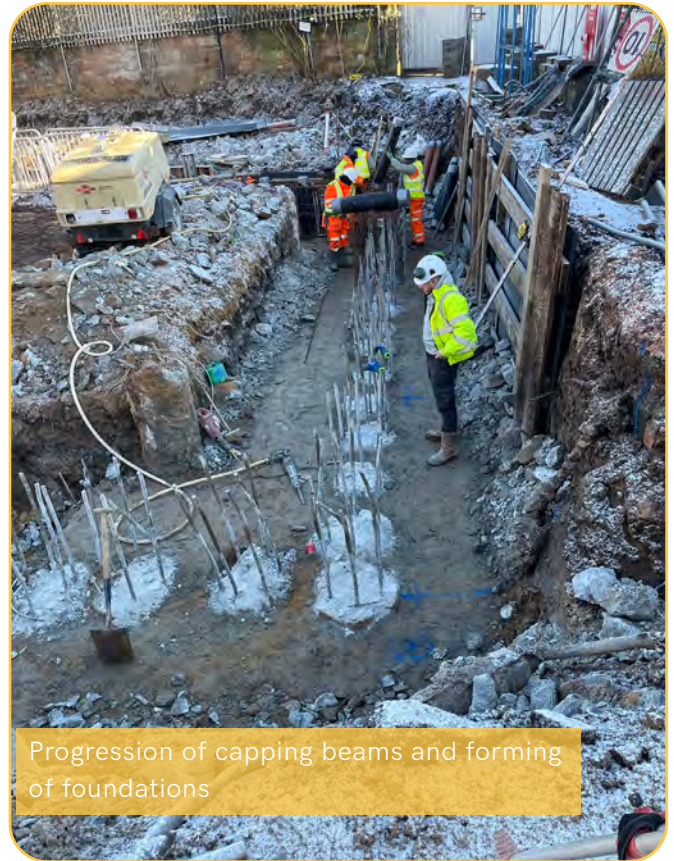
Progression of capping beams and forming of foundations