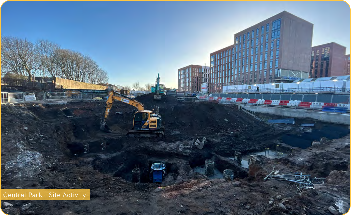
Central Park - Site Activity