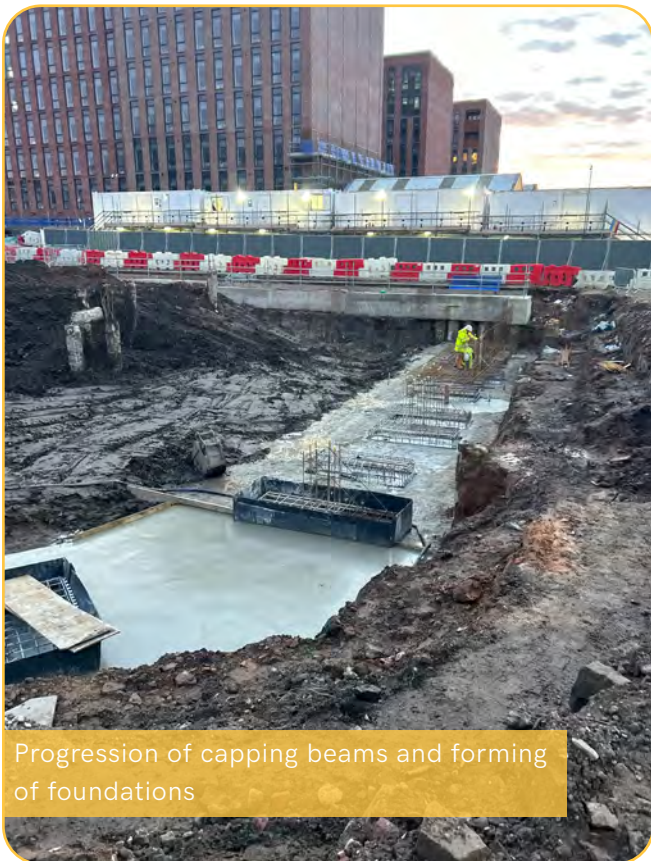
Progression of capping beams and forming of foundations