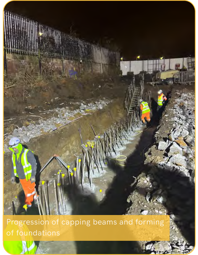
Progression of capping beams and forming of foundations