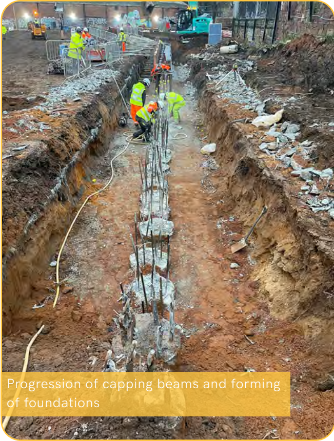
Progression of capping beams and forming of foundations