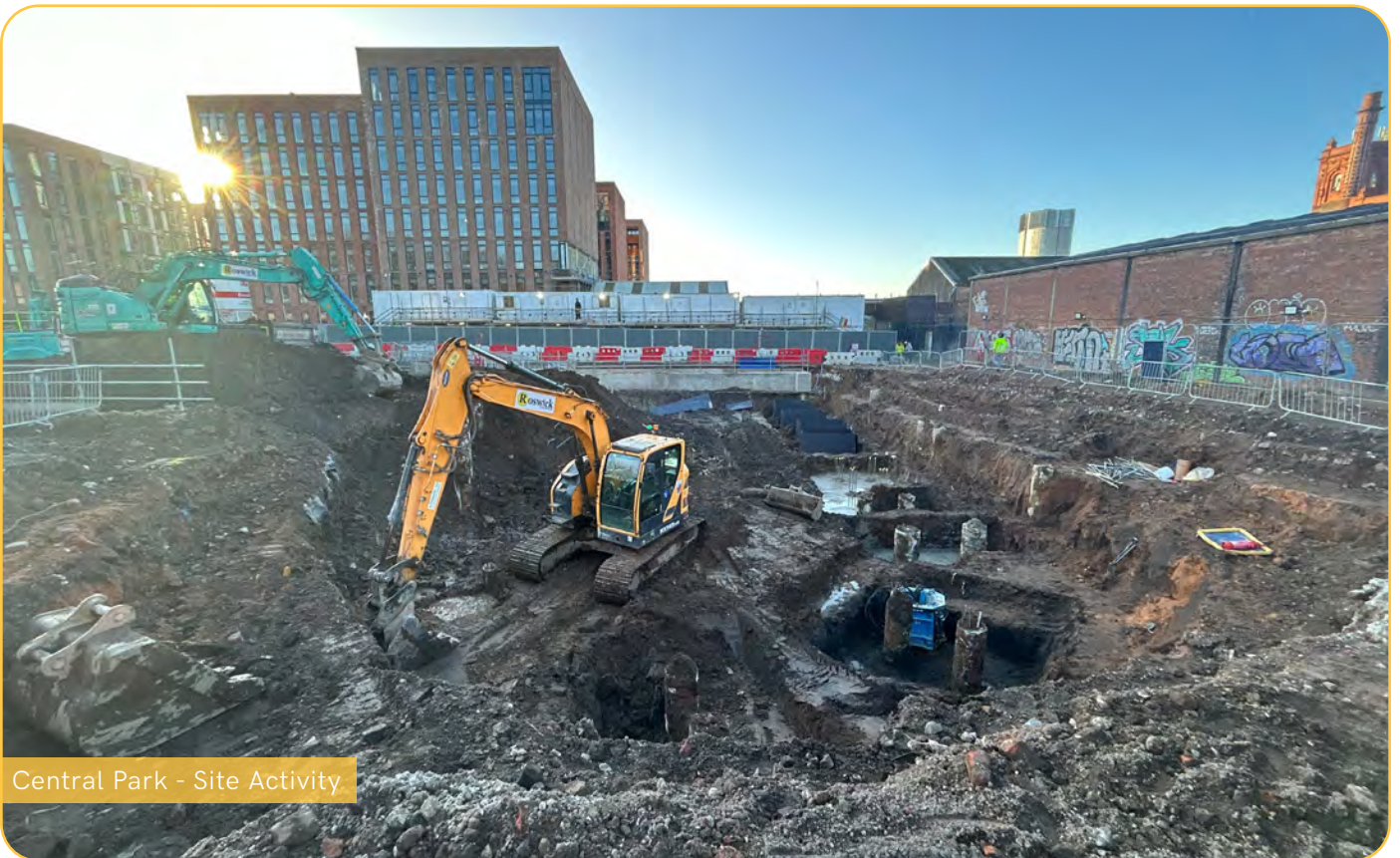
Central Park - Site Activity