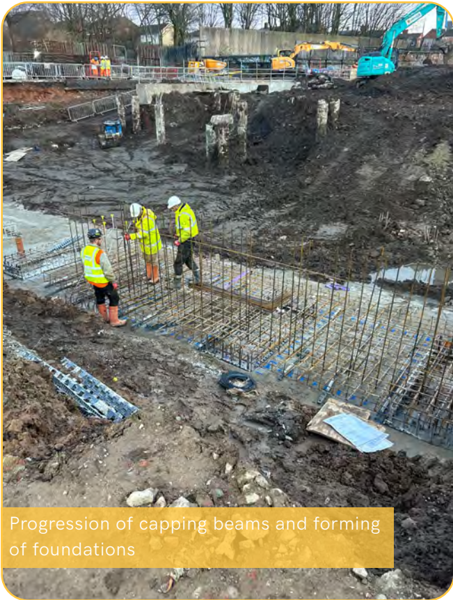
Progression of capping beams and forming of foundations