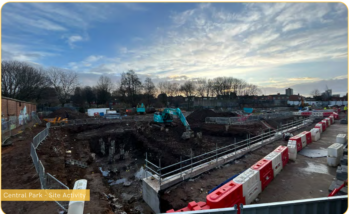
Central Park - Site Activity