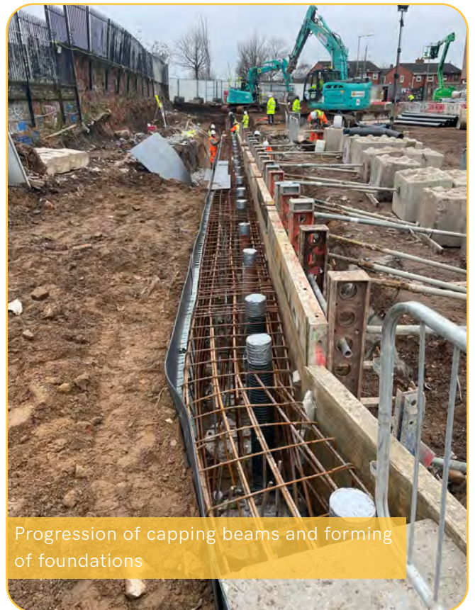
Progression of capping beams and forming of foundations