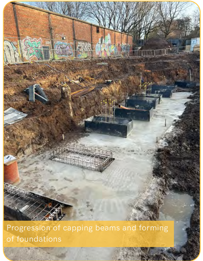
Progression of capping beams and forming of foundations