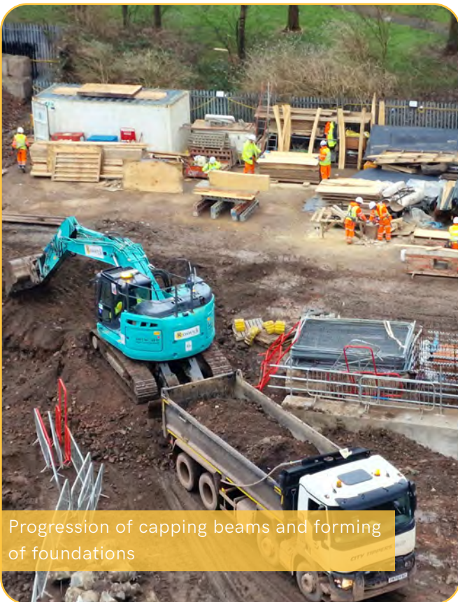
Progression of capping beams and forming of foundations