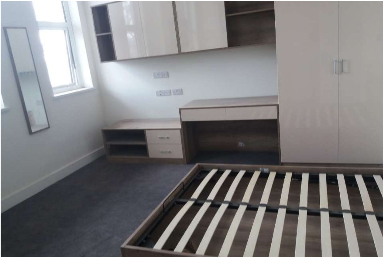
Unit painted and fitted with carpet and furniture. Windows installed.