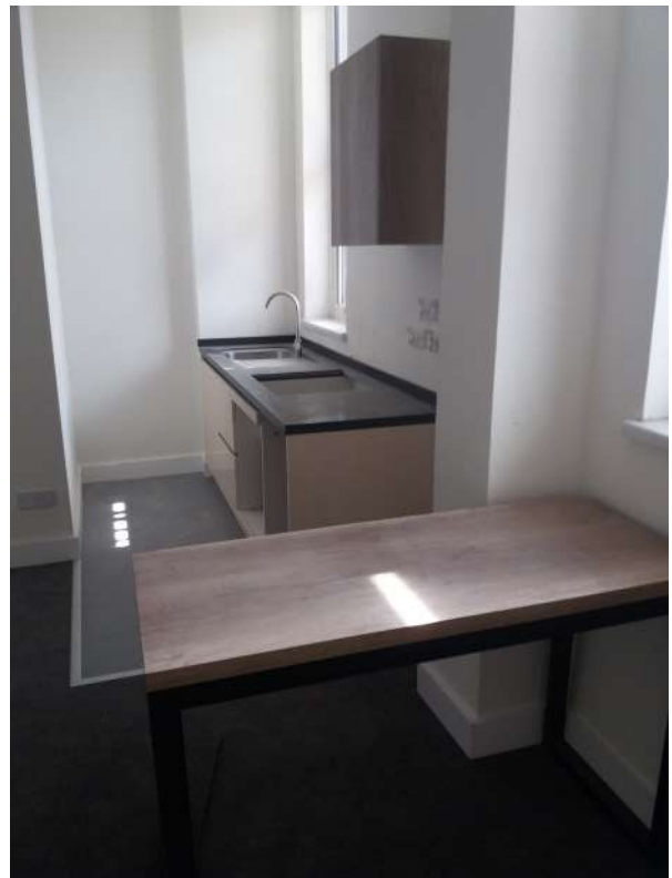
Unit fitted with kitchen vinyl and worktop and cupboards.