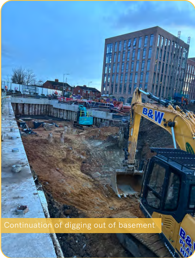
Continuation of digging out of basement