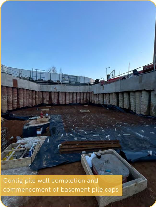
Contig pile wall completion and commencement of basement pile caps