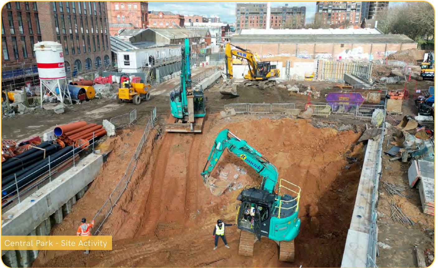
Central Park - Site Activity