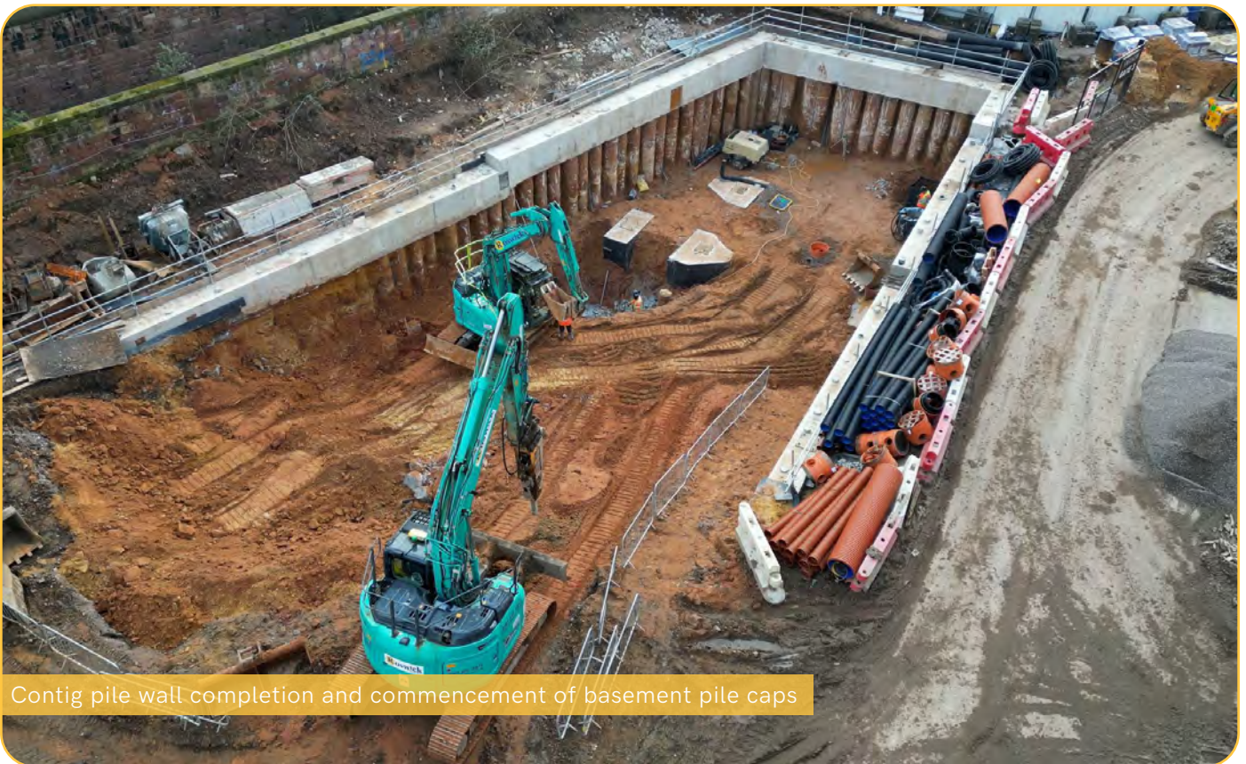
Contig pile wall completion and commencement of basement pile caps