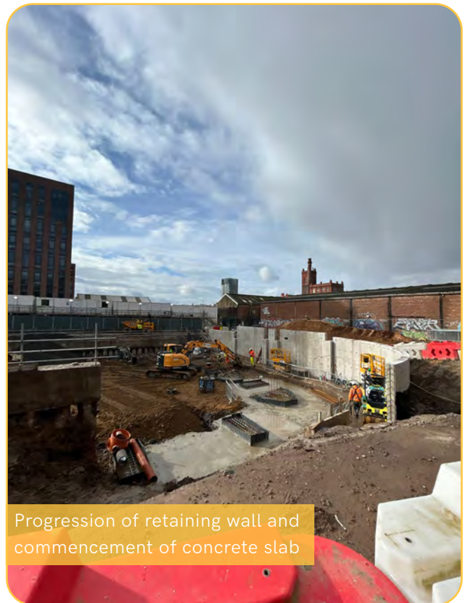
Progression of retaining wall and commencement of concrete slab