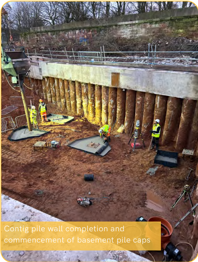
Contig pile wall completion and commencement of basement pile caps