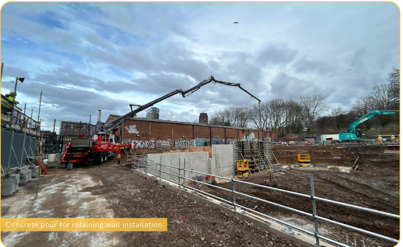
Concrete pour for retaining wall installation