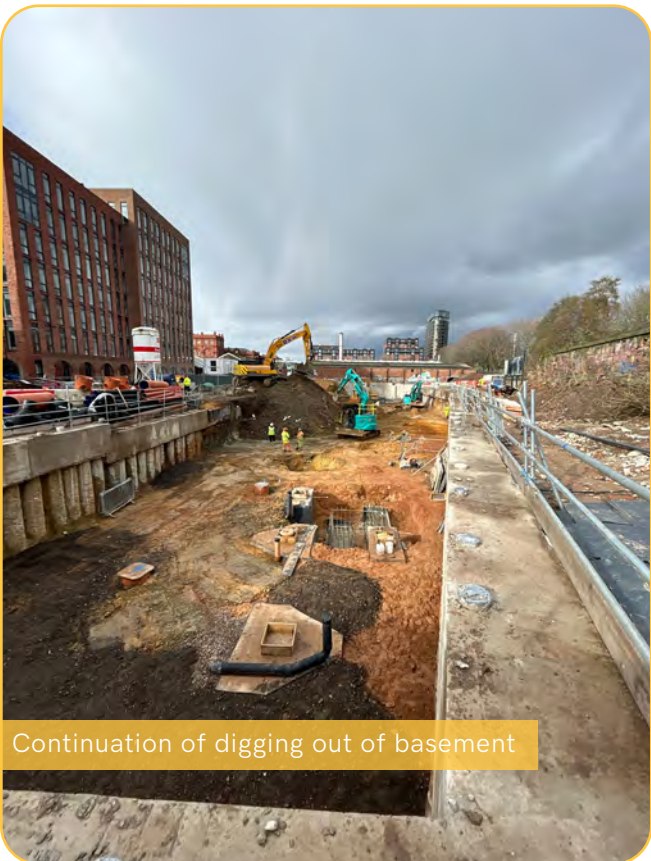
Continuation of digging out of basement