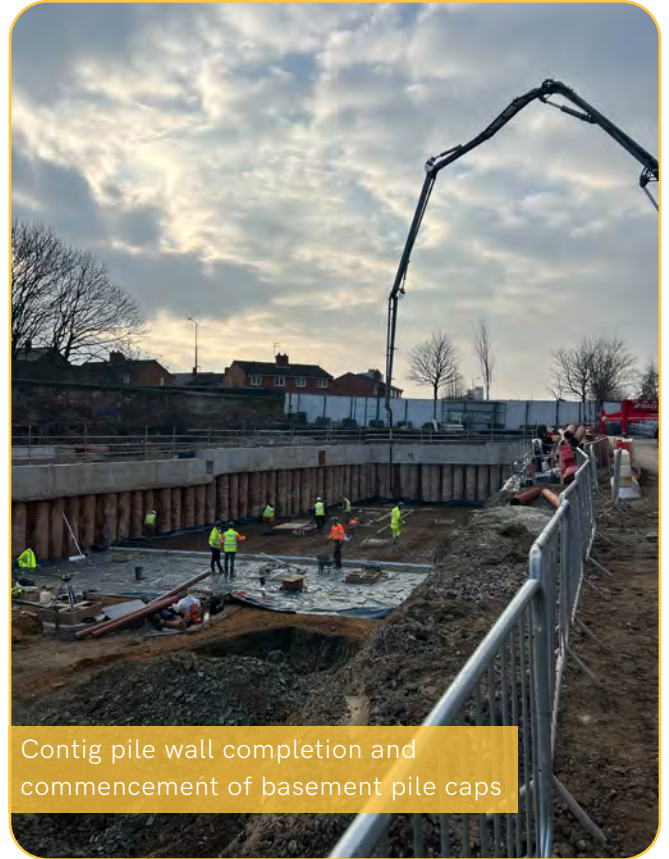
Contig pile wall completion and commencement of basement pile caps