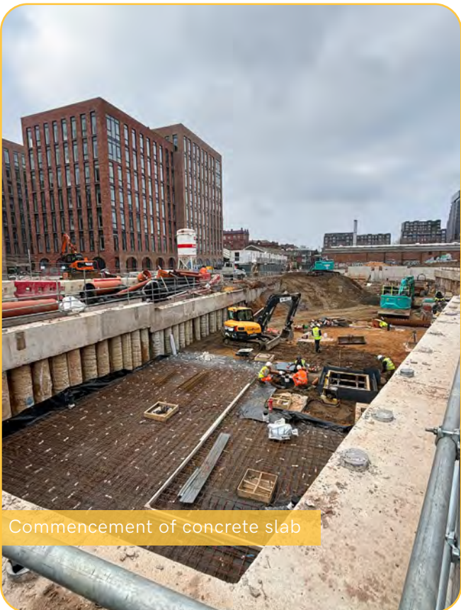
Commencement of concrete slab