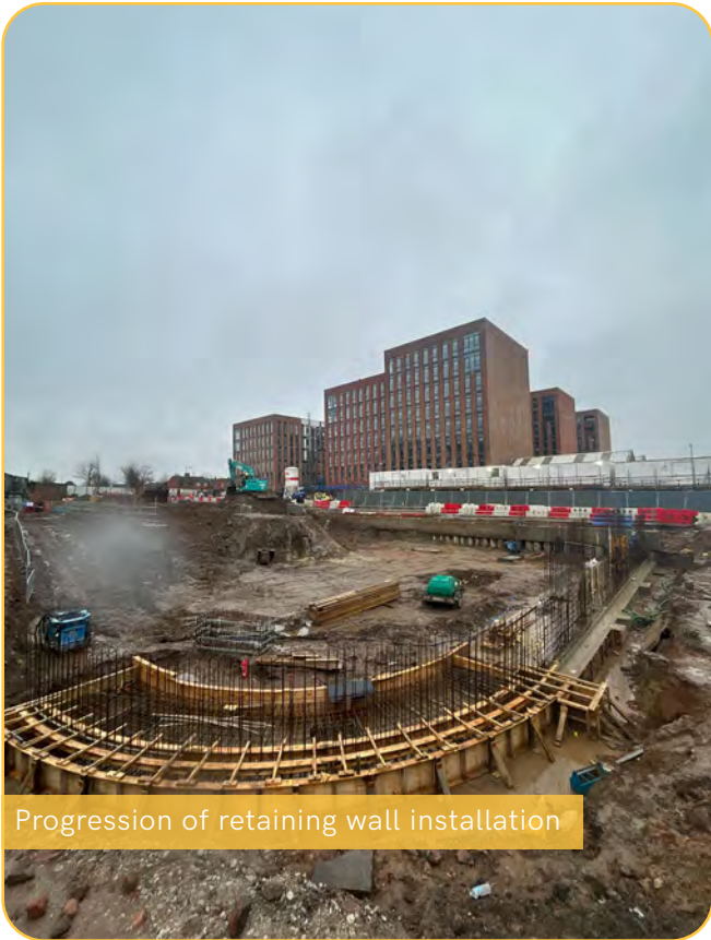
Progression of retaining wall installation