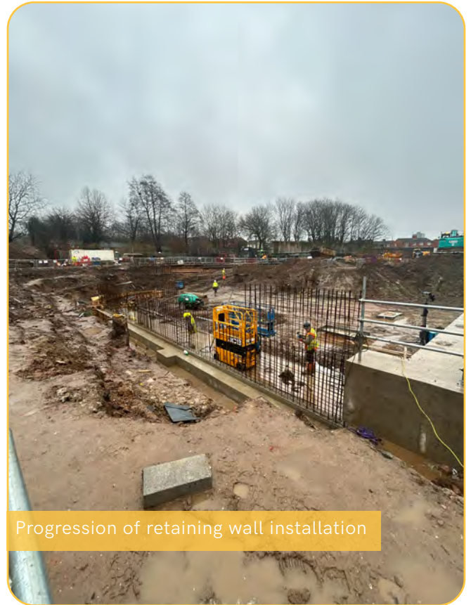
Progression of retaining wall installation