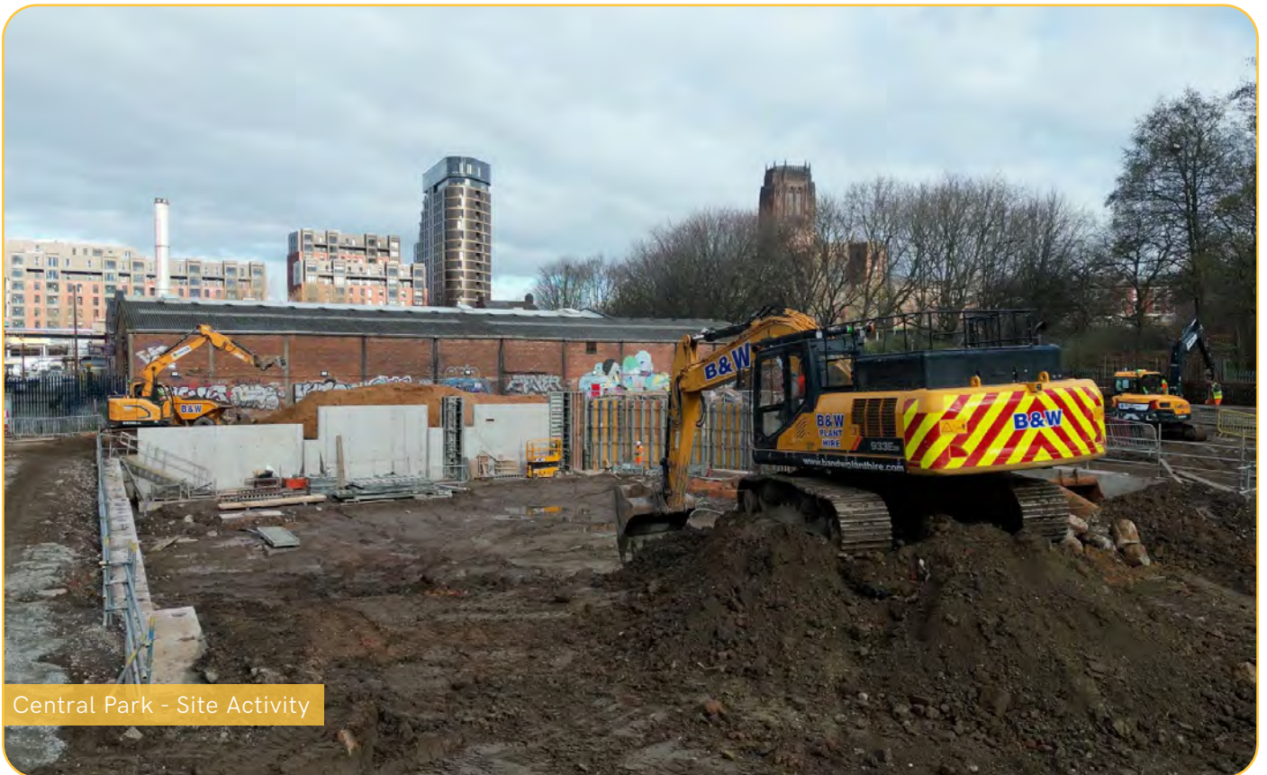
Central Park - Site Activity