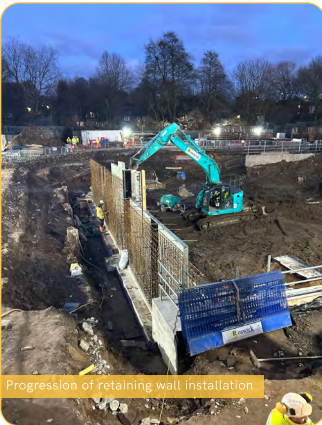
Progression of retaining wall installation