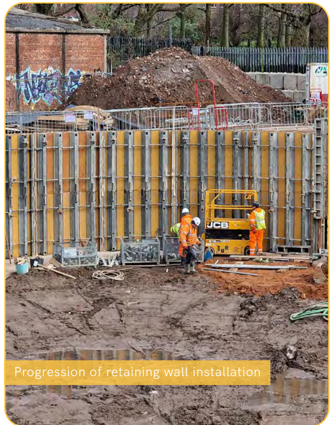
Progression of retaining wall installation