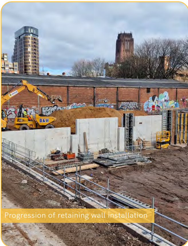
Progression of retaining wall installation