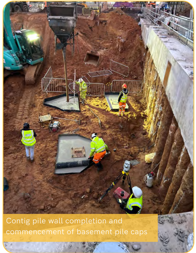
Contig pile wall completion and commencement of basement pile caps