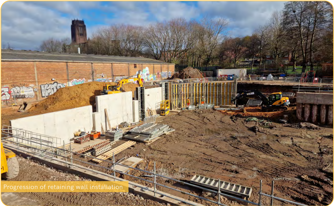
Progression of retaining wall installation