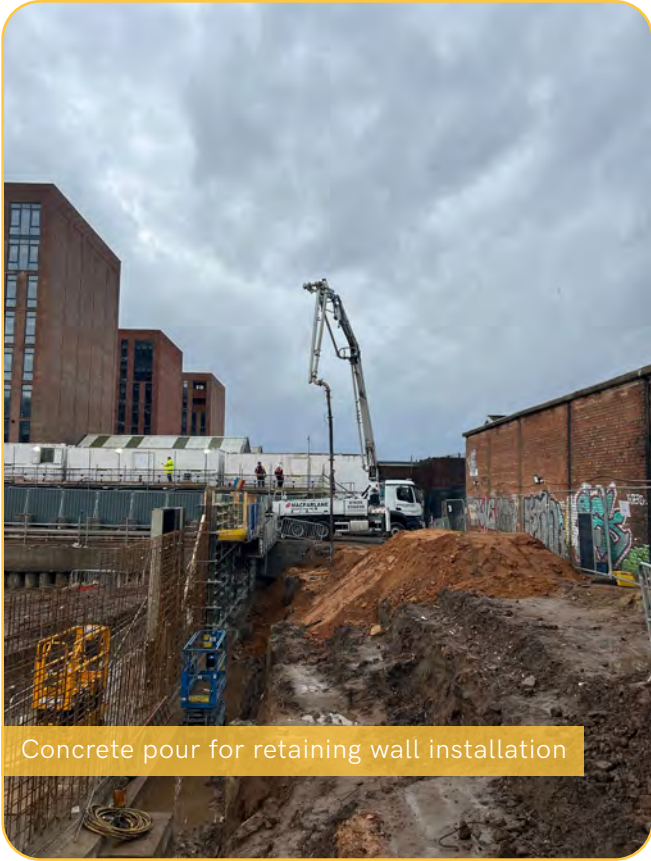
Concrete pour for retaining wall installation