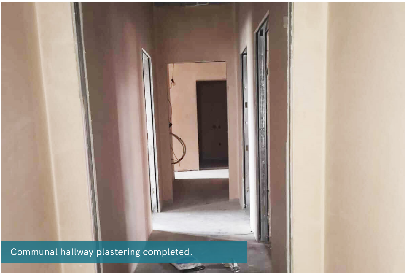
Communal hallway plastering completed.