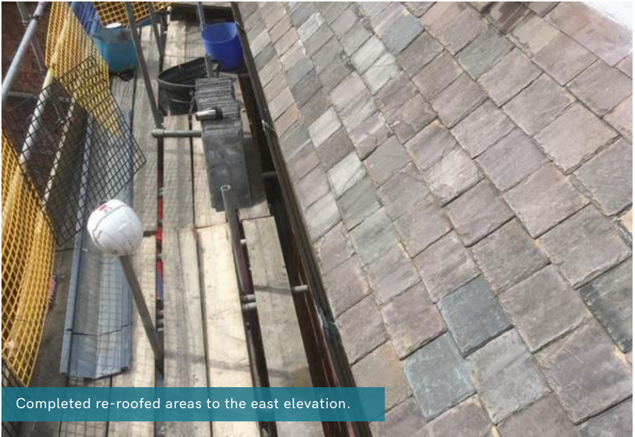
Completed re-roofed areas to the east elevation.