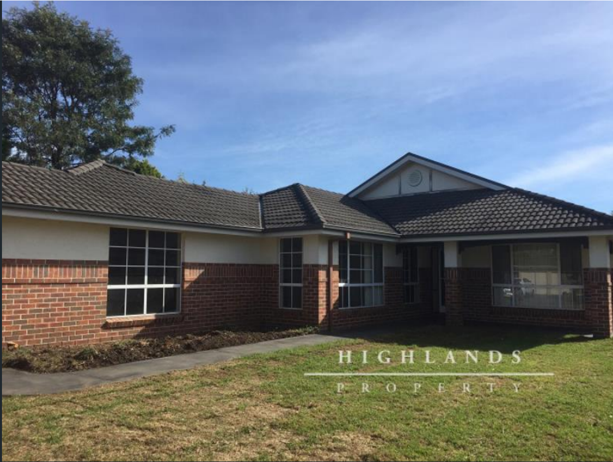
7 11 Roycroft Street Bowral NSW 2576