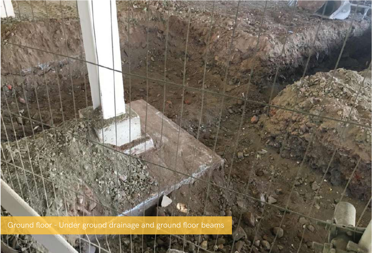
Ground floor - Under ground drainage and ground floor beams