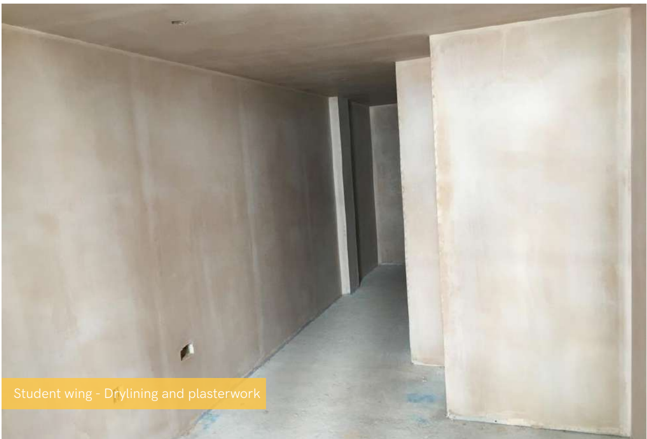
Student wing - Drylining and plasterwork