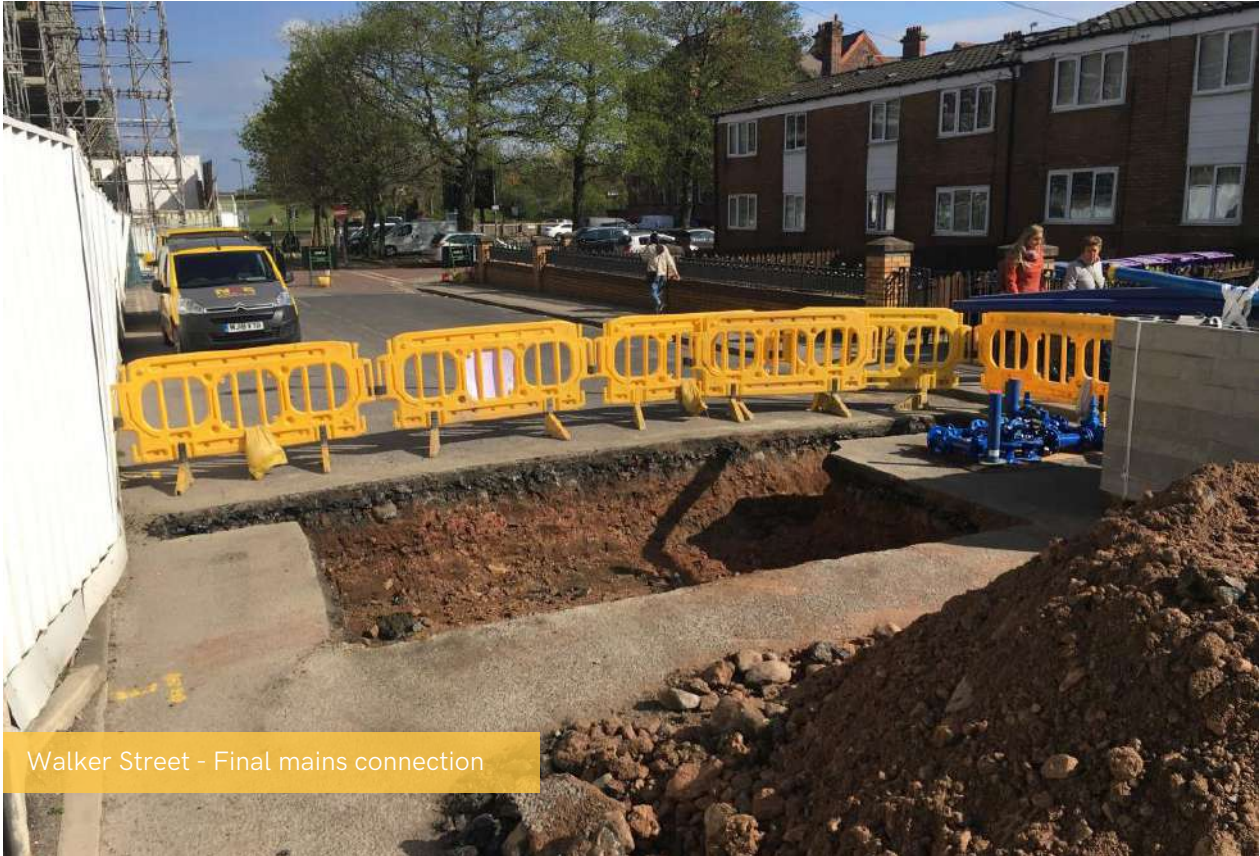
Walker Street - Final mains connection