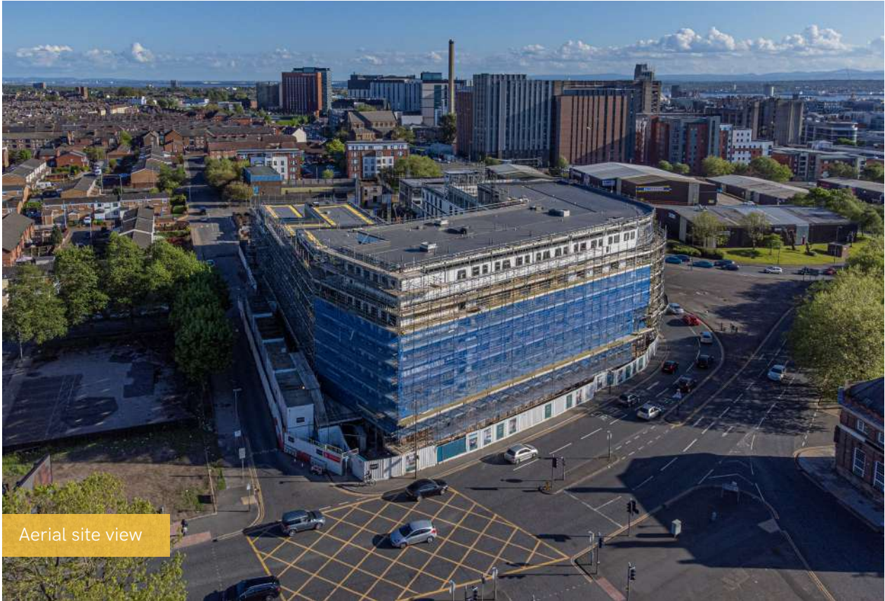
Aerial site view