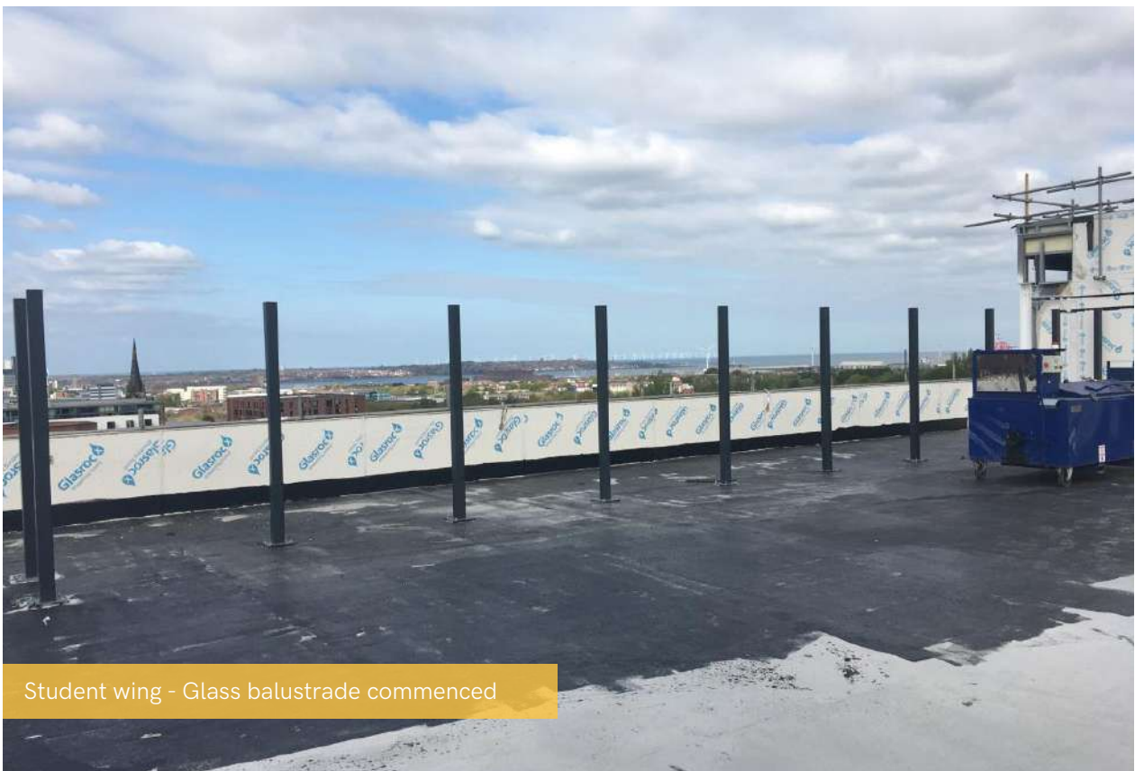
Student wing - Glass balustrade commenced