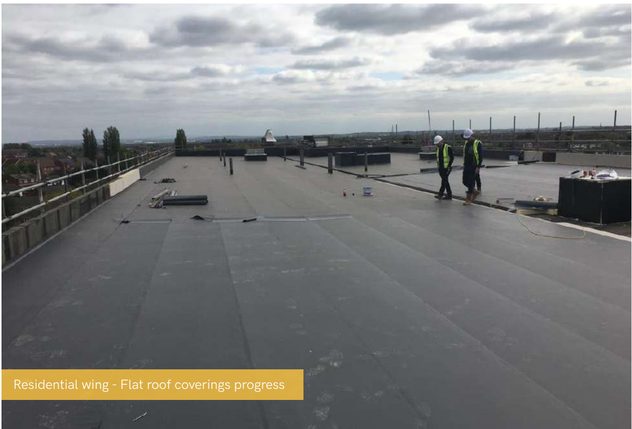
Residential wing - Flat roof coverings progress