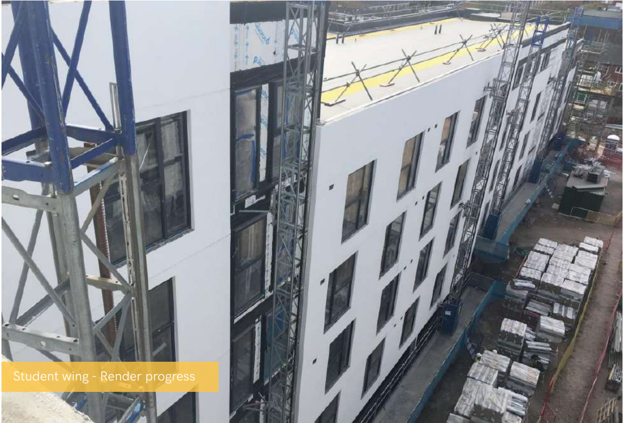
Student wing - Render progress