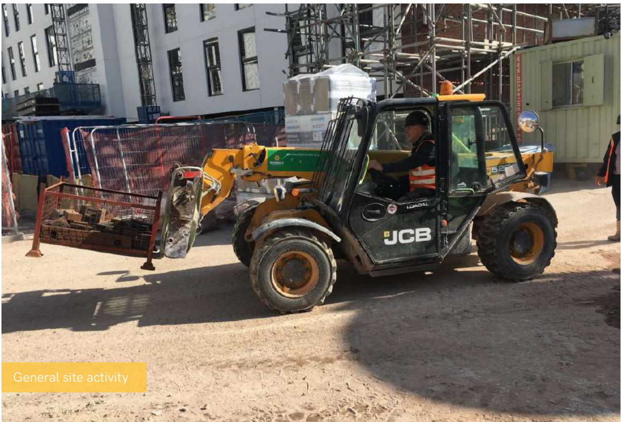
General site activity