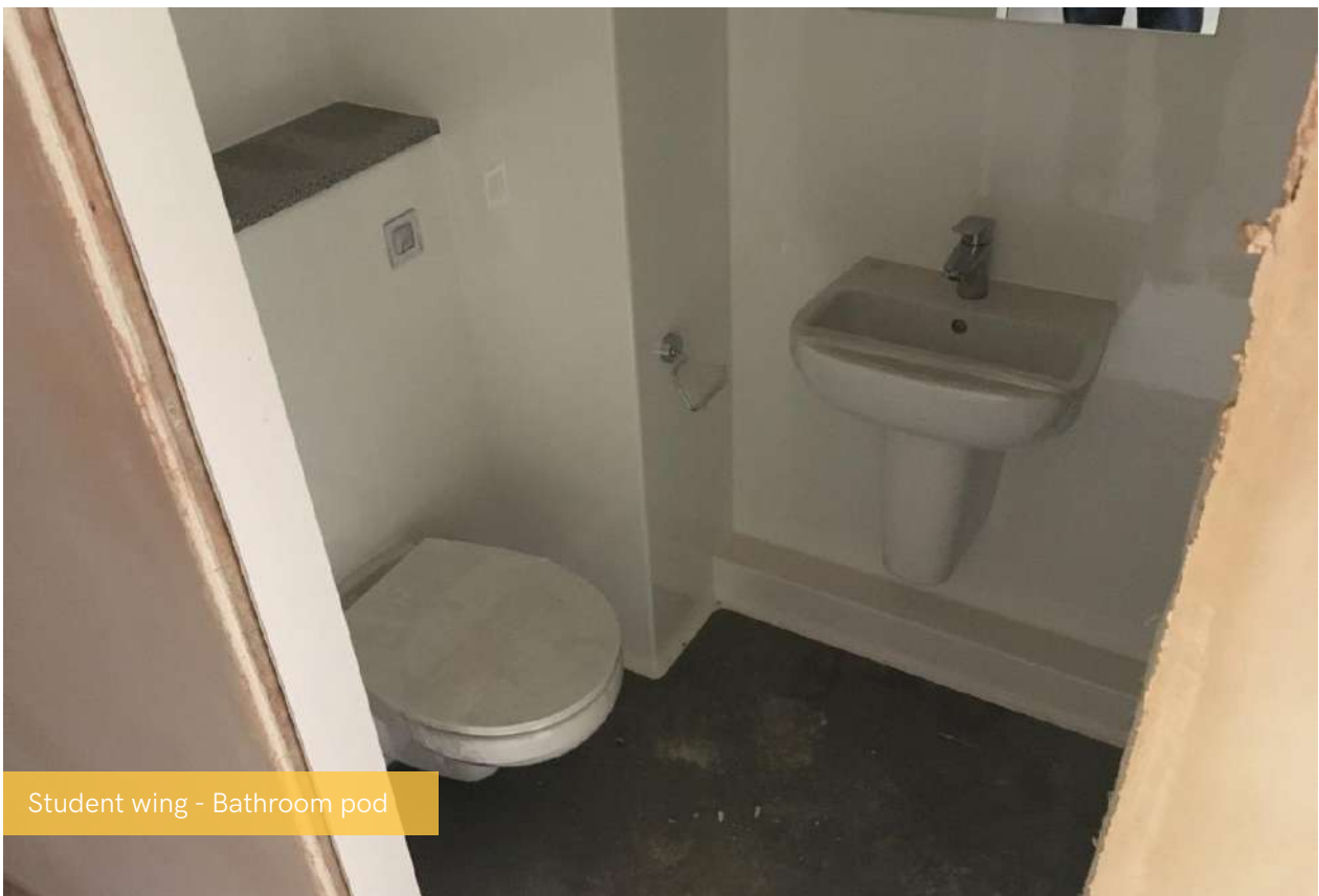
Student wing - Bathroom pod