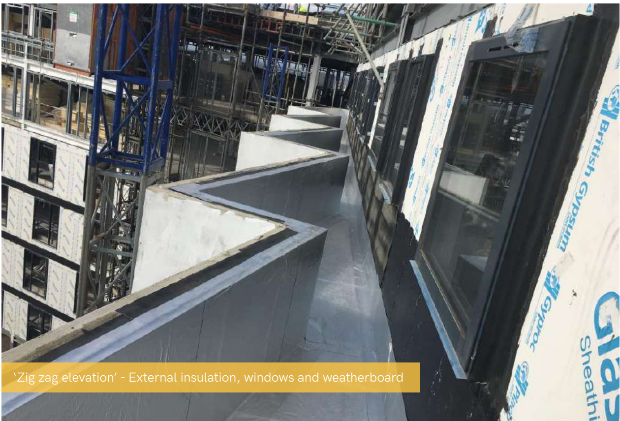
'Zig zag elevation' - External insulation, windows and weatherboard