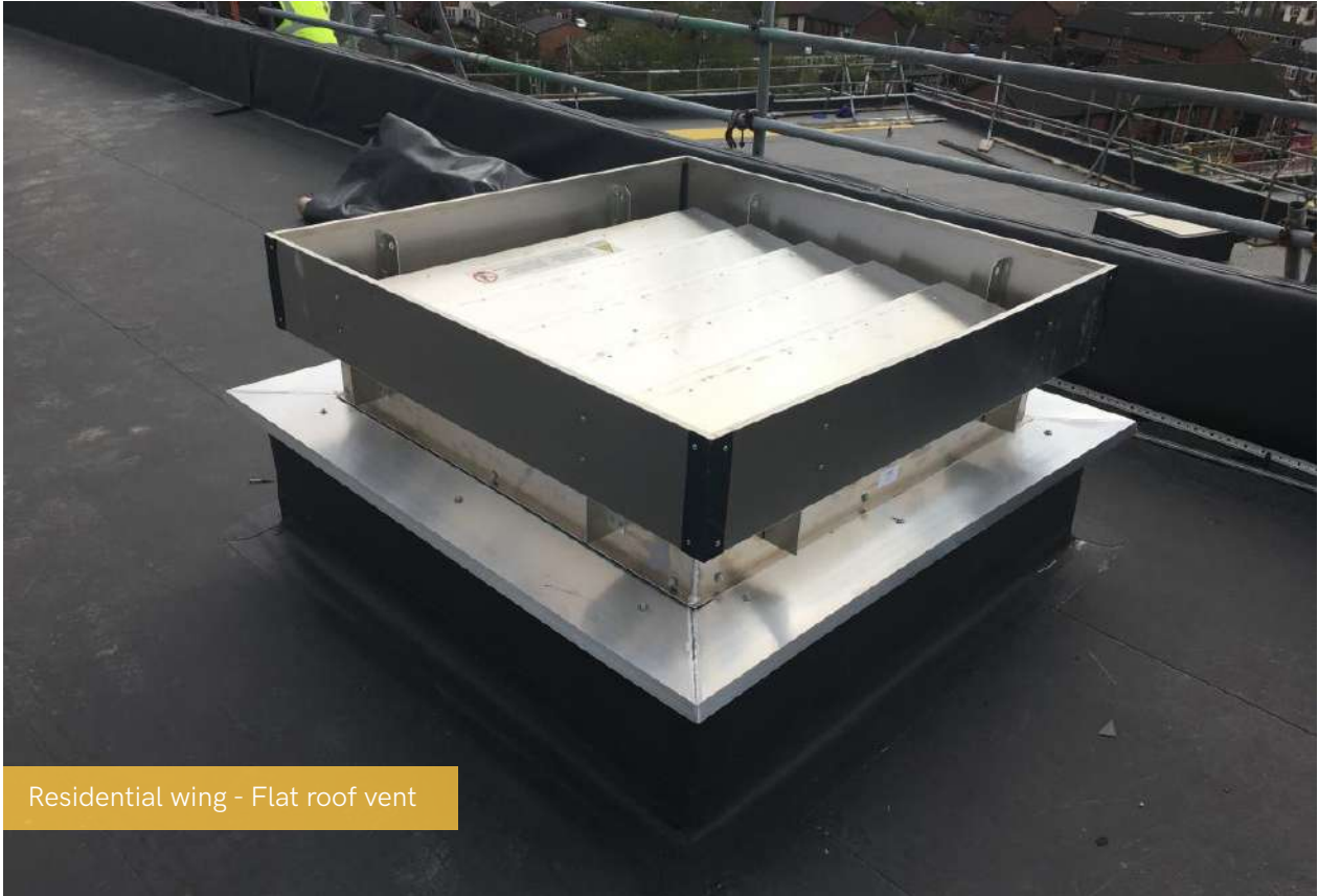
Residential wing - Flat roof vent