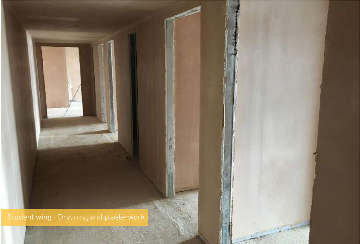
Student wing - Drylining and plasterwork