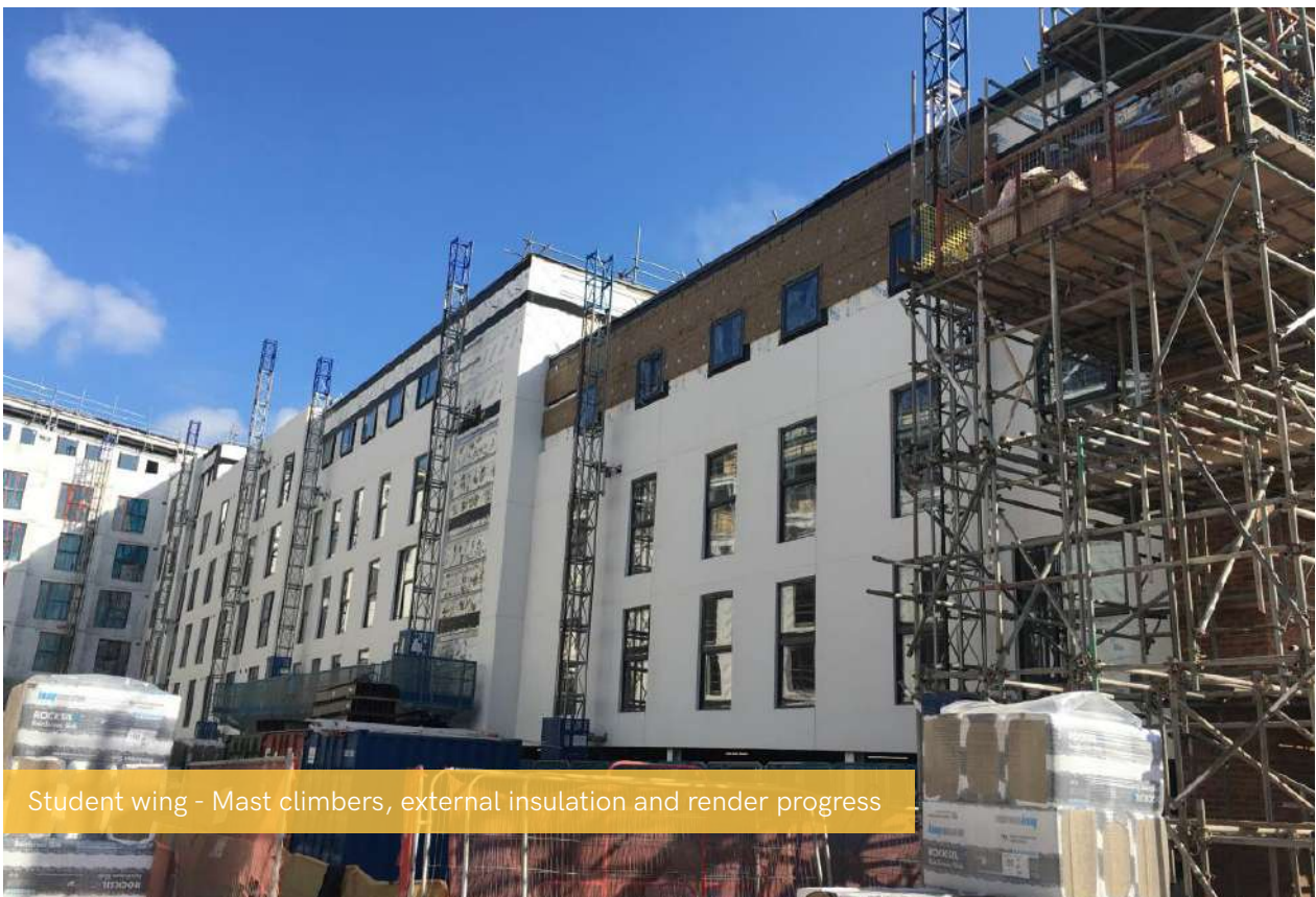
Student wing - Mast climbers, external insulation and render progress