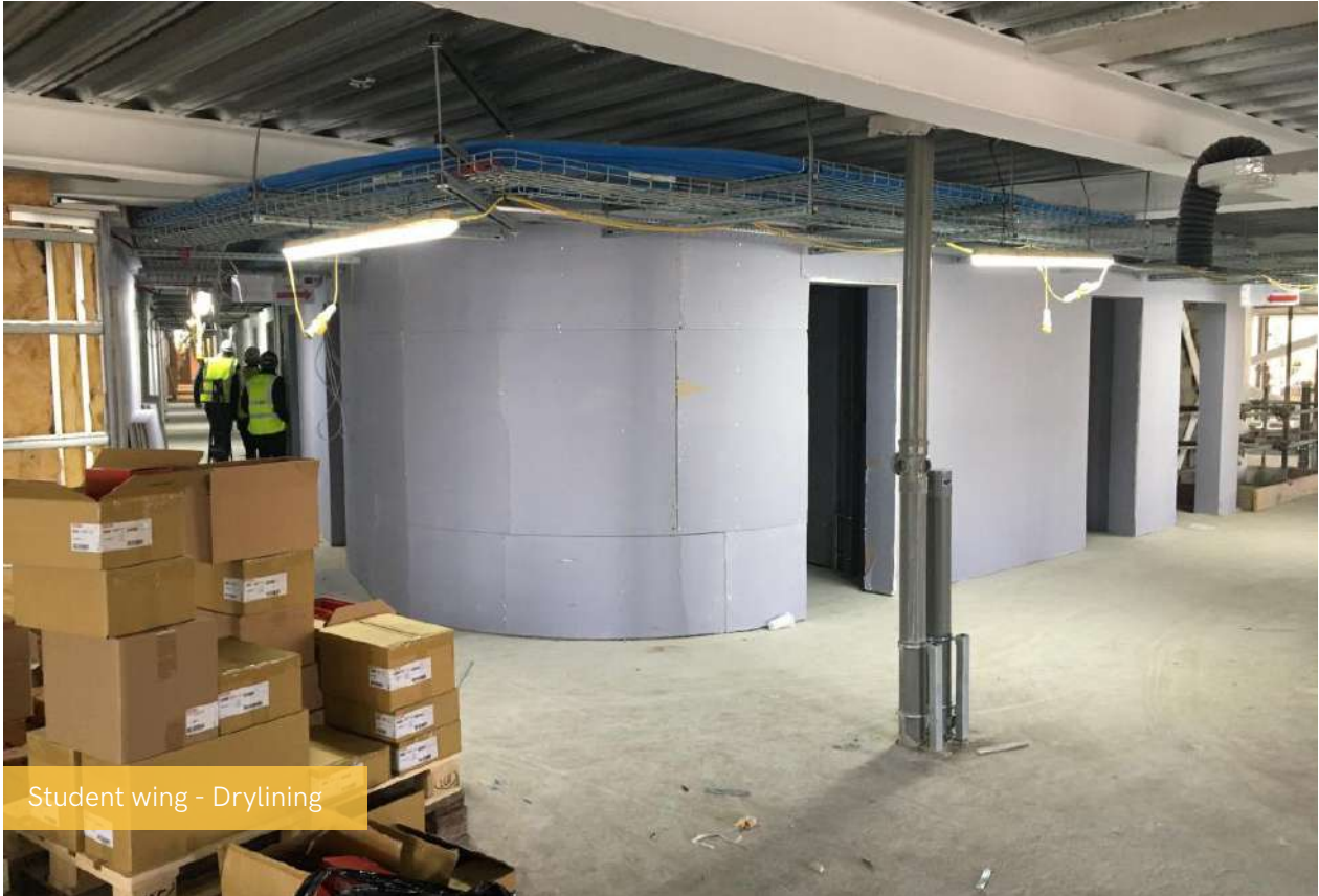
Student wing - Drylining