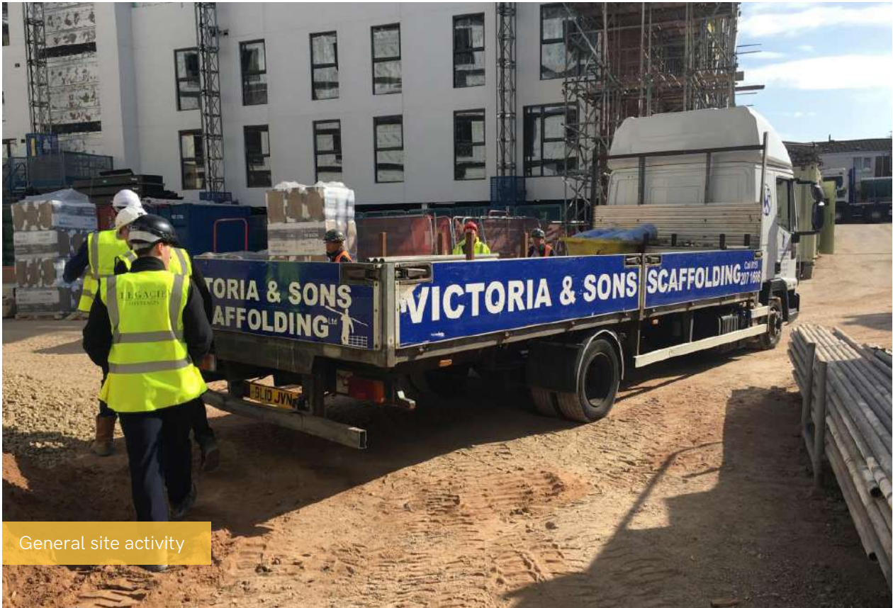
General site activity