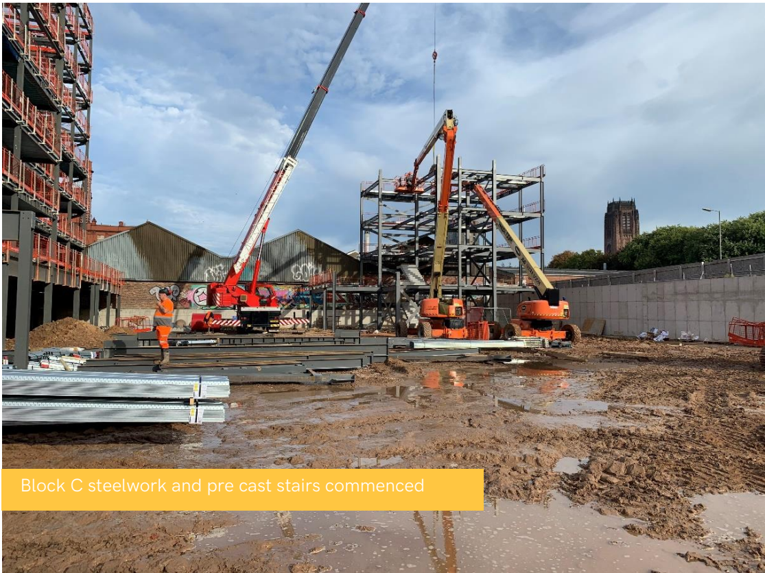
Block C steelwork and pre cast stairs commenced