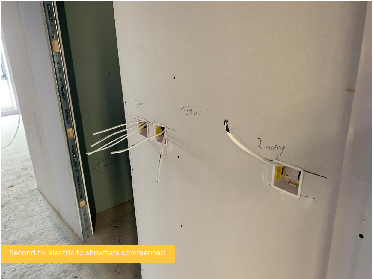
Second fix electric to showflats commenced