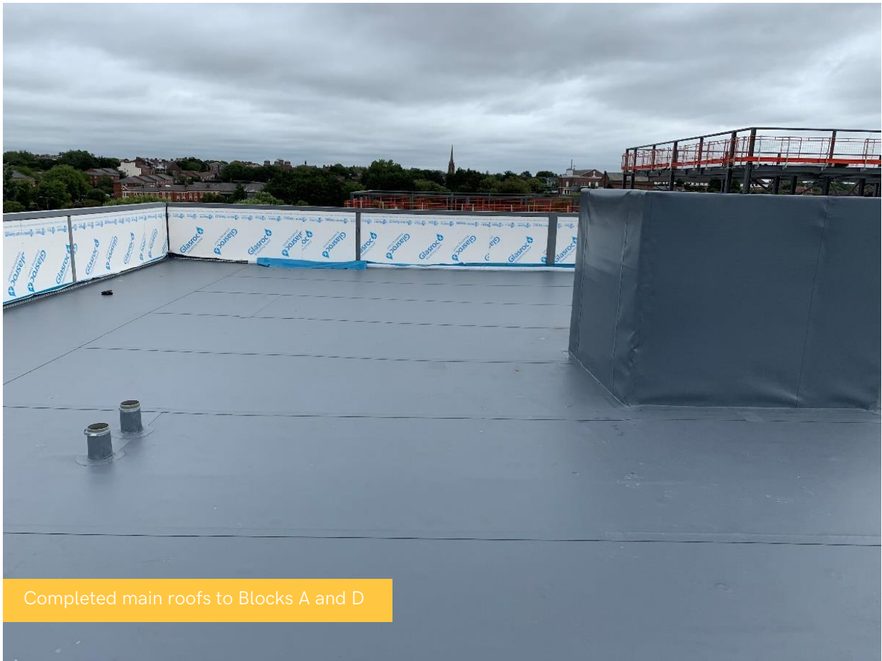
Completed main roofs to Blocks A and D