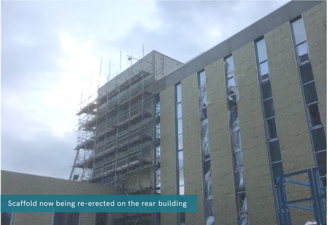
Scaffold now being re-erected on the rear building