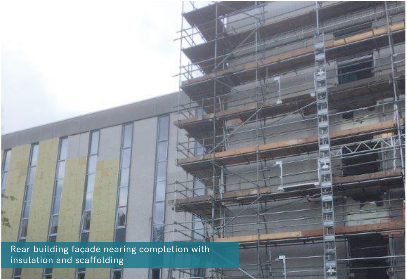
Rear building façade nearing completion with insulation and scaffolding