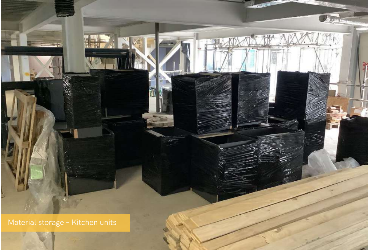
Material storage - Kitchen units