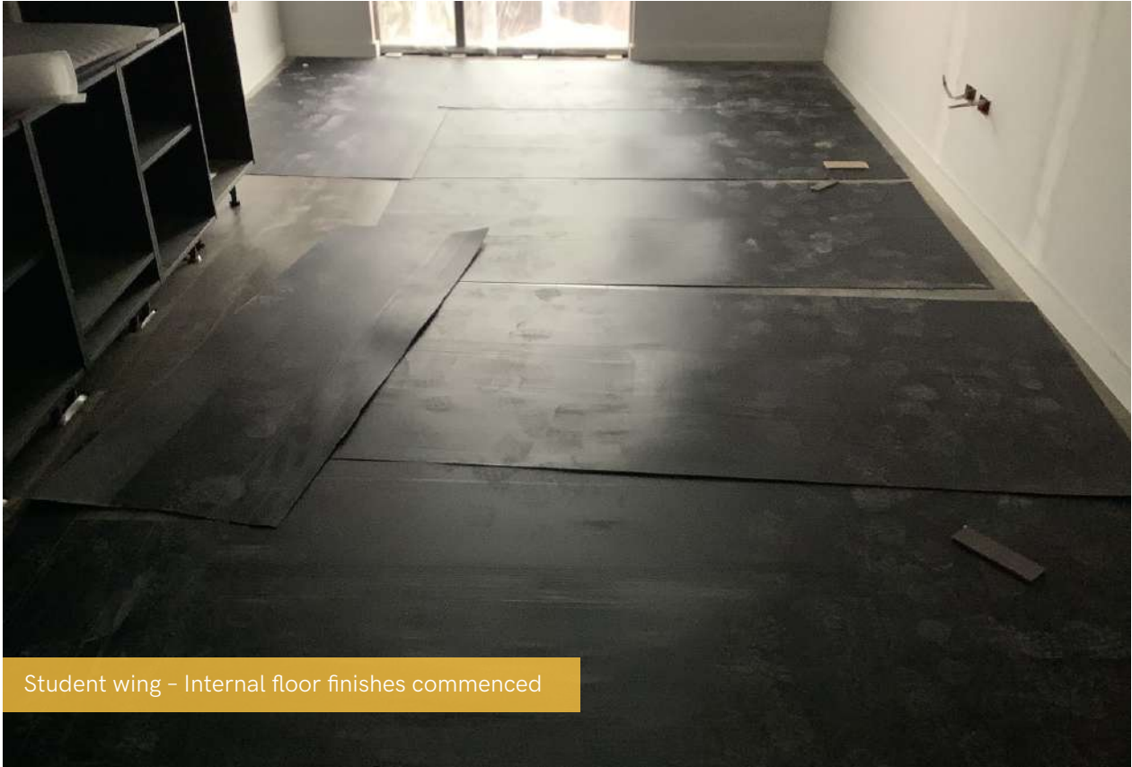
Student wing - Internal floor finishes commenced