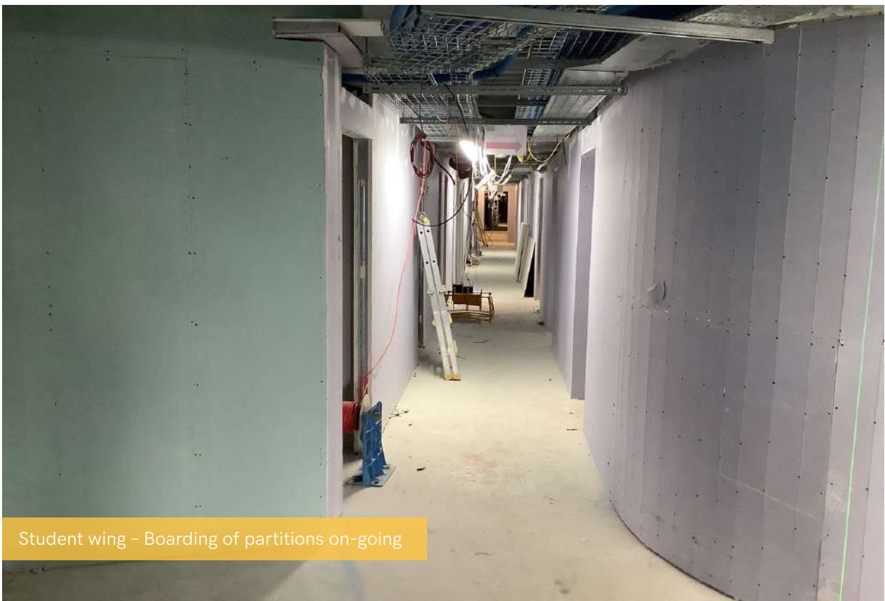
Student wing - Boarding of partitions on-going