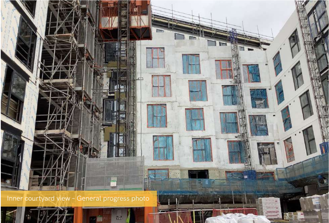
Inner courtyard view - General progress photo