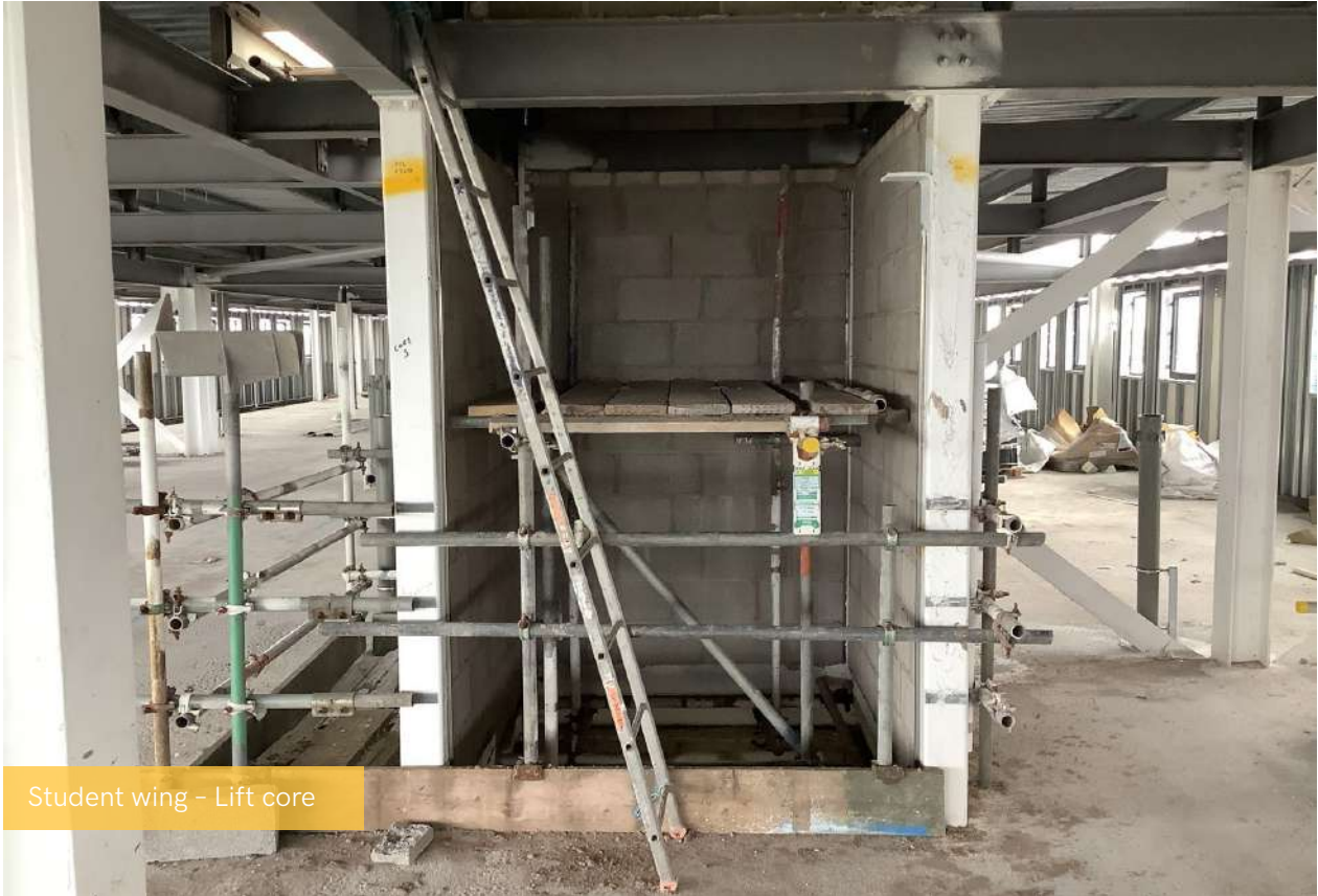
Student wing - Lift core