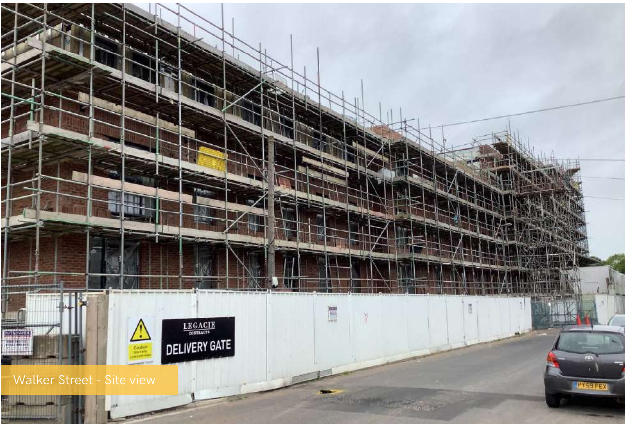
Walker Street - Site view