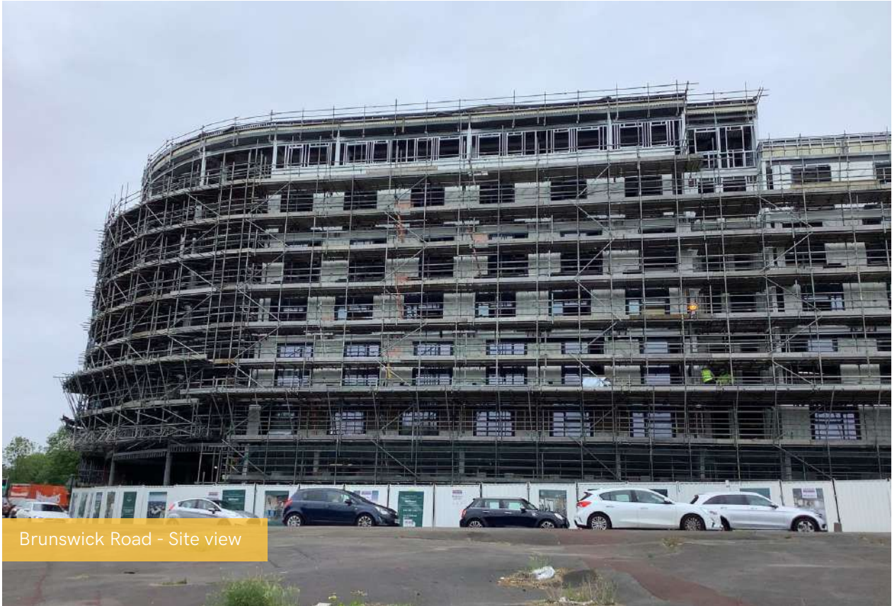
Brunswick Road - Site view