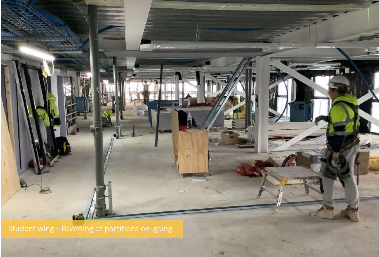
Student wing - Boarding of partitions on-going