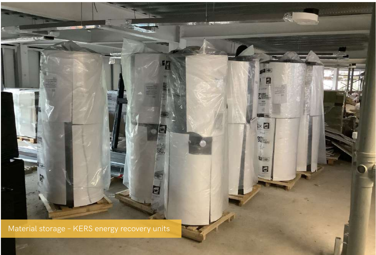
Material storage - KERS energy recovery units