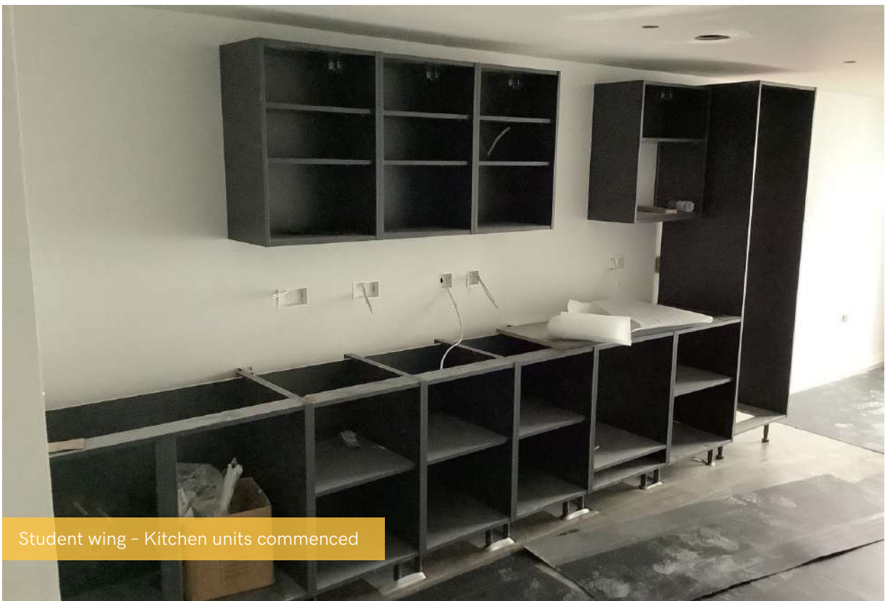
Student wing - Kitchen units commenced