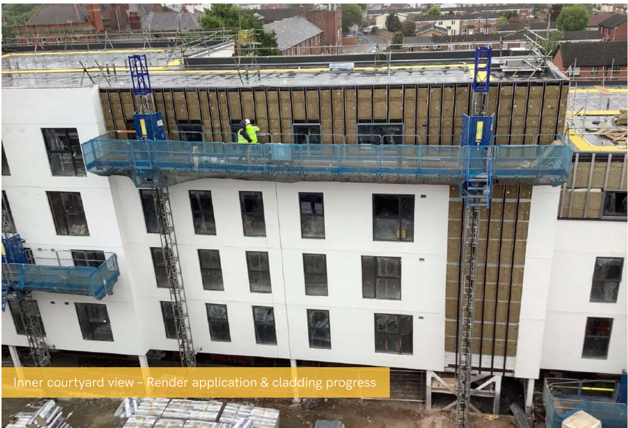
Inner courtyard view - Render application & cladding progress