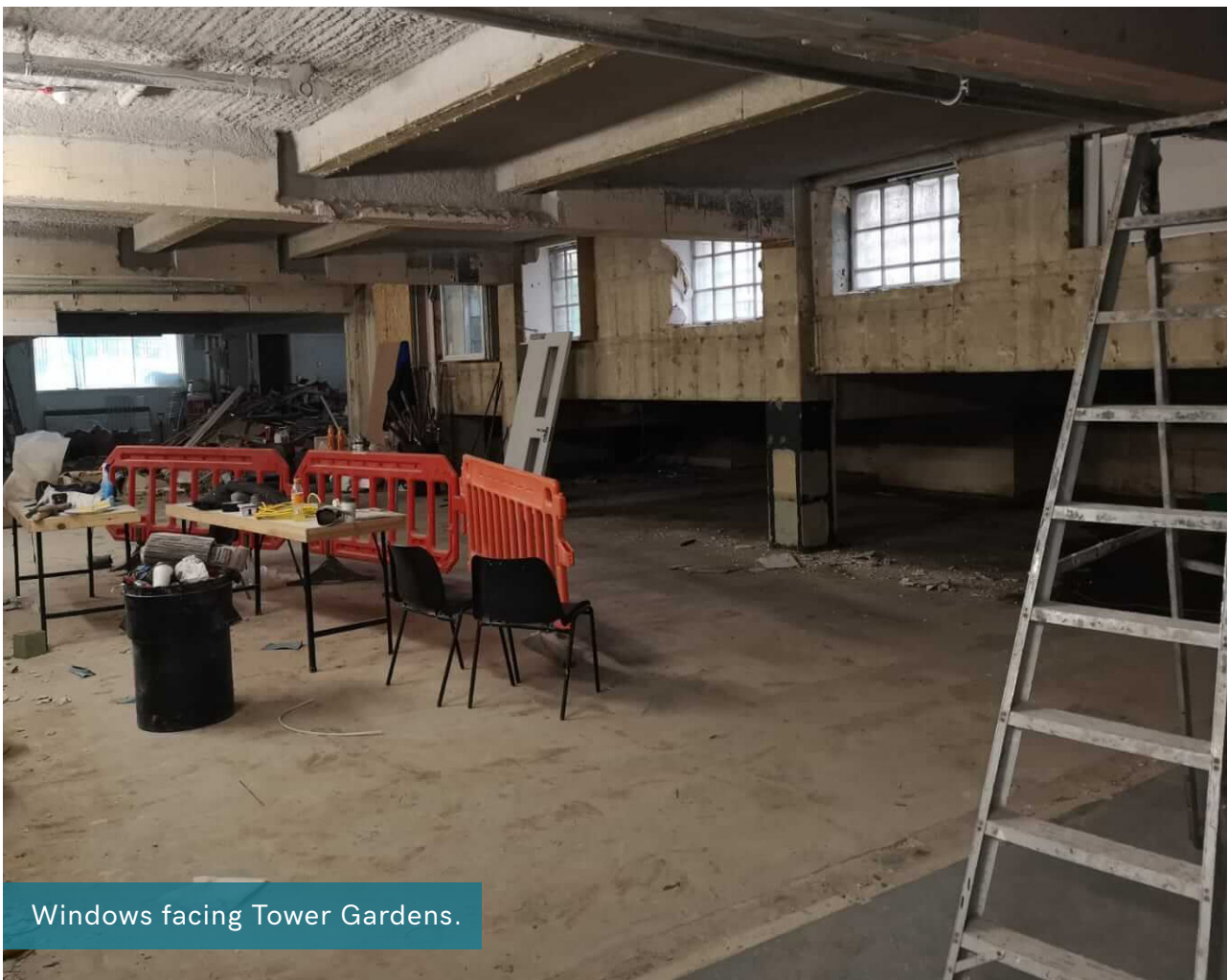
Windows facing Tower Gardens.

External work scheduled to commence in the next few days includes the dig out of a large area of slab.