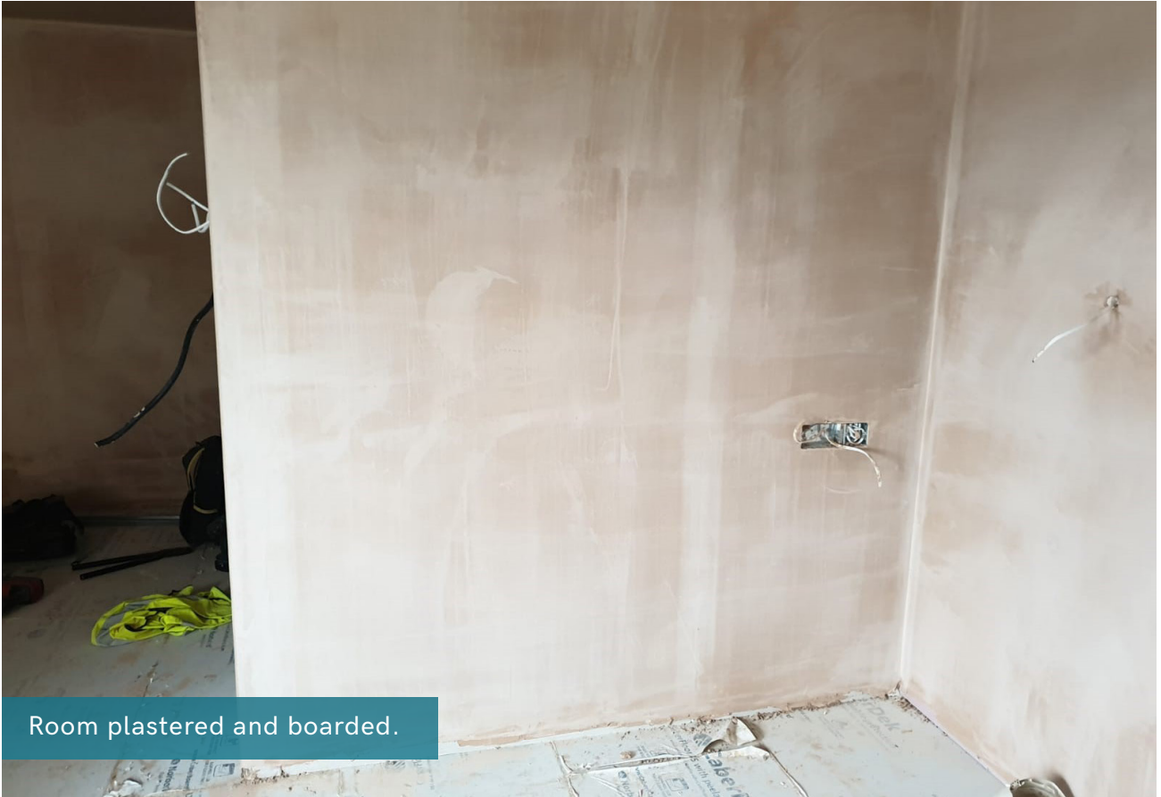
Room plastered and boarded.