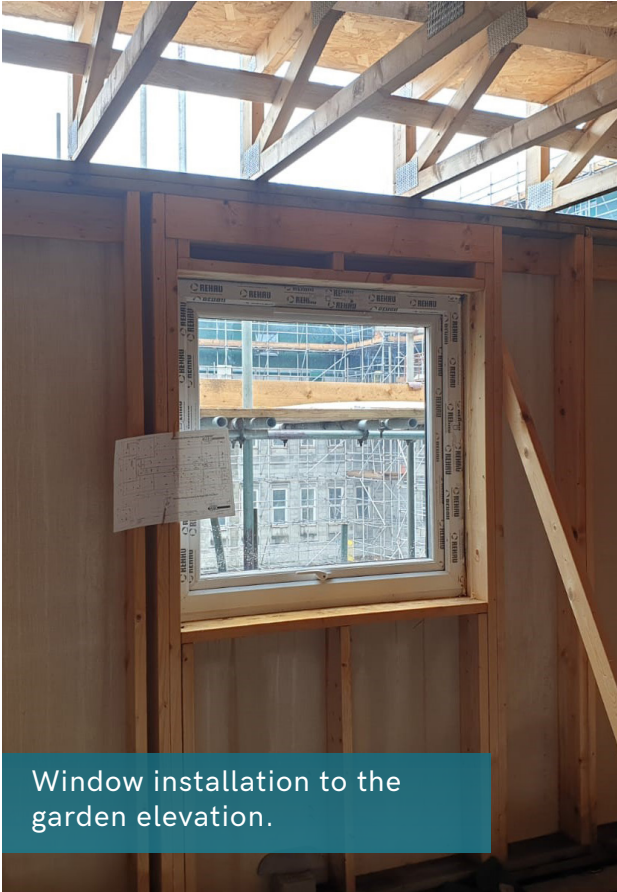
Window installation to the garden elevation.