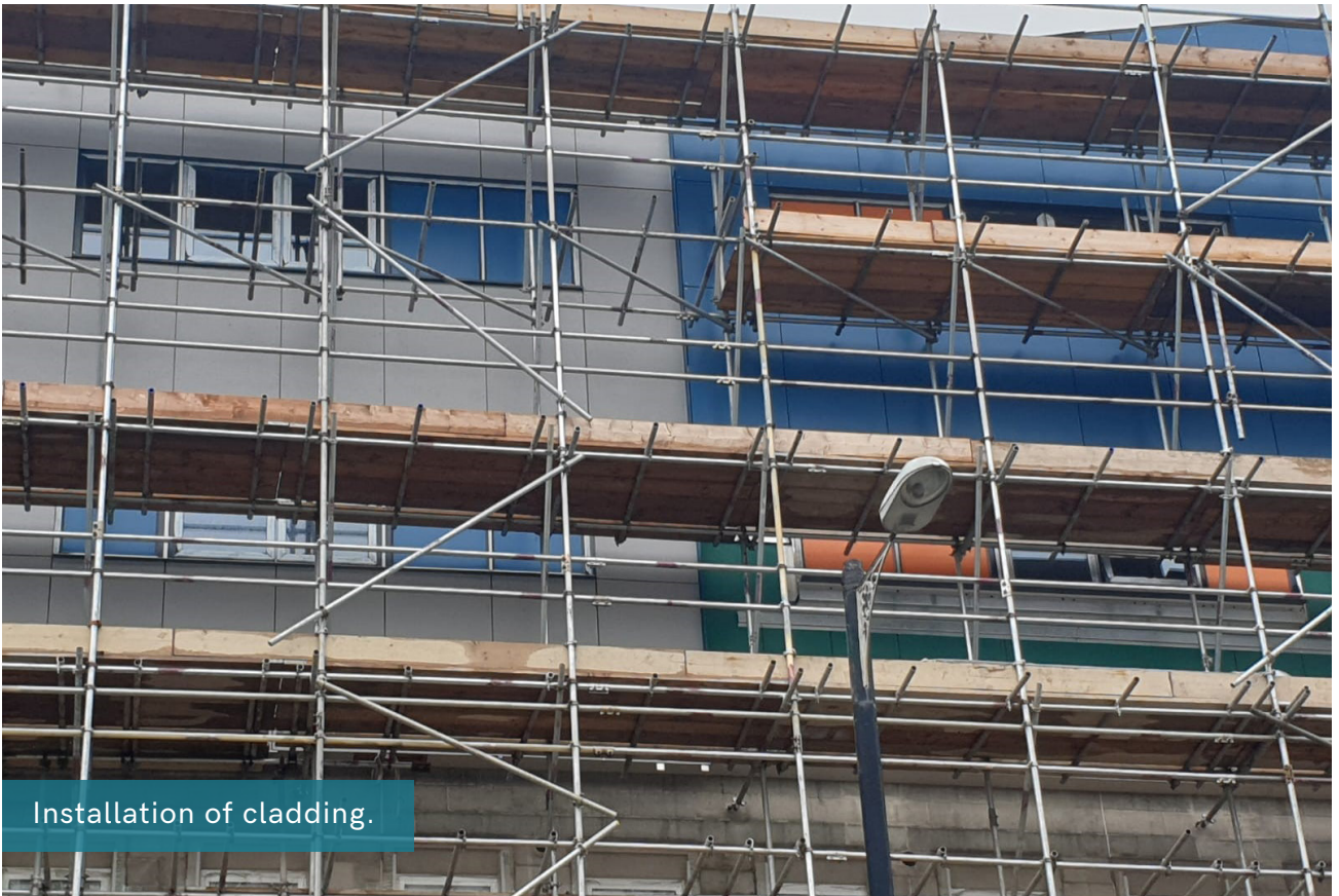
Installation of cladding.