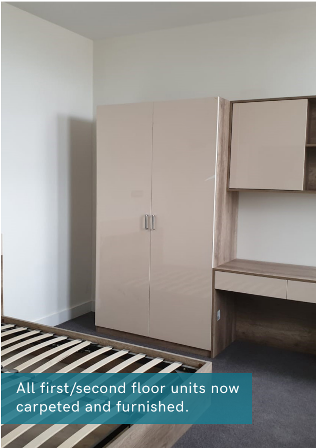
All first/second floor units now carpeted and furnished.