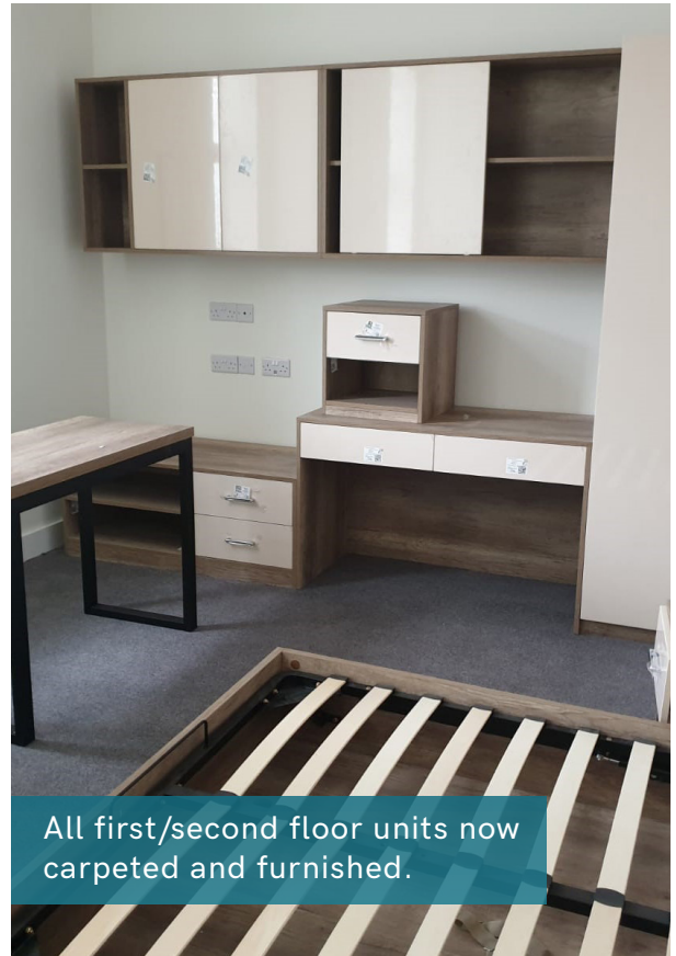
All first/second floor units now carpeted and furnished.